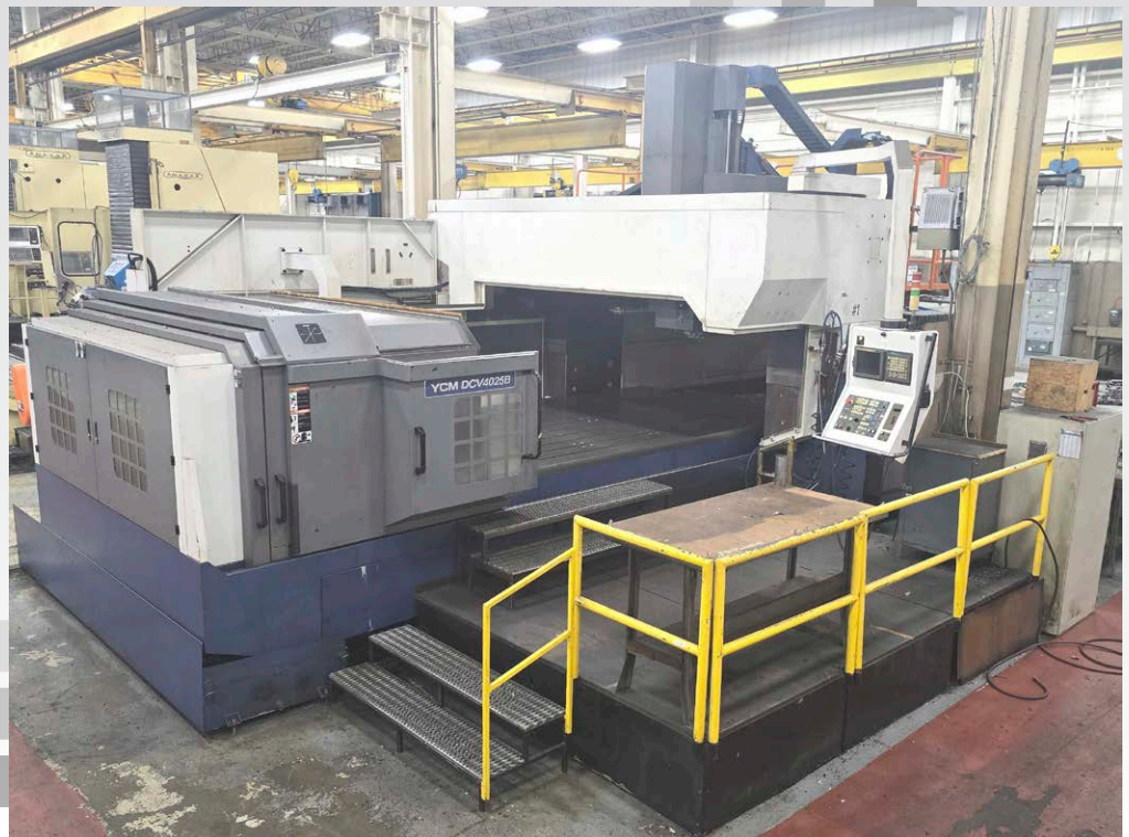
YCM Industries DCV4025B Bridge Type Vertical Machining Center

2008 YCM Industries DCV4025B Bridge Type Vertical Machining Center