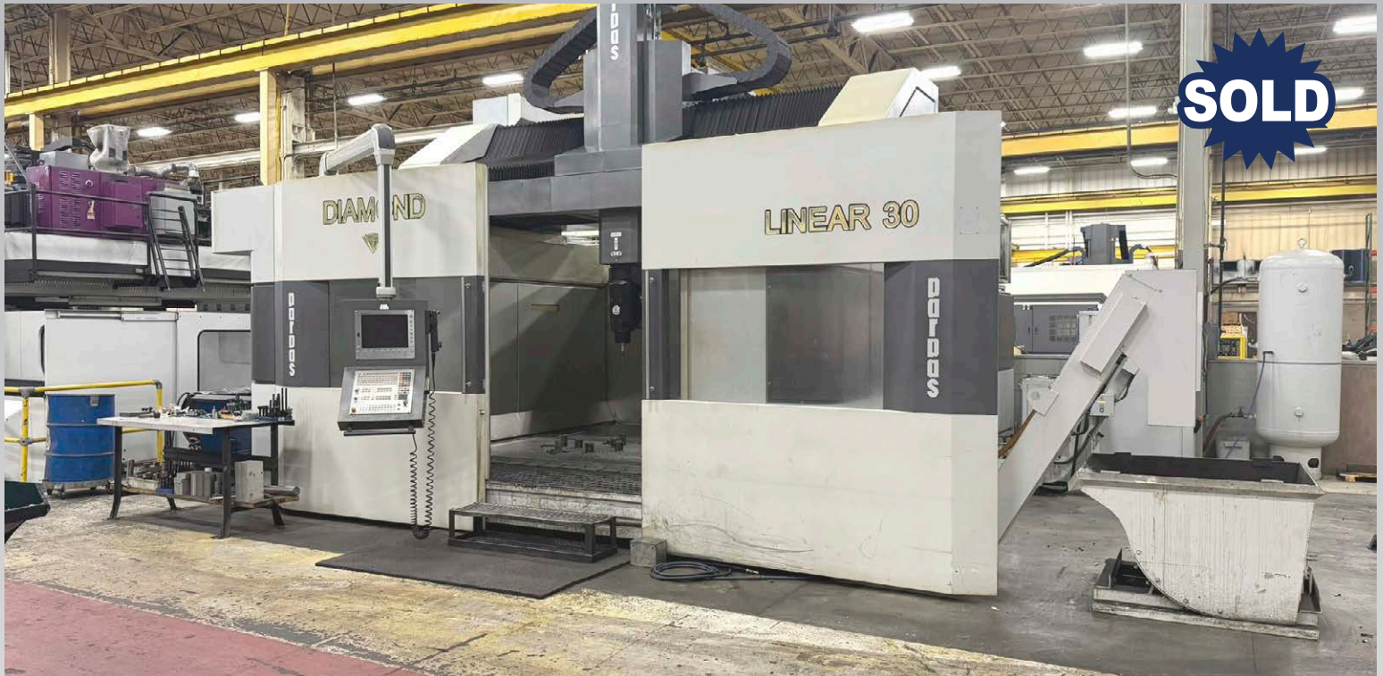
Parpas Diamond 30 Linear CNC Gantry Mill