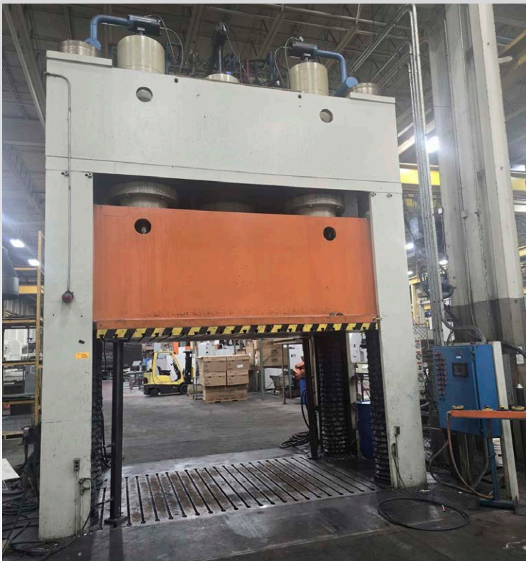
2000 HPT 2500 Ton Hydraulic Tryout Press

2007 Agie Charmilles Agietron Spirit 3 C-Axis CNC Sinker EDM, 19.75" x 27.5" T-Slotted Table, Drop Tank, 12.7" x 15.7" x 13.8" XYZ Travels, 10-Position Electrode Holder, GF Touch Screen Control, Erowa System