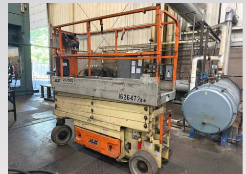
JLG 2630ES Scissors Lift