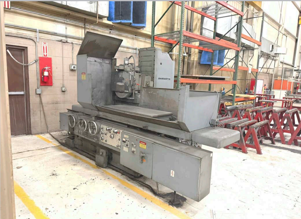
Okamoto PSG-125 Hydraulic Surface Grinder

Large Quantity of Tool Holders, Angle Plates, Tool Room, Welders, Inspection, Hand Tools, Power Tools, Benches, Transformers, Floor Scrubbers, Forklifts, Air Compressors, and much more