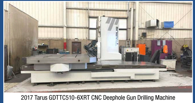
2017 Tarus GDTC510-6XRT CNC Deephole Gun Drilling Machine