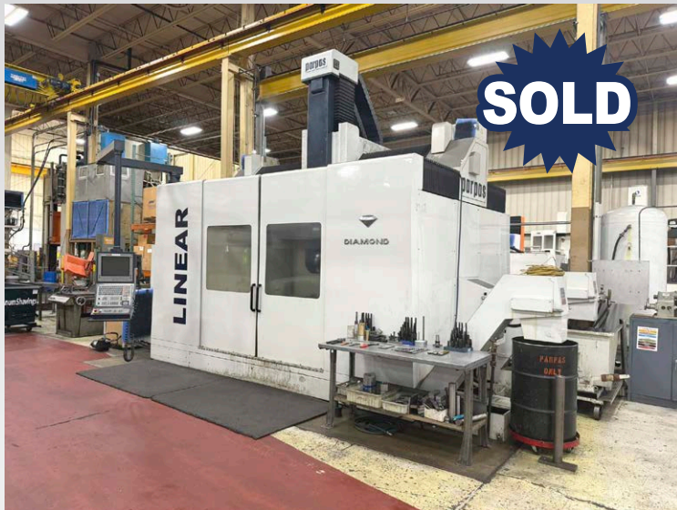
Parpas Diamond 30 Linear CNC Gantry Mill