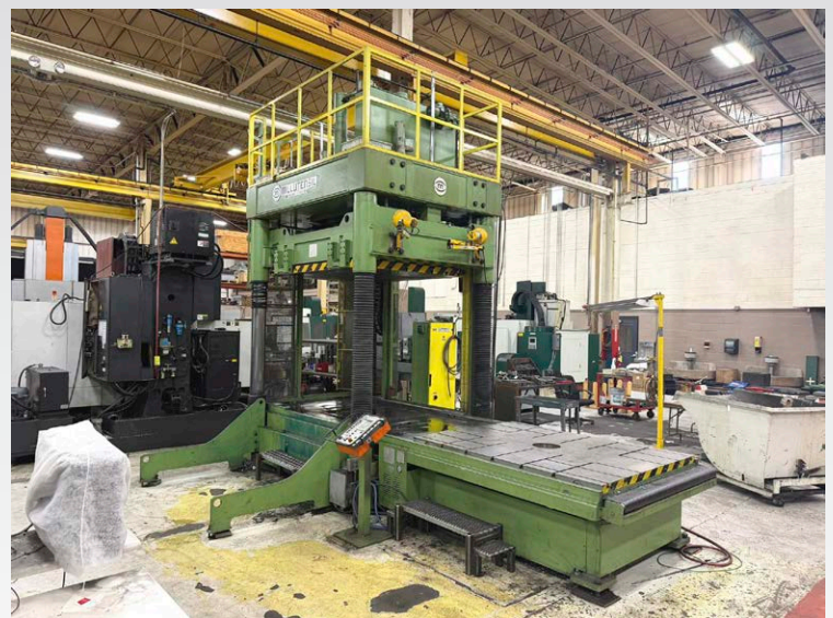
Millutensil MIL203 Hydraulic Spotting Press