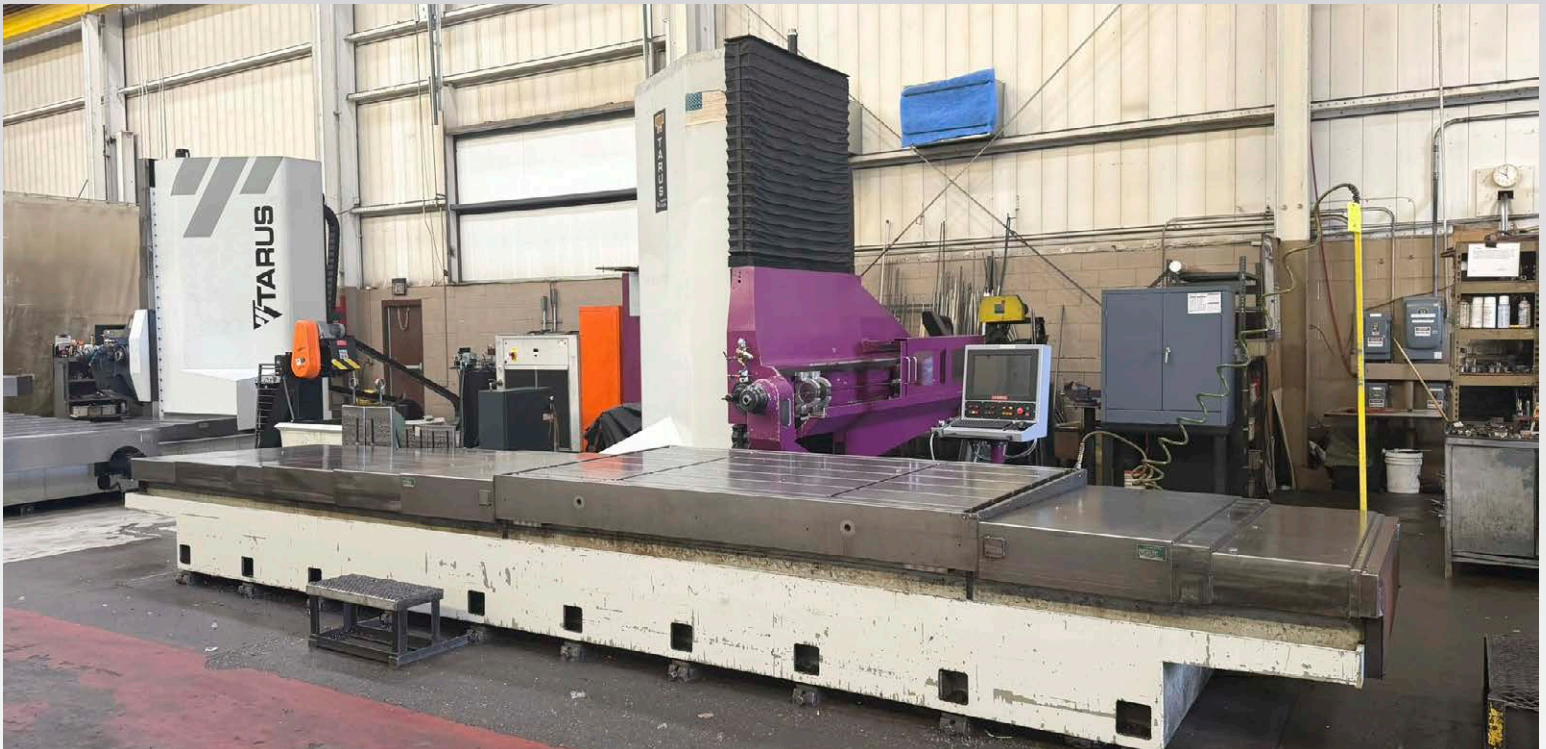
Tarus CNC Gun Drill