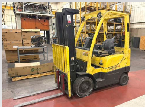
Hyster S-50FT Forklift