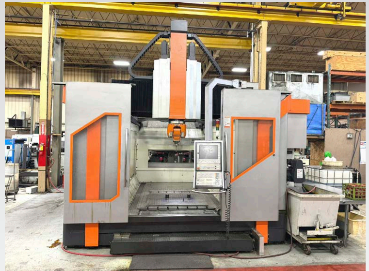
2015 Linmax RG5-1625 Overhead Gantry Milling Machine