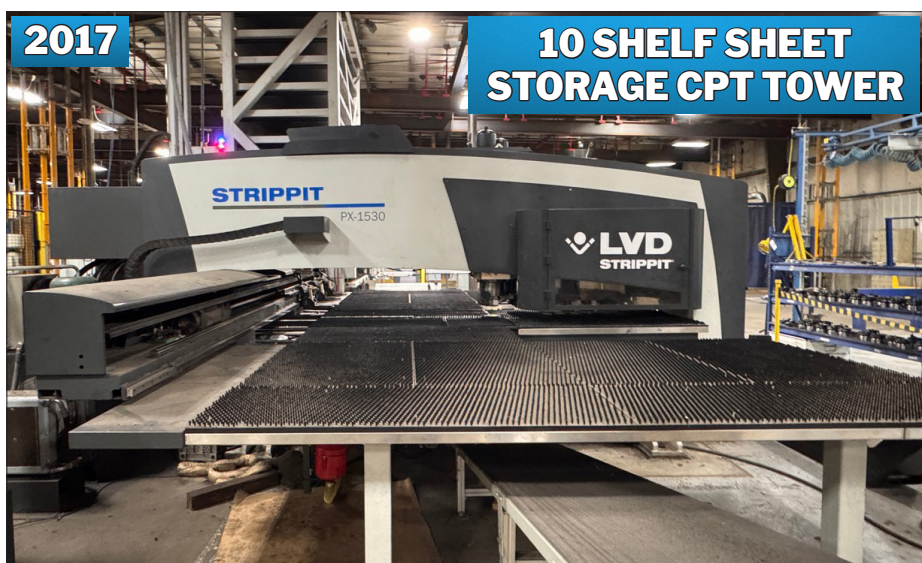
2017 10 SHELF SHEET STORAGE CPT TOWER LVD STRIPPIT PX-1530 FMS PUNCHING CELL VIEW LOT #141