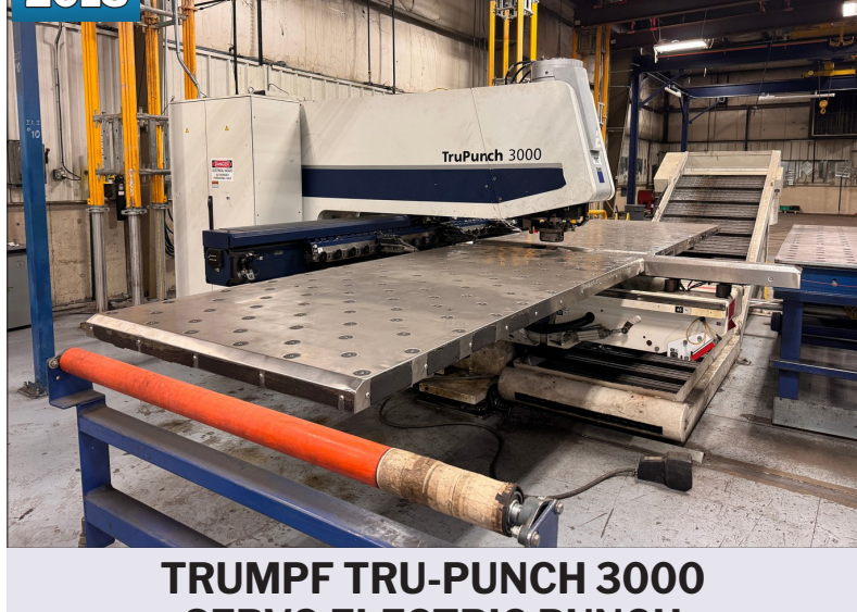
2013 TRUMPF TRU-PUNCH 3000 SERVO ELECTRIC PUNCH VIEW LOT #138