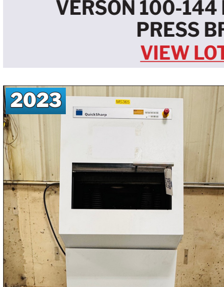
2023 TRUMPF QUICK SHARP TOOL SHARPENER VIEW LOT #67