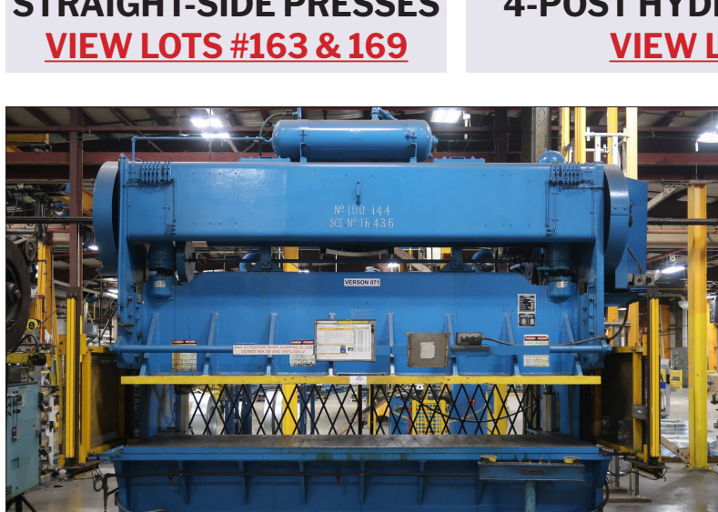
VERSON 100-144 MECHANICAL PRESS BRAKE VIEW LOT #67