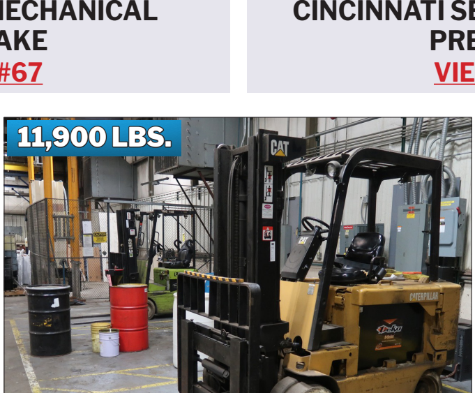
11,900 LBS. CATERPILLAR M120D 36V ELECTRIC FORK LIFT VIEW LOT #335