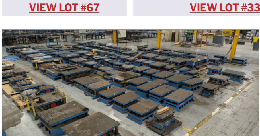
HUGE QUANTITY OF PRESS DIES – OVER (160) PRESS DIES TOTAL, TOTAL WEIGHT OF APPROXIMATELY 300,000 LBS.