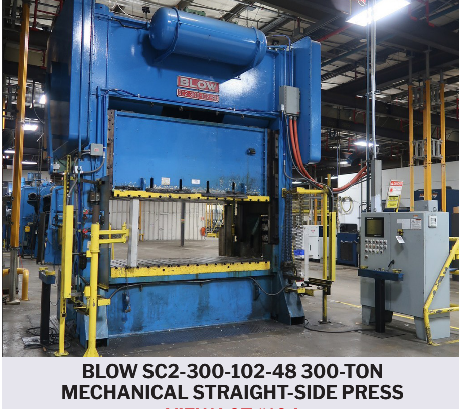
BLOW SC2-300-102-48 300-TON MECHANICAL STRAIGHT-SIDE PRESS VIEW LOT #184