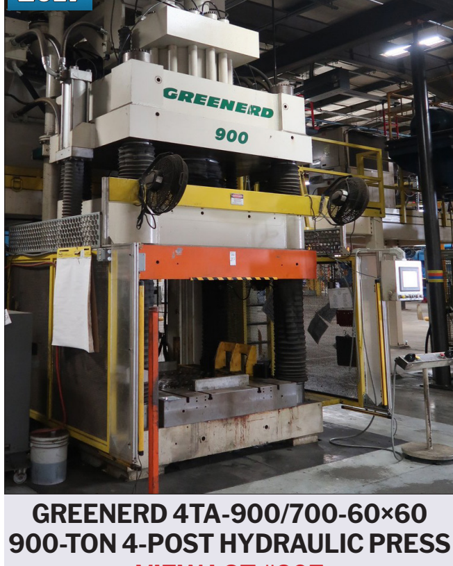
2017 GREENERD 4TA-900/700-60x60 900-TON 4-POST HYDRAULIC PRESS VIEW LOT #207