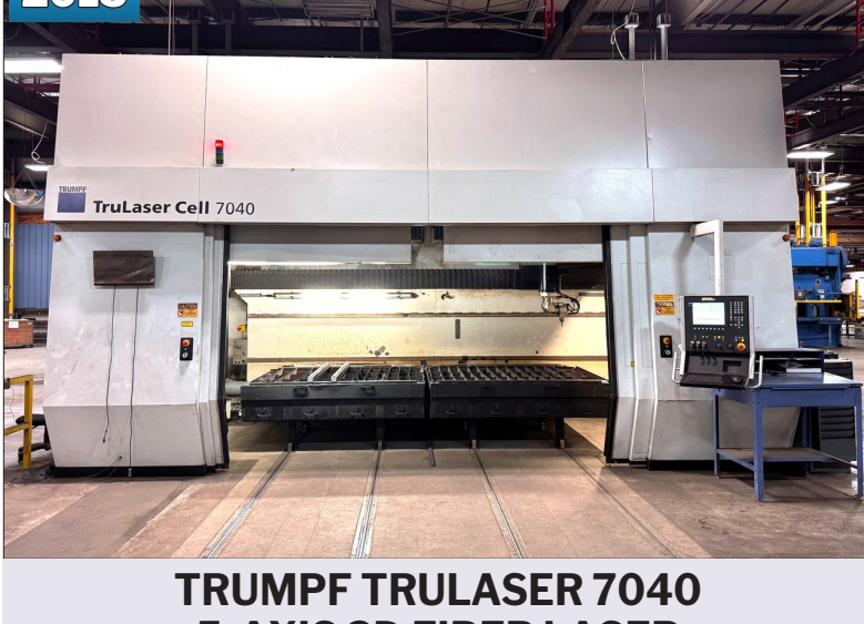
2015 TRUMPF TRULASER 7040 5-AXIS 3D FIBER LASER VIEW LOT #133