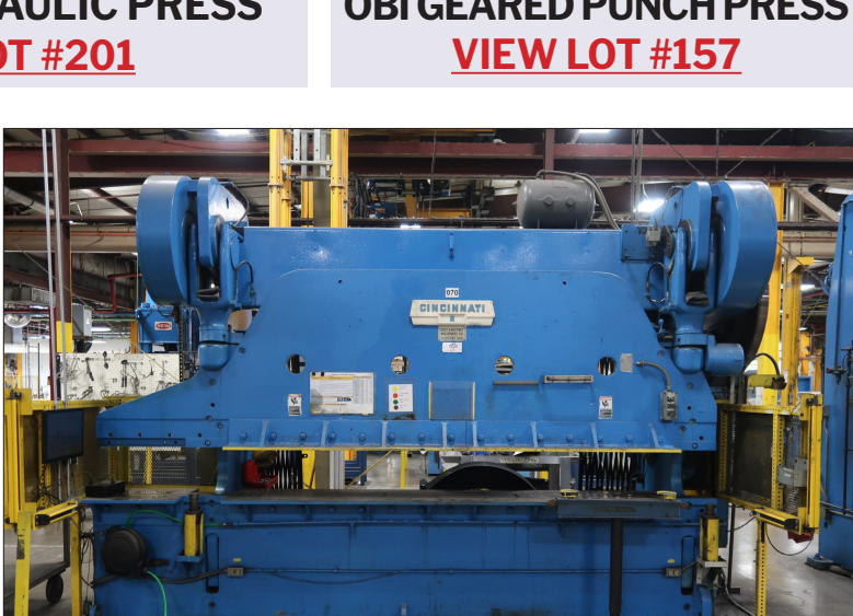
CINCINNATI SERIES 9 MECHANICAL PRESS BRAKE VIEW LOT #68