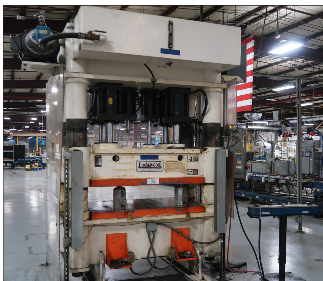
BECKWOOD 250-TON 4-POST HYDRAULIC PRESS VIEW LOT #196