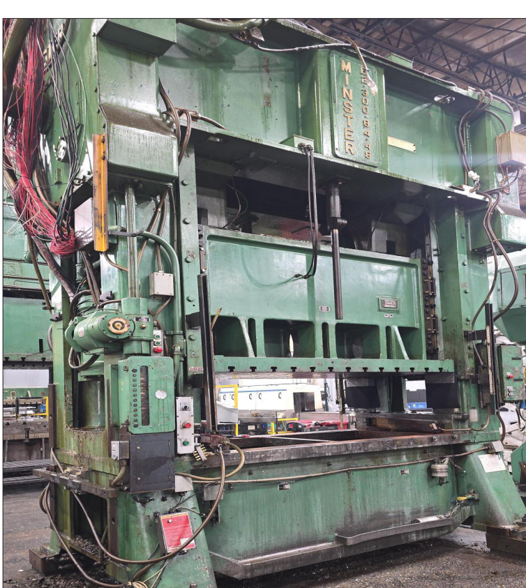
300 MINSTER S2-300 STRAIGHT SIDE PRESS