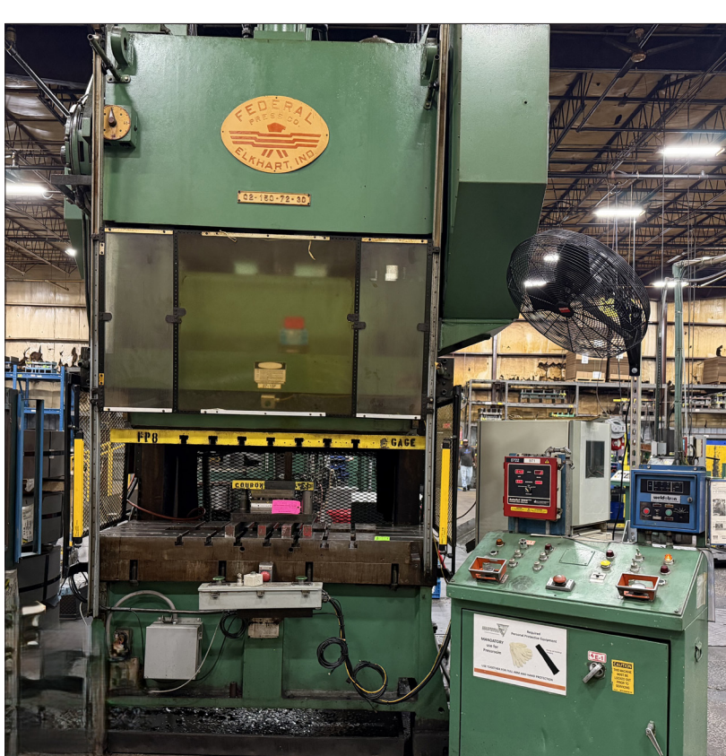
150 TON FEDERAL C2 GAP FRAME PRESS