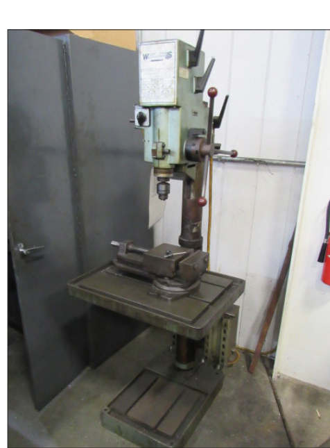
WILTON 20" GEAR HEAD DRILL PRESS