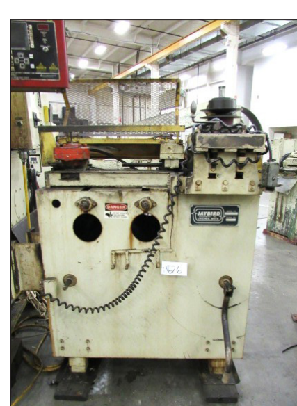
PRESS FEED LINES, FEED LEASE UNCOILERS, COIL CRADLES, JAY BIRD FEEDERS AND STRAIGHTENER