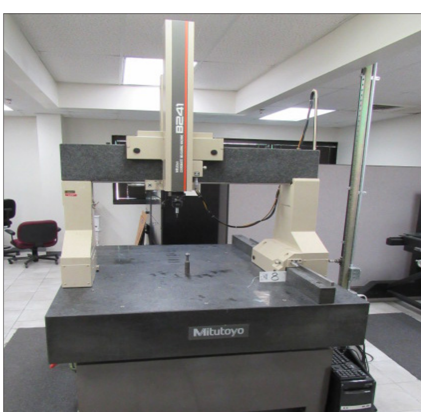
MITUTOYO B-241 BRIDGE TYPE COORDINATE MEASURING MACHINE