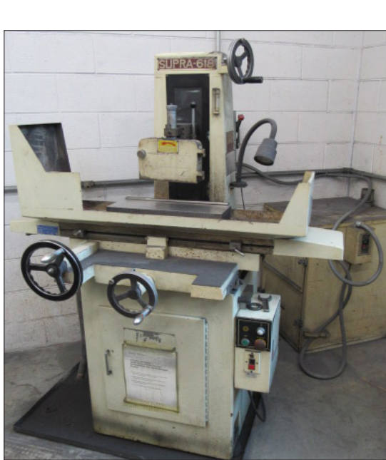
ACER SUPRA 618 HAND FEED SURFACE GRINDER