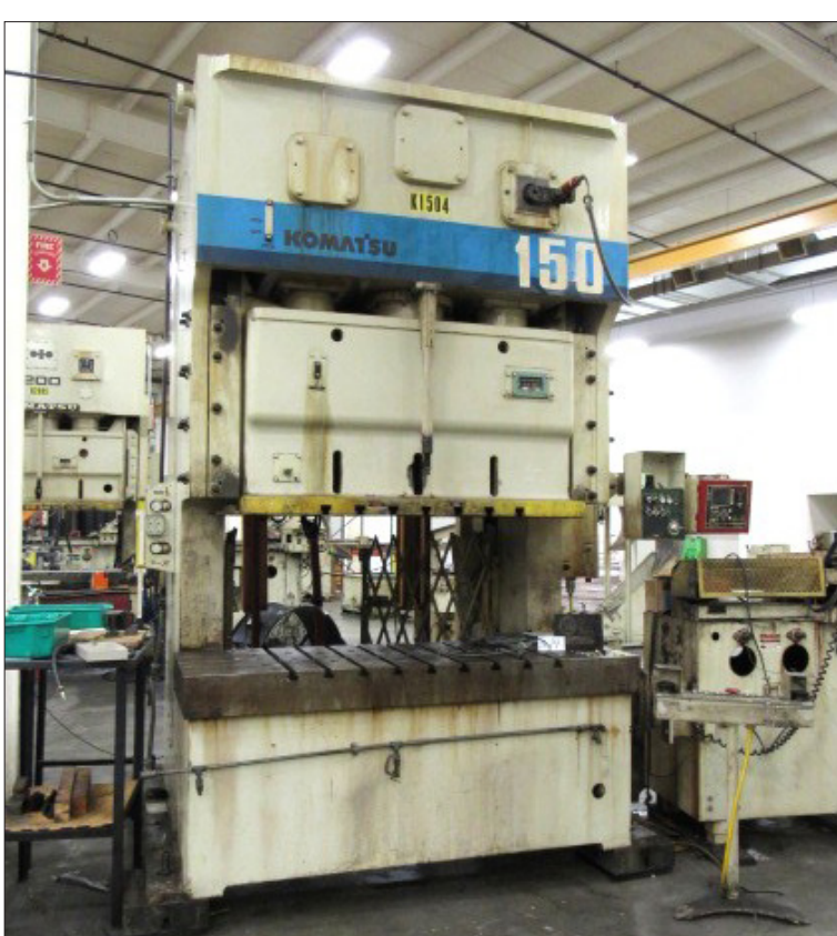
165 TON KOMATSU OBW-150-3 GAP FRAME PRESS