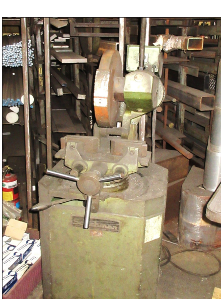
SCOTCHMAN 350LT COLD SAW