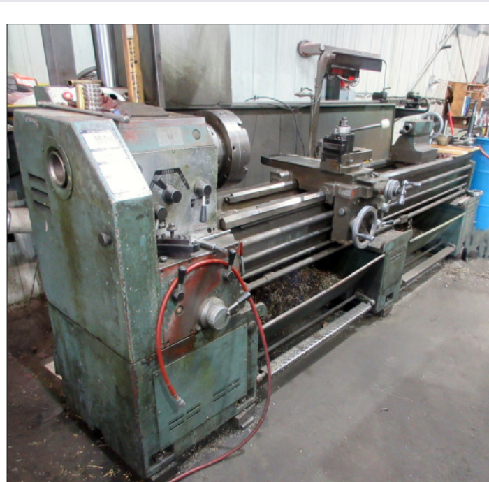
20" X 100" FORTUNE 20/100 LATHE