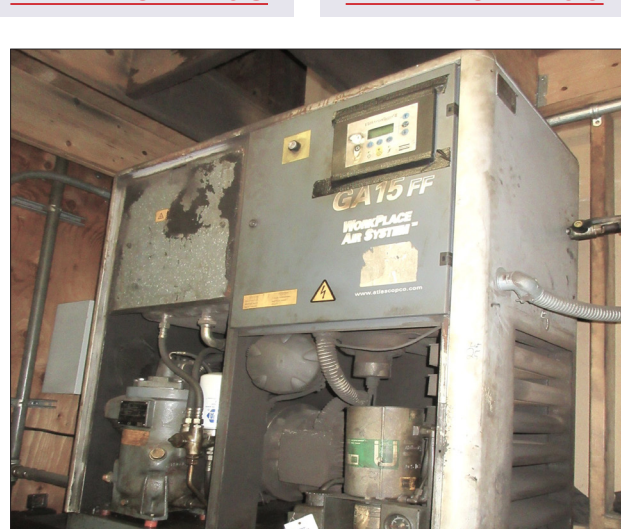
ATLAS COPCO GA15F ROTARY SCREW-TYPE AIR COMPRESSOR