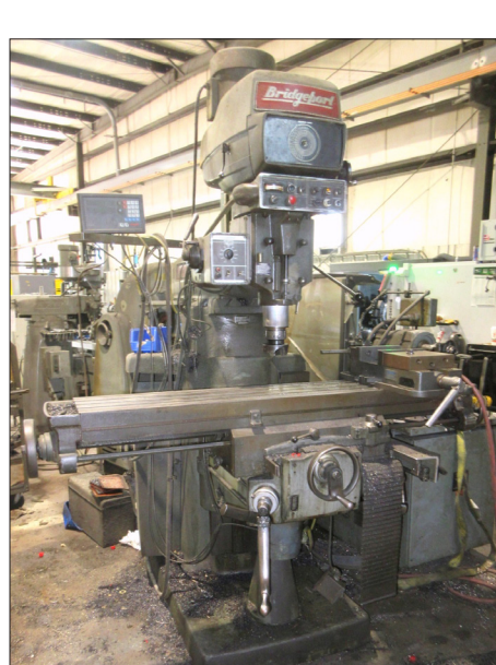
BRIDGEPORT SERIES II VERTICAL KNEE TYPE MILL