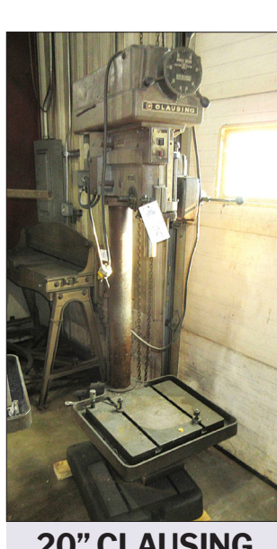
20" CLAUSING 2774 VARI-SPEED FLOOR TYPE DRILL PRESS