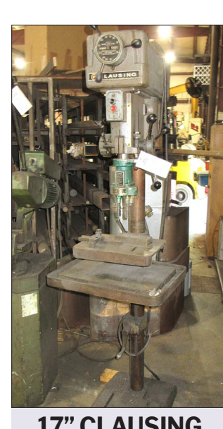
17" CLAUSING 1768 VARI-SPEED FLOOR TYPE DRILL PRESS