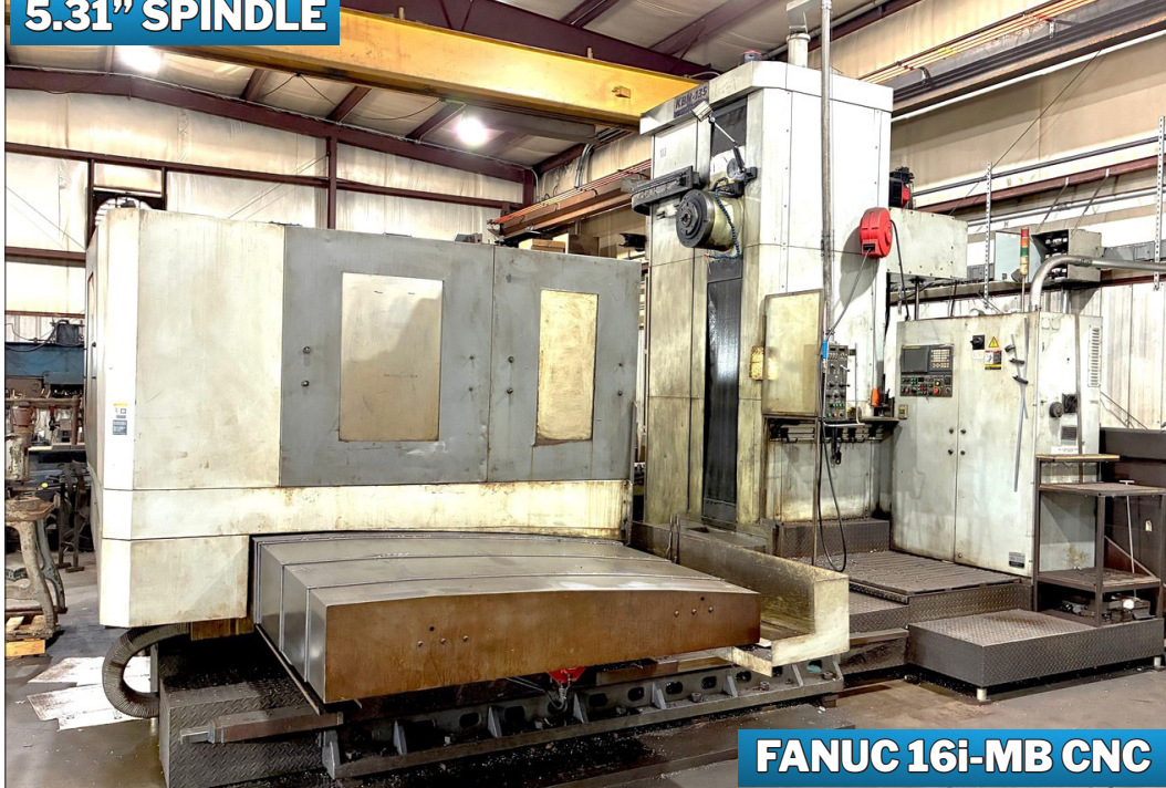
HYUNDAI-KIA KBN-135 TABLE TYPE CNC HORIZONTAL BORING MILL