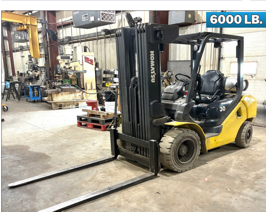
KOMATSU FG30HT-16 PROPANE / GAS FORKLIFT TRUCK