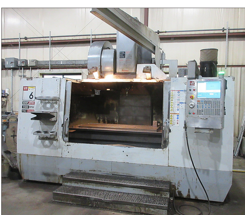
HAAS VF-6/50 CNC VERTICAL MACHINING CENTER