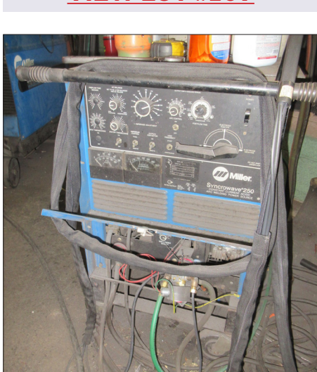
MILLER SYNCROWAVE 250 CONSTANT CURRENT AC/DC WELDER