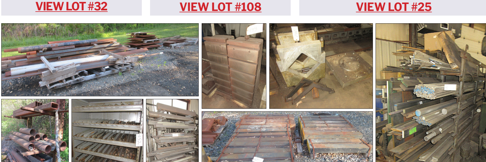
LARGE QUANTITY OF MATERIAL - ASSORTED MANGANESE PLATES, ALUMINUM, CUT PLATES, I-BEAMS, RACKS, ETC.