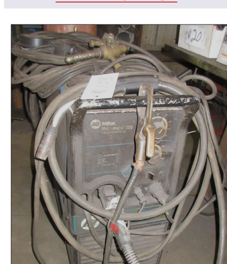
MILLER "MILLERMATIC 300" 3-PHASE WELDER