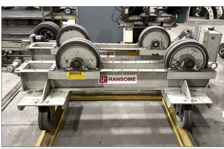
RANSOME TANK TURNING ROLLS VIEW LOT #15