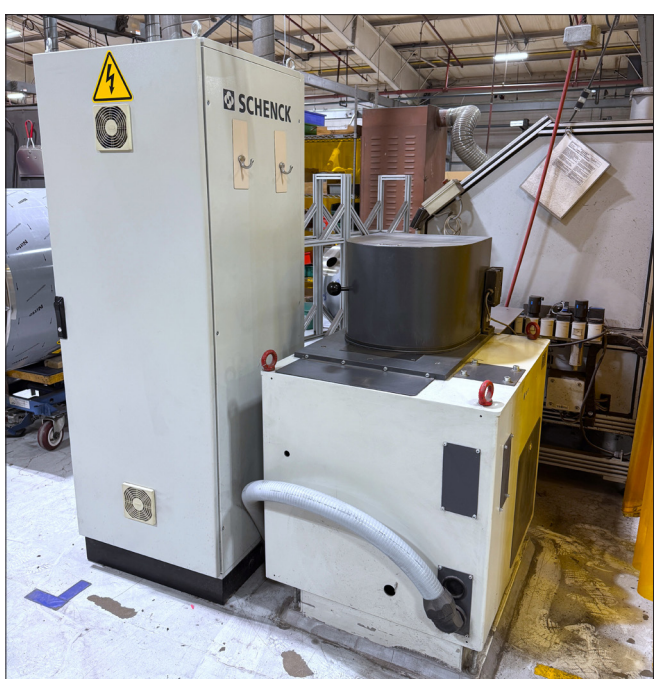
SCHENCK HBAC/CAB706 VERTICAL BALANCER VIEW LOT #13