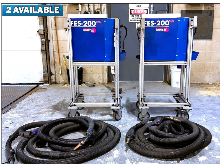
ABCOR BINZEL FES-200 W3 FUME EXTRACTION SYSTEMS VIEW LOT #14