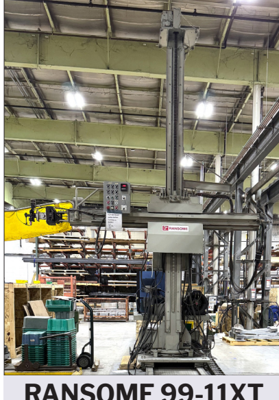
RANSOME 99-11XT WELDING MANIPULATOR VIEW VIDEO / LOT #5