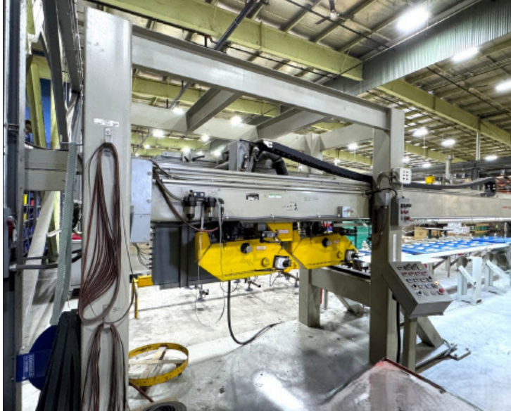
G & P MACHINERY S-6746-F 24' LONGITUDINAL SEAM WELD GRINDER VIEW VIDEO / LOT #6