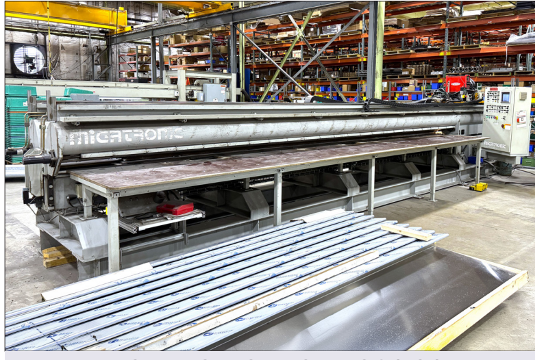
MIGATRONIC MIGA 5260 20' LONGITUDINAL SEAM WELDER VIEW VIDEO / LOT #4