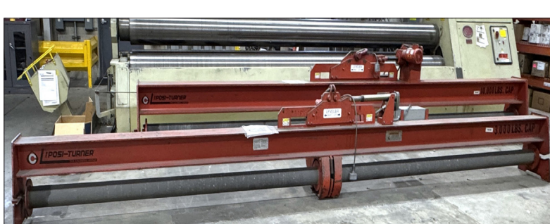
CALDWELL GROUP 318-250 POSI-TURNER LOAD ROTATOR & POSITIONERS VIEW LOTS #9 & 10