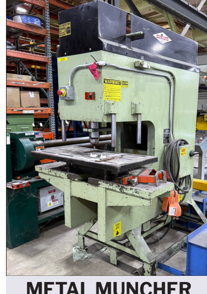
METAL MUNCHER MODEL GB-100-18 HYDRAULIC PUNCH VIEW LOT #8