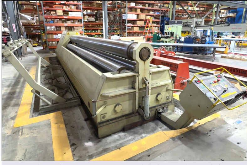
MG (EG HELLER) AK 608 5/16" X 20' HYDRAULIC 3-ROLL DOUBLE PINCH VIEW VIDEO / LOT #3