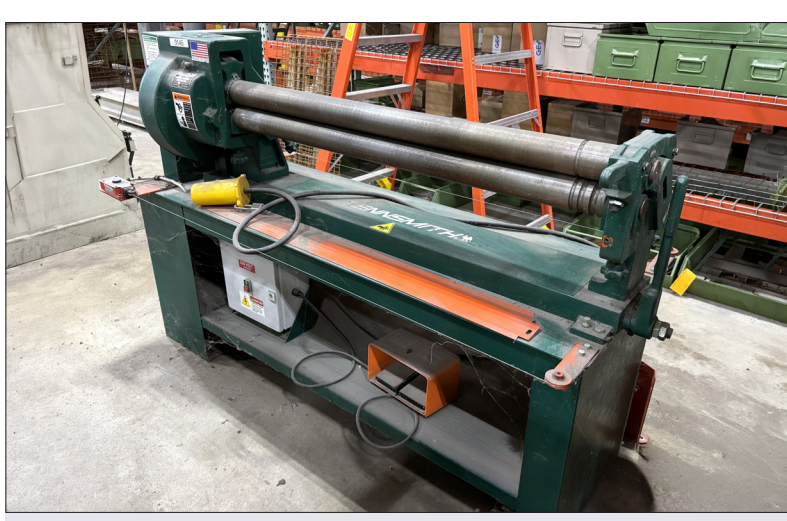
TENNSMITH S-R48P POWER SLIP ROLL VIEW LOT #7