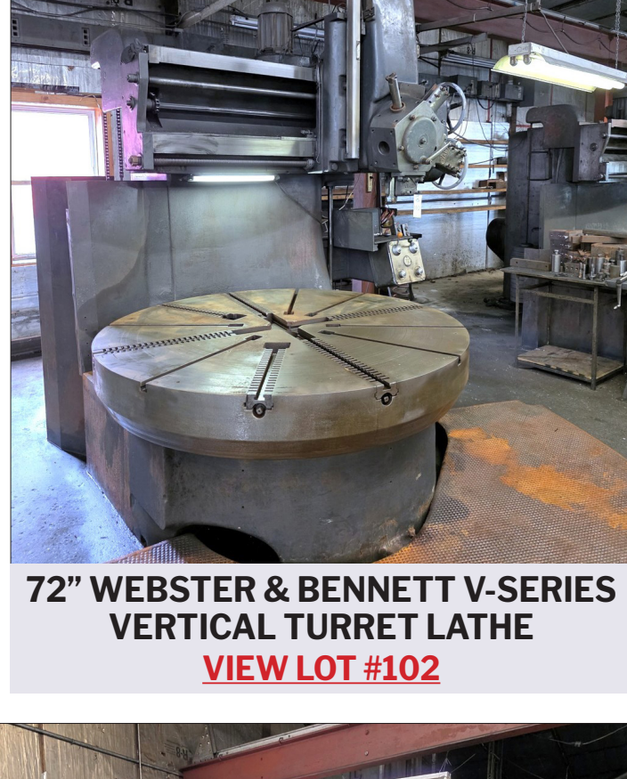
72" WEBSTER & BENNETT V-SERIES VERTICAL TURRET LATHE VIEW LOT #102