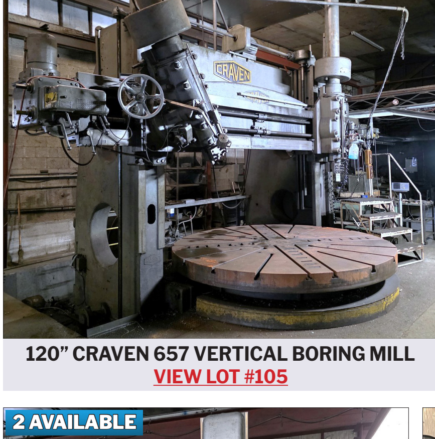
120" CRAVEN 657 VERTICAL BORING MILL VIEW LOT #105