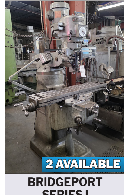
BRIDGEPORT SERIES I VERTICAL MILL VIEW LOTS #86 & 87