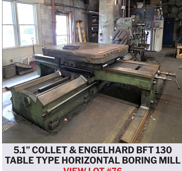
5.1" COLLET & ENGELHARD BFT 130 TABLE TYPE HORIZONTAL BORING MILL VIEW LOT #76