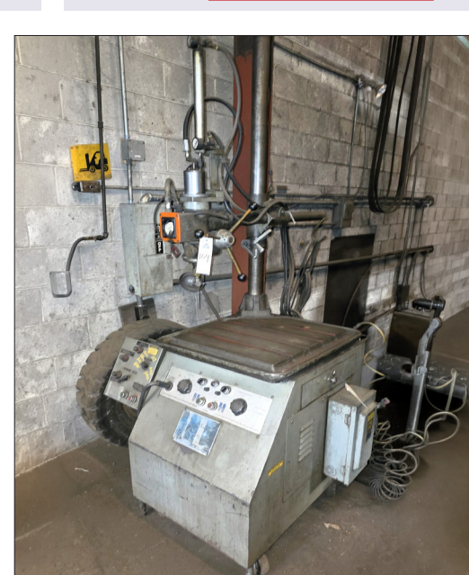
CAMMANN C-77A METAL TAP DISINTEGRATOR VIEW LOT #104