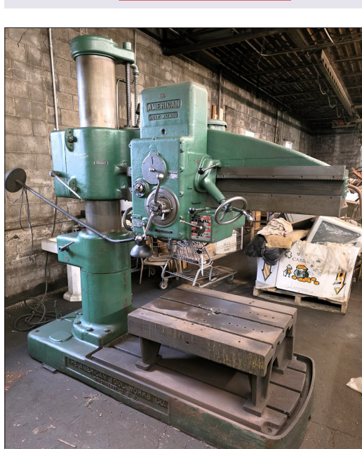
AMERICAN HOLE WIZARD RADIAL ARM DRILL VIEW LOT #111