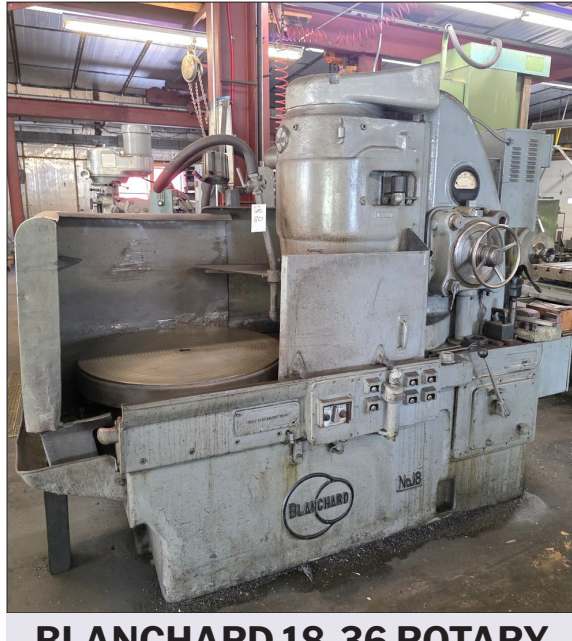
BLANCHARD 18-36 ROTARY SURFACE GRINDER VIEW LOT #80