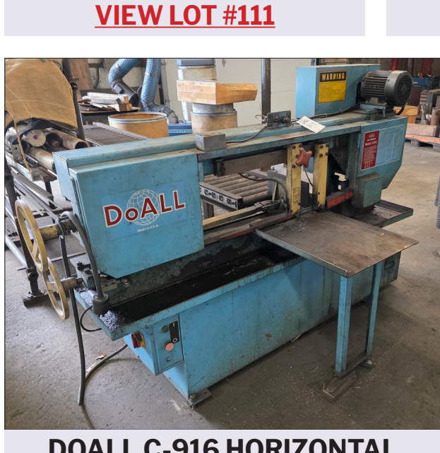
DOALL C-916 HORIZONTAL BANDSAW VIEW LOT #84