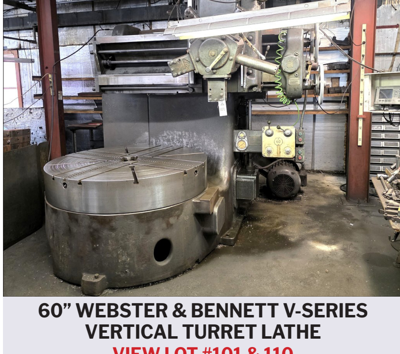
60" WEBSTER & BENNETT V-SERIES VERTICAL TURRET LATHE VIEW LOT #101 & 110