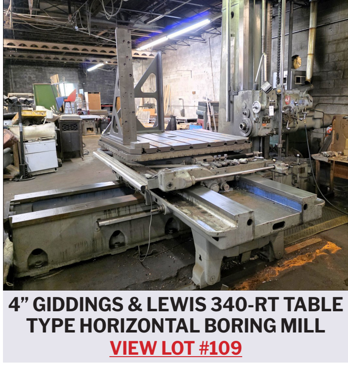
4" GIDDINGS & LEWIS 340-RT TABLE TYPE HORIZONTAL BORING MILL VIEW LOT #109