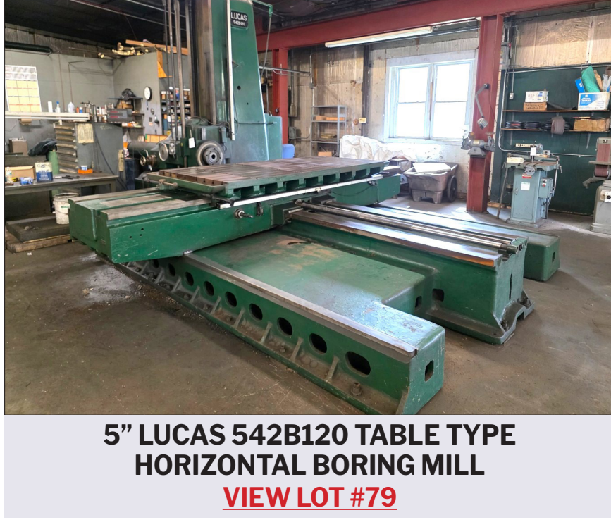
5" LUCAS 542B120 TABLE TYPE HORIZONTAL BORING MILL VIEW LOT #79