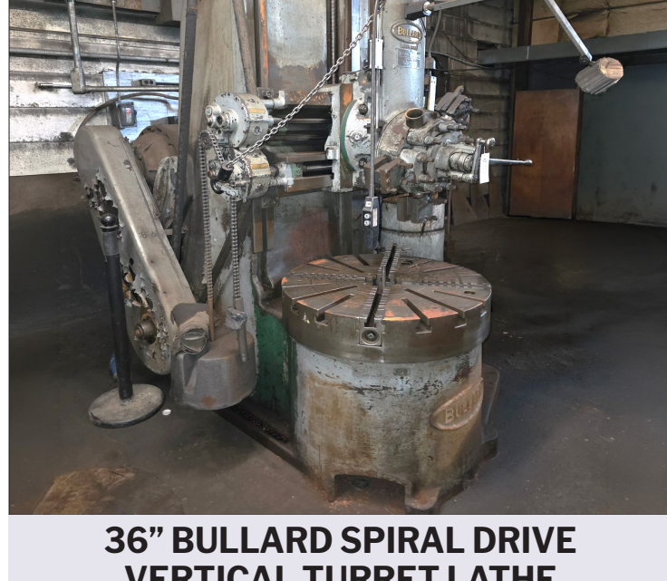
36" BULLARD SPIRAL DRIVE VERTICAL TURRET LATHE VIEW LOT #108