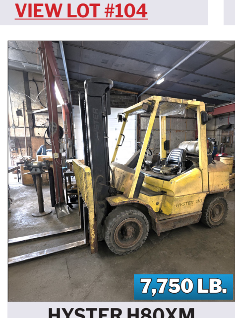
HYSTER H80XM PROPANE FORKLIFT VIEW LOT #124