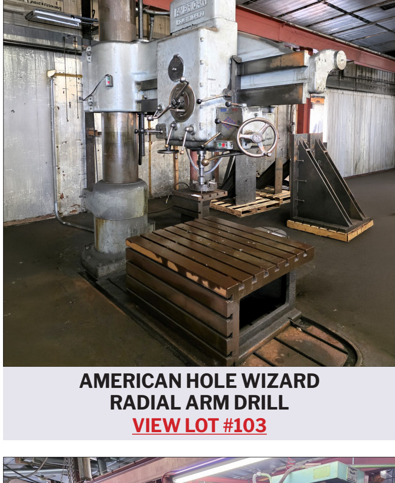
AMERICAN HOLE WIZARD RADIAL ARM DRILL VIEW LOT #103