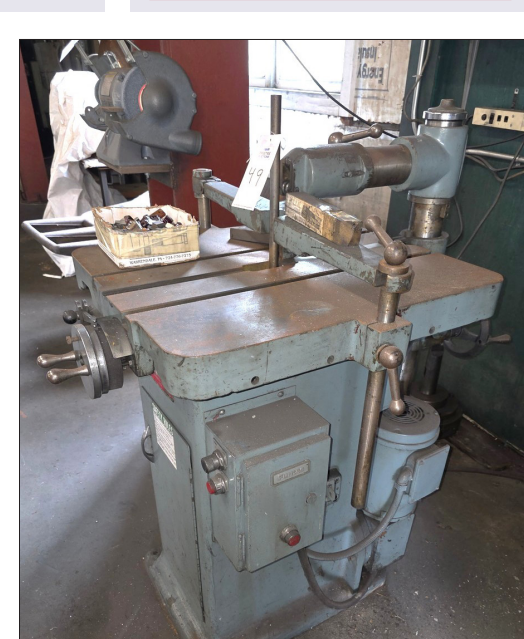
D.C. MORRISON KEYSATER VIEW LOT #49