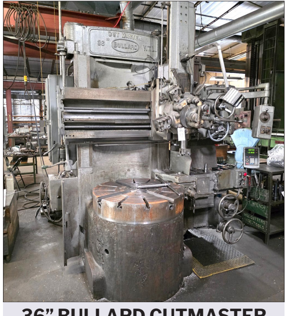
36" BULLARD CUTMASTER VERTICAL TURRET LATHE VIEW LOT #77