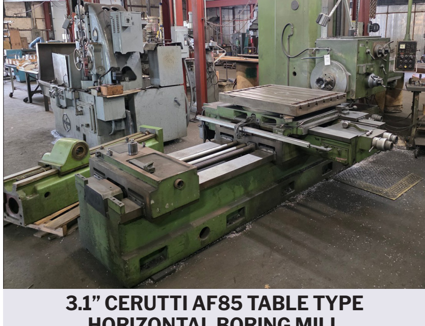
3.1" CERUTTI AF85 TABLE TYPE HORIZONTAL BORING MILL VIEW LOT #78