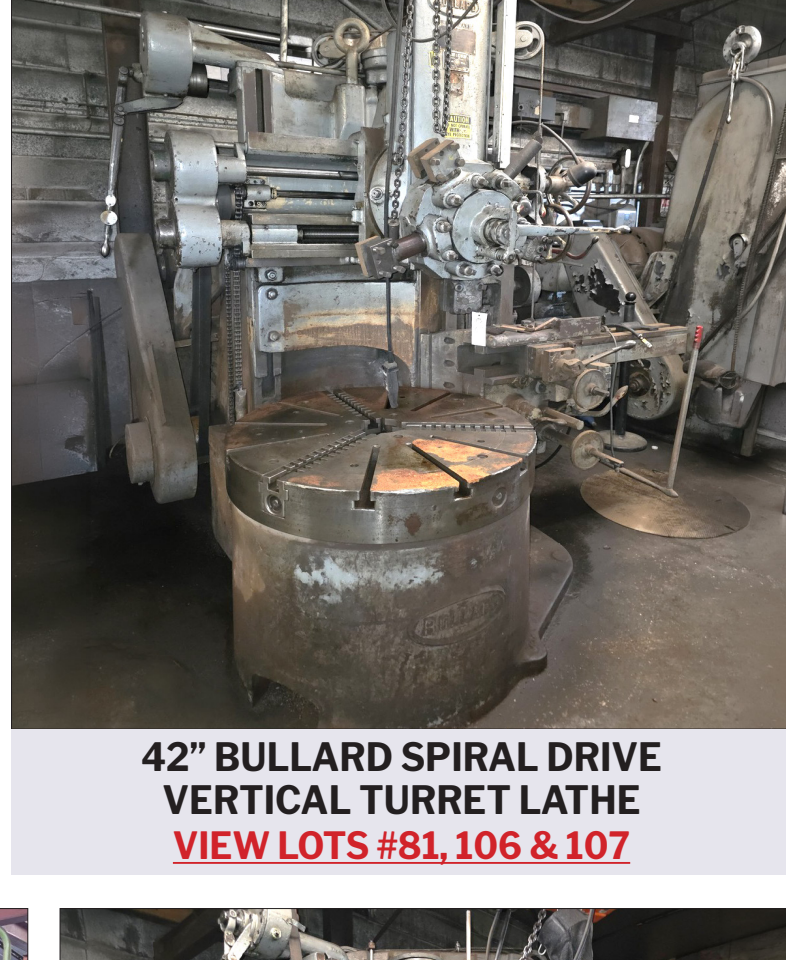
42" BULLARD SPIRAL DRIVE VERTICAL TURRET LATHE VIEW LOTS #81, 106 & 107