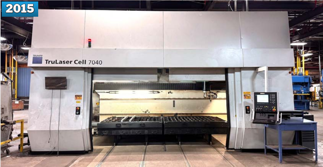
TRUMPF TRULASER 7040 5-AXIS 3D FIBER LASER