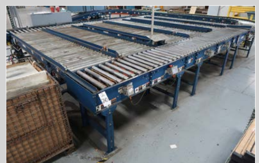
HUGE QUANTITY OF POWERED ROLLER CONVEYORS