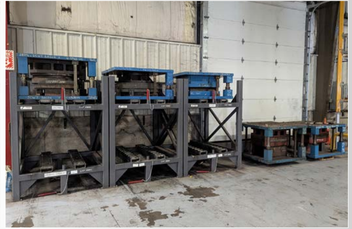
HUGE QUANTITY OF PRESS DIES – Over (160) Press Dies Total, Total Weight of Approximately 300,000 Lbs.