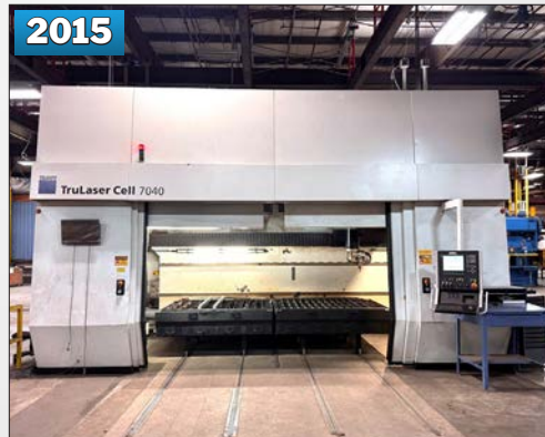
TRUMPF TRULASER 7040 5-AXIS 3D FIBER LASER