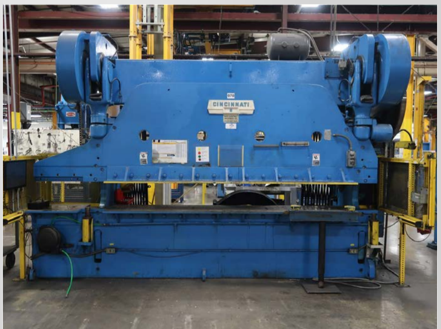
CINCINNATI SERIES 9 MECHANICAL PRESS BRAKE