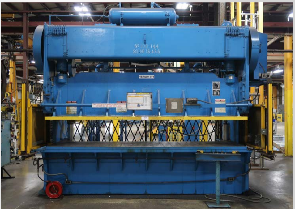
VERSON 100-144 MECHANICAL PRESS BRAKE