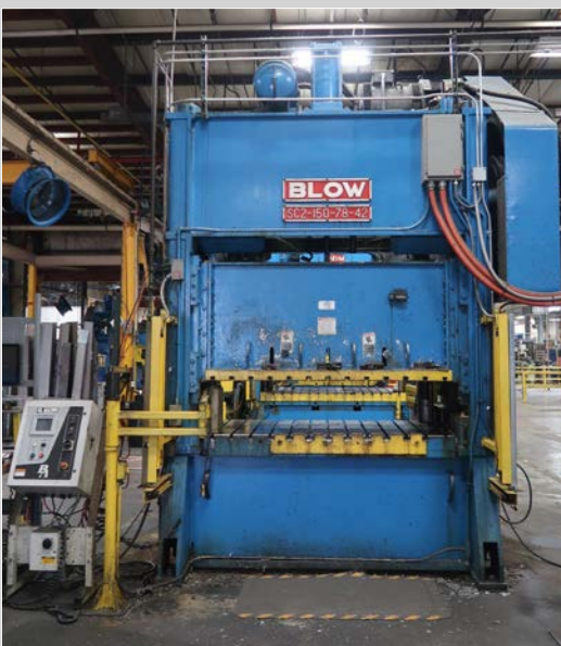
BLOW SC2-150-78-42 150-TON MECHANICAL STRAIGHT-SIDE PRESS