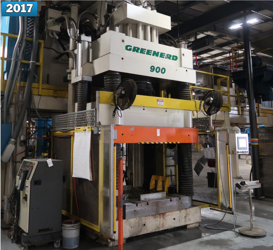
GREENERD 4TA-900/700-60x60 900 TON 4-POST HYDRAULIC PRESS