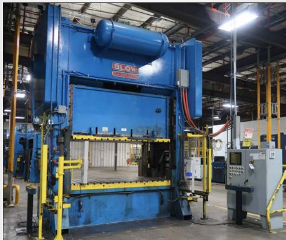
BLOW SC2-300-102-48 300-TON MECHANICAL STRAIGHT-SIDE PRESS