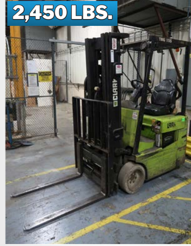
CLARK TMG-15S 36V ELECTRIC 3-WHEEL FORKLIFT