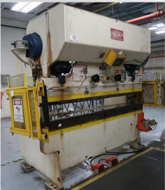
CHICAGO DRIES & KRUMP 68B MECHANICAL PRESS BRAKE