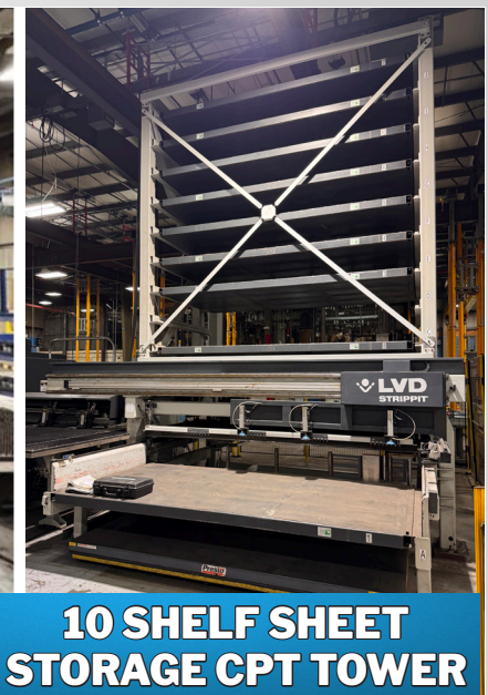
10 SHELF SHEET STORAGE CPT TOWER