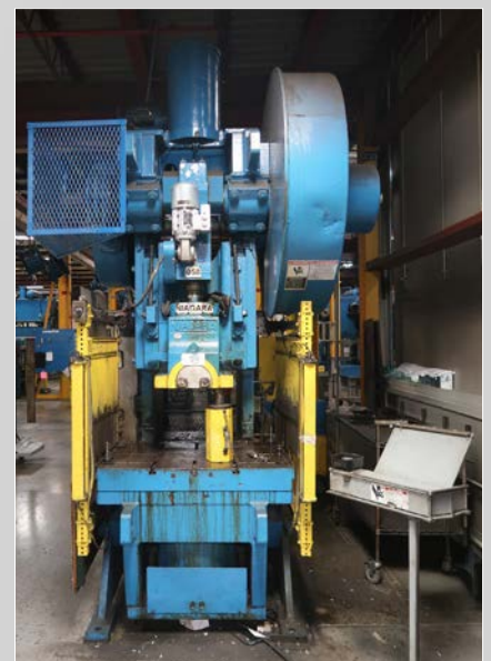
NIAGARA A110-GRD OBI GEARED PUNCH PRESS