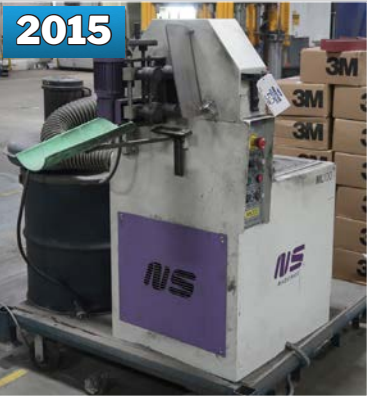
NS MAQUINAS ML100 TUBE FINISHING MACHINE