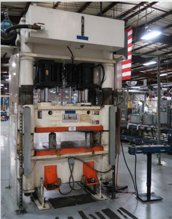
BECKWOOD 250 TON 4-POST HYDRAULIC PRESS

CLEARING H-500-72 500-TON 4-POST HYDRAULIC PRESS , 500-Ton Capacity, 36" Stroke, 70" x 60" Bed Area, S/N: 54-18178-P