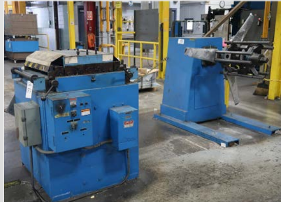
JACO JSH-257-4 24" STRAIGHTENER