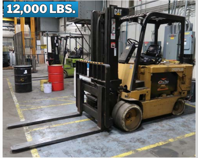
CATERPILLAR M120D 36V ELECTRIC FORKLIFT