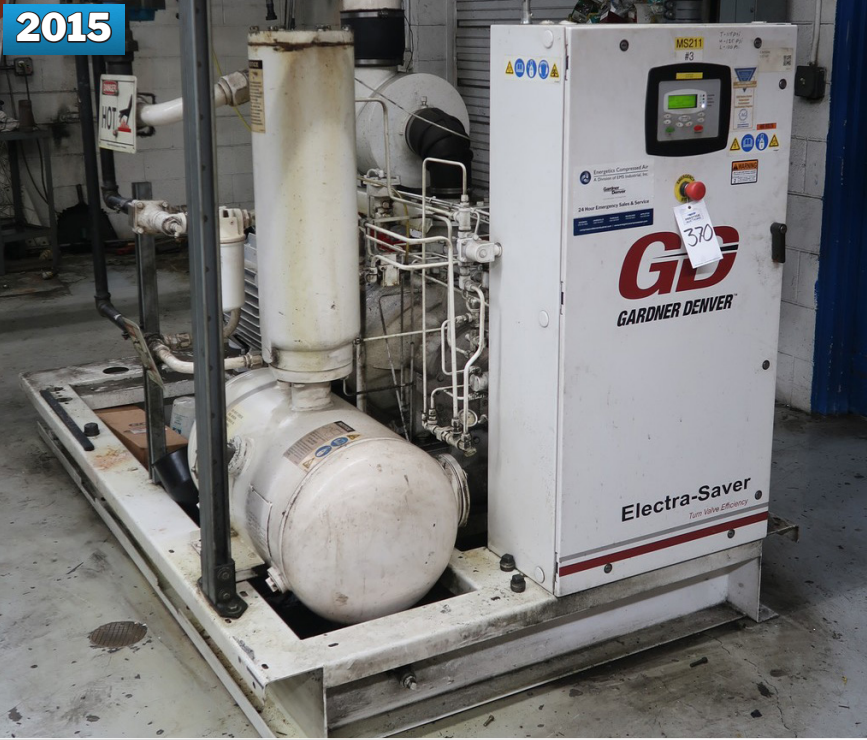
GARDNER DENVER EAP99K 100HP AIR COMPRESSOR