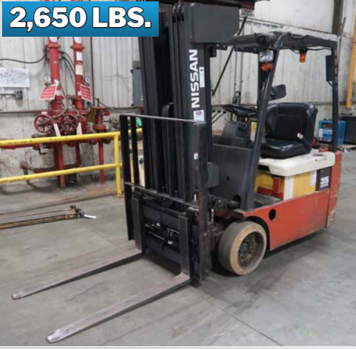
NISSAN TN01L18HV 36V ELECTRIC 3-WHEEL FORKLIFT