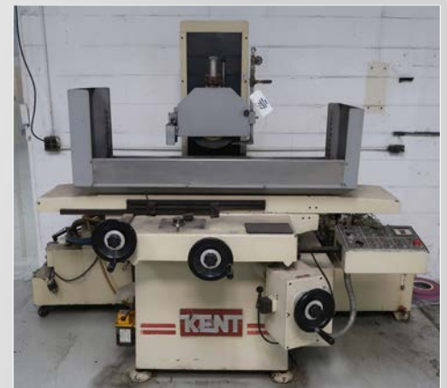
KENT KGS-306A11D 12 X 24 SURFACE GRINDER