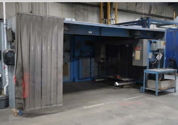
DENRAY 20' X 12' X 8' DUST BOOTH