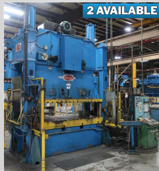
HEIM S2-250 250-TON MECHANICAL STRAIGHT-SIDE PRESS