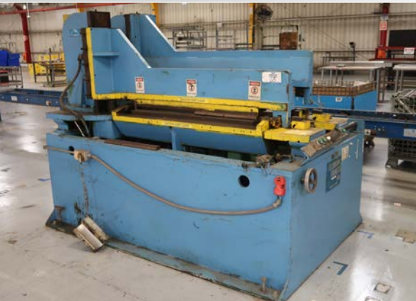
FELDMAN FORMERS DH 42-2 BENDER

2001 GENIE GS2646 ELECTRIC SCISSOR LIFT, 1,000 Lb. Capacity, 26' Max Platform Height, 7' x 44" Platform with 48" Extension, Non-Marking Tires, S/N GS46-43158, 1,287 Hours