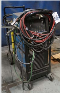
MILLER DYNASTY 350 TIG WELDER