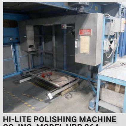
HI-LITE POLISHING MACHINE CO. INC. MODEL HBP 264 STROKER SANDER