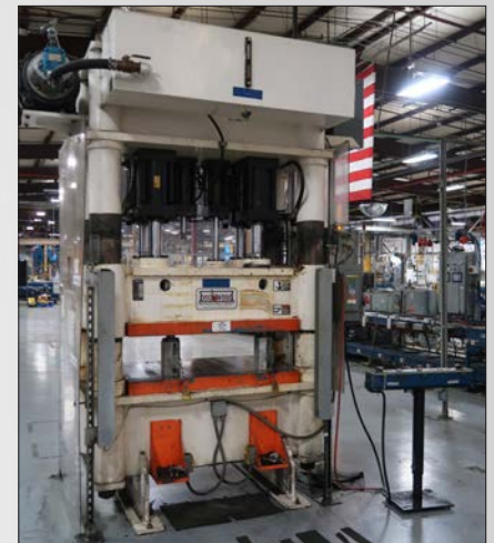
BECKWOOD 250 TON 4-POST HYDRAULIC PRESS