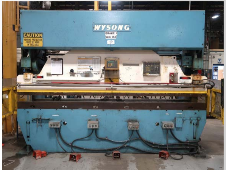
WYSONG H-110-144 HYDRAULIC PRESS BRAKE

BANTUM MODEL B2120GFS 12-TON PNEUMATIC PRESS BRAKE , 24" Bed, 1.875" Adjustable Stroke, 110 Max PSI, Foot Pedal Actuator, S/N: D9773 & D9772