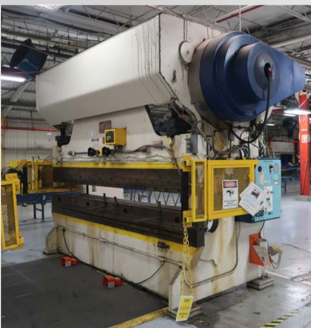
CHICAGO DRIES & KRUMP 1012-R MECHANICAL PRESS BRAKE