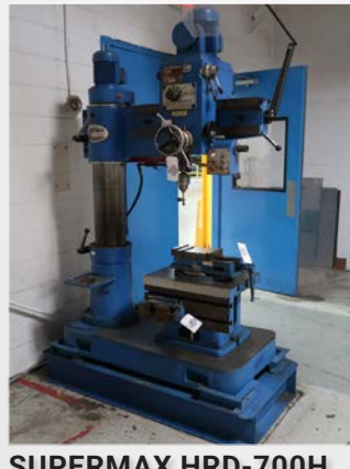
SUPERMAX HRD-700H RADIAL ARM DRILL