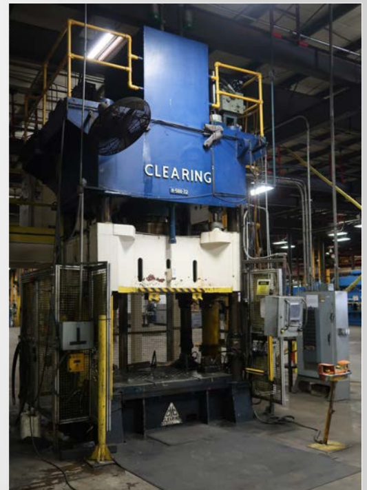
CLEARING H-500-72 4-POST HYDRAULIC PRESS