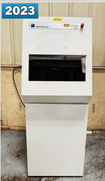
TRUMPF QUICK SHARP TOOL SHARPENER