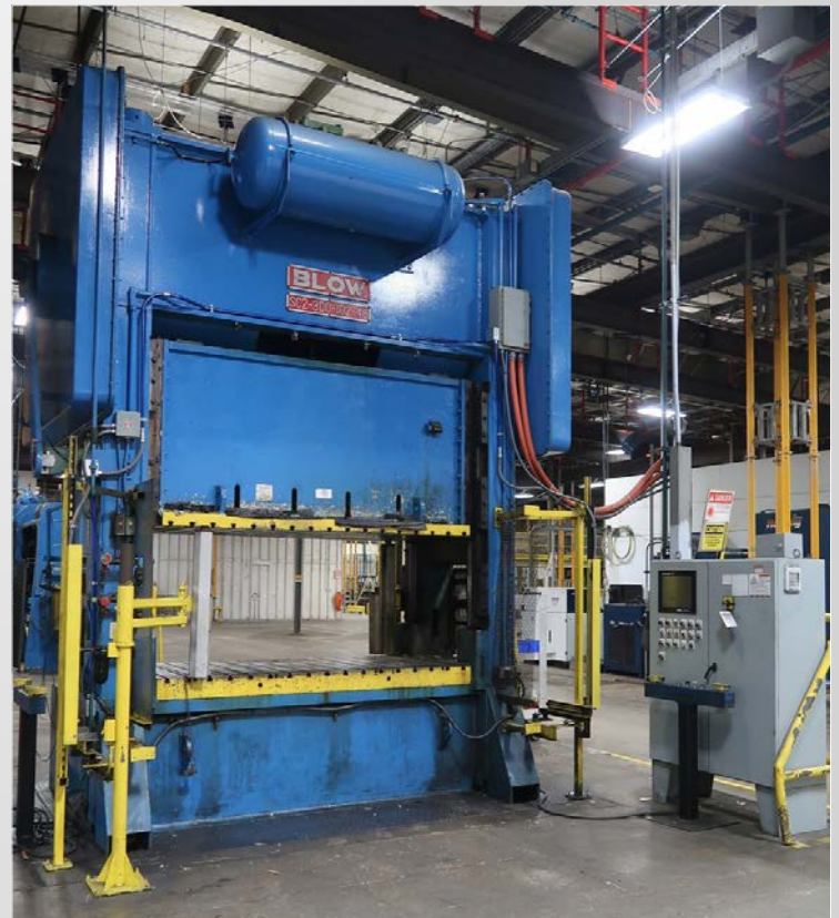
BLOW SC2-300-102-48 300-TON MECHANICAL STRAIGHT-SIDE PRESS

NIAGARA A110-GRD 110-TON OBI GEARED PUNCH PRESS , 110-Ton Capacity, 5" Stroke, 19.25" Shut Height, 42" x 27" Bed Area, 18" x 21" Ram Area, 38 SPM, Rockford Systems SSC-1500 Control, S/N 42161