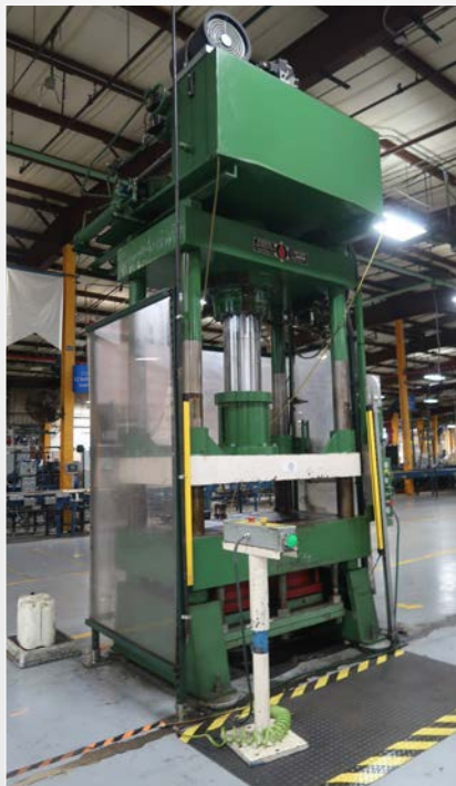
ROGERS MD200-4865-PUE 200-TON HYDRAULIC PRESS