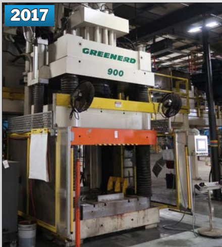
GREENERD 4TA-900/700-60x60 900 TON 4-POST HYDRAULIC PRESS