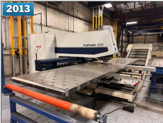
TRUMPF TRU-PUNCH 3000 SERVO ELECTRIC PUNCH