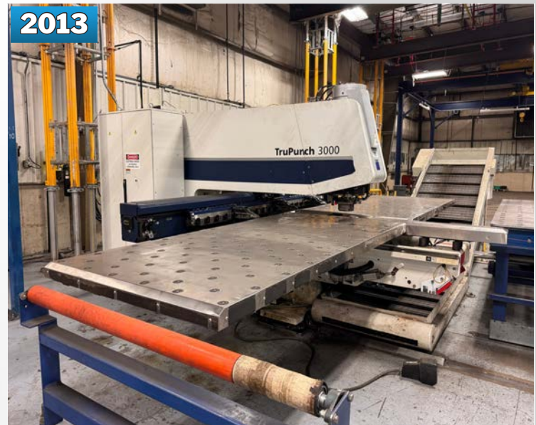
TRUMPF TRU-PUNCH 3000 SERVO ELECTRIC PUNCH