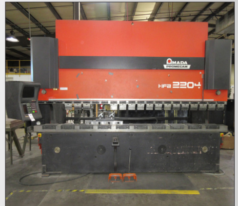
AMADA HFB0-220-40 2200-KN HYDRAULIC PRESS BRAKE

Inspection: Wednesday, June 3 or By Appointment