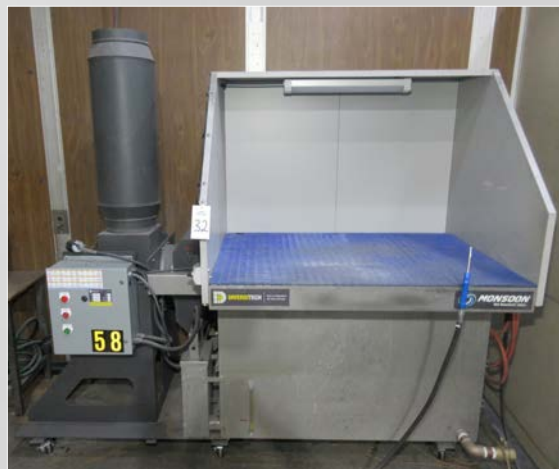
DIVERSITECH 48" X 36" MDD 3X4 MONSOON WET DOWN-DRAFT TABLE