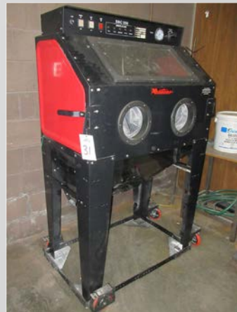
REDLINE SBC 350 36" X 24" X 20" ABRASIVE BLAST CABINET