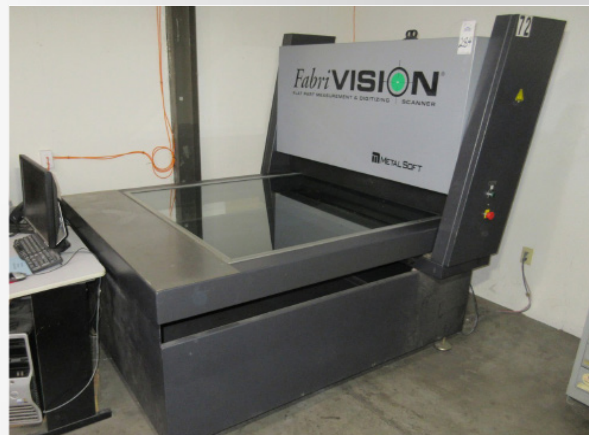
METALSOFT FABRIVISION II FLAT PART MEASUREMENT & DIGITIZING SCANNER