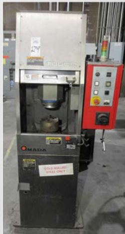
AMADA TOGU III TOOL GRINDER