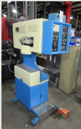
PEMSARTER PS-1000 AUTOMATED INSERTION PRESS