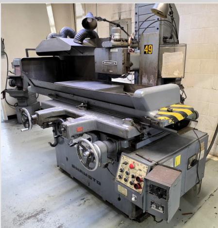
OKAMOTO ESG-84 16" X 32" HYDRAULIC SURFACE GRINDER