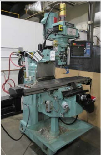
TRAK K3 VERTICAL MILL