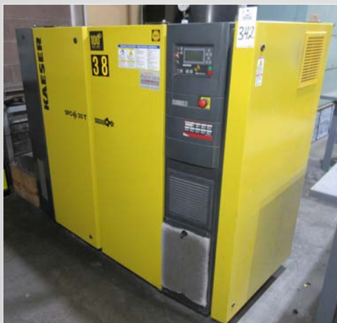
KAESER SFC-30T 40-HP ROTARY SCREW AIR COMPRESSOR