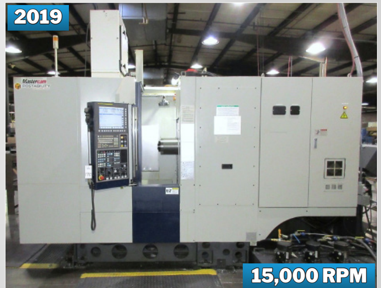
KIWA KH-4100 CNC 4-AXIS HORIZONTAL MACHINING CENTER