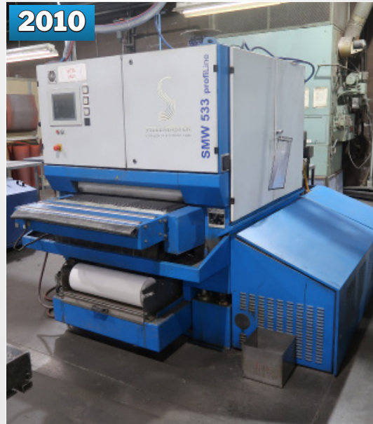
STEELMASTER SMW 533/RTB DEBURRER & FINISHER