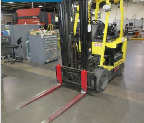
HYSTER E502-27 FORKLIFT