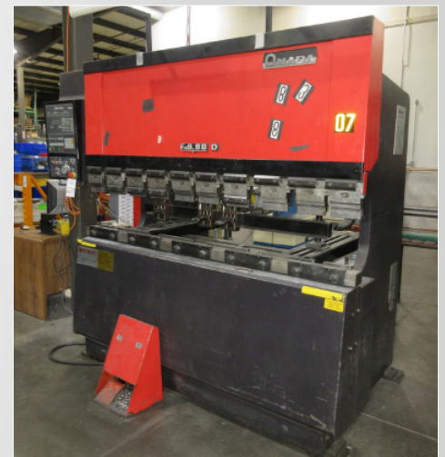
AMADA FBD-8020E 80-TON HYDRAULIC PRESS BRAKE