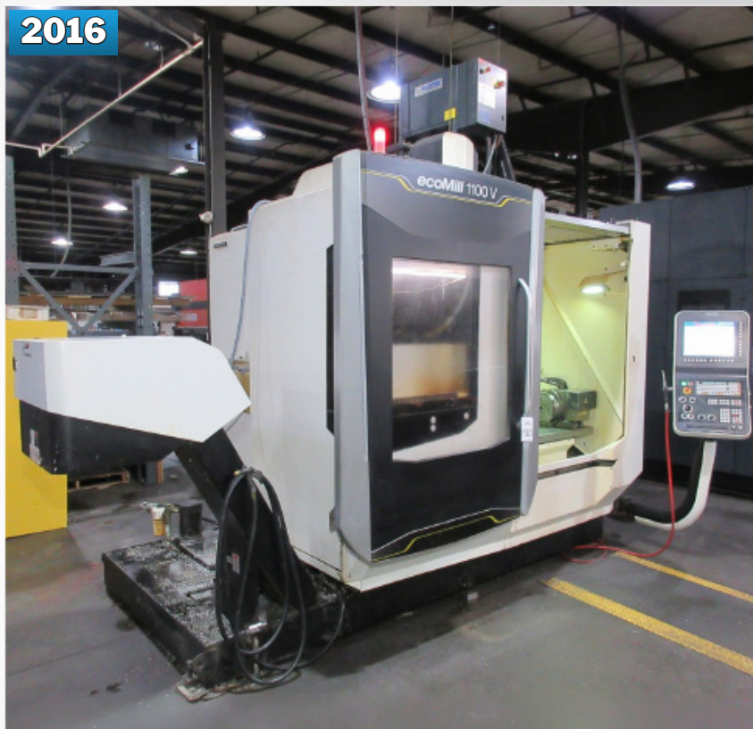
DMG MORI SEIKI ECOMILL 1100V CNC 4-AXIS VERTICAL MACHINING CENTER