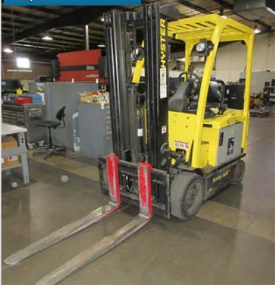
HYSTER E60XN-33 FORKLIFT