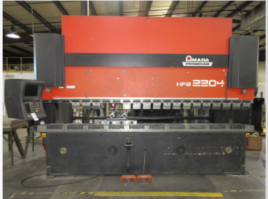
AMADA HFB0-220-40 2200-KN HYDRAULIC PRESS BRAKE

AMADA FBD-8020E 80-TON HYDRAULIC PRESS BRAKE , 78.8" Table Length, 82.1" Max Bending Length, 66.9" Between Uprights, 15.75" Throat, 3.94" Stroke, 14.57" Open Height, NC9-EXII Back Gauge Controls, S/N- 8200198 [1988]