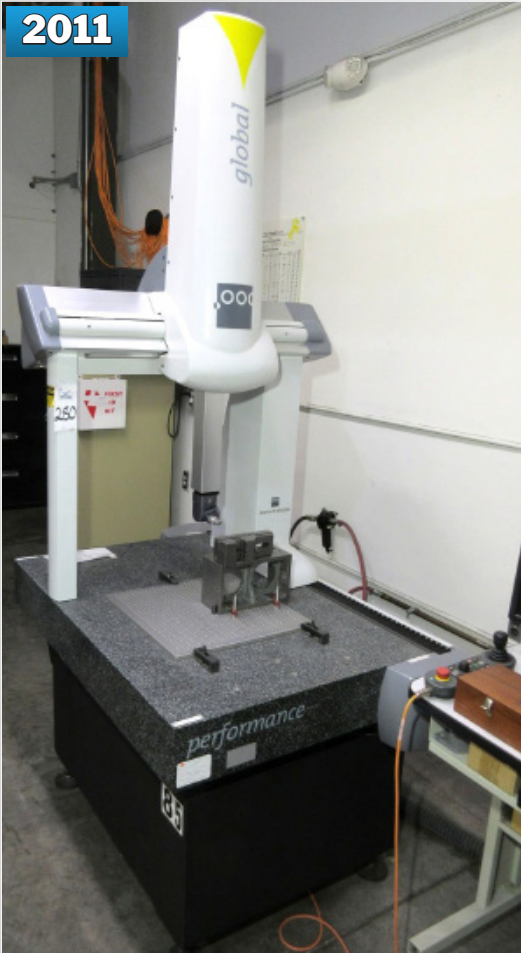
BROWN & SHARPE GLOBAL PERFORMANCE 5/7/5 COORDINATE MEASURING MACHINE

METALSOFT FABRIVISION II FLAT PART MEASUREMENT & DIGITIZING SCANNER , (8) Cameras, 48"x48" Table Size, 115V. S/N- 2211