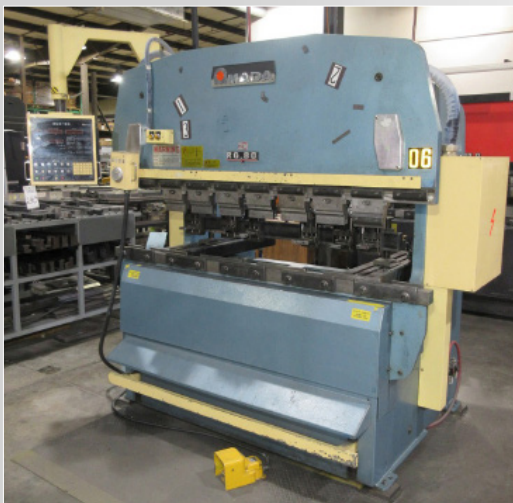
AMADA RG-80S 80-TON HYDRAULIC PRESS BRAKE