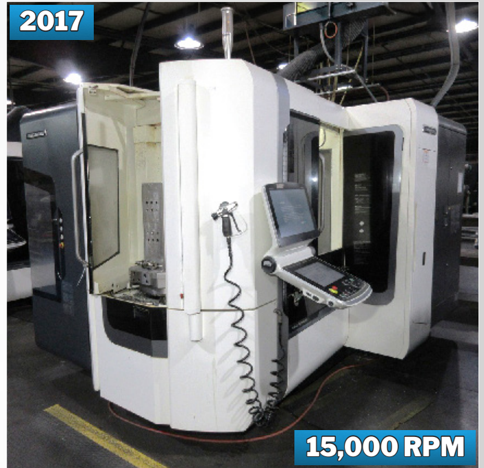
DMG MORI NHX-4000 CNC 4-AXIS HORIZONTAL MACHINING CENTER