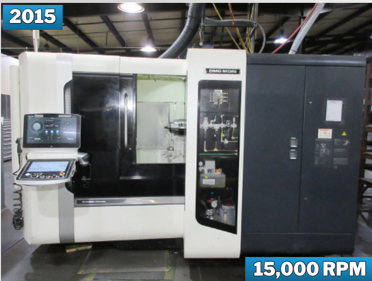
DMG MORI NHX-4000 CNC 4-AXIS HORIZONTAL MACHINING CENTER

2019 KIWA KH-4100 CNC 4-AXIS HORIZONTAL MACHINING CENTER , Fanuc Series Oi-MF CNC Control, Travels: X-20.1", Y-20.1", Z-20.1", Dual 15.7" x 15.7" Pallets, 15,000 RPM Max. Spindle Speed, 60-Station Automatic Tool Changer, CAT 40 Taper, (2) Chick 5ML1550-41 4-Sided Tombstone Vise Fixtures, Air Filtration Systems Mist-Buster Mist Collector, Daikin AKZ329-T Oil Chiller, LNS 57009407 18" Chip Conveyor/Coolant Filtration System, 9,621- Run Hours, S/N- JS3141