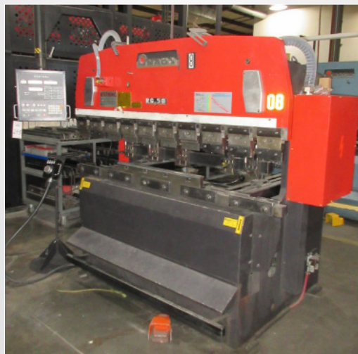
AMADA RG-50 50-TON HYDRAULIC PRESS BRAKE