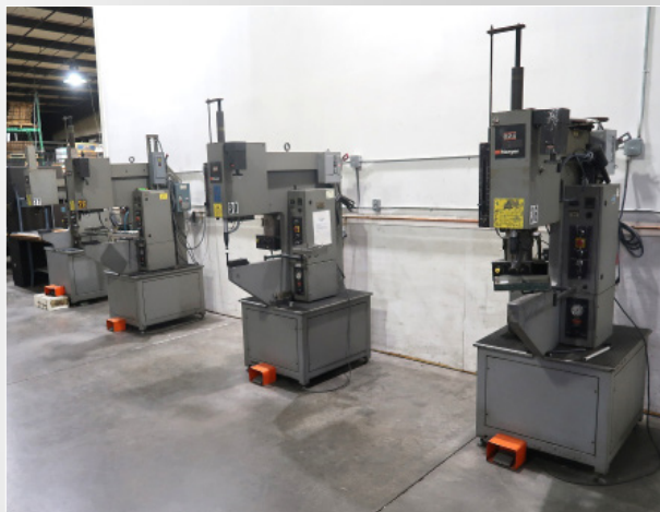
HAEGER INSERTION PRESSES