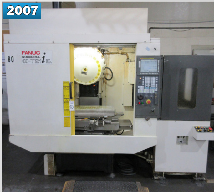
FANUC ROBODRILL A-T21iEL CNC VERTICAL MACHINING CENTER