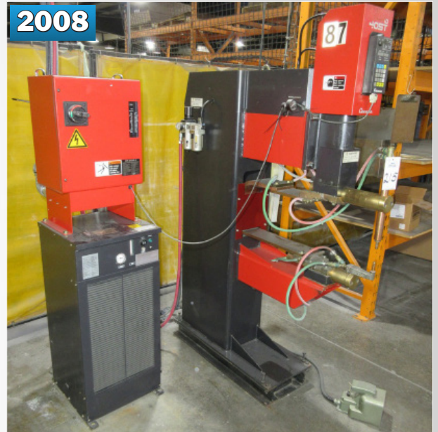
AMADA ID40ST 257KVA SPOT WELDER