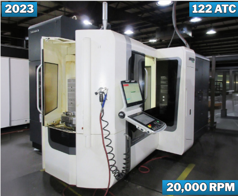
DMG MORI NHX-4000 CNC 4-AXIS HORIZONTAL MACHINING CENTER