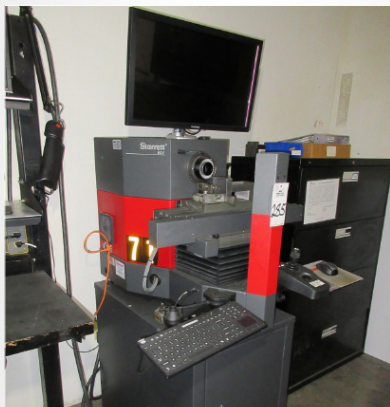
STARRETT HDV400-CNC-M3-2LED CNC DIGITAL OPTICAL COMPARATOR