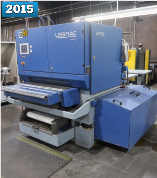
LISSMAC SMW 123 RX DEBURRER & FINISHER