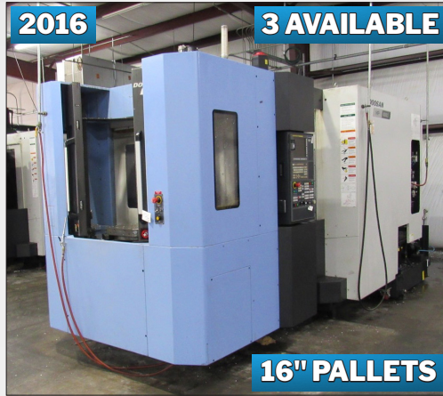
2016 3 AVAILABLE DOOSAN HP4000-II CNC 4-AXIS HORIZONTAL MACHINING CENTER