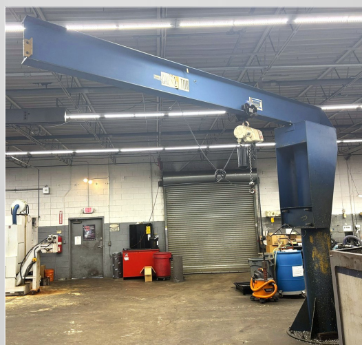
CONTRX 2 TON JIB CRANE