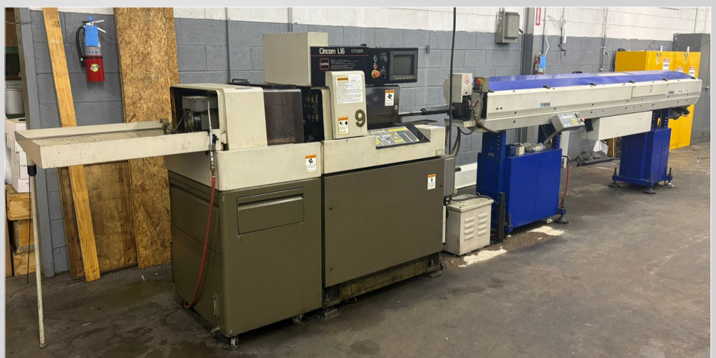
CITIZEN CINCOM L16 SWISS CNC SWISS TURNING CENTER

CITIZEN CINCOM L16 CNC SWISS TURNING CENTER , Type 3M7, Citizen CNC Control, 16mm Max. Machining Diameter, 7.87" Max. Machining Length, Pickoff, Lemca Bar Feed, S/N X9851