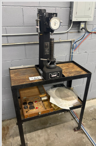
BURTON / ROCKWELL HARDNESS TESTER