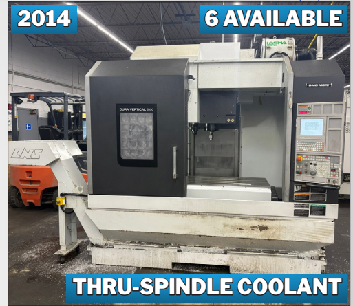
2014 6 AVAILABLE MORI SEIKI DURA VERTICAL 5100 CNC VERTICAL MACHINING CENTER