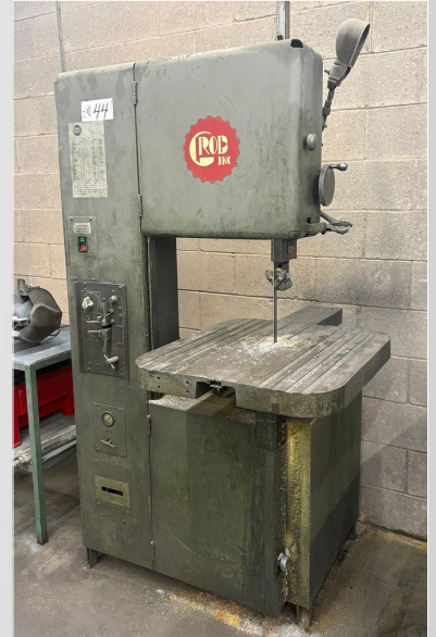
GROB 4V-18 SAW