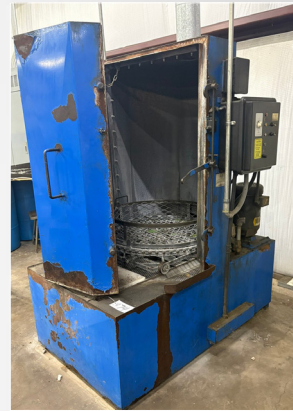
ARMA KLEEN 4-IN-1 PARTS WASHER