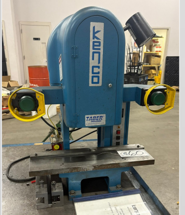
KENCO 3T/5T POWER PRESS