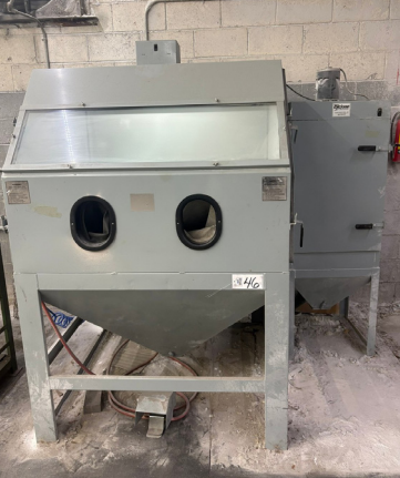
CYCLONE BLAST CABINET & DUST COLLECTOR