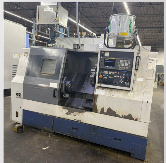
MORI SEIKI SL-25 CNC LATHE