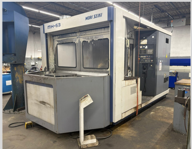
MORI SEIKI MH63 CNC HORIZONTAL MACHINING CENTER

MORI SEIKI MH-63 CNC HORIZONTAL MACHINING CENTER , MF-M6 CNC Control, Travels X-39.36", Y-31.50", Z-29.50", Dual 24.8" x 24.8" Pallets, 60 ATC, CAT 50, Chip Conveyor, S/N: 637