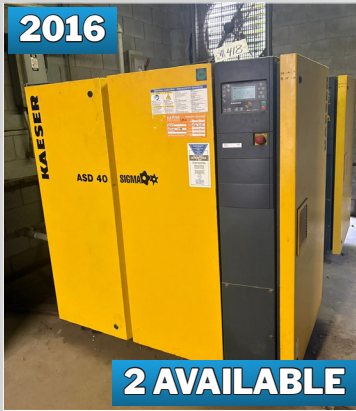
2016 KAESER ASD 40 AIR COMPRESSOR