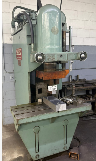
PACIFIC 75PF PRESSFORMER