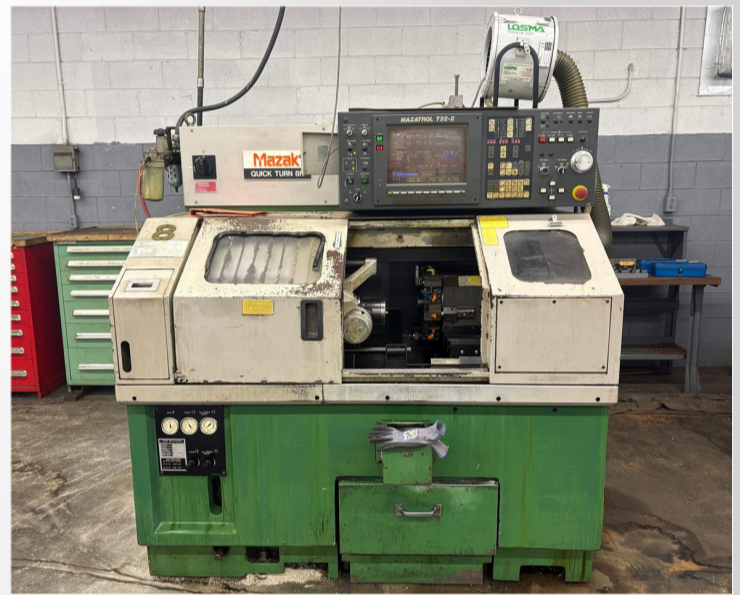
MAZAK QT28N CNC LATHE