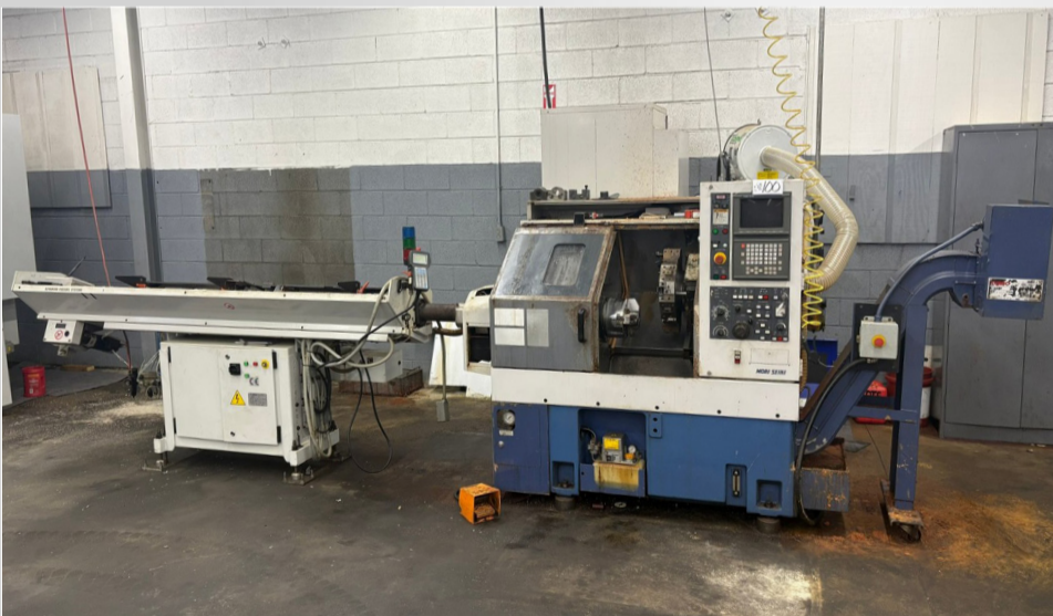
MORI SEIKI CL-20 CNC LATHE