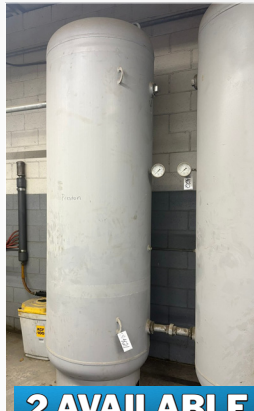
2 AVAILABLE AIR TANK