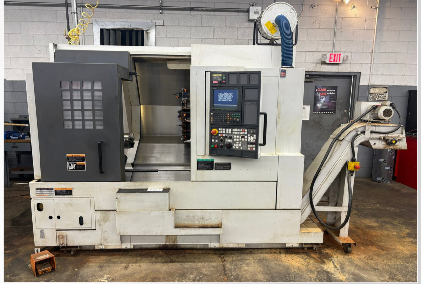
MORI SEIKI NL1500/500 CNC LATHE

MORI SEIKI CL-20 CNC LATHE , MSC 518 CNC Control, 18.5" Swing Over Bed, 13" Max Turning Length, Spindles Speeds to 4,000 RPM, Turbo Chip Conveyor, S/N: 1225