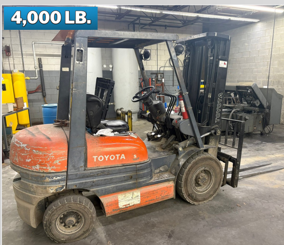
TOYODA 42-6FG25 GAS FORKLIFT