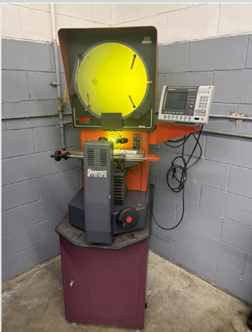
STARRET SIGMA HB400 OPTICAL COMPARATOR

LARGE QUANTITY OF INSPECTION ITEMS, INCLUDING GAGES, MICROMETERS, CALIPERS, DIAL INDICATORS, ETC.