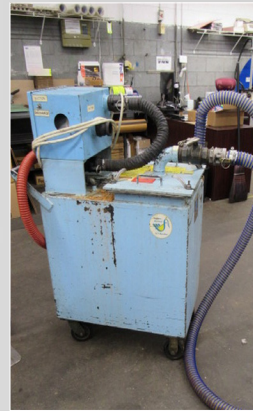
LITTLE GIANT SUMP SUCKER