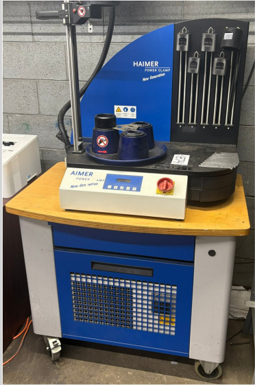
HAIMER POWER CLAMP HEAT SHRINK PRESETTER