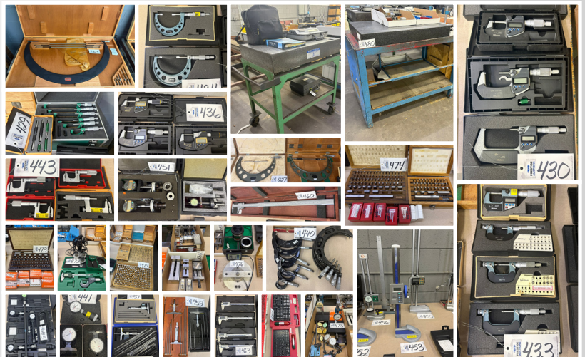
LARGE QUANTITY OF INSPECTION ITEMS