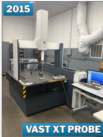
2015 ZEISS CONTURA 10/16/6 AKTIV CMM