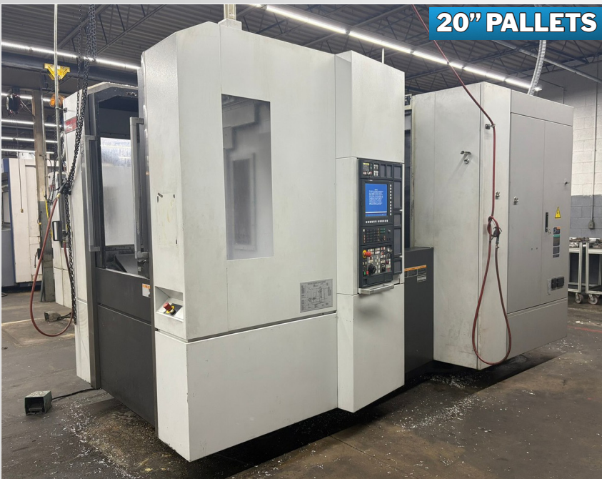
MORI SEIKI NH5000DCG/40 CNC 4-AXIS HORIZONTAL MACHINING CENTER