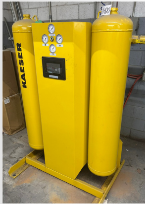
KAESER KADEC3-260 AIR DRYER