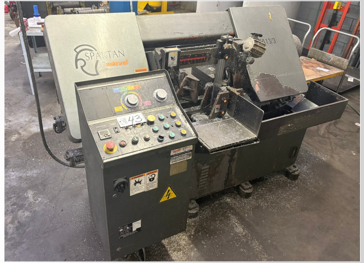
MARVEL SPARTAN PA13/3 HORIZONTAL BANDSAW

CYCLONE BLAST CABINET & DUST COLLECTOR, S/N: 14513