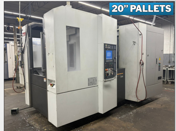
2015 MORI SEIKI NH5000DCG/40 CNC 4-AXIS HORIZONTAL MACHINING CENTER

Inspection: Monday, May 11 or By Appointment