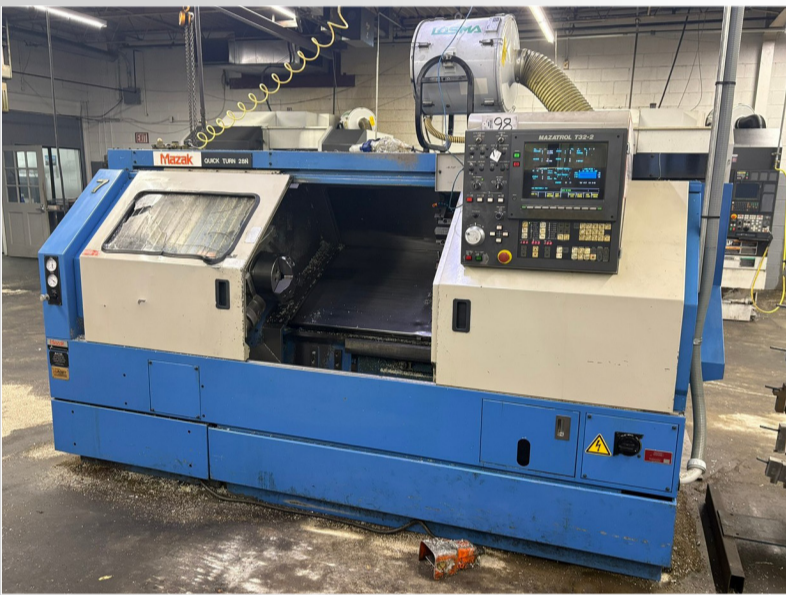
MAZAK QT28N CNC LATHE