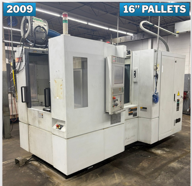
MORI SEIKI NH4000DCG/40 CNC 4-AXIS HORIZONTAL MACHINING CENTER

MORI SEIKI NH4000DCG/40 CNC 4-AXIS HORIZONTAL MACHINING CENTER , MSX-701IV CNC Control, Travels: X-22", Y-22", Z-24.8", Spindle Speeds to 14,000 RPM, Full B-Axis Contouring, High Pressure Coolant, ChipBlaster with D-30 Collant Pump JV10-1000, S/N: NH401IJ2825 [2009]