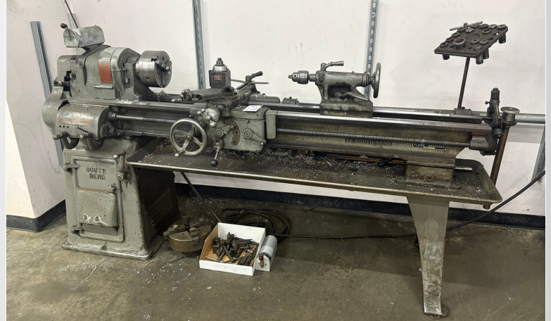
SOUTHBEND 13" LATHE