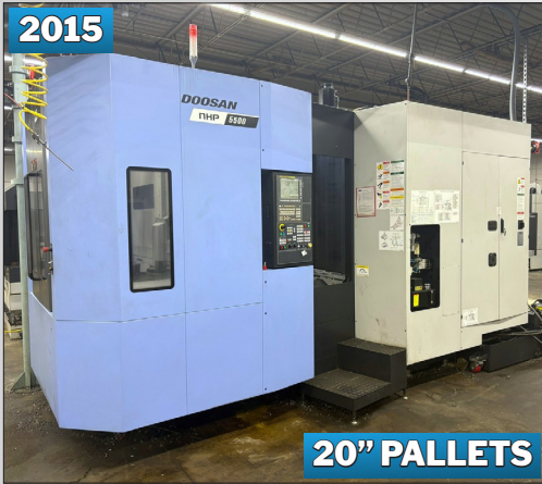
2015 DOOSAN NHP5500 CNC 4-AXIS HORIZONTAL MACHINING CENTER

**ACCEPTING PRE-AUCTION OFFERS ON MAJOR MACHINES**