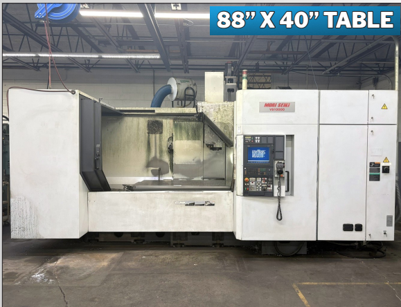
2015 MORI SEIKI VS10000 50/2050 CNC BRIDGE MILL