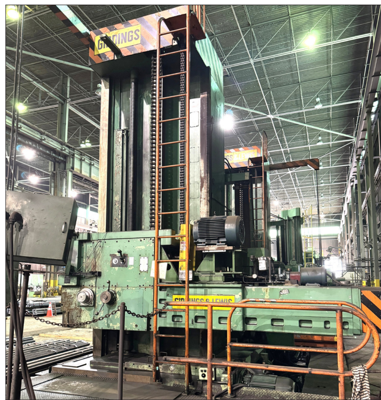
7" GIDDINGS & LEWIS 70-N7-F FLOOR TYPE HORIZONTAL BORING MILL