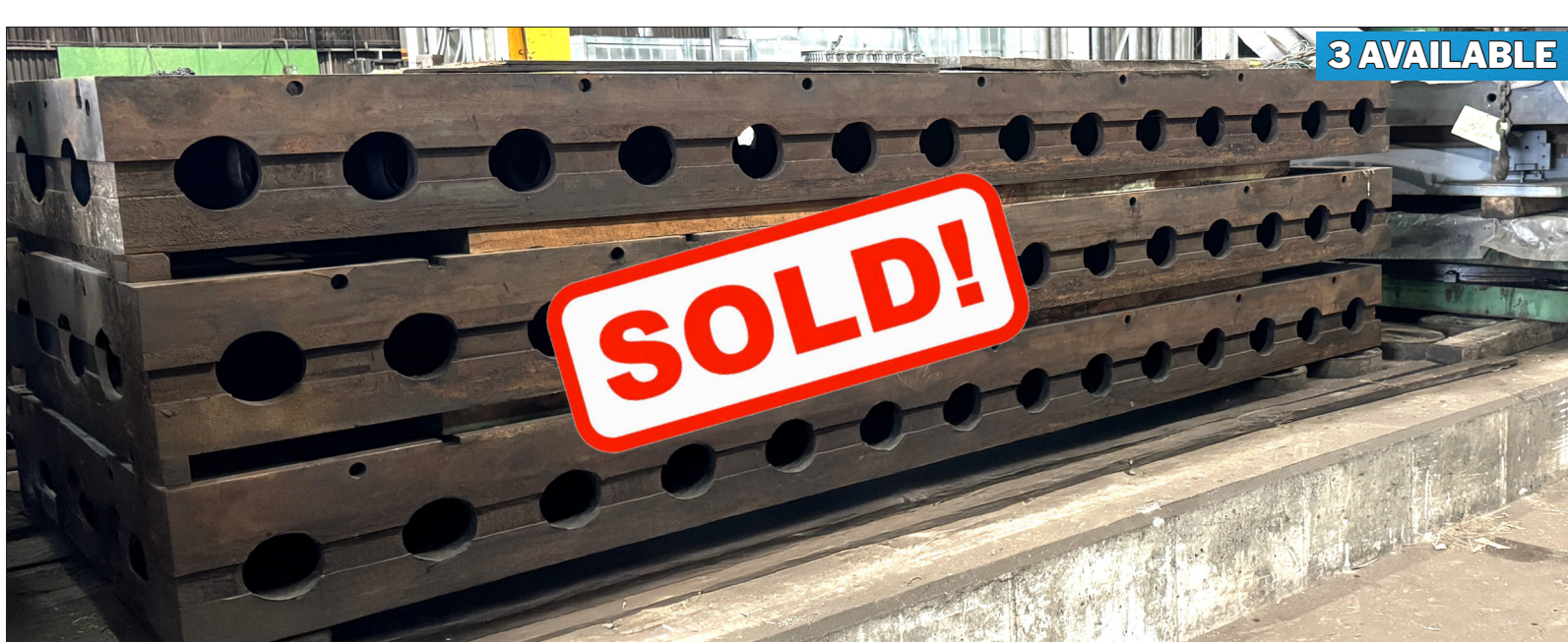
60" x 170" x 12" GIDDINGS & LEWIS T-SLOTTED FLOOR PLATES

• Machines Only, Floor Plates Not Included.