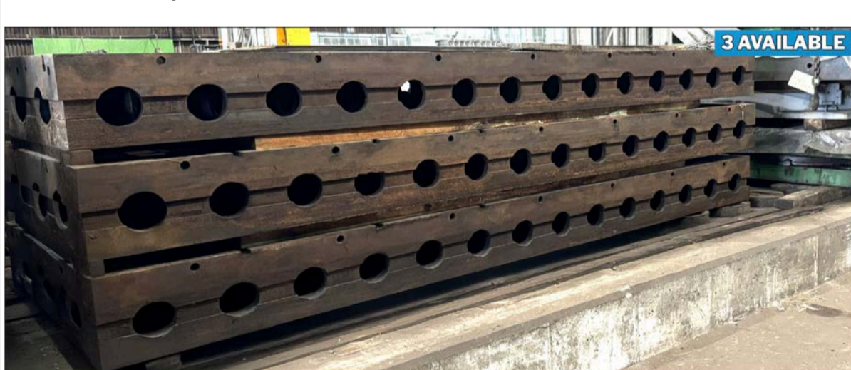
60" x 170" x 12" GIDDINGS & LEWIS T-SLOTTED FLOOR PLATES