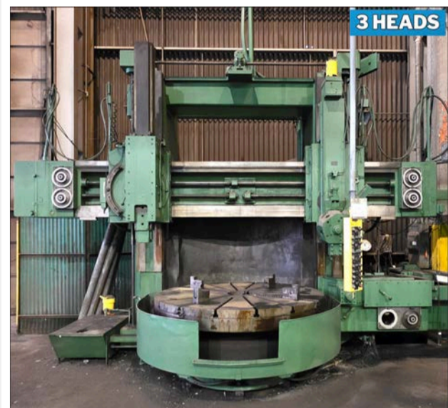
84" GRAY VERTICAL BORING MILL