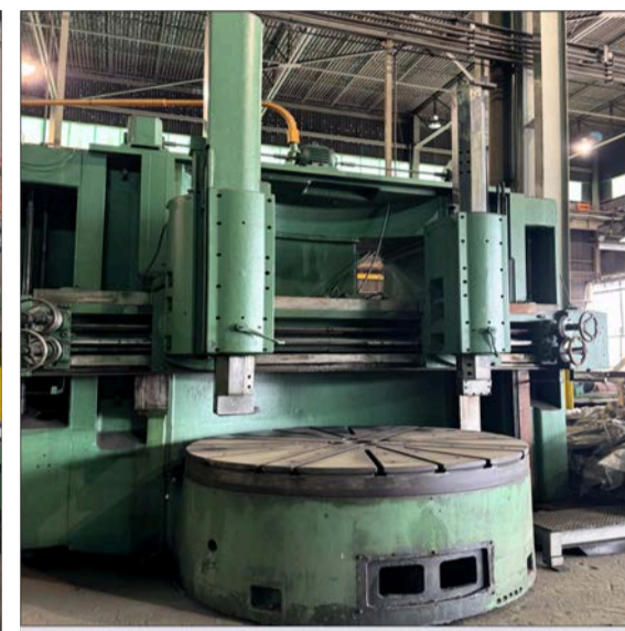
76" BULLARD CUTMASTER MODEL 75 VERTICAL BORING MILL