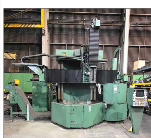
GIDDINGS & LEWIS 60" CNC VERTICAL BORING MILL