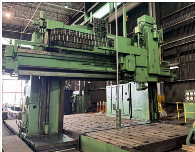
INGERSOLL 17' X 10' X 47' DOUBLE HOUSING TRAVELLING GANTRY PLANER MILL