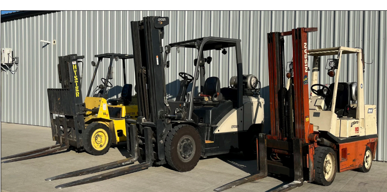
VIEW OF FORKLIFTS VIEW LOTS #248 - 250