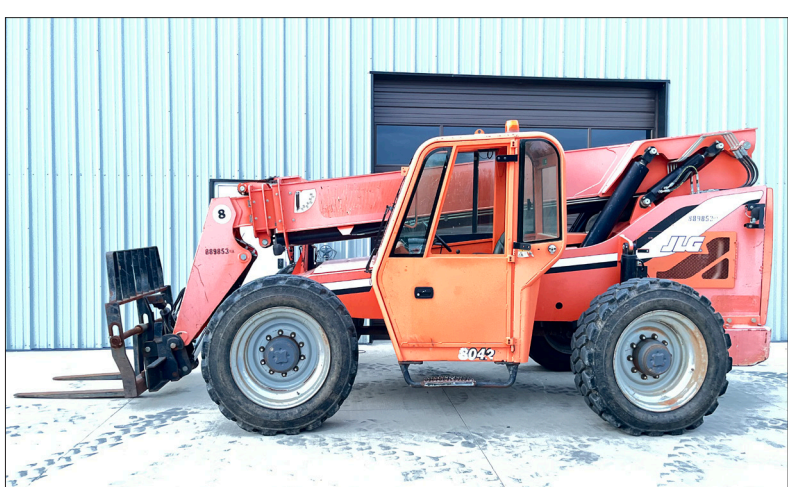
JLG 8042 SKYTRAK TELEHANDLER VIEW LOT #254