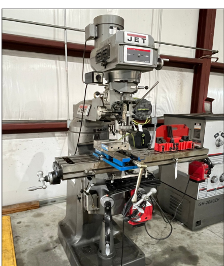
JET VERTICAL MILL VIEW LOT #108