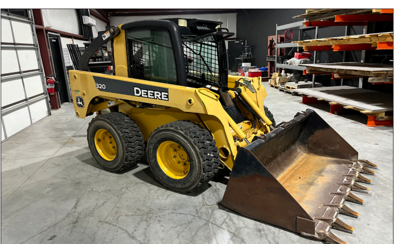
JOHN DEERE 320 SKID STEER VIEW LOT #253