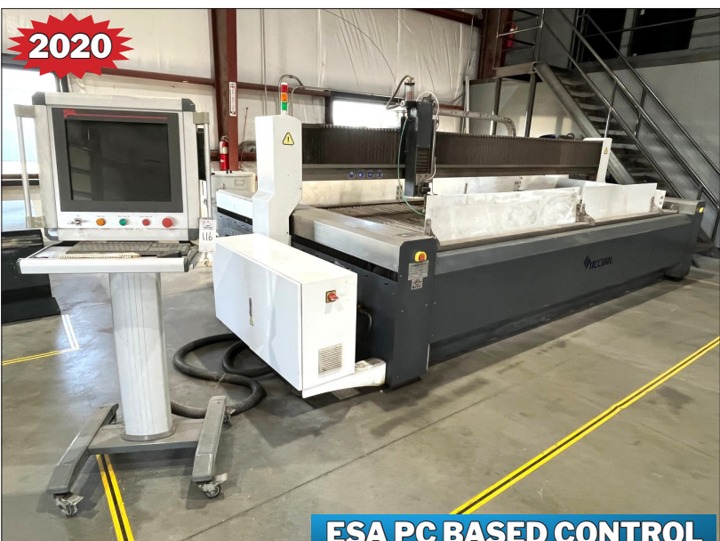
2020 ACCURL MAX-W1-40202 WATER JET VIEW LOT #116