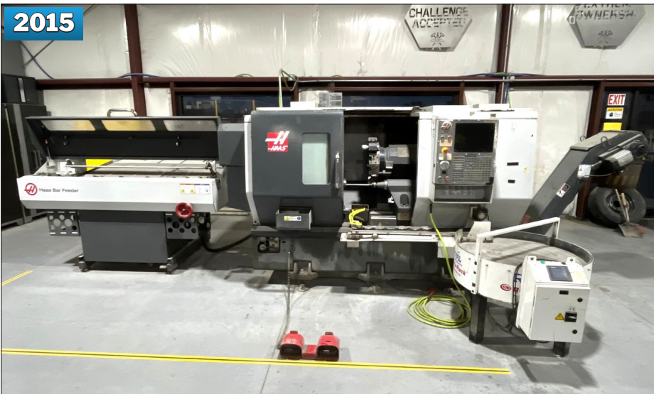
2015 HAAS ST-20 CNC TURNING CENTER VIEW LOT #79