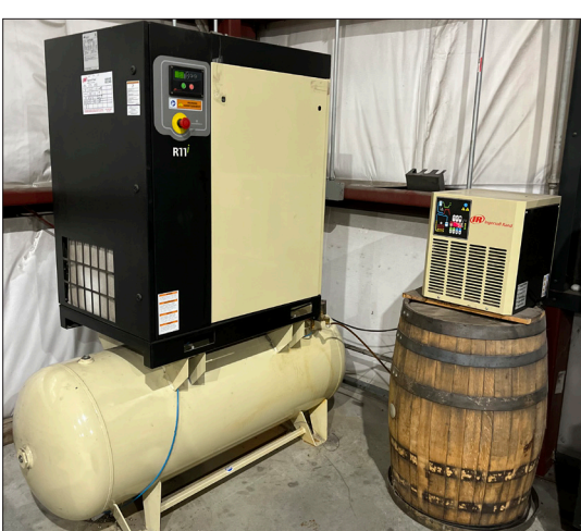
INGERSOLL RAND AIR COMPRESSOR W/ AIR DYER VIEW LOTS #105 & #106