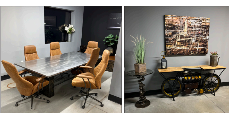
VIEW OF OFFICE FURNITURE & ARTWORK VIEW LOTS #263 - 267