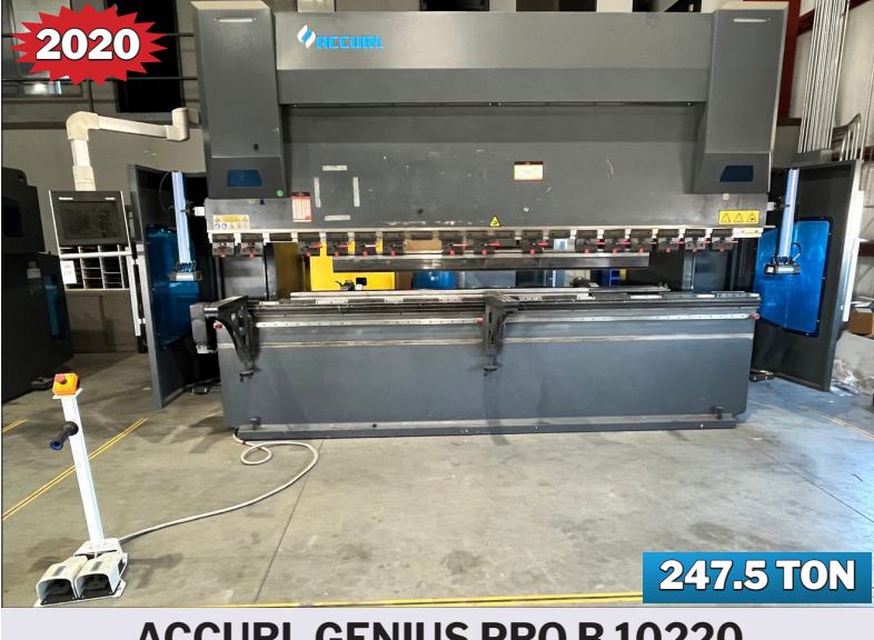
2020 ACCURL GENIUS PRO B10220 CNC PRESS BRAKE VIEW LOT #114