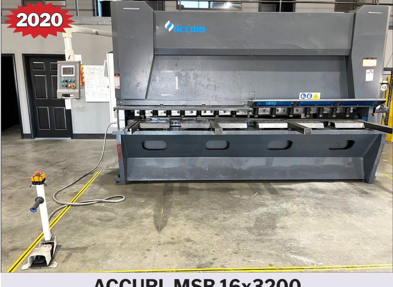
2020 ACCURL MSB 16x3200 CNC HYDRAULIC SHEAR VIEW LOT #115