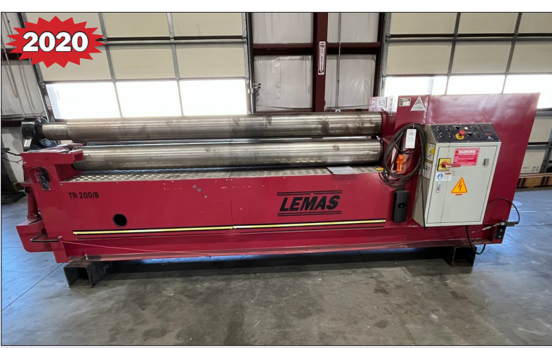
2020 LEMAS 200/8 BENDING ROLL VIEW LOT #113