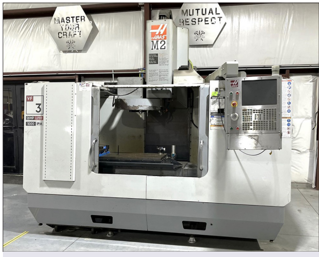
HAAS VF3 VERTICAL MACHINING CENTER VIEW LOT #80