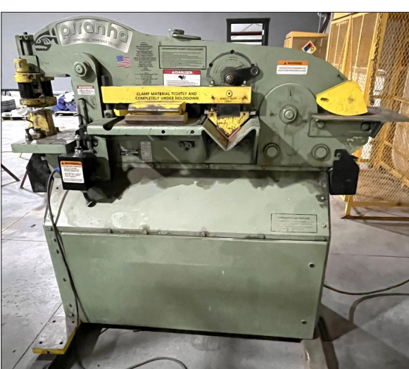
PIRANHA P-65 IRONWORKER VIEW LOT #30