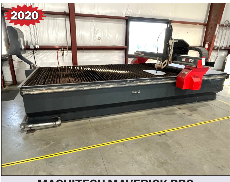
2020 MACHITECH MAVERICK PRO PLASMA CUTTING TABLE VIEW LOT #117