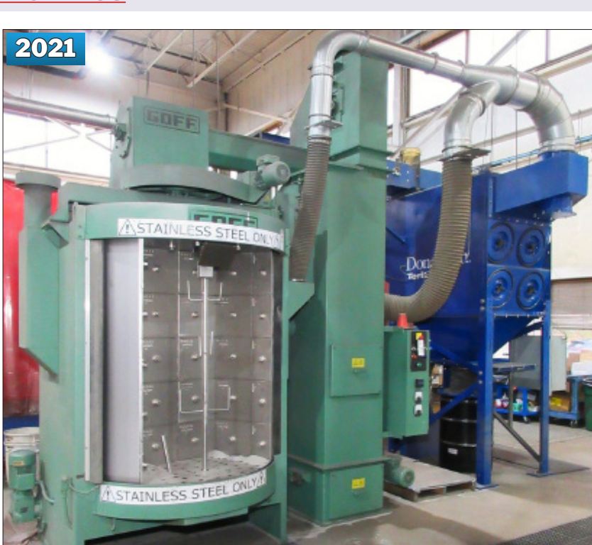
GOFF 2460D SPINNER-HANGER SHOT BLASTING MACHINE WITH DUST COLLECTOR