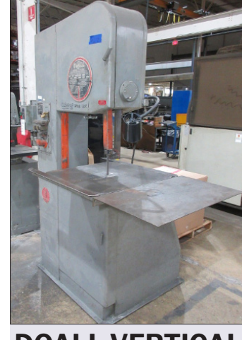
DOALL VERTICAL BAND SAW