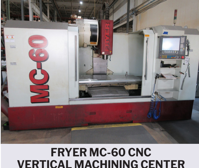
FRYER MC-60 CNC VERTICAL MACHINING CENTER