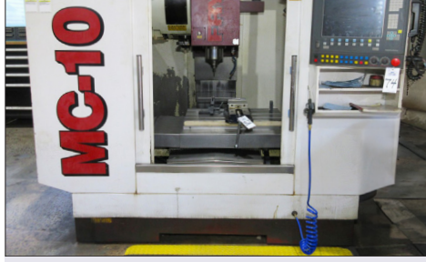
FRYER MC-10 CNC VERTICAL MACHINING CENTER