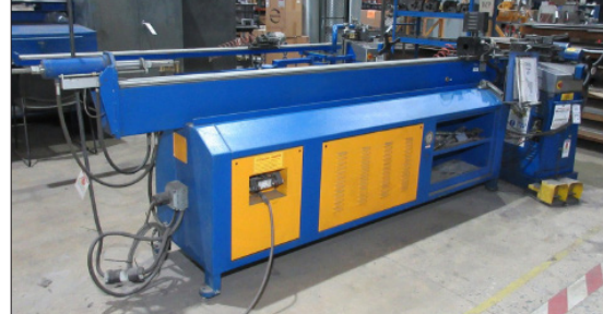
ERCOLINA TOP-030 TRIF TUBE BENDER