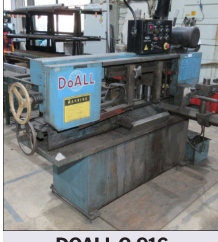
DOALL C-916 HORIZONTAL BAND SAW