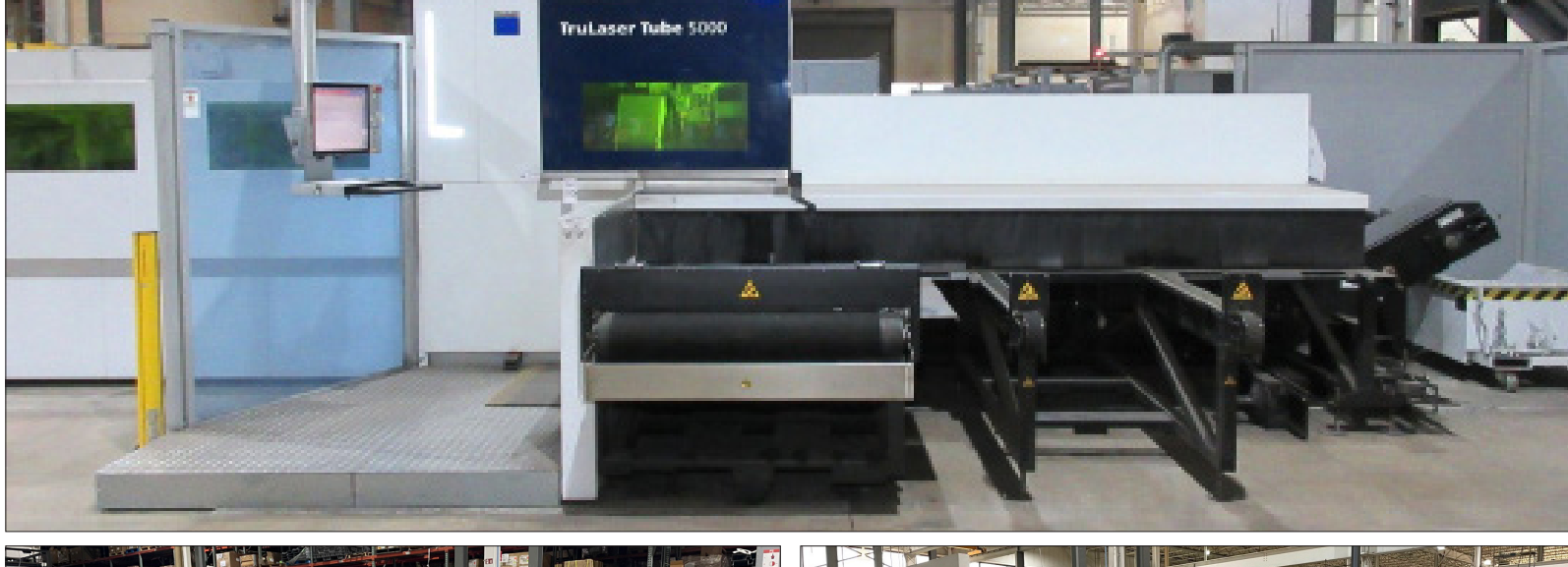
TRUMPF TRULASER TUBE 5000 3 KW FIBER LASER