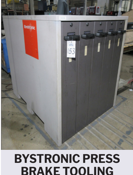
BYSTRONIC PRESS BRAKE TOOLING