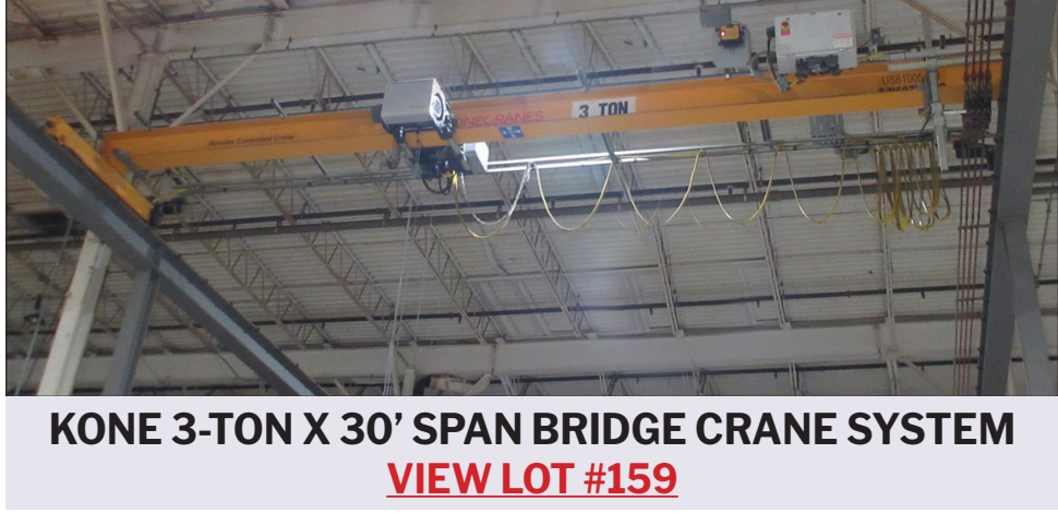
KONE 3-TON X 30' SPAN BRIDGE CRANE SYSTEM