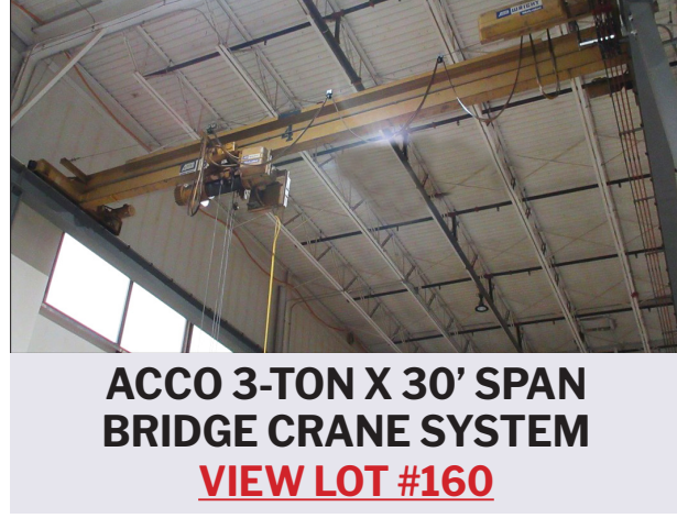
ACCO 3-TON X 30' SPAN BRIDGE CRANE SYSTEM