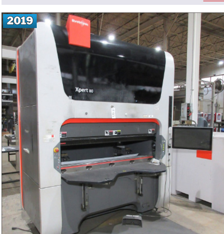
BYSTRONIC XPRT 80/1530 CNC PRESS BRAKE