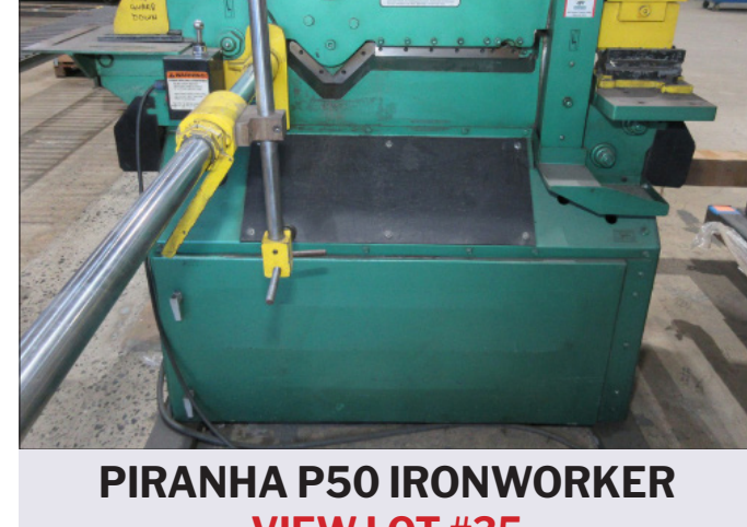
PIRANHA P50 IRONWORKER