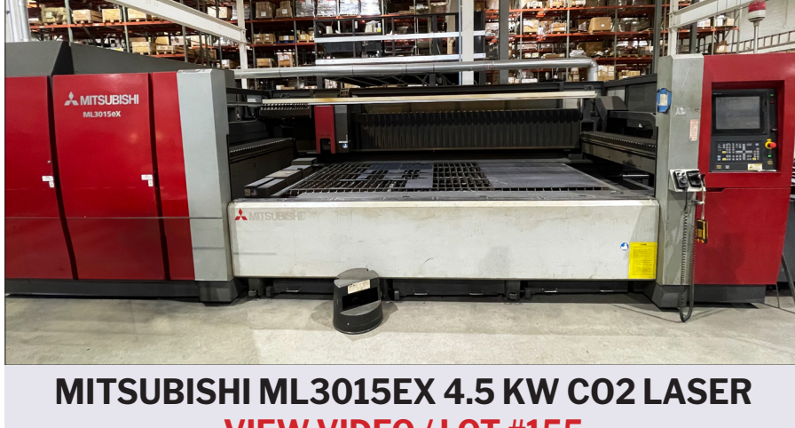
MITSUBISHI ML3015EX 4.5 KW CO2 LASER