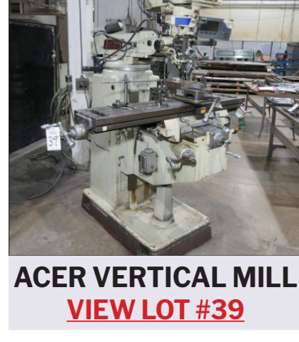
ACER VERTICAL MILL