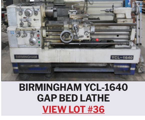
BIRMINGHAM YCL-1640 GAP BED LATHE