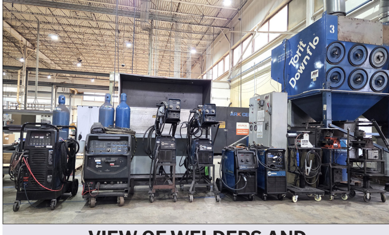
VIEW OF WELDERS AND DUST COLLECTION SYSTEM