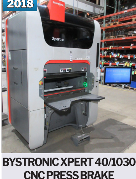
BYSTRONIC XPRT 40/1030 CNC PRESS BRAKE