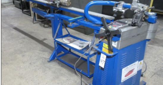
ERCOLINA SB48 TUBE BENDER