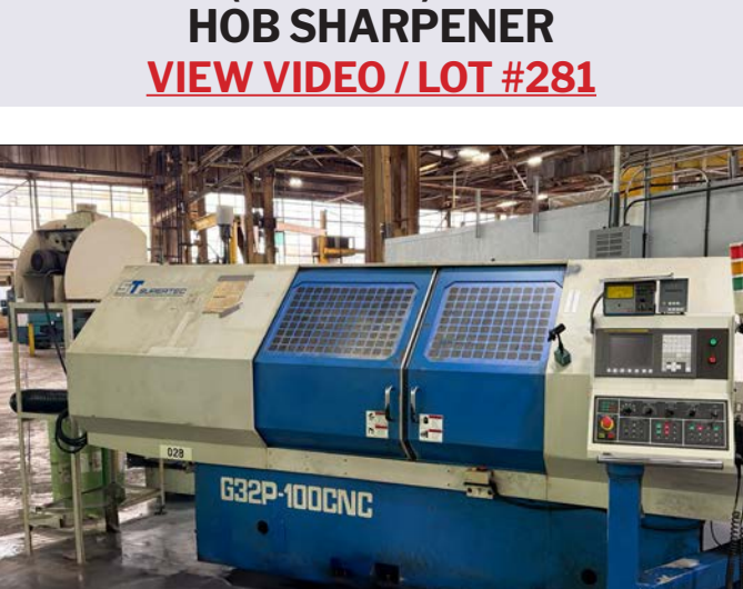
KAPP (NE TECH) AST305B HOB SHARPENER VIEW VIDEO / LOT #281