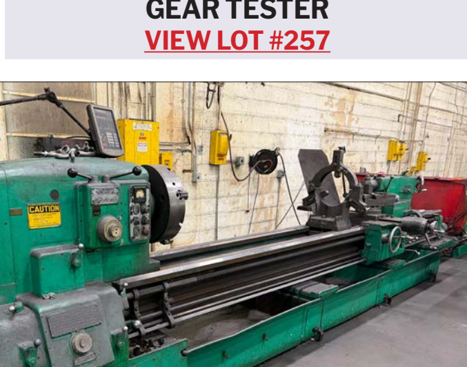
MAAG SP-160 UNIVERSAL GEAR TESTER VIEW LOT #257