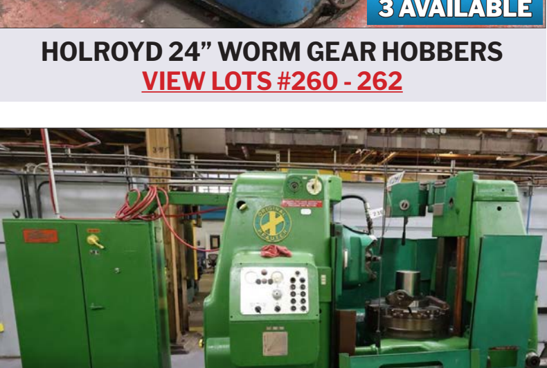
HOLROYD 24" WORM GEAR HOBBERS VIEW LOTS #260 - 262