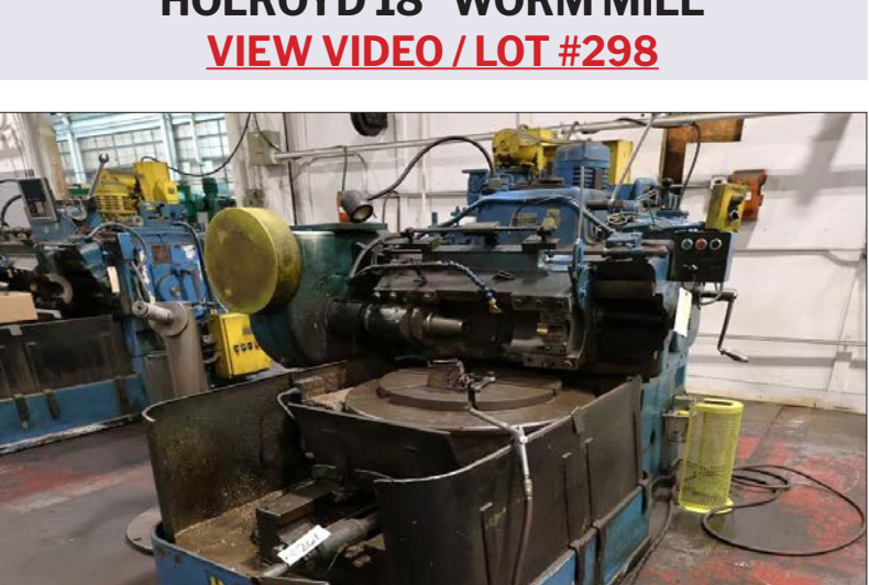
HOLROYD 18" WORM MILL VIEW VIDEO / LOT #298