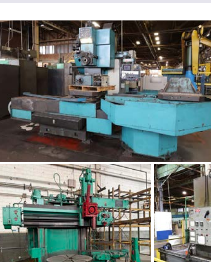
SOUTHBEND 2S VERTICAL MILL VIEW LOT #947