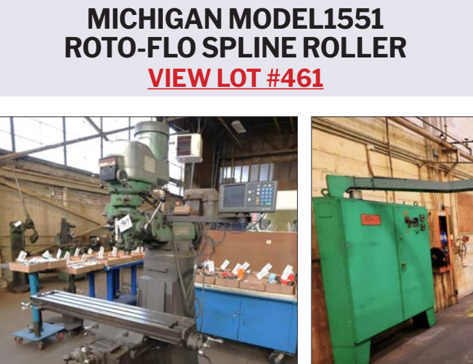
MICHIGAN MODEL 1551 ROTO-FLO SPLINE ROLLER VIEW LOT #461