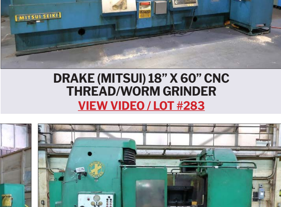
DRAKE (MITSUI) 18" X 60" CNC THREAD/WORM GRINDER VIEW VIDEO / LOT #283