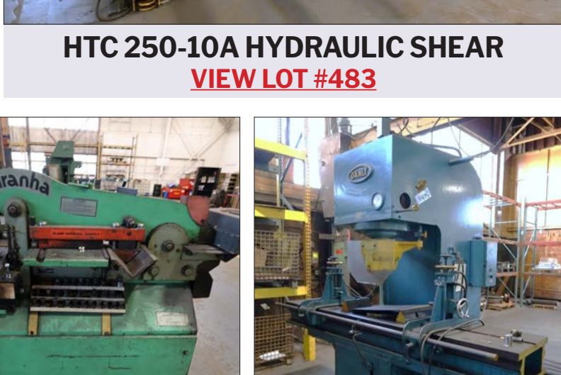
HTC 250-10A HYDRAULIC SHEAR VIEW LOT #483