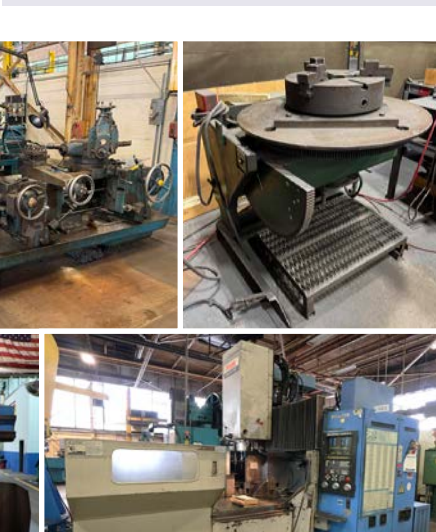
PFAUTER P403 GEAR HOBBER VIEW LOT #217