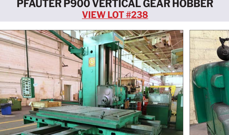
PFAUTER P900 VERTICAL GEAR HOBBER VIEW LOT #238