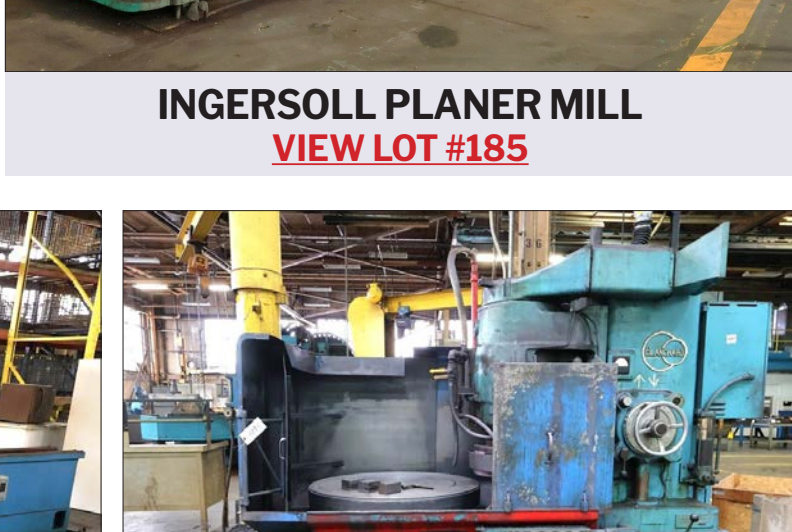
INGERSOLL PLANER MILL VIEW LOT #185