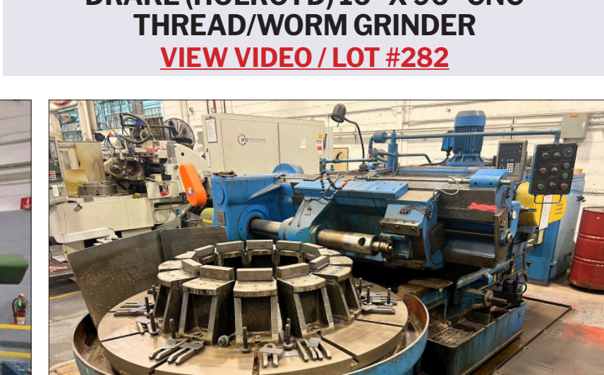
DRAKE (HOLROYD) 16" X 96" CNC THREAD/WORM GRINDER VIEW VIDEO / LOT #282