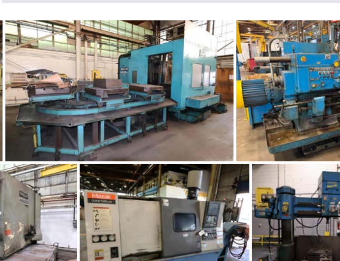
FELLOWS PFAUTER P900 GEAR HOBBERS VIEW LOTS #214 & 215