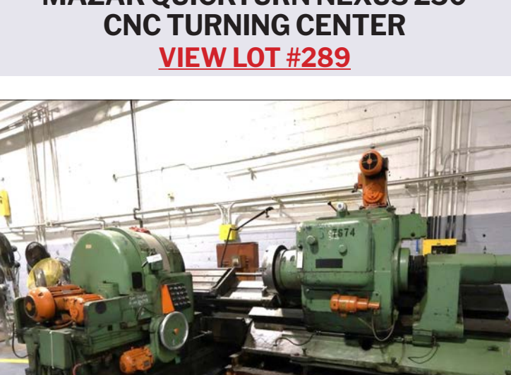
MAZAK QUICKTURN NEXUS 250 CNC TURNING CENTER VIEW LOT #289