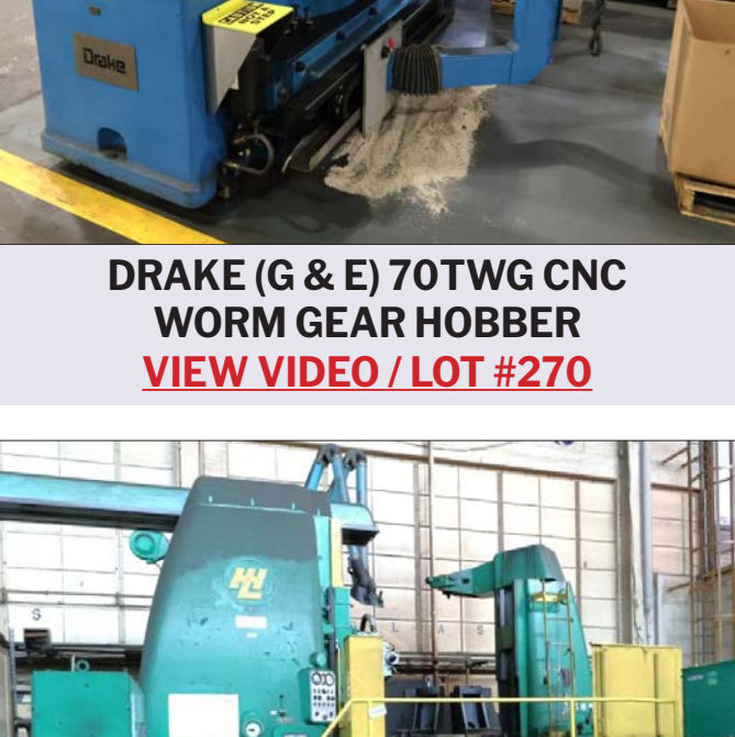
DRAKE (G & E) 70TWG CNC WORM GEAR HOBBER VIEW VIDEO / LOT #270