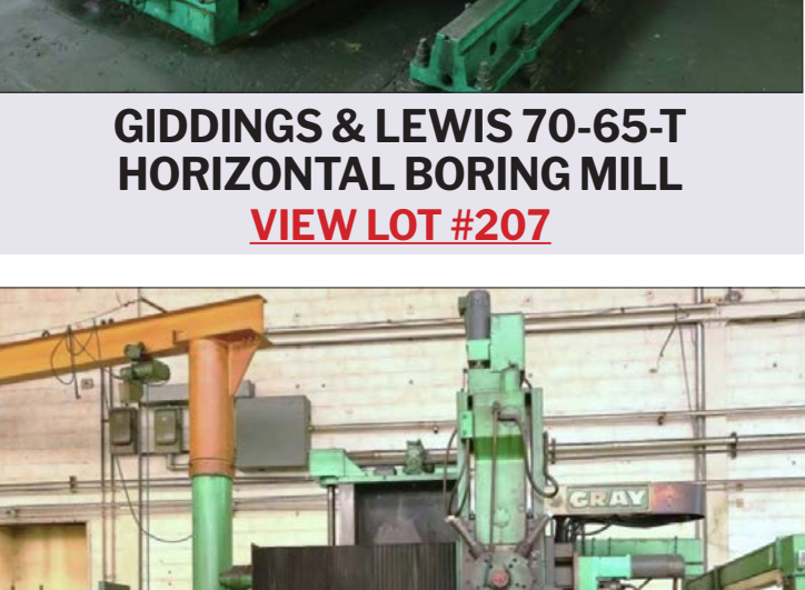
GIDDINGS & LEWIS 70-65-T HORIZONTAL BORING MILL VIEW LOT #207