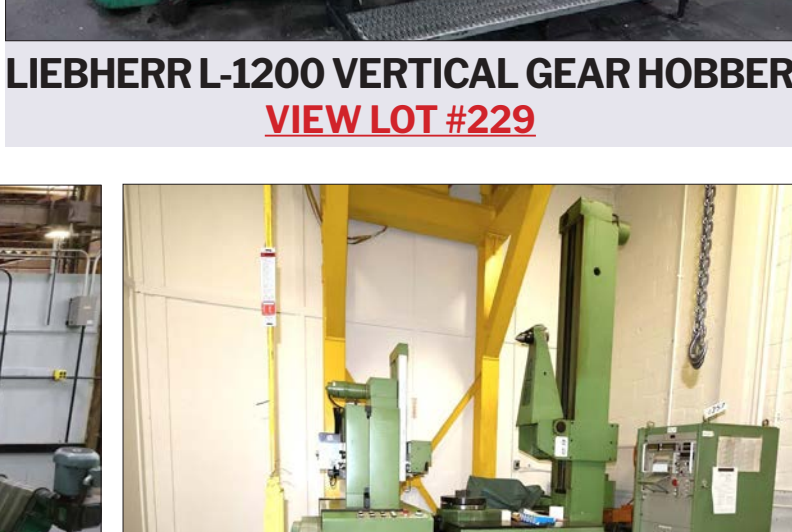
LIEBHERR L-1200 VERTICAL GEAR HOBBER VIEW LOT #229