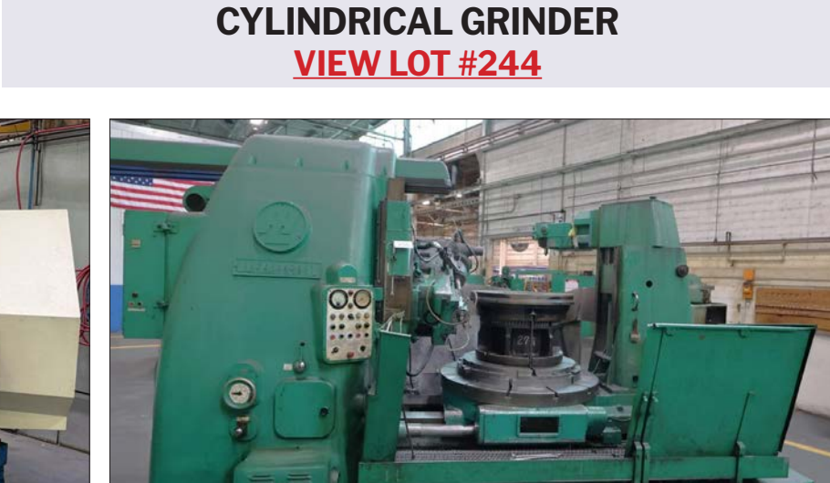
SUPERTEC G60PX150CNC CNC CYLINDRICAL GRINDER VIEW LOT #244