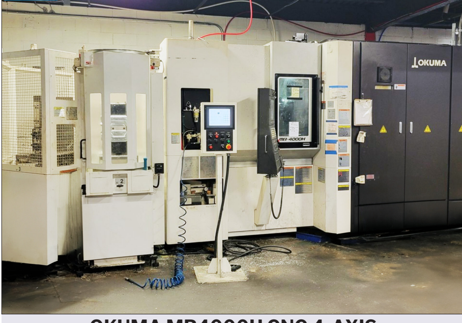
OKUMA MB4000H CNC 4-AXIS HORIZONTAL MACHINING CENTER