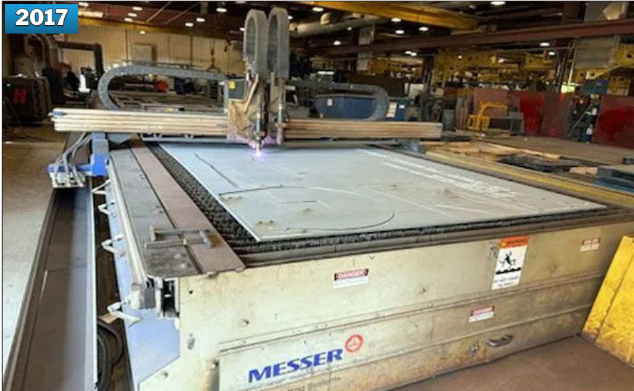
MESSER METALMASTER EVOLUTION PLASMA CUTTING SYSTEM