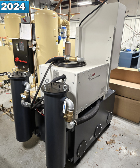
LNS CHIPBLASTER V-40H