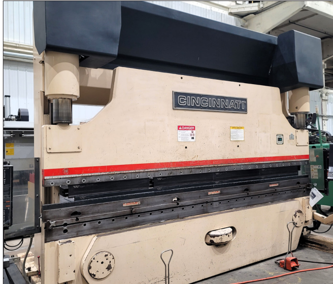
CINCINNATI 175 X 14' MAXFORM 5-AXIS CNC PRESS BRAKE