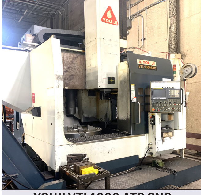
YOUJI VTL1000 ATC CNC VERTICAL BORING MILL