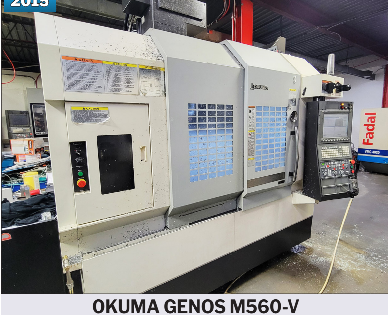
OKUMA GENOS M560-V VERTICAL MACHINING CENTER