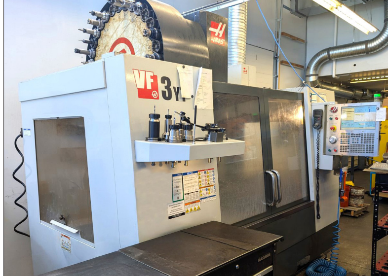
HAAS VF-3YT/50 4-AXIS CNC VERTICAL MACHINING CENTER