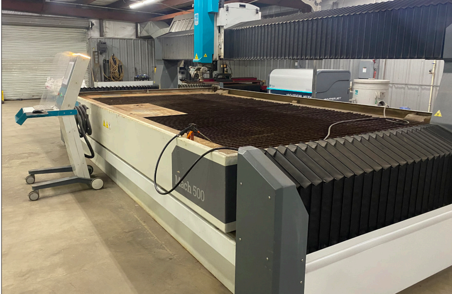
FLOW MACH 500 4020 WATER JET SYSTEM