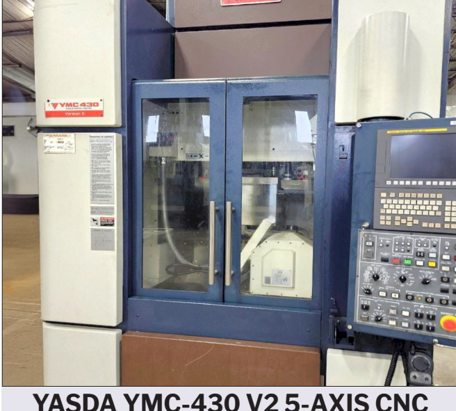
YASDA YMC-430 V2 5-AXIS CNC VERTICAL MACHINING CENTER