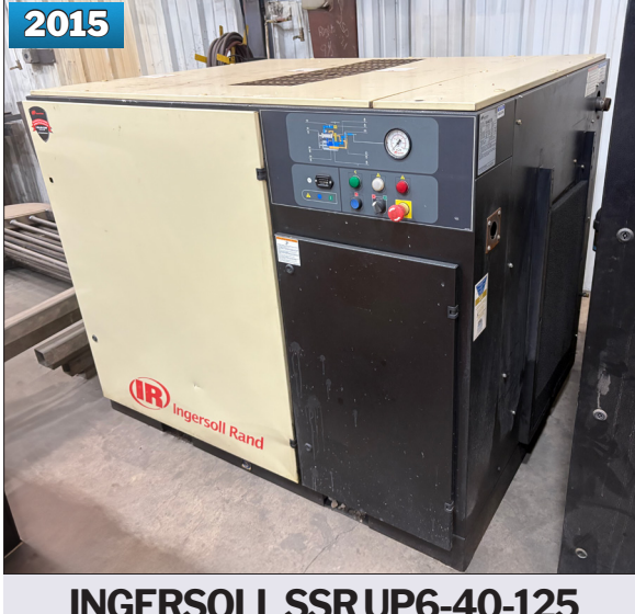
INGERSOLL SSR UP6-40-125 ROTARY SCREW AIR COMPRESSOR