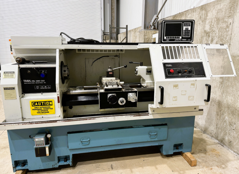
TRAK TRL 1840 CSS TOOLROOM CNC LATHE