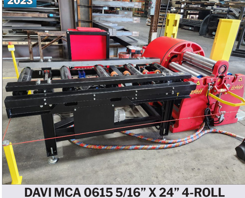
DAVI MCA 0615 5/16" X 24" 4-ROLL HYDRAULIC PLATE ROLL