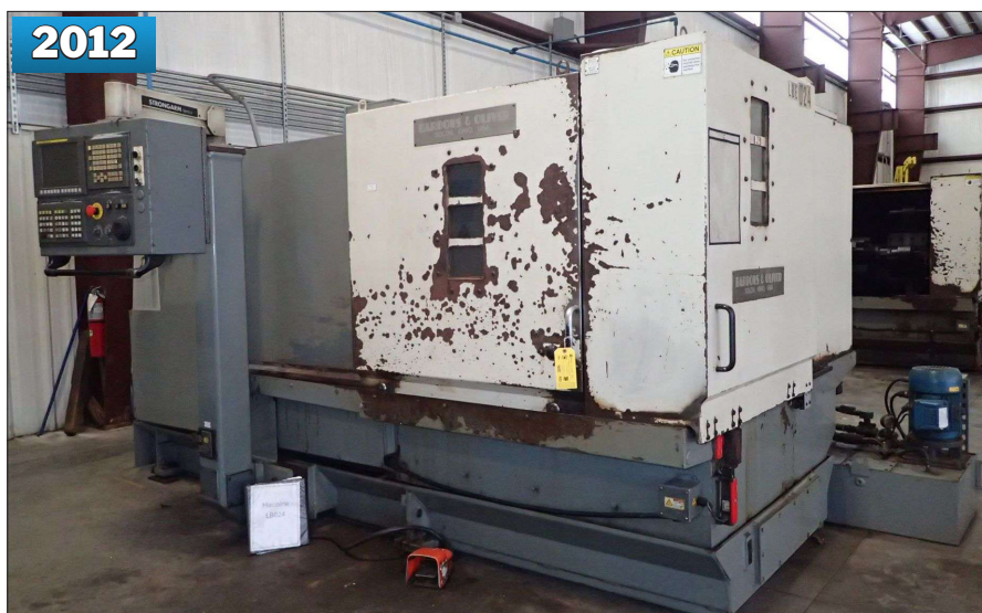
BARDONS & OLIVER 2SC-18 CNC TURNING LATHE