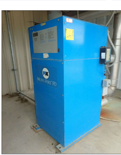
MODU FIRE FD DIRECT VENT / SEALED COMBUSTION BOILER