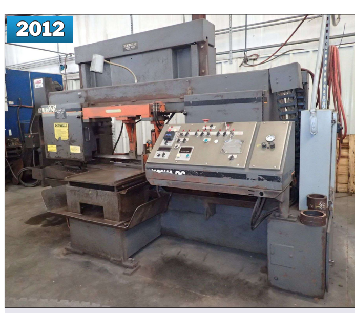
HEM H130-HA-DC AUTOMATIC HORIZONTAL BAND SAW