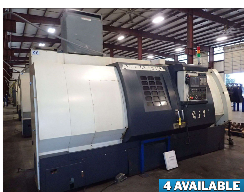
AMERASEICKI CNC-S36L CNC TURNING CENTER