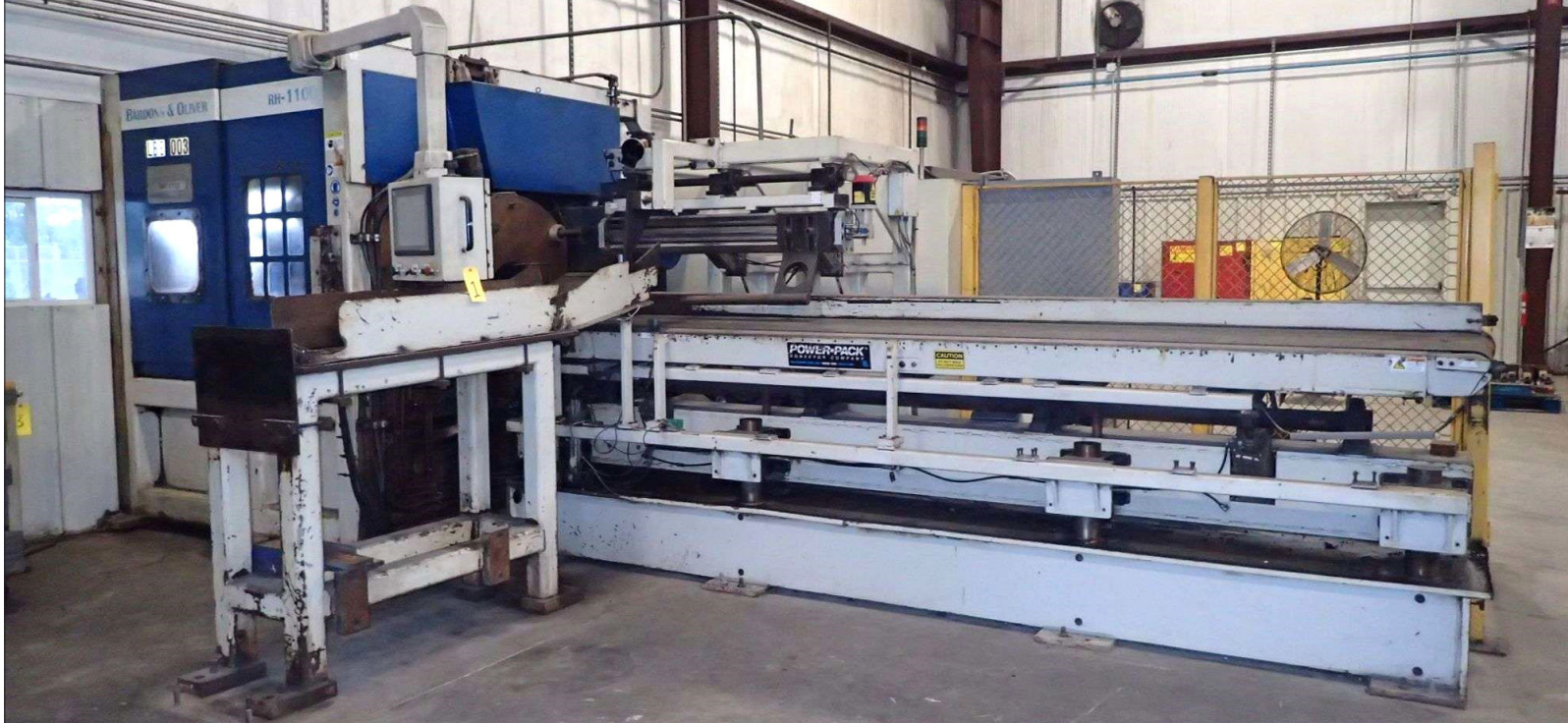
BARDONS & OLIVER RH-1100 ROTATING HEAD CUT-OFF LATHE