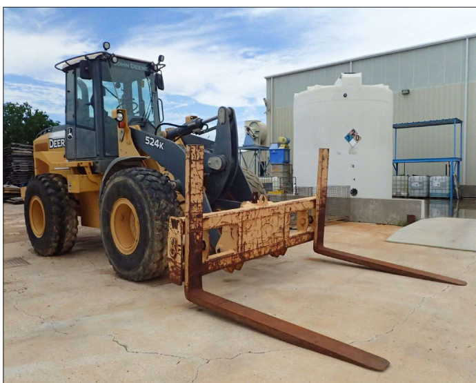
JOHN DEERE 524K FRONT END LOADER