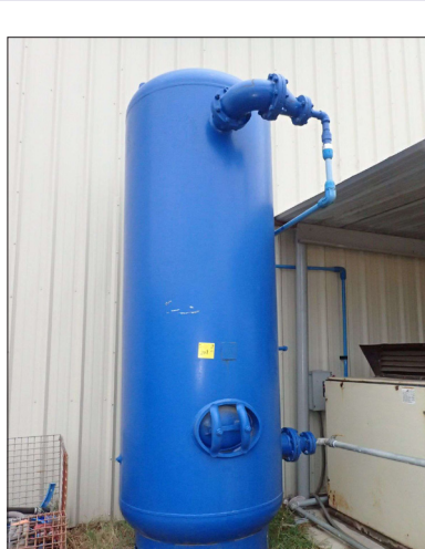
CHESTER AIR HOLDING TANK