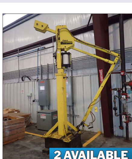
CONCO MODEL LB-300-8 MANIPULATOR