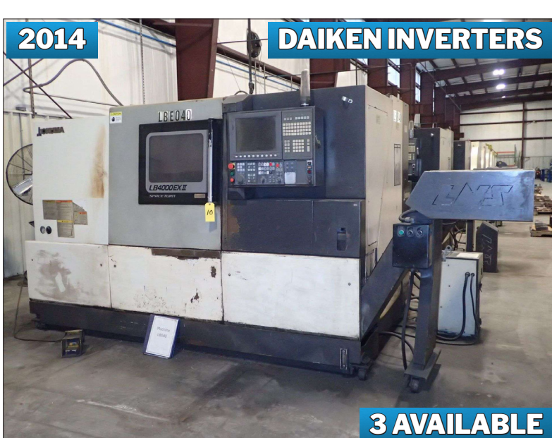
2014 OKUMA LB4000 EX II SPACE TURN CNC TURNING CENTER