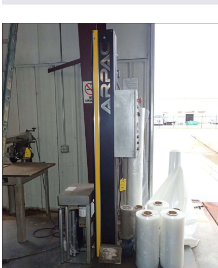
ARPAC PRO-6007-L STRETCH WRAP MACHINE