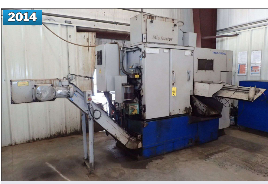
TSUNE MODEL TK5C-200GL AUTOMATIC COLD SAW