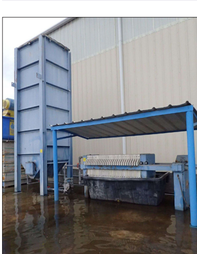
JWI FILTRATION PRESS W/ TANK