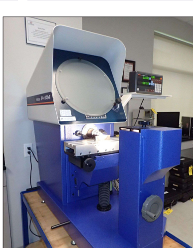
MITUTOYO PH-A14 PROFILE PROJECTOR