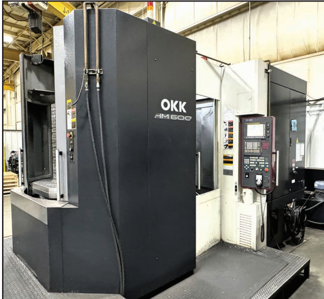
OKK HM 600 4-AXIS CNC HMC