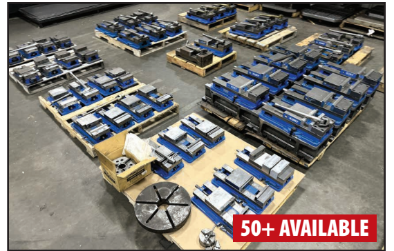
KURT VISES & CHUCKS