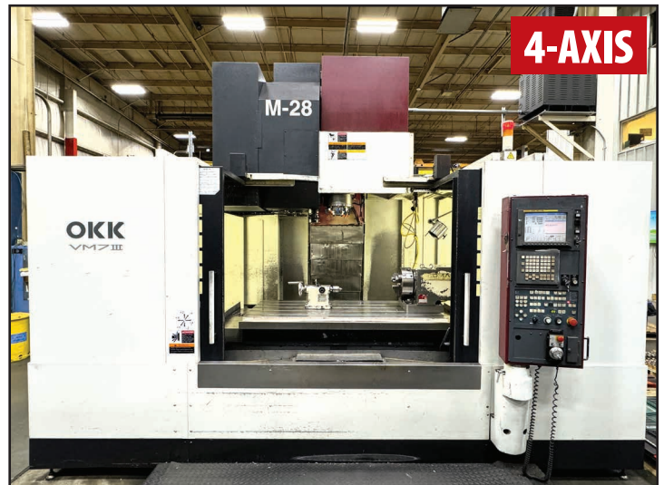
OKK VM7-III VERTICAL MACHINING CENTER