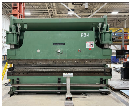
CINCINNATI 230 CBX12 230 TON PRESS BRAKE