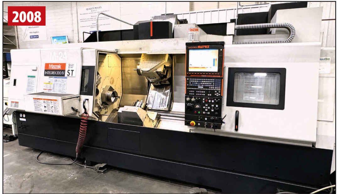
MAZAK INTEGREX 200-IV-ST CNC TURNING & MILLING CENTER

2008 MAZAK QUICK TURN NEXUS 200-II-MY CNC MULTI-TASKING MACHINE , Mazatrol Matrix Nexus CNC Control, 26.5" Swing, 23" Max Machining Length, 2.6" Max. Bar Work, Spindle: 5000 RPM / 30 HP, 12-Station Turret, Live Milling, C-Axis, Y-Axis, Tool Presetter, Tailstock Chip Conveyor, S/N 199630