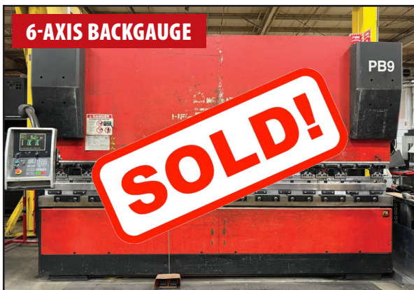
AMADA HFE-220-4-S CNC PRESS BRAKE