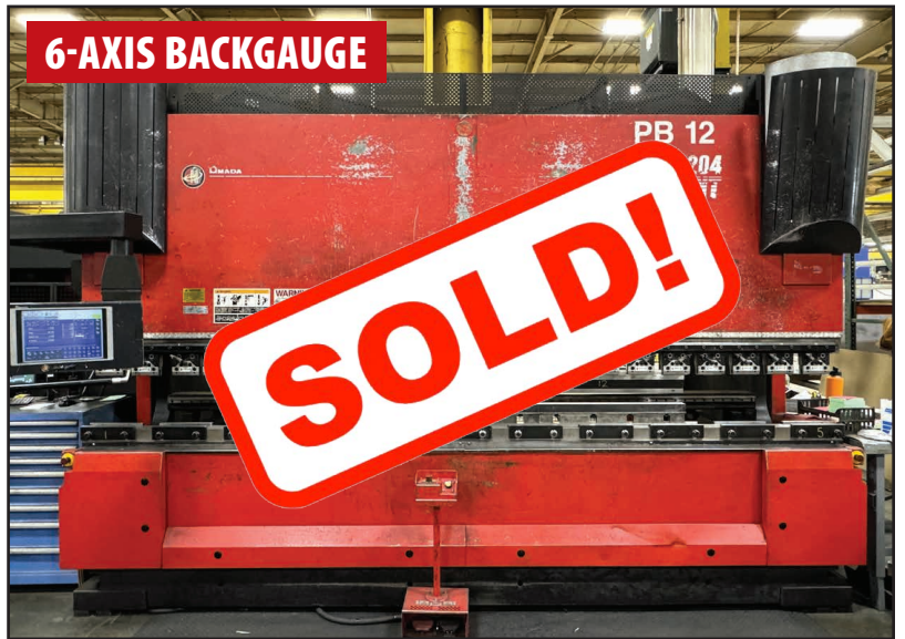
AMADA HDS 2204 NT CNC PRESS BRAKE

CINCINNATI 230 CB X 12 230 TON PRESS BRAKE , (Located in Manitowoc, WI)