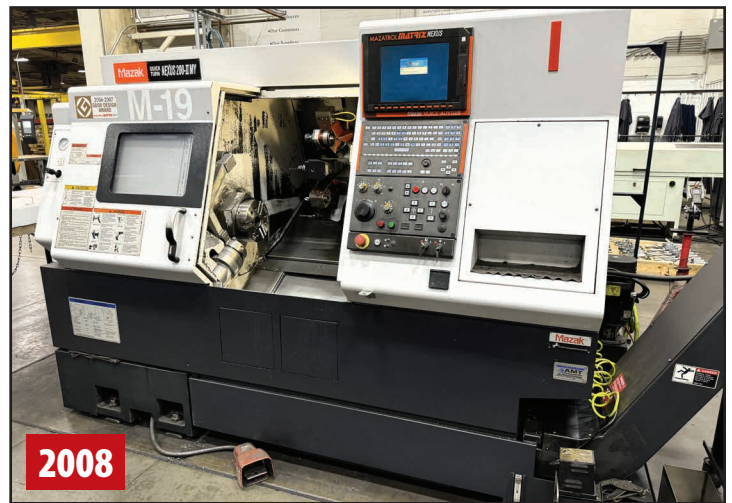
MAZAK QTN 200-II-MY CNC MULTI-TASKING MACHINE

OKK VM5-III 3-AXIS CNC VERTICAL MACHINING CENTER , Neomatic 635V CNC Control, 41" x 22" Table, Travels: X-40", Y-40", Z-20", 6,000 RPM, CAT 50 Taper, 20-Position Automatic Tool Changer, Spindle Chiller, Chip Conveyor, S/N 1352