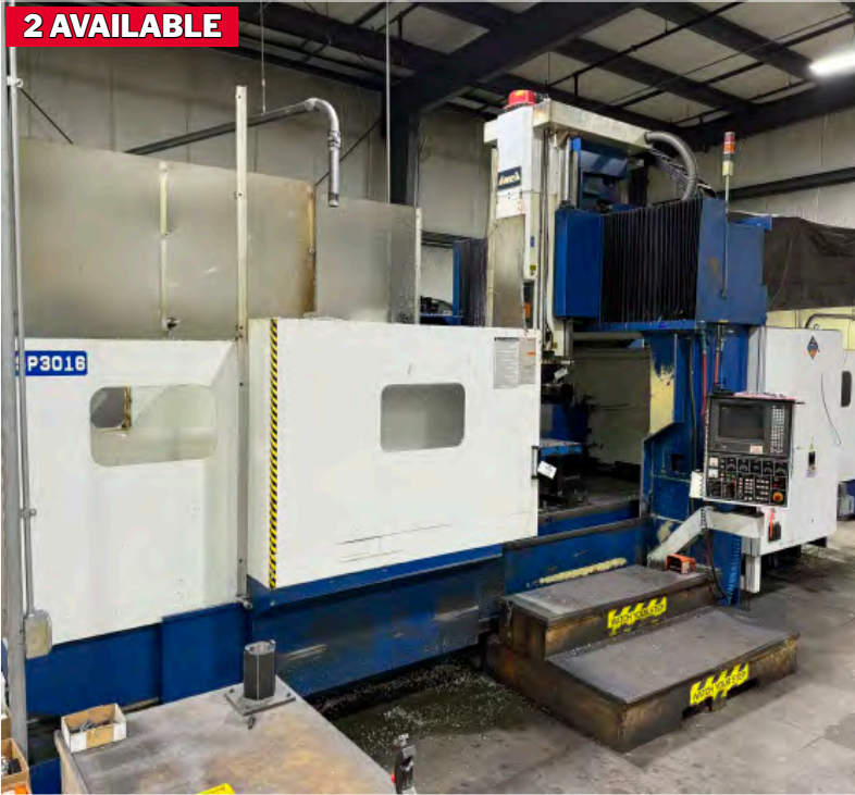
AWEA SP3016 CNC BRIDGE MILLS