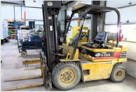
DAEWOO G25S 5000LB CAPACITY PROPANE FORKLIFT TRUCK