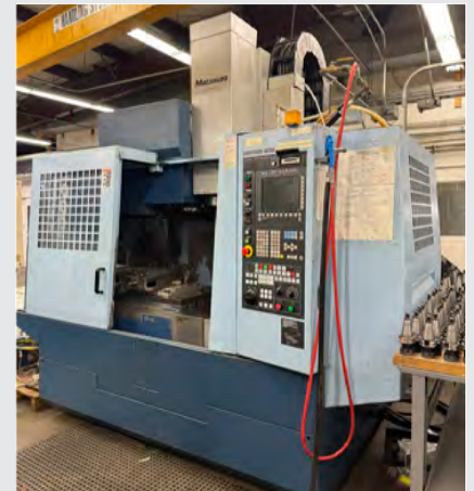
MATSUURA ES1000V CNC VERTICAL MACHINING CENTER