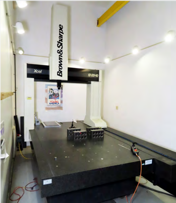
BROWN & SHARPE XCEL 12.20.10 COORDINATE MEASURING MACHINE