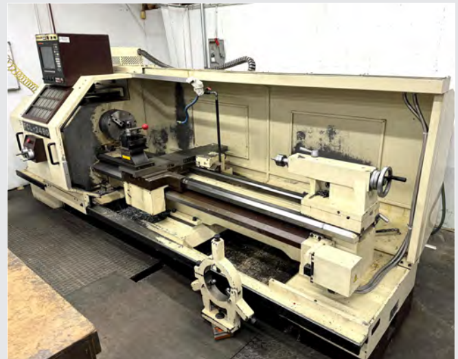
CHEVALIER FCL-2480 CNC LATHE