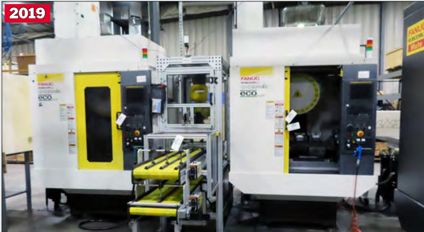
FANUC ROBODRILL CNC MACHINING CELL WITH ROBOT AND PARTS CONVEYOR