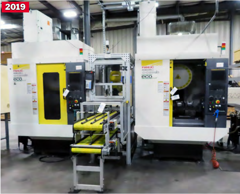
FANUC ROBODRILL CNC MACHINING CELL WITH ROBOT AND PARTS CONVEYOR