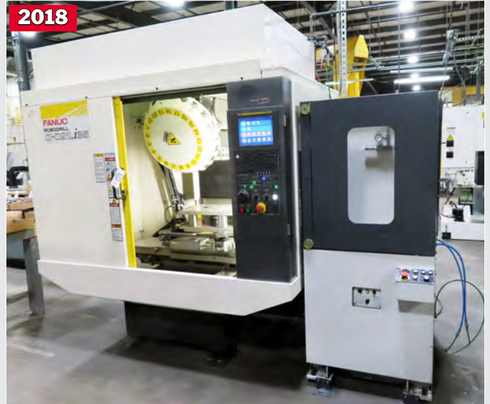
FANUC ROBODRILL ALPHA-D21LiB5 CNC VERTICAL MACHINING CENTER