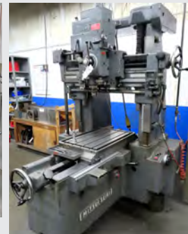
MITSUI SEIKI J4B DOUBLE COLUMN JIG BORING