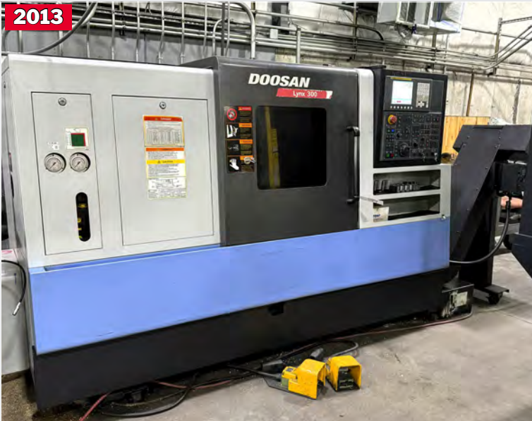
DOOSAN LYNX 300 CNC LATHE