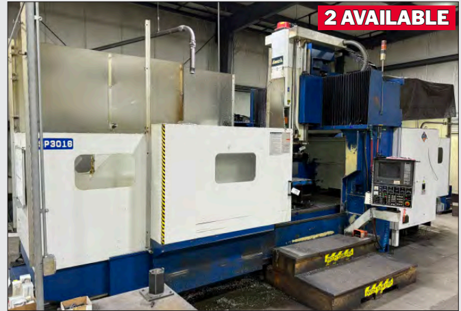
AWEA SP3016 CNC BRIDGE MILLS