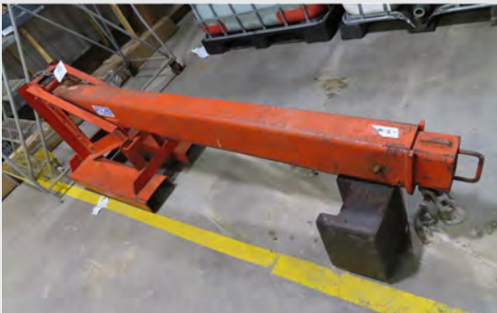
WESCO FORKLIFT JIB