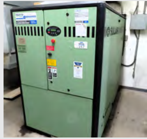
SULLAIR 5500V/A ROTARY SCREW TYPE AIR COMPRESSOR