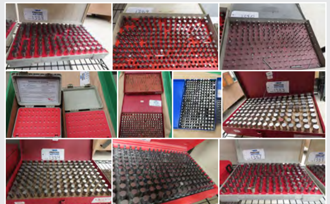
PIN GAUGE SETS