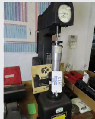
WILSON HARDNESS TESTER