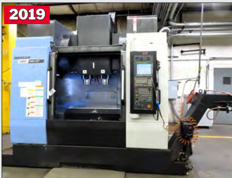
DOOSAN DMP500/2SP TWIN SPINDLE CNC VERTICAL MACHINING CENTER