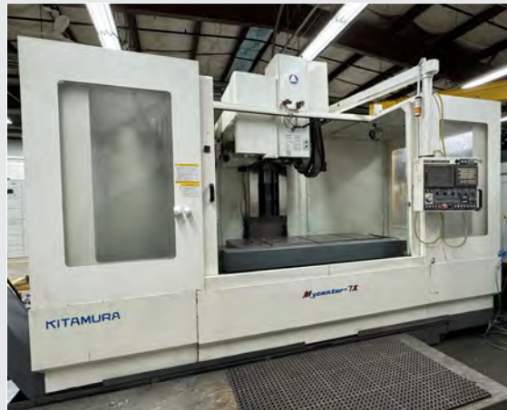
KITAMURA MYCENTER 7X CNC VERTICAL MACHINING CENTER