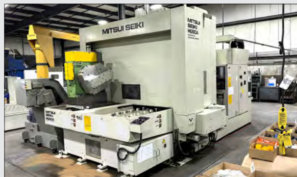
MITSUI SEIKI HU80A 5-AXIS CNC HORIZONTAL MACHINING CENTER