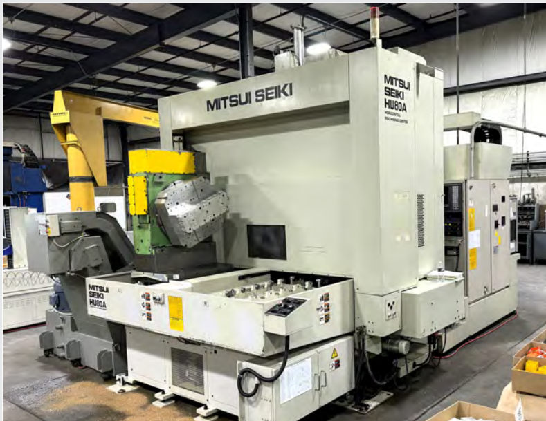
MITSUI SEIKI HU80A 5-AXIS CNC HORIZONTAL MACHINING CENTER