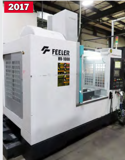
FEELER METHODS HV1000 CNC VERTICAL MACHINING CENTER