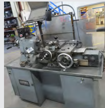
HARDINGE HC AUTOMATIC CHUCKER

OKUMA & HOWA VMP10 5-AXIS DOUBLE COLUMN VERTICAL MACHINING CENTER , Fanuc 15M CNC Control, 2-Axis Swivel Spindle, 64.96" x 39.37" Travels, 36" Built-In Rotary Table, Swivel Spindle, 30 ATC, 50 Taper, S/N: 701