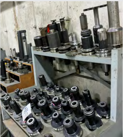
BT 40 & 50 TAPER TOOL HOLDERS