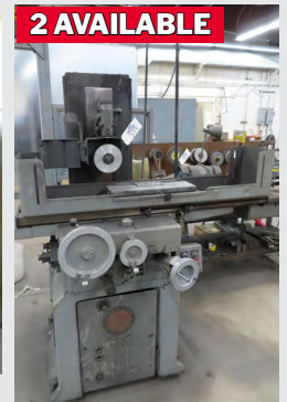
REID SURFACE GRINDERS