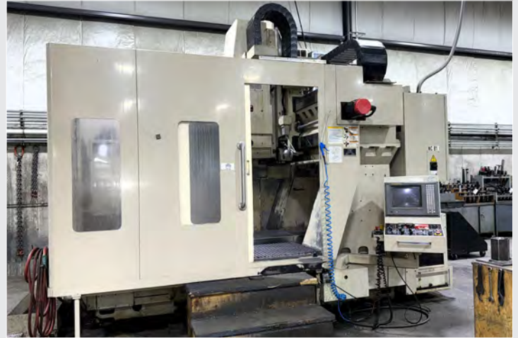
OKUMA HOWA VMP10 5-AXIS DOUBLE COLUMN VERTICAL MACHINING CENTER

1997 AWEA SP3016 CNC BRIDGE MILL , Fanuc 0-M CNC Control, 120.5" x 63" x 30" Travels, 118" x 59" Table, 22,000 Lb. Max. Work Weight, 66.9" Between Columns, 9.4" - 39.4" Spindle Nose-Table Top, 6000 RPM, 50 Taper, 32-Position Automatic Tool Changer, Chip Conveyor, S/N: 7193