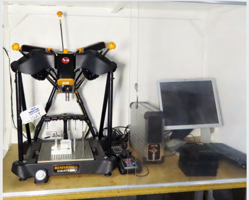
RENISHAW EQUATOR BENCH TYPE COORDINATE MEASURING MACHINE