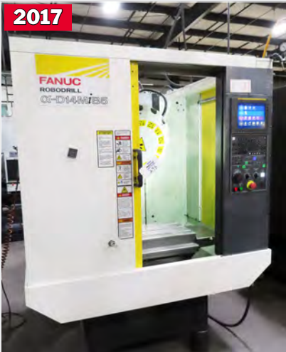
FANUC ROBODRILL ALPHA-D14MiB5 CNC VERTICAL MACHINING CENTER