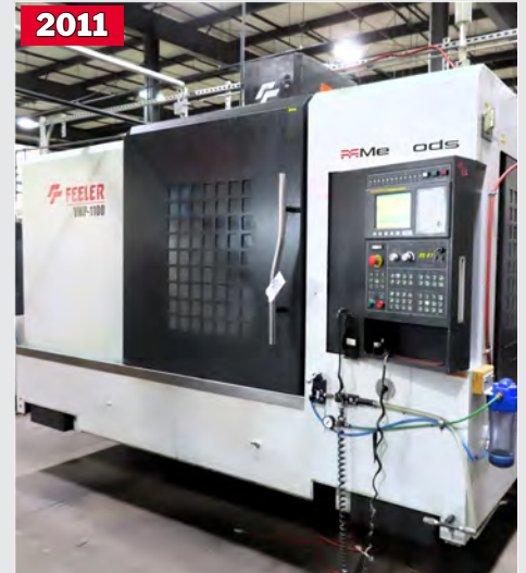
FEELER METHODS HV1000 CNC VERTICAL MACHINING CENTER