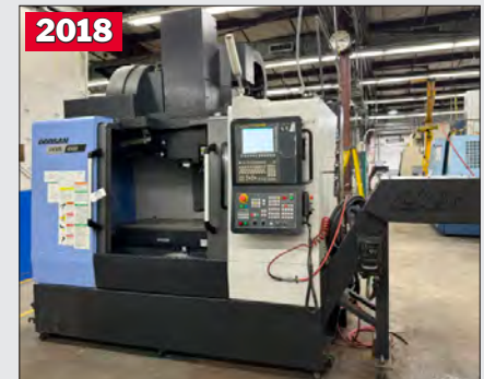
DOOSAN DNM4500 CNC VERTICAL MACHINING CENTER

PRESTIGE EQUIPMENT AUCTIONS 35 Pinelawn Road, Suite 203W, Melville, NY 11747 Phone: 631-249-5566 auctions@prestigeequipment.com www.prestigeequipment.com