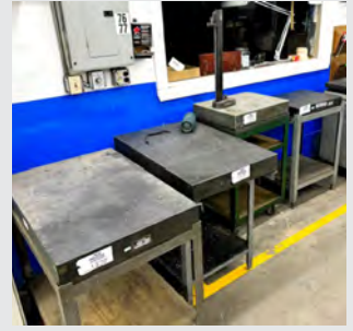
GRANITE SURFACE PLATES