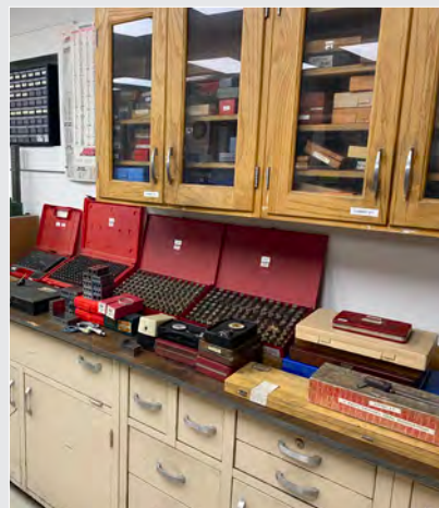
VIEW OF INSPECTION EQUIPMENT ROOM