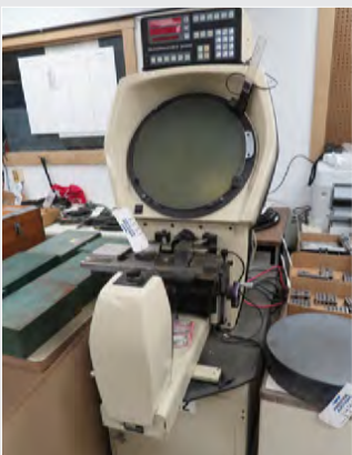
S-T INDUSTRIES 14" BENCH TYPE OPTICAL COMPARATOR