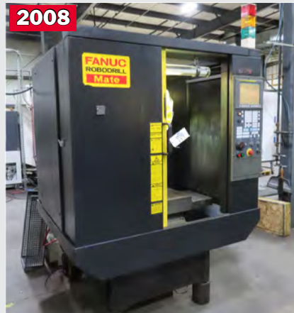
FANUC ROBODRILL-MATE CNC VERTICAL MACHINING CENTER