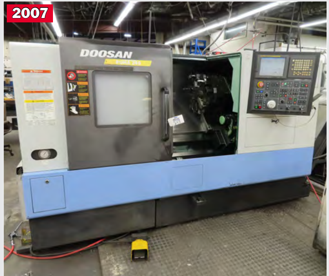
DOOSAN PUMA 240C CNC LATHE

1998 CHEVALIER FCL-2480 CNC LATHE , 24" Swing Over Bed, 78.7" Between Centers, 14.5" Swing Over Cross Slide, 12" Chuck, 3.125" Spindle Bore, Tool Post, Tailstock, Anilam 4200T CNC Control