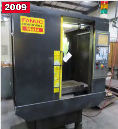
FANUC ROBODRILL-MATE CNC VERTICAL MACHINING CENTER