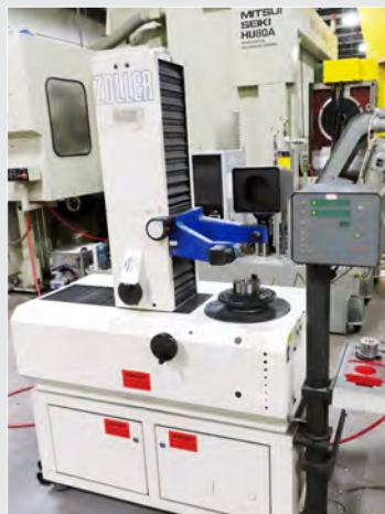
ZOLLER TOOL PRESETTER