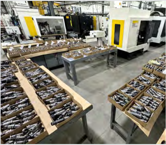
BT 30 TAPER TOOL HOLDERS