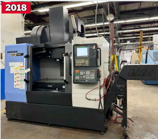
DOOSAN DNM4500 CNC VERTICAL MACHINING CENTER