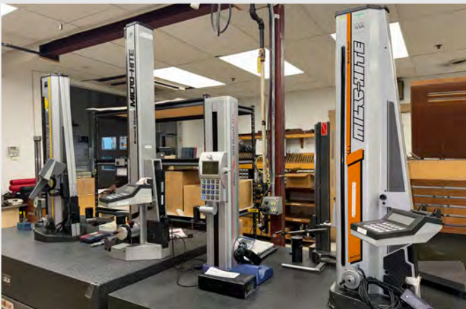
VIEW OF HEIGHT GAUGES