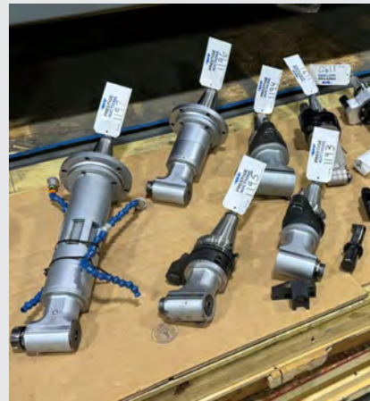
RIGHT ANGLE HEADS