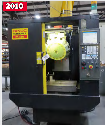
FANUC ROBODRILL-MATE CNC VERTICAL MACHINING CENTER