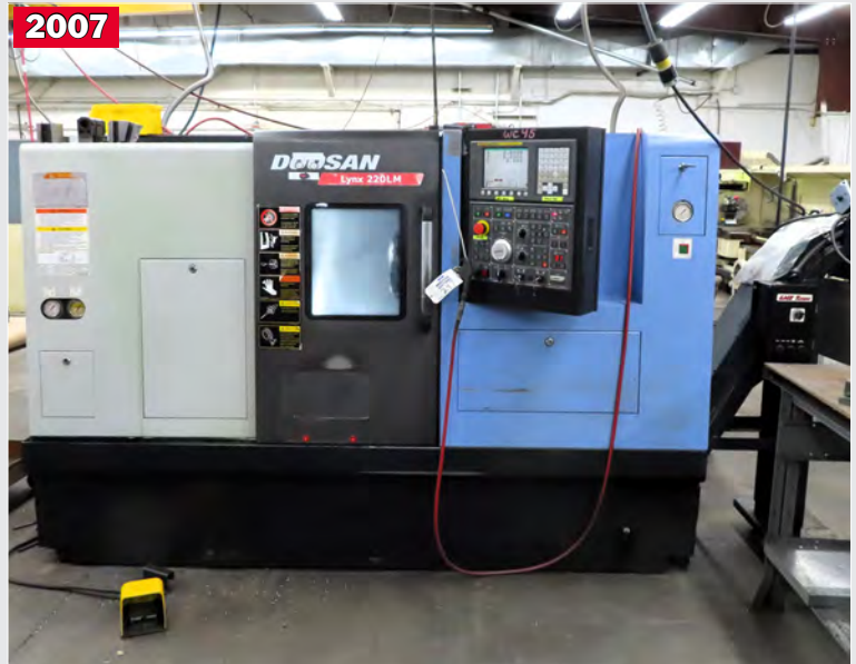
DOOSAN LYNX 220LMA CNC TURNING CENTER WITH LIVE MILLING