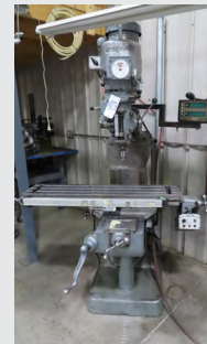
BRIDGEPORT VERTICAL MILLING MACHINE