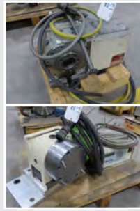
TSUDAKOMA 4TH AXIS ROTARY INDEXERS