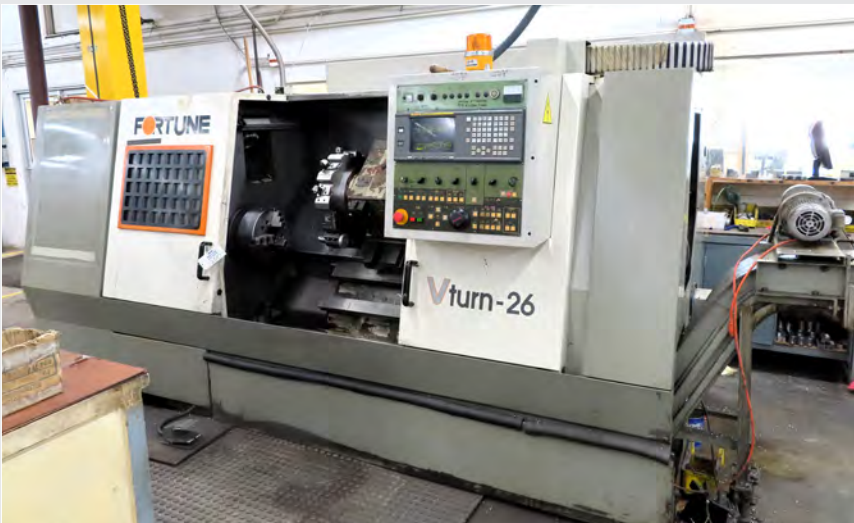
FORTUNE VTURN 26 CNC LATHE