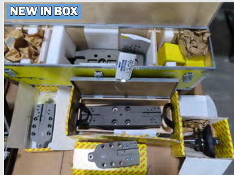
SANDVIK COREBORE TOOL