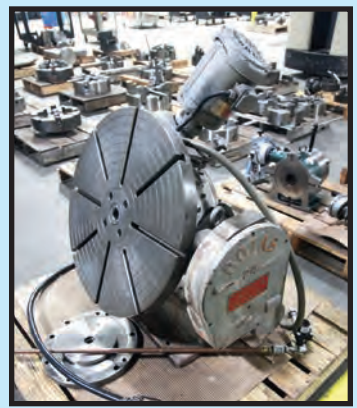
24" ROTAB ROTARY TABLE (TO BE SOLD DAY 1)

MATERIAL HANDLING - DAY 2 WIDE SELECTION OF ELECTRIC HOISTS, up to 2 T.