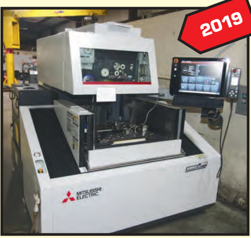
MITSUBISHI MDL. MV1200S ADVANCE TYPE M800 WIRE EDM MACHINE

DOALL G-10, 8" x 18" electromagnetic chuck, S/N 310-511514.