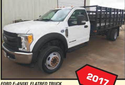
FORD F-450XL FLATBED TRUCK

BALDOR DOUBLE END GRINDERS; BLAST BOOTH; BELT AND DISC GRINDERS; HEAVY DUTY BOTTLE JACKS UP TO 30 T.; ROTARY TABLES.