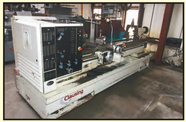
CLAUSING 18" X 80" MDL. V460 ENGINE LATHE