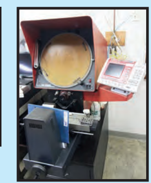
STARRETT AE400 COMPARATOR