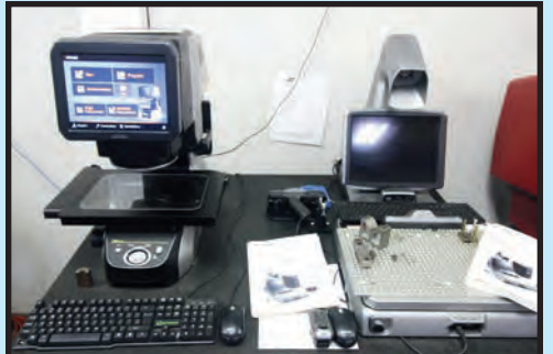
KEYENCE MEASURING MACHINES