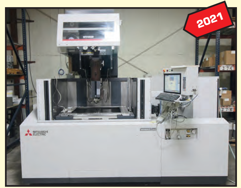
MITSUBISHI MDL. MV4800 ADVANCE TYPE 2 WIRE EDM MACHINE