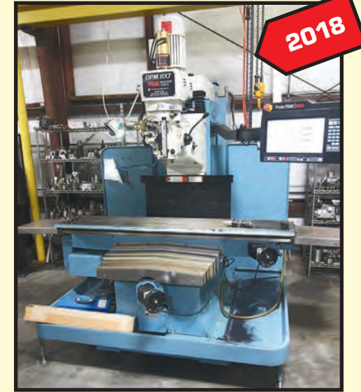
TRAK MDL. DPMRX7 TOOLROOM BED MILL