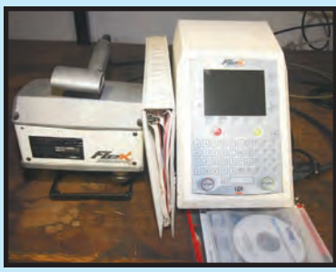
DAPRA FLEXMARK MARKING MACHINE