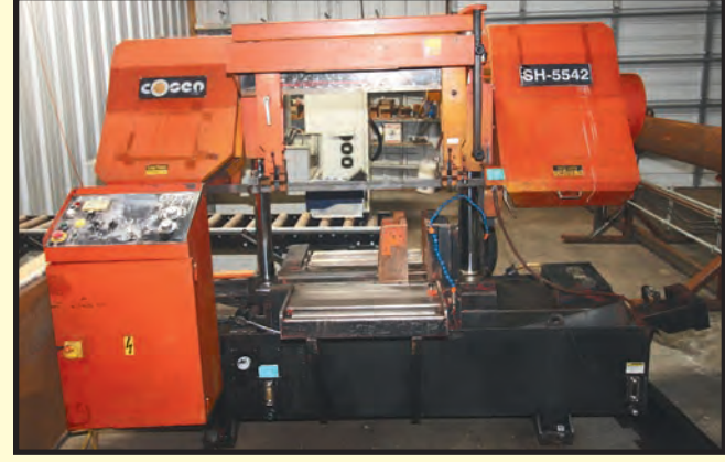
COSEN MDL. SH-5542 SEMI-AUTOMATIC HORIZONTAL BANDSAW

GURUTZPE TIMEMASTER MDL. SUPER RT/API , 10" spdl. bore, 32" sw. x 118" btwn. centers, front and rear chucks, taper attach., Newall 2-axis D.R.O., steadyrest, follower rest, 9 – 500 RPM.