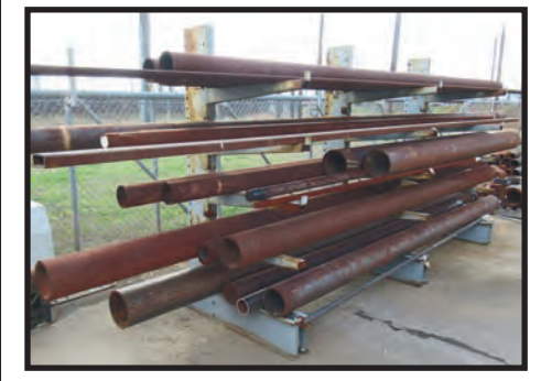
RAW MATERIAL WIDE SELECTION OF STAINLESS AND MISC. BAR STOCK AND ASSORTED PIPE.