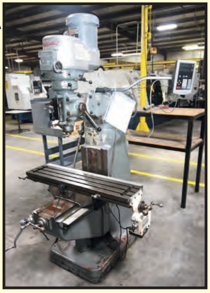
BRIDGEPORT SERIES 1 VERTICAL TURRET MILL