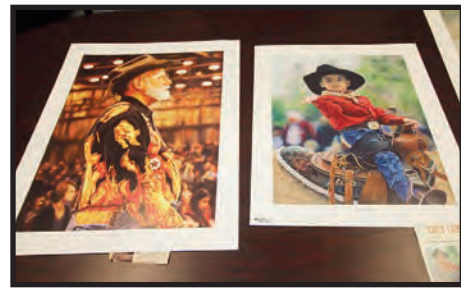
ARTWORK, PHONE SYSTEM & OFFICE FURNITURE COLLECTION OF HOUSTON LIVESTOCK SHOW AND RODEO AWARD WINNING ARTWORK; AVAYA PHONE SYSTEM; DESKS, TABLES; CHAIRS; COMPUTERS; MONITORS; ETC.