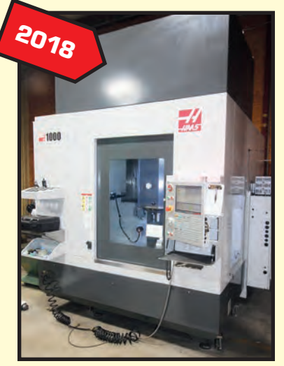
HAAS MDL. UMC-1000 5-AXIS UNIVERSAL MACHINING CENTER