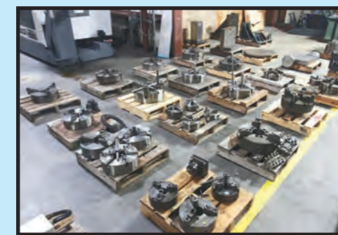
PRECISION MACHINE ACCESSORIES