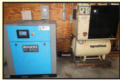
15 HP INGERSOLL RAND AND 20 HP ROGERS ROTARY SCREW AIR COMPRESSORS