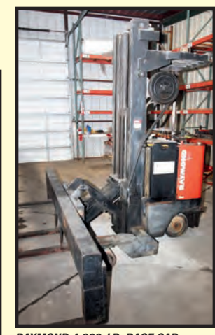
RAYMOND 4,000-LB. BASE CAP. ELECTRIC FORKLIFT