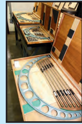
O.D. MIC SETS