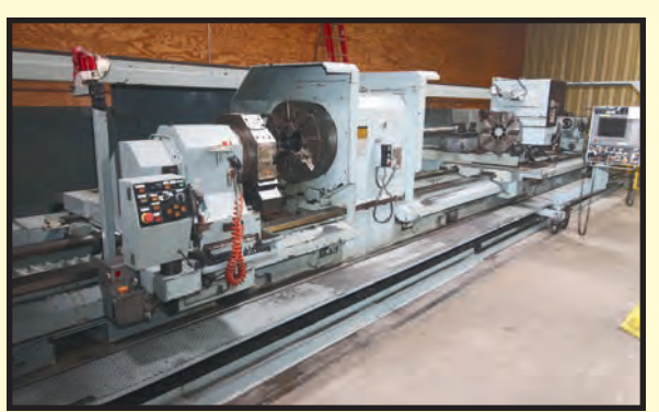
IKEGAI MDL ANC56 CNC CENTER DRIVE/DUAL TURRET HOLLOW SPINDLE LATHE

IKEGAI MDL. ANC56 , new 2000, (installed new in crate in 2014), Fanuc 18T CNC control, 10" bore 60 HP center drive headstock, 42" sw. x 240" btwn. centers right side cap., 36" sw. x 157" left side cap., (1) programmable and (1) manual tailstock, 490" max. part length, steadyrests, chip conveyor, coolant system, S/N A574X3040V (5,235 Cut time hours).