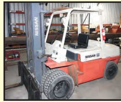
NISSAN 9,000-LB. BASE CAP. DIESEL FORKLIFT

GORBEL FREE STANDING GANTRY CRANE SYSTEM