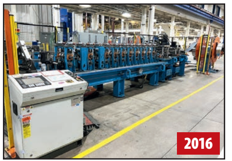
SAMCO 10-STAND ROLL FORMING LINE (TRACK MILL)

2016 SAMCO 6-STAND ROLL FORMING LINE, s/n 9461, w/ 2" Shafts, 4.5"–9.5" Vertical Centers, 13.5" Horizontal Centers, 11" Max. Strip Width, 14-Gauge, 20 HP Drive, NOTE: Shrinker Line