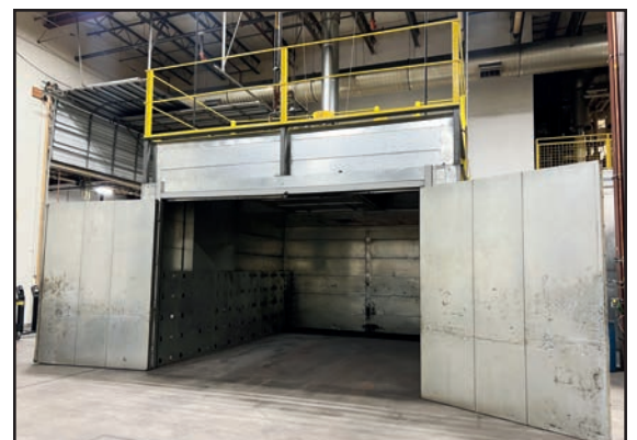
ROHNER 20'L X 15'W CURE OVEN

INSPECTION Tuesday, November 7 & Wednesday, November 8, By Appointment Only