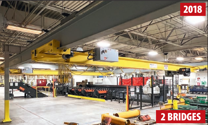
ACE GAFFEY 3-TON FREE STANDING CRANE SYSTEM

INSPECTION Tuesday, November 7 & Wednesday, November 8, By Appointment Only