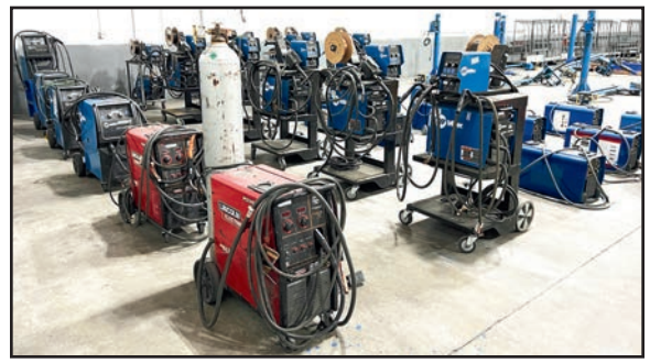
ASSORTED WELDING POWER SUPPLIES