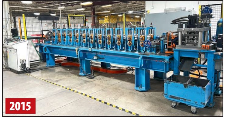
SAMCO 12-STAND ROLL FORMING LINE (CHORD)