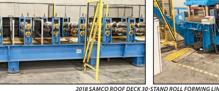
2018 SAMCO ROOF DECK 30-STAND ROLL FORMING LINE

View our current auction schedule at www.perfectionindustrial.com