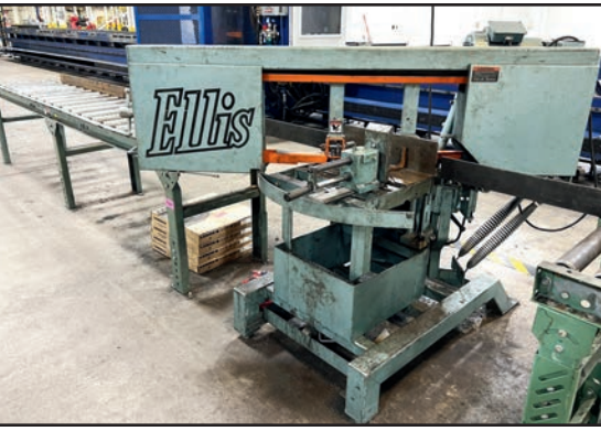
ELLIS 1800 MITERING BANDSAW