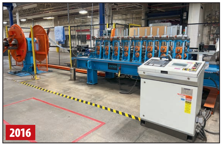
SAMCO 8-STAND ROLL FORMING LINE, S/N 9505 (BRACE LINE)