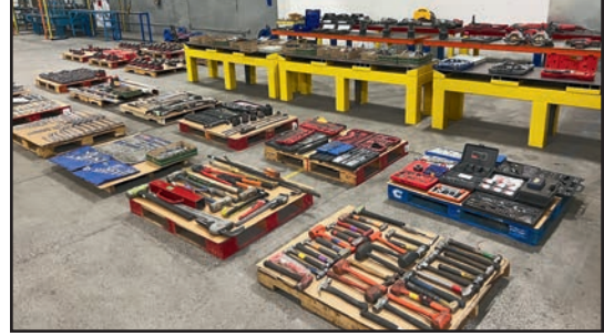
POWER AND HAND TOOLS

LARGE QUANTITY OF IT EQUIPMENT, 85" AND 75" SMART SCREENS, ACER AND DELL MONITORS, COMPUTERS, FLAT SCREEN MONITORS, PRINTERS, SCANNERS, HP T630 THIN CLIENT COMPUTERS, AND MORE