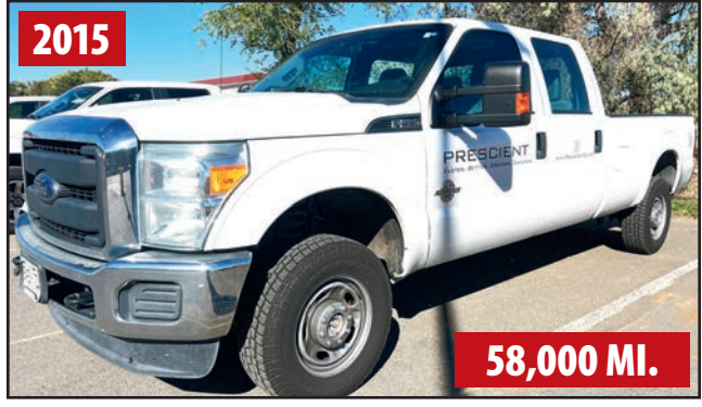
FORD F-350 POWER STROKE 4WD TRUCK