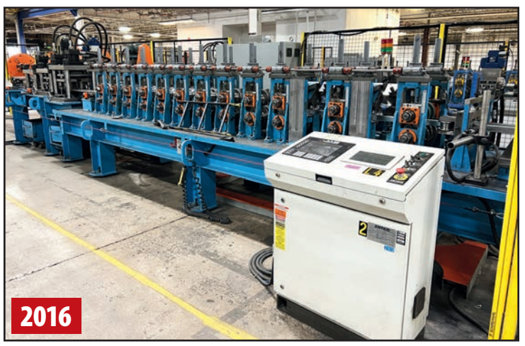
SAMCO 12-STAND ROLL FORMING LINE (STUD 2-B LINE)