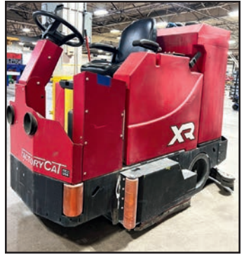
FACTORY CAT XR 40-C FLOOR SCRUBBER