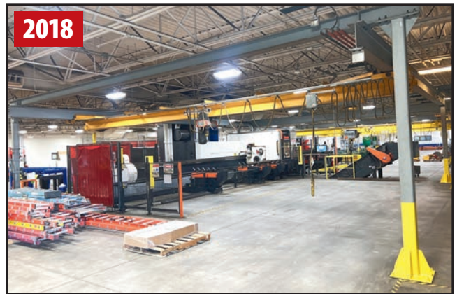
HS 1.5-TON CRANE SYSTEM