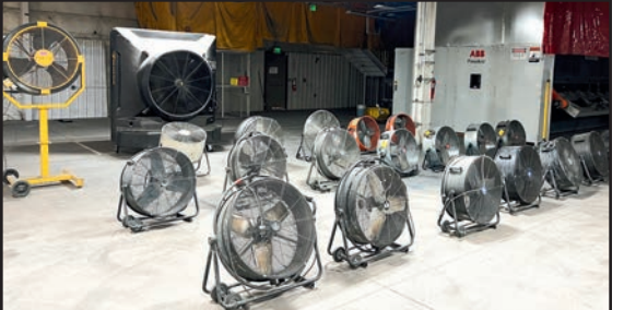
EVAPORATIVE COOLER AND SHOP FANS