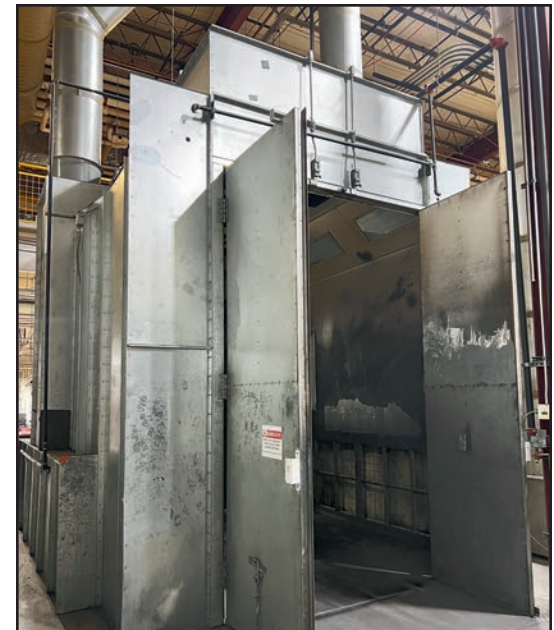
COL-MET 15'L X 12'W PAINT BOOTH

An 18% Buyer's Premium will be charged on all assets purchased by buyers providing full payment is made within 48 hours following the sale. Acceptable forms of payment are cashier's check, company check (with bank letter of guarantee) or wire transfer within 48 hours of the sale close. For any Buyers failing to pay within the 48 hour stated payment period, the Buyer's Premium will be increased to 20%. All invoices paid with a credit card are subject to a 20% Buyer's Premium. Everything will be sold to the highest bidder, in accordance with the Auctioneer's customary "Terms of Sale", copies of which will be posted on the Auctioneer's website and subject to additional terms announced the day of sale. All litems are sold "As is, Where is" without any warranty, express or implied.