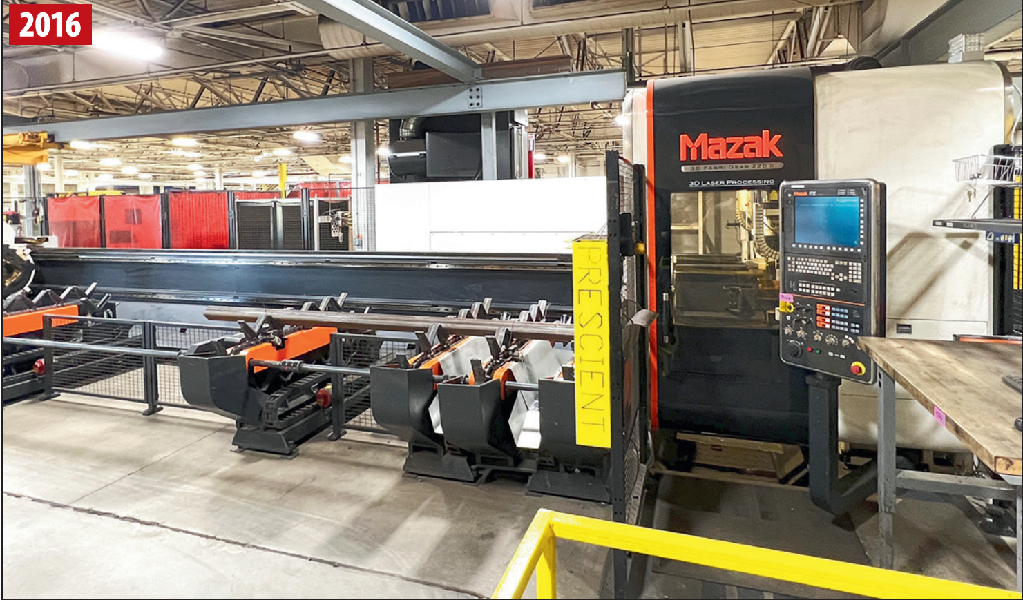
MAZAK 3D FABRIGEAR 220 II (4K GEN 2) TUBE LASER

COMPLETE CATALOG & INFORMATION AVAILABLE: https://perfection.global/prescient