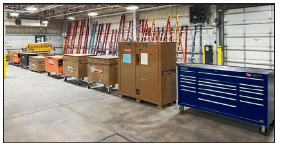
ASSORTED JOB BOXES, TOOL CHESTS AND LADDERS