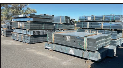
HUGE QUANTITY OF ASSORTED TUBE AND CHANNEL STOCK