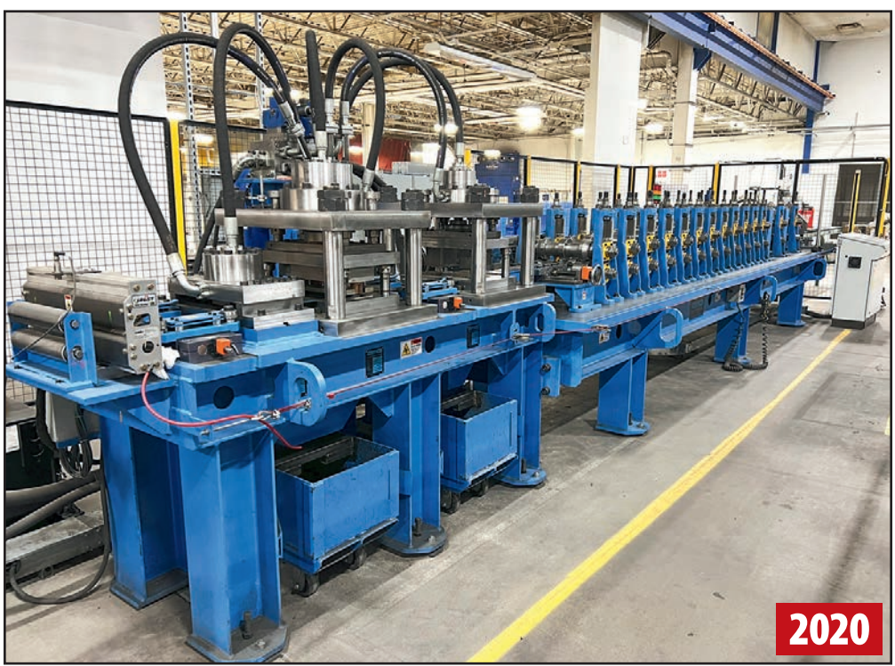
SAMCO 14-STAND ROLL FORMING LINE (ENLARGED STUD 3.5"–6" LINE)