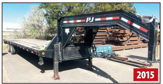
PJ TRAILERS T/A GOOSENECK TRAILER

INSPECTION Tuesday, November 7 & Wednesday, November 8, By Appointment Only