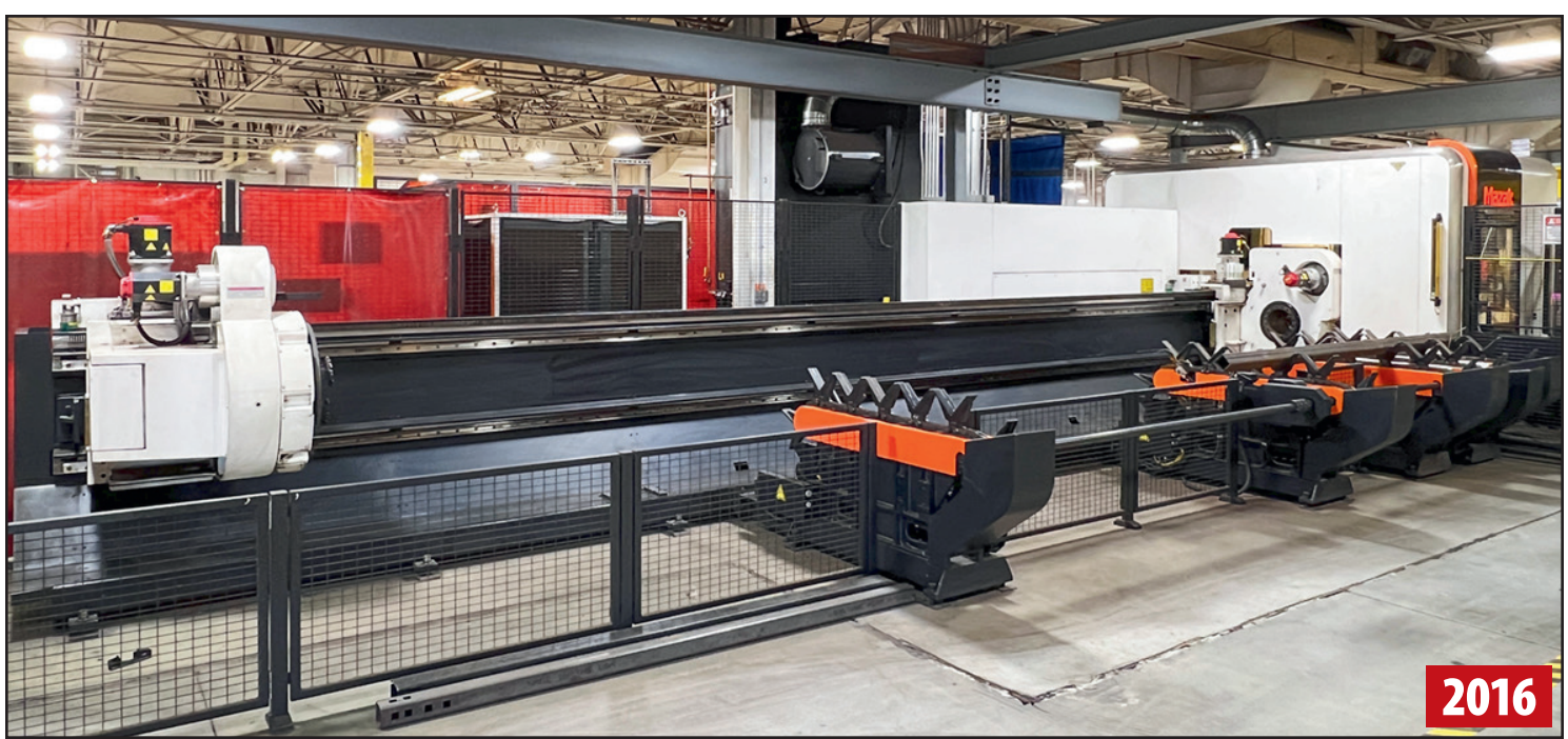
MAZAK TUBE LASER-LEFT VIEW