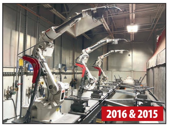
ABB WELD CELL-INTERIOR VIEW