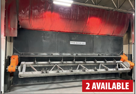
ABB FLEXARC (3) ROBOT X 18' TRUNNION ROBOTIC WELDING CELL