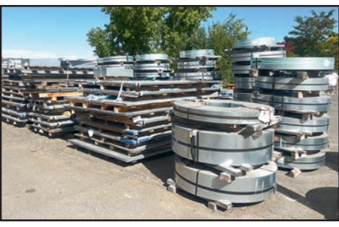
ASSORTED COIL AND SHEET STOCK

COMPLETE CATALOG & INFORMATION AVAILABLE: https://perfection.global/prescient