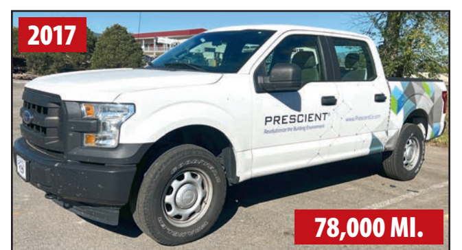
FORD F-150 XLT 4WD TRUCK