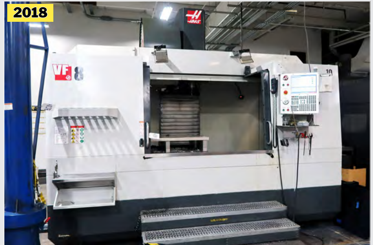
2018 HAAS VF8/40 CNC VERTICAL MACHINING CENTER