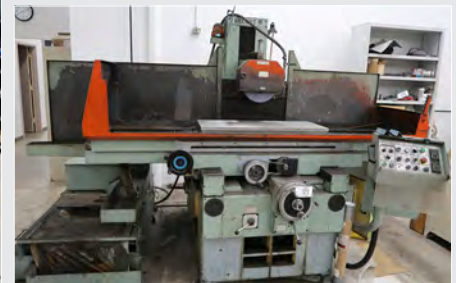
16" X 40" REGENT YSC 1640 AHD HORIZONTAL SURFACE GRINDER