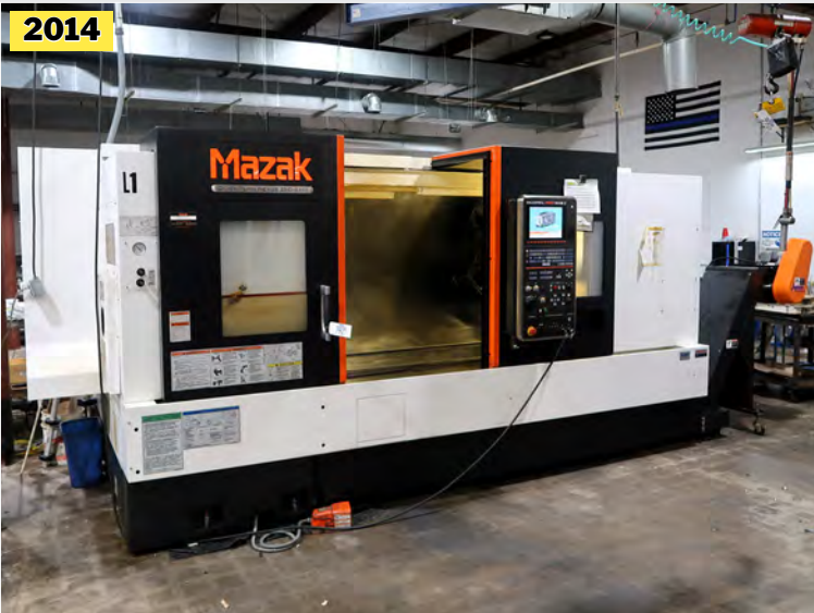
MAZAK QUICK TURN NEXUS 350-11 MY CNC TURNING CENTER