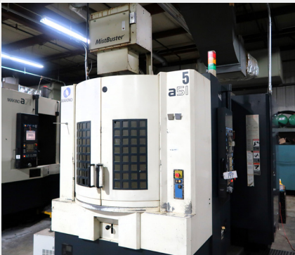
MAKINO A51/A40 CNC HORIZONTAL MACHINING CENTER