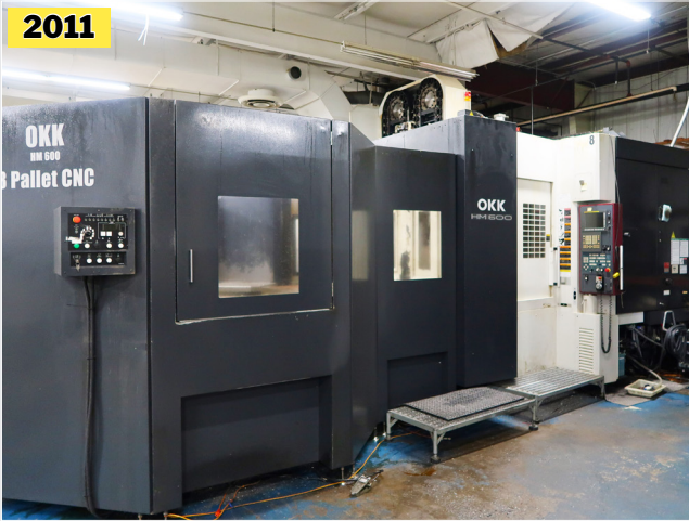
OKK HM600 8APC CNC HORIZONTAL MACHINING CENTER