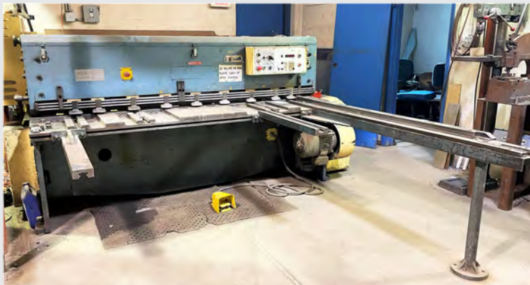
AMADA M2060 78.74" X 1/4" SHEAR