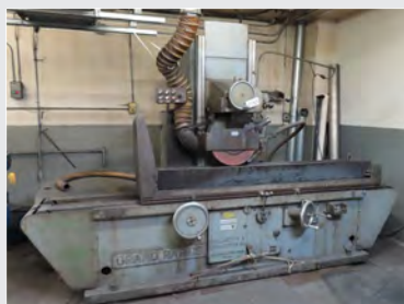
GALLMEYER & LIVINGSTON A 18" X 48" AUTO FEED SURFACE GRINDER