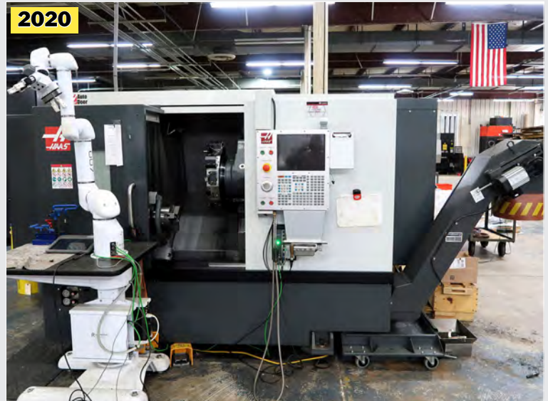
HAAS ST-20 CNC TURNING CENTER