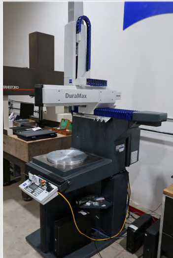
ZEISS DURAMAX 5/5/5 COORDINATE MEASURING MACHINE