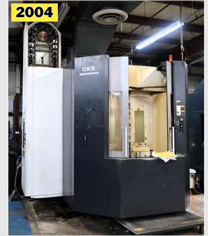
OKK HM600 CNC HORIZONTAL MACHINING CENTER