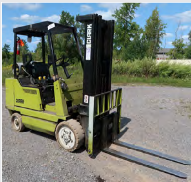
CLARK GCX-25 FORKLIFT

HYD-MECH S-20 SERIES III HORIZONTAL BAND SAW, 13" x 18" Capacity, 1" Blade, 45-330 sfm, Swing Head for Mitering, Roller Conveyor, 3 HP Motor, 240v/60HZ/3PH, FLA-10, S/N: 6B02162130