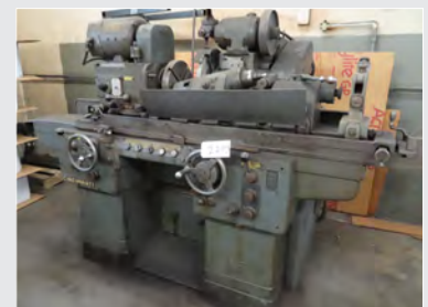
CINCINNATI 10" X 24" CYLINDRICAL GRINDER