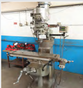
BRIDGEPORT 2HP KNEE TYPE VERTICAL MILLING MACHINE