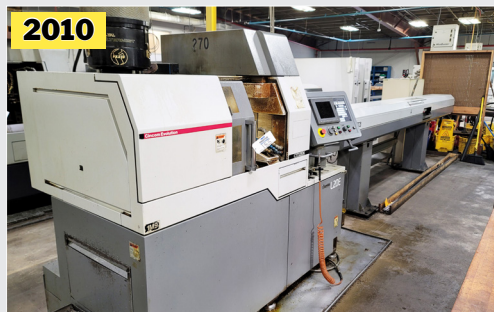
CITIZEN L20E 1X CNC SWISS TURNING LATHE