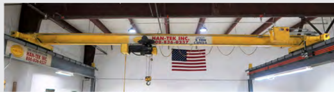
HAN-TEK 2 TON X 26'4' SPAN CRANE SYSTEM