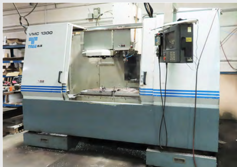
TREE VMC-1300/20 CNC VERTICAL MACHINING CENTER

FAIR FRIEND ENTERPRISE FV-800 CNC VERTICAL MACHINING CENTER , with BT-40 Taper Spindle, FANUC Series O-M CNC Control Panel, 18-Position Automatic Tool Changer, 18" x 36" Table, S/N VD022 (as is)