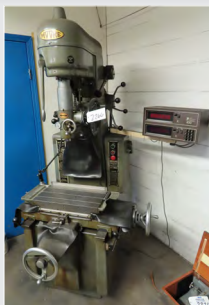
MOORE NO. 1-1/2 JIG BORER