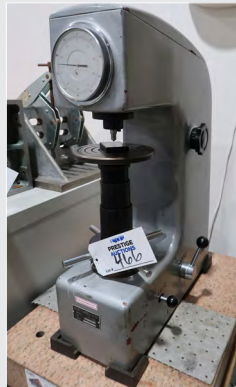
ROCKWELL HR-150A HARDNESS TESTER