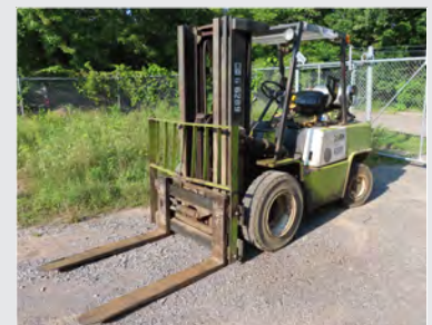
CLARKLIFT L500-YS80 6,900LB. FORKLIFT TRUCK