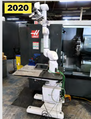
2020 PRODUCTIVE ROBOTICS 0B7 COLLABORATIVE ROBOT