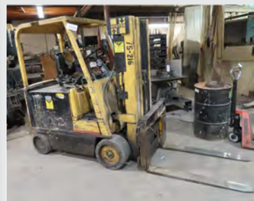
HYSTER E50B 5,000LB. FORKLIFT TRUCK