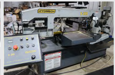
HYD-MECH S-20 SERIES III HORIZONTAL BAND SAW