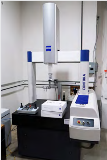
ZEISS G2 CONTURA 7/7/6 COORDINATE MEASURING MACHINE