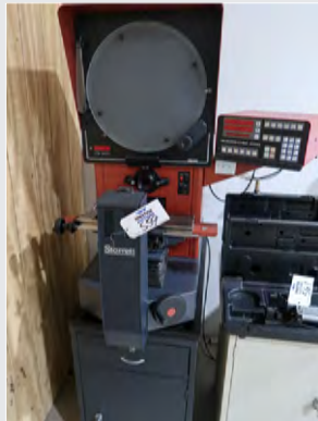
STARRETT HB400 17" OPTICAL COMPARATOR