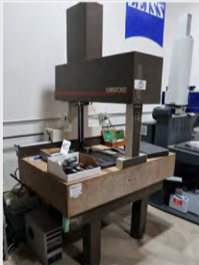
HANSFORD RAPID CHECK COORDINATE MEASURING MACHINE

LARGE QUANTITY OF INSPECTION ITEMS INCLUDING: Digital Height Gages, Calipers, Micrometers, Height Gages, Ring Gages, Vidmar Cabinets, Dial Indicators, Granite Surface Plates, Etc.