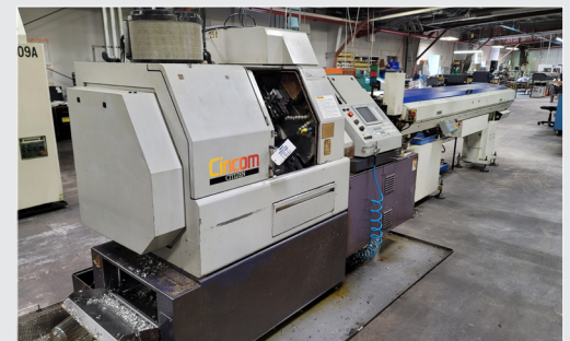
CITIZEN L32 CNC SWISS TURNING LATHE