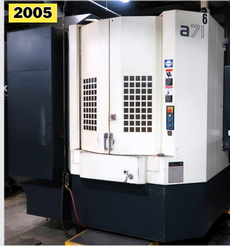
MAKINO A71 CNC HORIZONTAL MACHINING CENTER