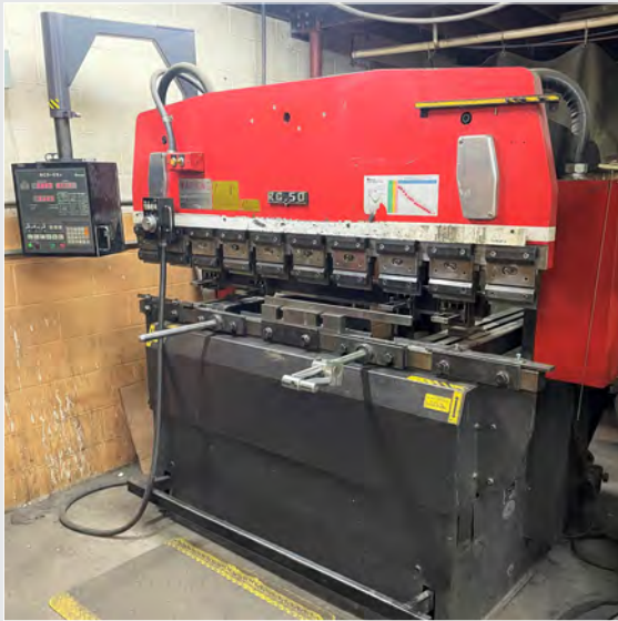
AMADA RG50 55 TON X 82" CNC PRESS BRAKE