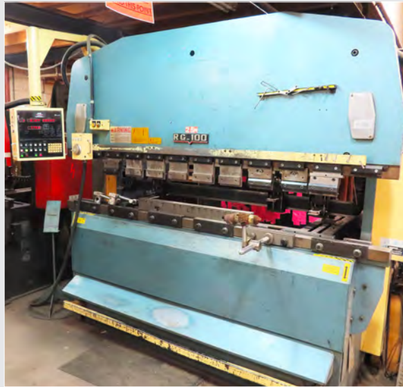
AMADA RG100S 110 TON X 102" CNC PRESS BRAKE