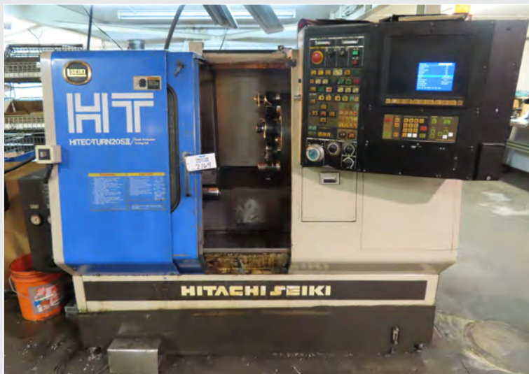
HITACHI SEIKI HT-2032 HITECC-TURN 20 SII CNC LATHE