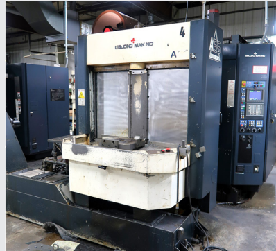
LEBLOND MAKINO A55 DELTA CNC HORIZONTAL MACHINING CENTER