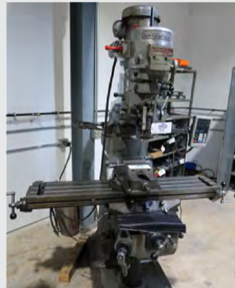
BRIDGEPORT SERIES I 2HP KNEE TYPE VERTICAL MILLING MACHINE