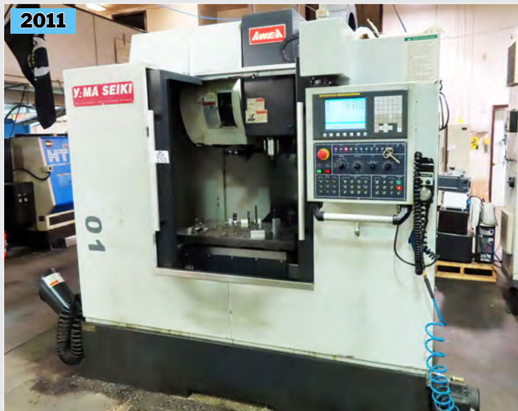
YAMA SEIKI AWEA AV-610 CNC VERTICAL MACHINING CENTER