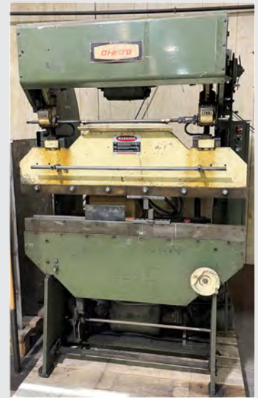
DIACRO 14-48-2 4' X 17" HYDRA-MECHANICAL PRESS BRAKE