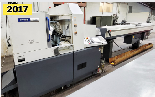
CITIZEN A20-3F7 CNC SWISS TURNING LATHE