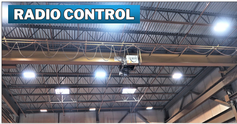
10 TON X 52' SPAN CAPCO OVER HEAD BRIDGE CRANE