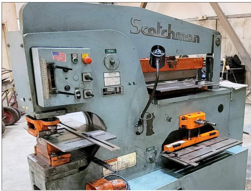
SCOTCHMAN 12012-24M IRONWORKER