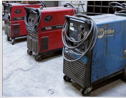
ASSORTMENT OF WELDERS

ALSO AVAILABLE: Large Assortment of Welders Including Miller Bobcat 250 AC/DC Welder with 11,000-Watt Generator, 2018 Isuzu NPR HD Flatbed Truck, Kenworth Flatbed Truck, Ford F450XL Super Duty Utility Truck, Nissan 100 10,000 Lb. Forklift, Mag Drills, HD Clamps, Welding Tables, Metal Shop Tables, Fans, Ladders, Ironworkers, Hand Tools, Grinders, Paint Booth, Air Compressors, Jib Cranes, Vertical Band Saw, Tube Benders, Welding Hoses and Guns, Large Quantity of Raw Material and Racking, & Much More!