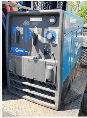
MILLER BOBCAT 250 AC/DC WELDER