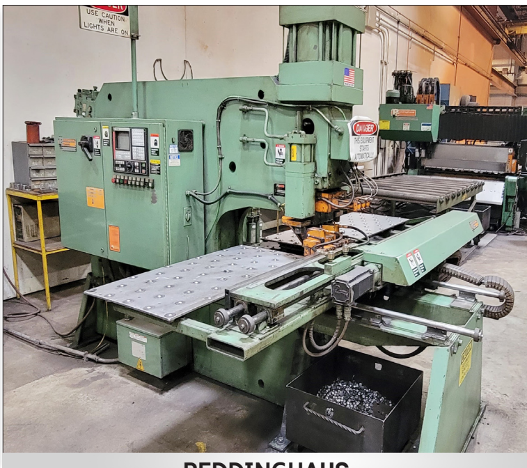
PEDDINGHAUS F-1170-30RT PUNCH