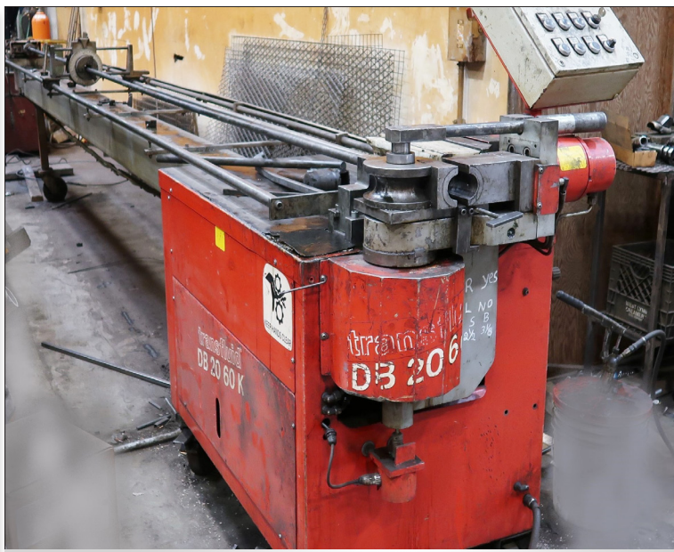
TRANSFLUID DB 2060K-4W-D HYDRAULIC ROTARY DRAW BENDER