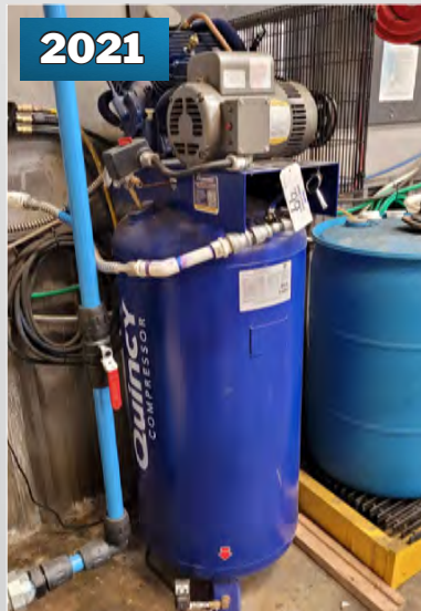
QUINCY AIR COMPRESSOR