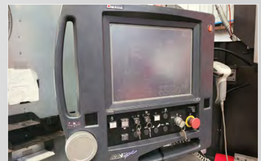
AMADA HM1003 110 TON X 10'2", 7-AXIS CNC PRESS BRAKE

AMADA HM1003 110 TON X 10'2", 7-AXIS CNC PRESS BRAKE, AMNC Graphic PC Based Control, 7.9" Stroke, 16.5" Throat Depth, 18.5" Open Height, 4-Axis Back Gauge, Hydraulic Proportional Valve, Amada One-Touch Upper Tool Holders, S/N: 1003 Mfg. Date: 2018