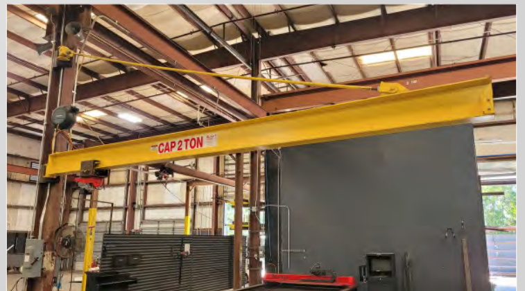
ALL LIFT CRANES COLUMN MOUNTED JIB CRANE

2020 AMADA MARVEL S330HV SPARTAN HORIZONTAL MITERING BAND SAW, 1" Blade, 3 HP, 13" Round Capacity, 18" x 12" Rectangle, 12" x 12" at 45 Degrees, 60-330 FPM Blade Speed, 60 Deg. Miter Cutting, Hyd. Vise, S/N: S330HV-235, 06/2020