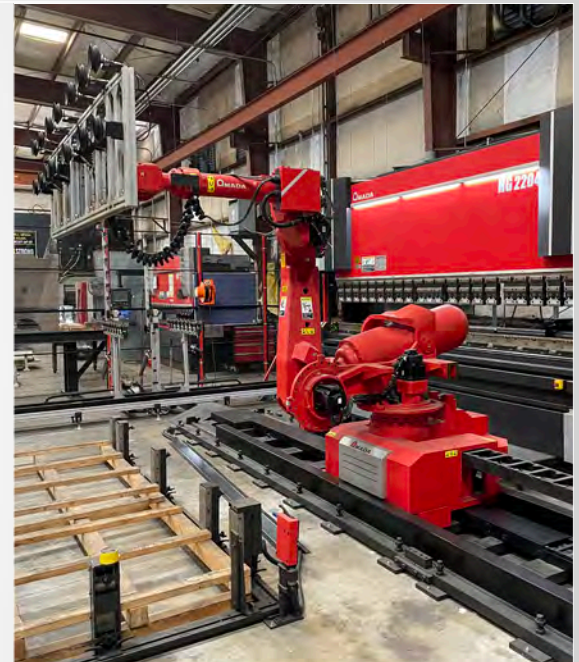
AMADA HG2204-RH PRECISION HIGH SPEED BENDING CELL

2018 AMADA HG2204-RH PRECISION HIGH SPEED BENDING CELL, 220 Ton x 14' Bending Length, 20.5" Open Height, AMNC 3i CNC, CNC Hydraulic Crown Adjustment, Hydraulic Upper Ram Clamping, Yaskawa Model 165 6-Axis Robot with 19.7" Linear Travel, 364 Max. Part Weight, Mfg. Date: 2018 (Approx. 5,381 Total on Time Hours and 3,445 Run Hours)