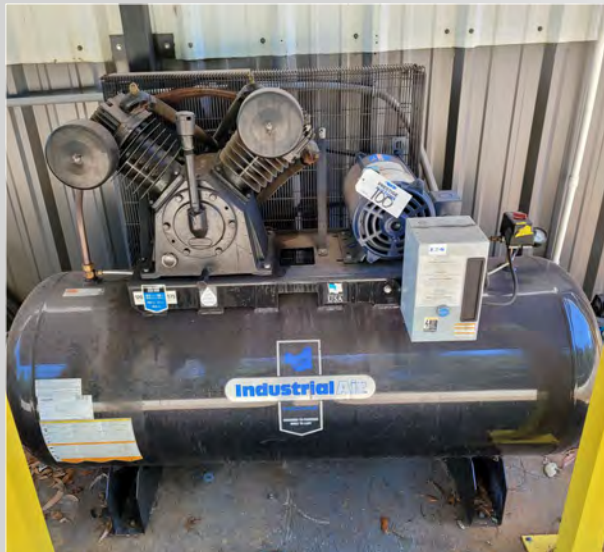
INDUSTRIAL AIR COMPRESSOR

2018 INGERSOLL RAND MODEL UP6-7.5TAS-150PSG AIR COMPRESSOR, 120 Gallon Tank, 40-90 PSIG, 150 PSI Max Pressure, 23.1 Max CFM, 7220.4 Running Hours, 200V, 3PH, S/N CBV591081