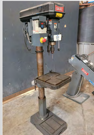
DAKE DRILL PRESS

BELT SANDER: 2018 DAKE MDL. 961001-2 3" BELT SANDER, S/N 1399911, 4 HP, 3300 RPM Motor, 220V, 3PH