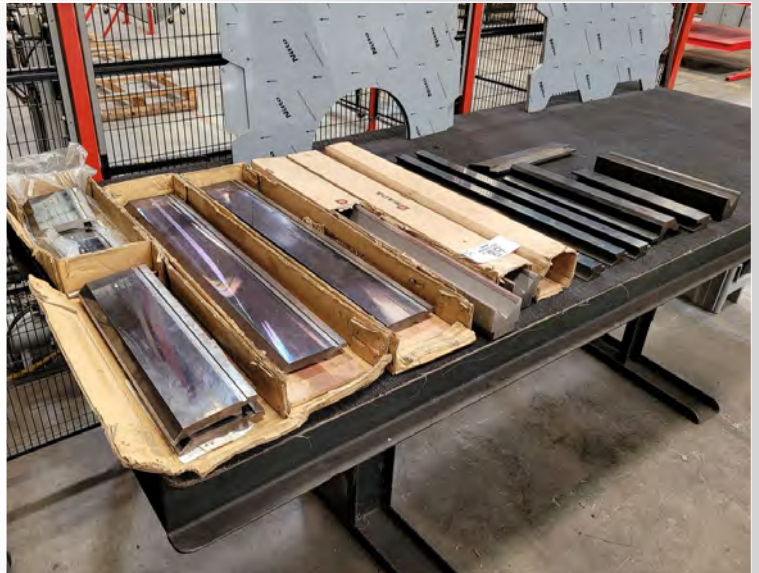
AMADA PRESS BRAKE DIES