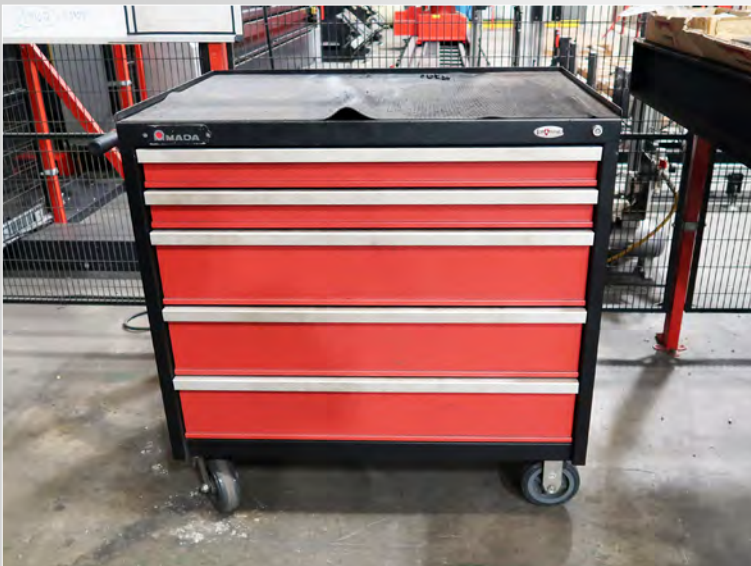
AMADA (5) DRAW TOOL CABINET WITH FULL COMPLIMENT OF AMADA TOOLING