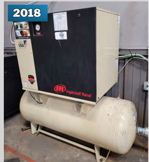
INGERSOLL RAND AIR COMPRESSOR