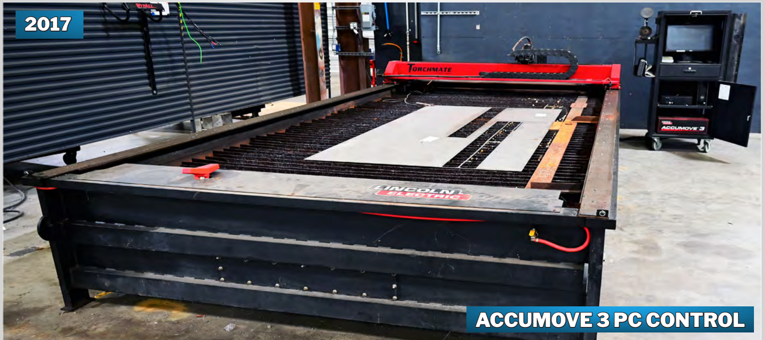
LINCOLN TMX-0614 6' X 14' PLASMA CUTTING TABLE