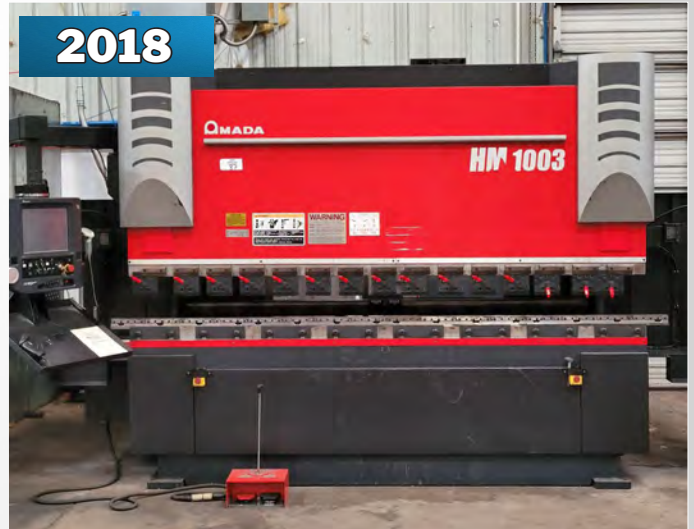
AMADA HM1003 110 TON X 10'2" 7-AXIS CNC PRESS BRAKE