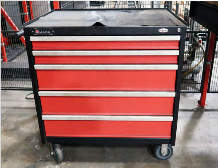
AMADA 5-DRAWER TOOL BOX & CONTENTS OF PRESS DIES