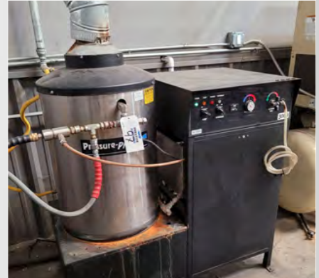
PRESSURE PRO HOT PRESSURE WASHER