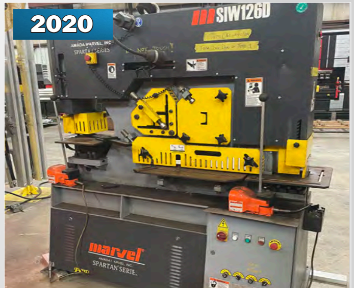
AMADA MARVEL MSIW126D-SPARTAN HYDRAULIC IRONWORKER

INSPECTION: BY APPOINTMENT ONLY Assets Located at 9040 Belvedere Road, West Palm Beach, Florida 33411