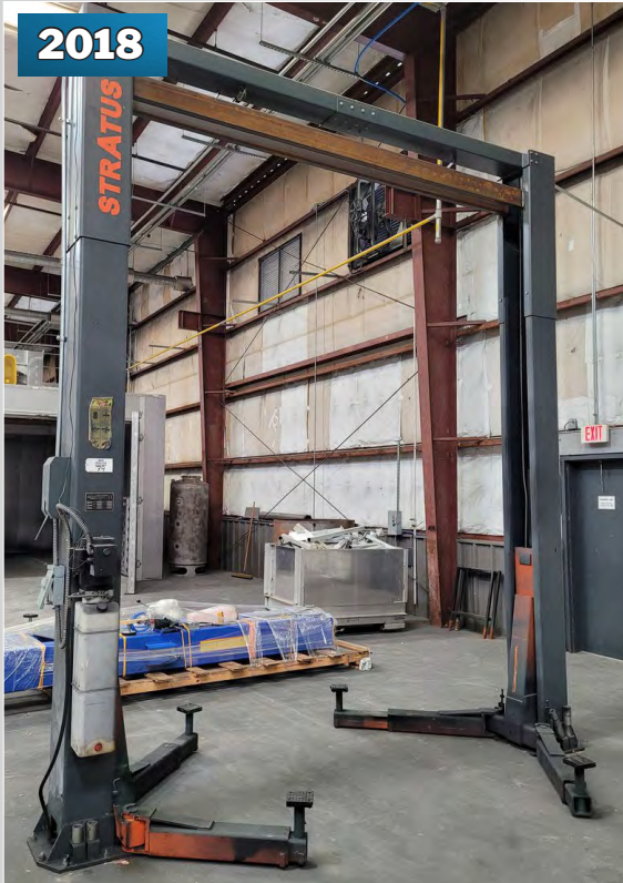
STRATUS MODEL SAE-2PON14KDS CAR LIFT