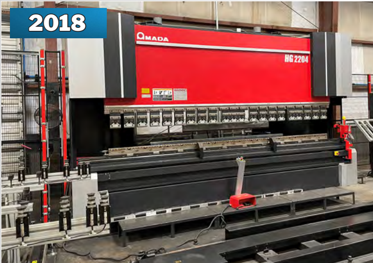
AMADA HG2204-RH PRECISION HIGH SPEED BENDING CELL

THURSDAY, JUNE 9 TH @ 11:00AM ET BidSpotter