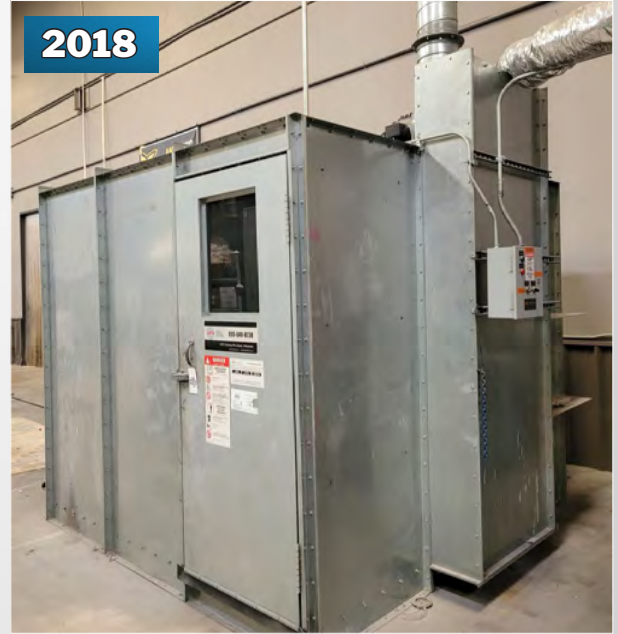
GLOBAL FINISHING SOLUTIONS PAINT BOOTH