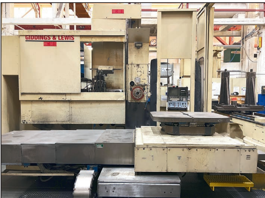
GIDDINGS & LEWIS 60S HORIZONTAL MACHINING CENTER

GIDDINGS & LEWIS MC-60 S HORIZONTAL MACHINING CENTER , s/n 450-172-86, G & L 8000 Control, 6" Spindle Dia., Speeds: 12-2,000 RPM, CAT 50 Spindle Taper, 120-ATC, (2) 36" x 48" Pallets, Travels: X-66", Y-72" (56" Above Pallets), Z-36" Spindle, W-35", 360,000 Position Rotary Table, Thru Spindle and Flood Coolant, Chip Conveyor, 40 HP Spindle Motor [Note: Machine Is Not Operable]