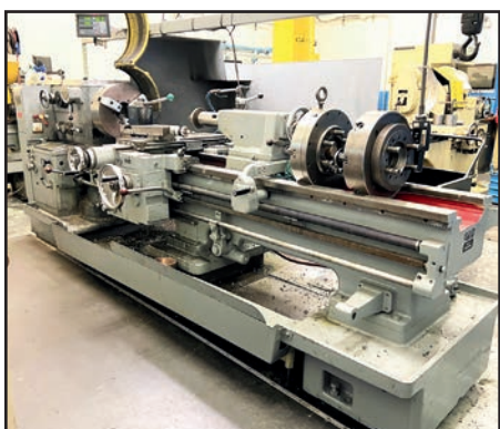
MONARCH 22" X 72" LATHE