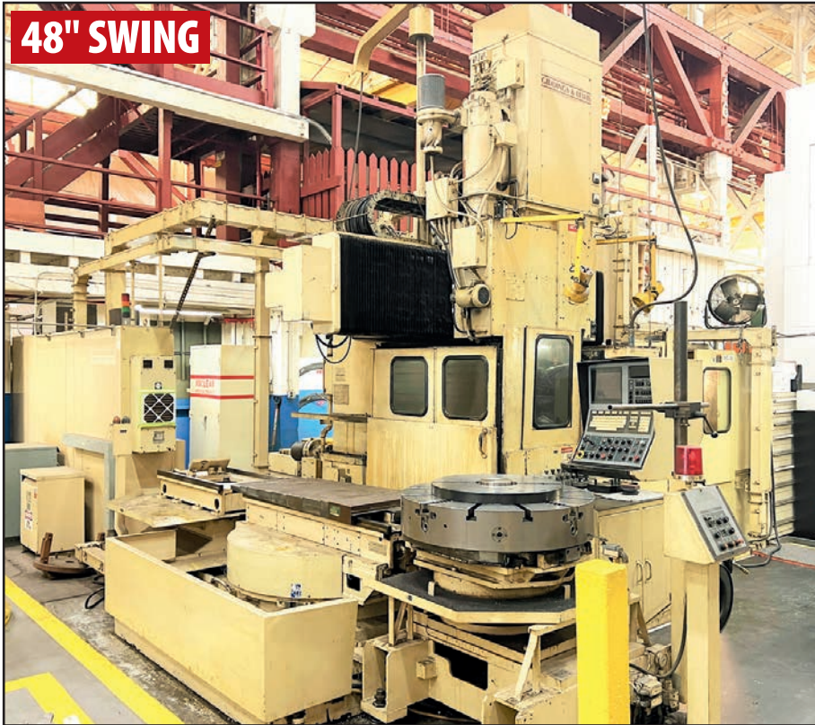
GIDDINGS & LEWIS 36" TWIN PALLET VERTICAL TURNING CENTER