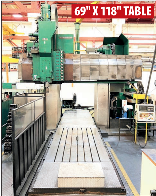
WALDRICH SIEGEN TABLE TYPE BRIDGE MILL