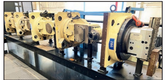
(5) ASSORTED G & L MC 60 HEADS