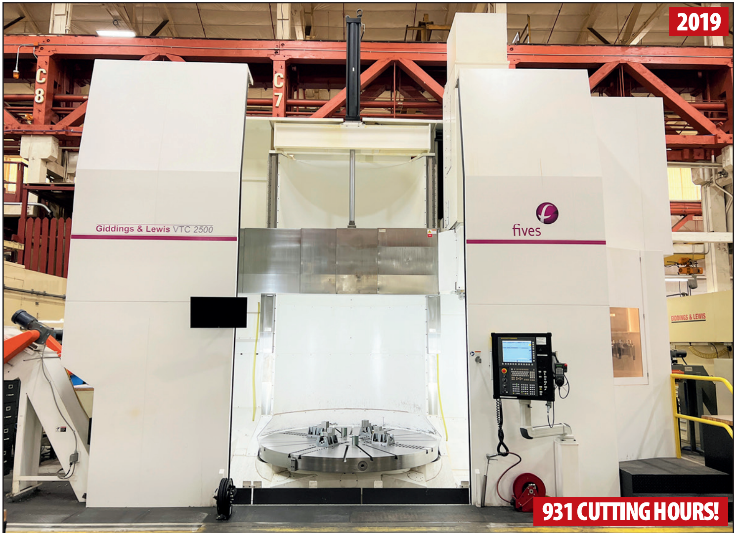
GIDDINGS & LEWIS VTC 2500 VERTICAL TURNING CENTER

FEATURING: 2019 G & L VTC 2500 Vertical Turning Center with Milling, 2014 G & L MC1600 Twin Pallet Horizontal Machining Center, G & L MC60 Horizontal Machining Center with Pallet Shuttle System, WALDRICH V/H-37 CNC Bridge Mill, BULLARD 56" DYN-AU-TAPE Vertical Boring Mill, Large Quantity of Machine Tooling & Tooling Cabinets, Milling Heads, Carlton Radial Drills, Welding Power Sources, Welding Supplies, Pipe & Tube Benders, Floor Standing Jib Cranes, Inspection, Test Equipment, Plant Support & More!