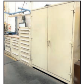
VIEW OF CABINETS