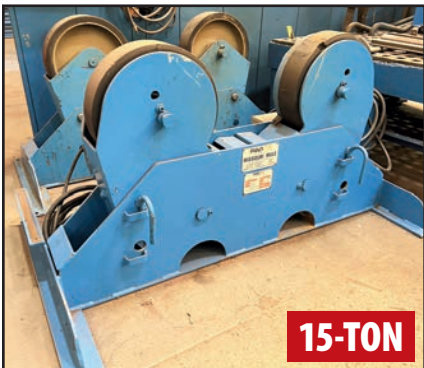
PANDJIRIS MM-15 TANK TURNING ROLLS