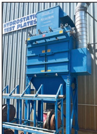
PULSATRON PFV-8-10 FUME COLLECTION SYSTEM