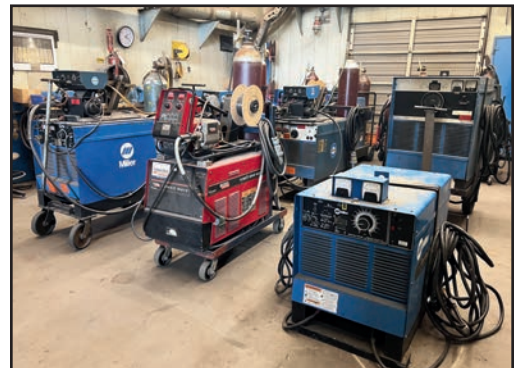
VIEW OF VARIOUS WELDERS