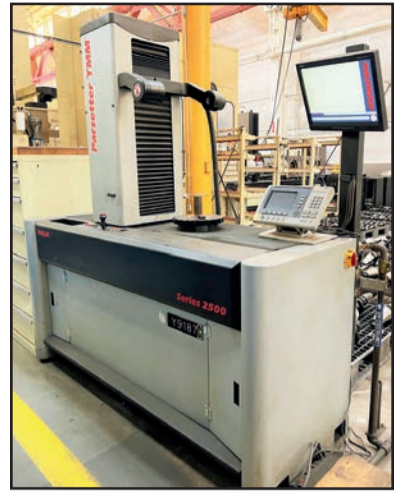
PARLEC TOOL PRESETTER