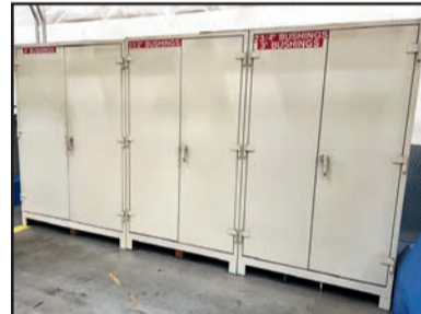
VIEW OF LYON HEAVY DUTY CABINETS