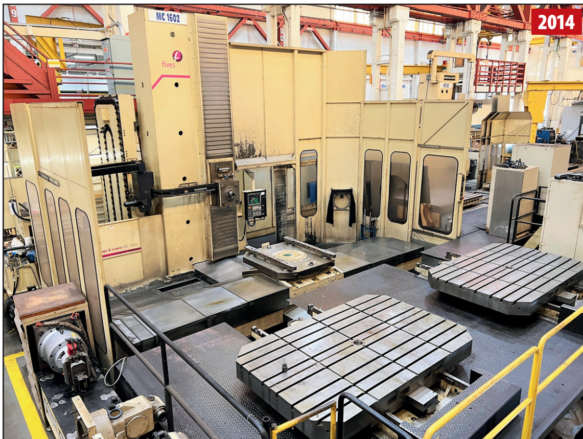
GIDDINGS & LEWIS MC1600 TWIN PALLET HORIZONTAL MACHINING CENTER