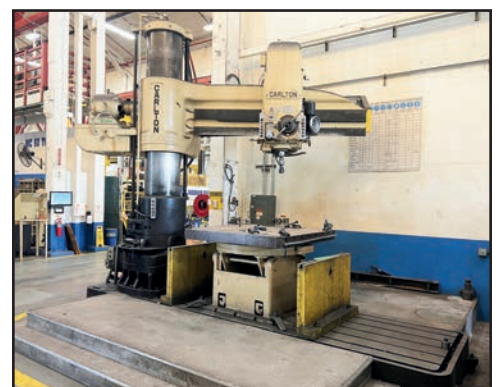
CARLTON 8' X 22" RADIAL ARM DRILL

Complete Catalog & Information Available at https://perfection.global/sulzer