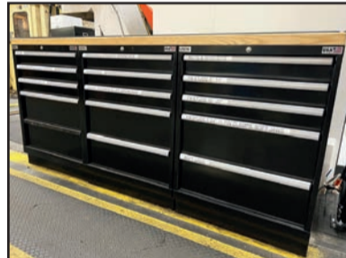
VIEW OF LISTA MODULAR CABINETS