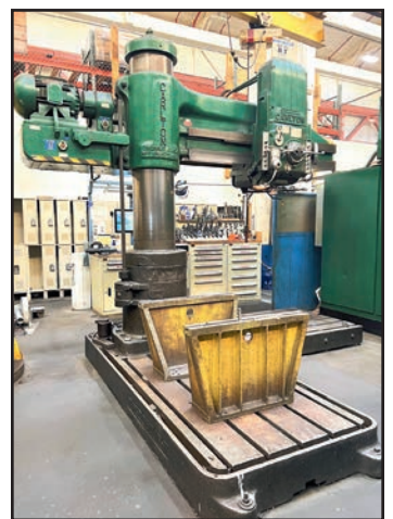
CARLTON 6' X 17" RADIAL ARM DRILL