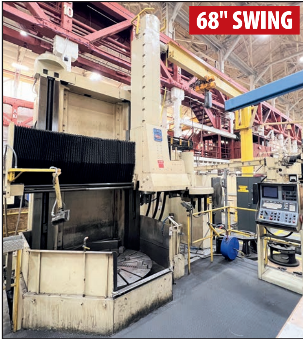
BULLARD 56" DYN-AU-TAPE VERTICAL BORING MILL

WALDRICH SIEGEN V/H-37 200/200/175 X 300 DOUBLE COLUMN CNC VERTICAL BRIDGE MILL, s/n 11.230, FANUC Series 15-M Control, 52-Station ATC, 69" x 118" T-Slotted Table, CAT 50 Spindle Taper, Travels: X-149.6" Table, Y-122.63" Horizontal Head Travel, Z-39.37" Vertical Ram, W-19.68" Quill Travel, 78.74" Between Columns, 78.74" Distance Top of Table to Face of Milling Spindle, Spindle Speeds: 16.7-3,000 RPM, 90 Degree Right Angle Head, Chip Conveyor