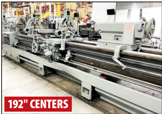
MAZAK 24-200 HEAVY DUTY LATHE