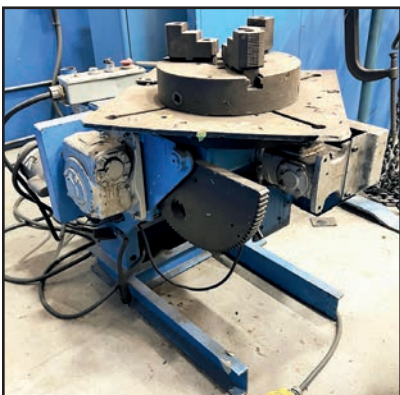
PANDJIRIS 15-4 WELDING POSITIONER