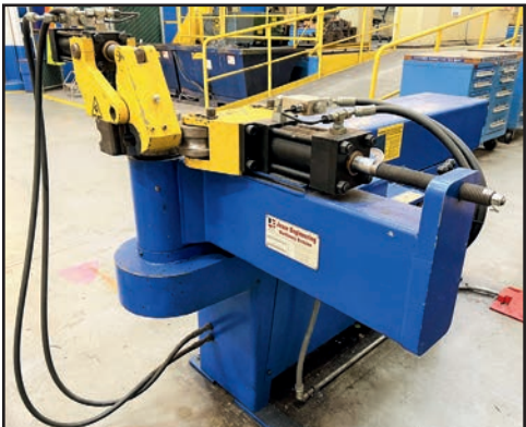
JESSE ENGINEERING T-65 TUBE BENDER