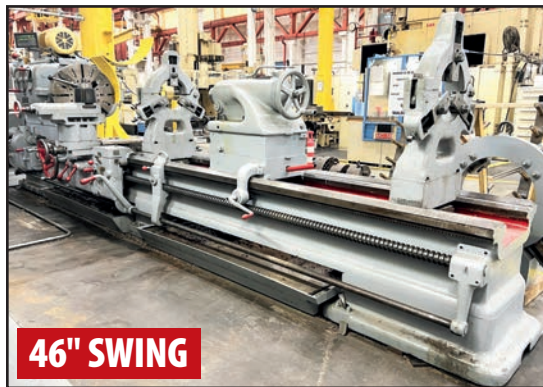
AMERICAN HIGH DUTY LATHE