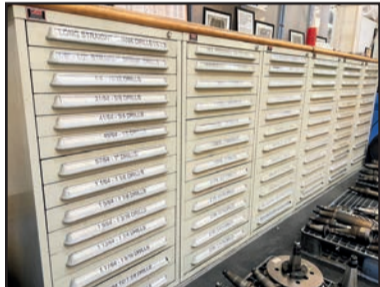
VIEW OF LYON MODULAR CABINETS

LARGE SELECTION OF TOOLING, CT50, CT45, CT60 TOOL HOLDERS, KM 80 TOOLING, MILLING AND TURNING TOOLS, LATHE TOOLING, CARBIDE INSERTS, BORING BARS, BORING HEADS, END MILLS, REAMERS TAPS, TWIST DRILLS, CORE DRILLS, FACE MILLS, STRESS RELIEVING OVEN, LYON AND LISTA MODULAR CABINETS, WORK BENCHES, TOOL BOXES, HAND TOOLS, POWER TOOLS, AIR TOOLS, RIGGING SUPPLIES, CHAIN, SLINGS, CLEAVISES, CRANE SCALE, HOSE REELS, FLAMMABLE LIQUIDS SAFETY CABINETS, ARBOR PRESSES, DRILL POINT GRINDERS, BENCH GRINDERS, CHOP SAWS, LOCKERS AND MUCH MORE!