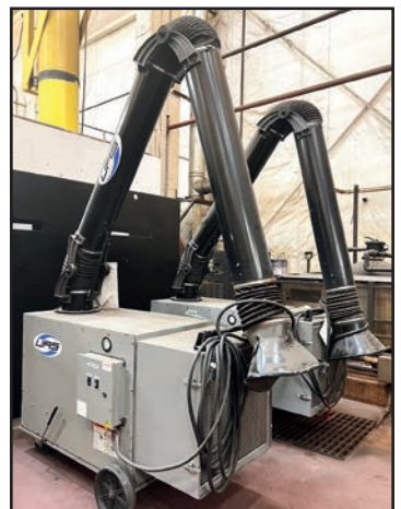
(2) UAS VP-1500 PORTABLE FUME COLLECTORS

Pre-Auction Offers Invited on Major Assets