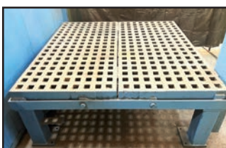
(2) ACORN TABLES, 5' X 5'