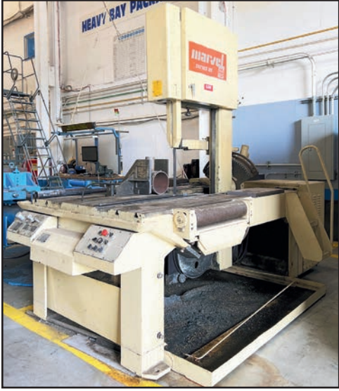
MARVEL SERIES 25 VERTICAL BANDSAW