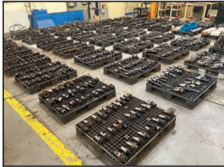
VIEW OF TOOL HOLDERS