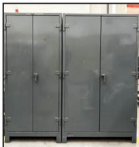
VIEW OF LYON HEAVY DUTY CABINETS