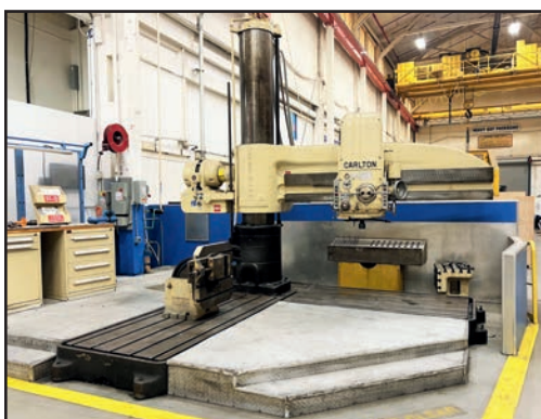
CARLTON 8' X 19" RADIAL ARM DRILL