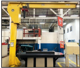
VIEW OF FREE STANDING JIB CRANES