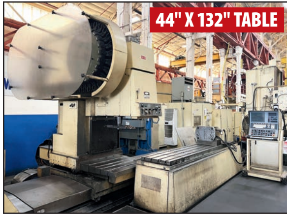
GIDDINGS & LEWIS 10VFS TRAVELING COLUMN VERTICAL MACHINING CENTER