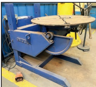
READCO UPC25T WELDING POSITIONER