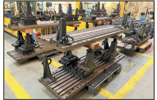
VIEW OF T-SLOT PLATES