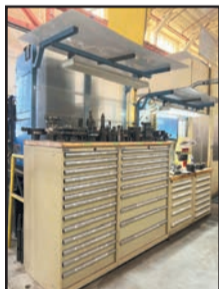
VIEW OF LISTA MODULAR CABINETS