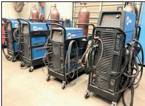
VIEW OF MILLER TIG WELDERS