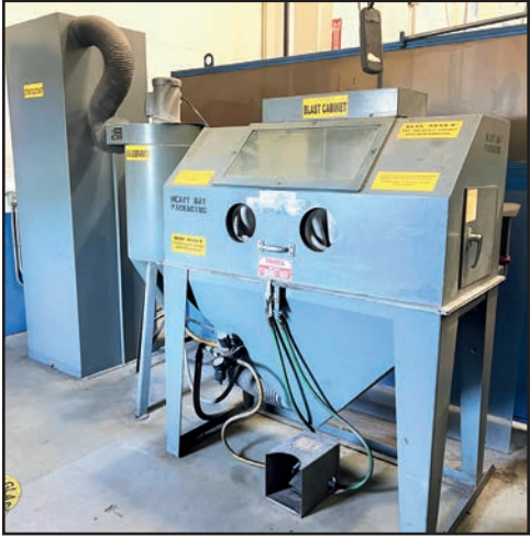
TRINCO 48X24SL/45RLX DRY BLAST CABINET