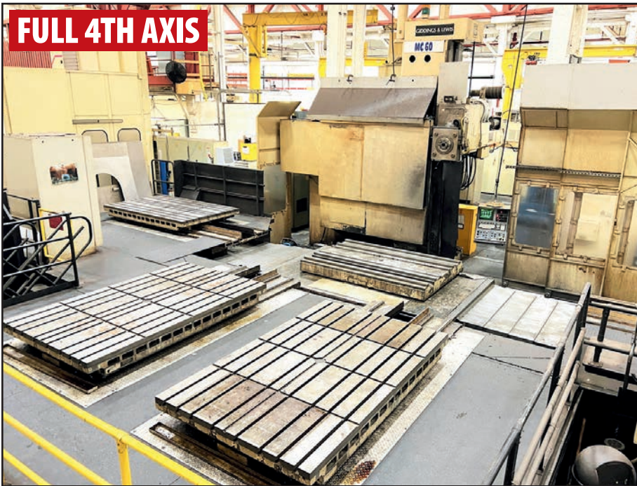
GIDDINGS & LEWIS MC 60 HORIZONTAL MACHINING CENTER

GIDDINGS & LEWIS 36" TWIN PALLET VERTICAL TURNING CENTER WITH MILLING , s/n 511-137-90, G & L 8000B Control, 30-Station ATC, No. 60 ANS Spindle Taper, 48" Turning Dia., 42" Height Under Cross Rail, (2) 38" Dia. 4-Jaw Comb. Manual Chucks with Pallet Shuttle, Table Speeds: 4.5-480 RPM, 25 HP Milling Spindle Drive, Speeds: 15-2,200 RPM, 250 IPM Rapids, 38" Ram Travel, 32" Horizontal Travel Right of Center, 26.5" Horizontal Travel Left of Center, 360,000 Programmable Positions C-Axis Milling Table Drive, 300 IPM, Coolant Thru Ram, Chip Conveyor