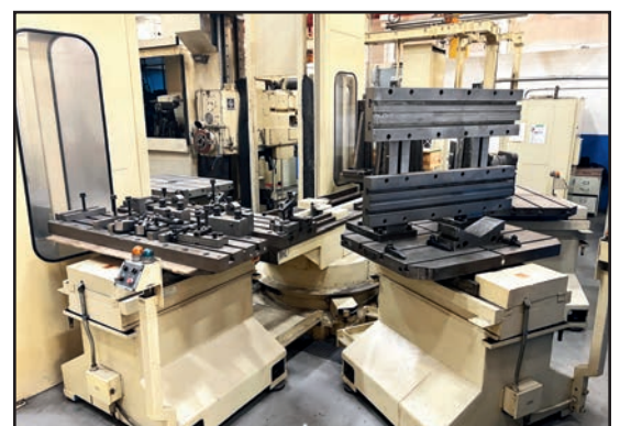
G & L 60S PALLET POOL