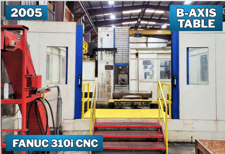
5.12" GIDDINGS & LEWIS RT 1250 CNC HORIZONTAL BORING MILL