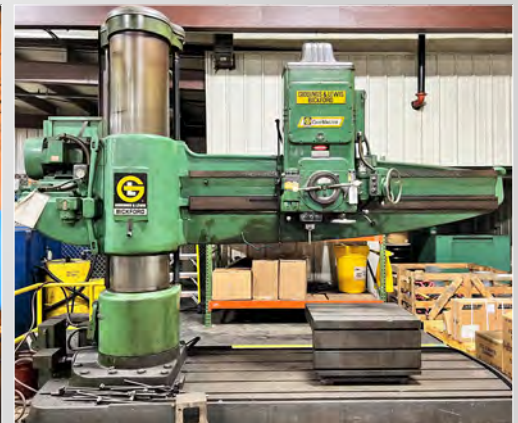
GIDDINGS & LEWIS BICKFORD CHIPMASTER RADIAL ARM DRILL