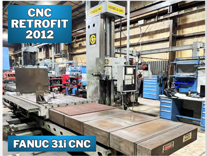
GIDDINGS & LEWIS PC-50 5" CNC HORIZONTAL BORING MILL