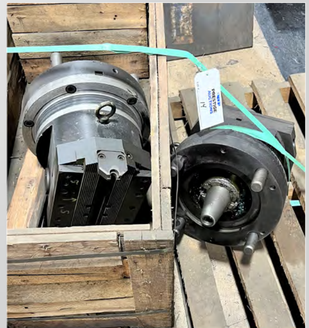
(2) GIDDINGS & LEWIS CH-8 FACING HEADS