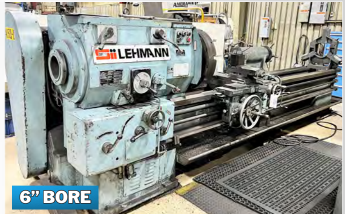
27" X 118" SMITH & LEHMANN MANUAL LATHE