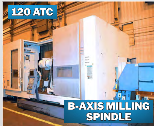
MAZAK INTEGRX E-650H CNC MILLING & TURNING CENTER