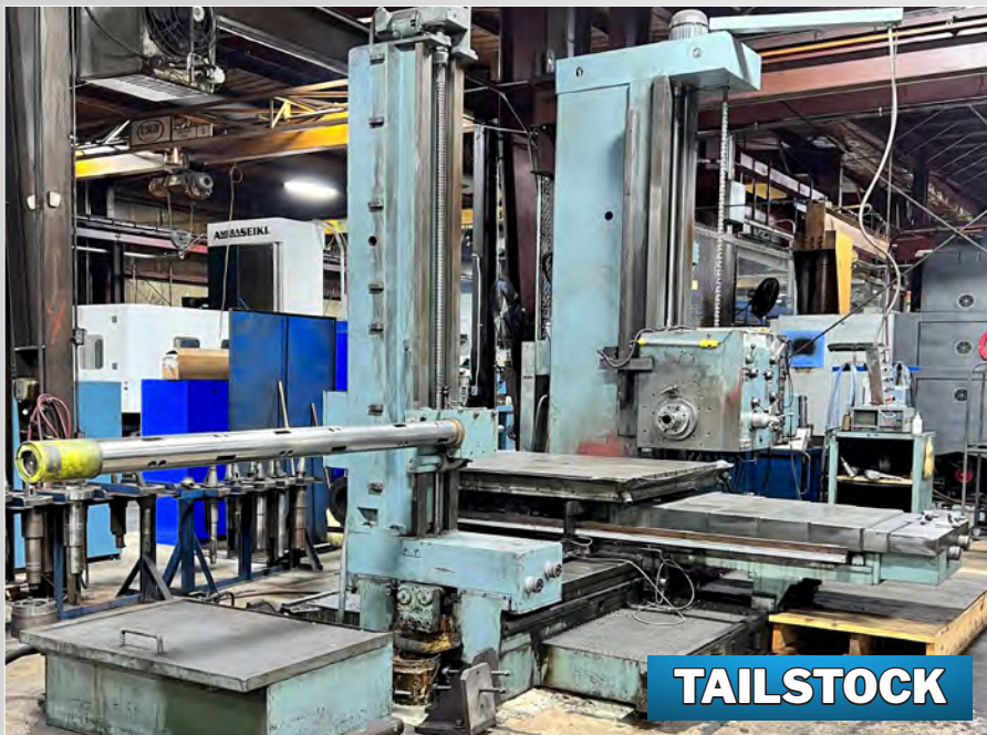
SUPERMILL MDR-125 HORIZONTAL BORING MILL