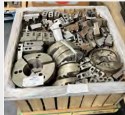
ASSORTED SPARE CHUCKS