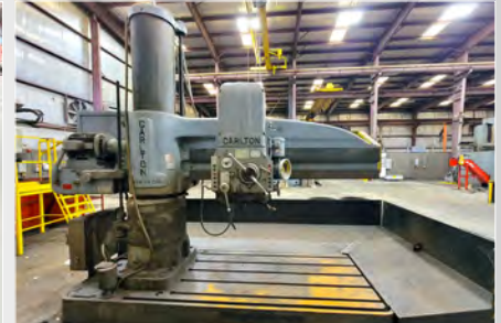
CARLTON 4A RADIAL ARM DRILL