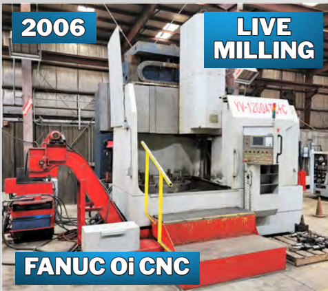
YOU-JI YV-1200 ATC+C CNC VERTICAL TURNING & MILLING CENTER

YOU-JI YV-1200 ATC+C CNC VERTICAL TURNING & MILLING CENTER , Fancu Oi-TC CNC Control, 49.21" Table Diameter, 62.99" Swing, 47.2" Max Cutting Height, 2-350 RPM Table Speeds, 11,000 Lbs. Table Capacity, C-Axis, 35.43" Ram Stroke, Live Spindle Speeds to 2400 RPM, 14.7 HP Live Spindle Motor, 16 Position ATC, Thru Spindle Coolant, 60 HP Table Motor, S/N 06V12TC1498 [2006]