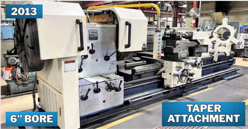
42" X 120" SUMMIT GAP BED MANUAL LATHE