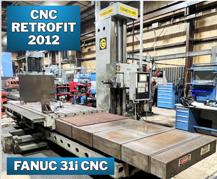
GIDDINGS & LEWIS PC-50 CNC HORIZONTAL BORING MILL