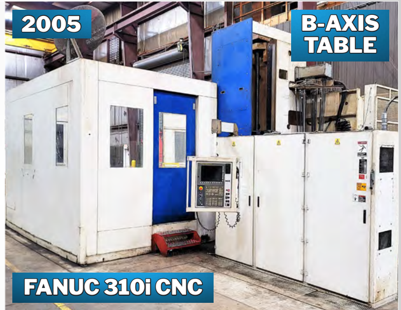
GIDDINGS & LEWIS RT 1250 CNC HORIZONTAL BORING MILL