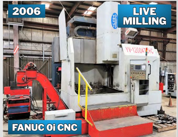
YOU-JI YV-1200 ATC+C CNC VERTICAL TURNING & MILLING CENTER