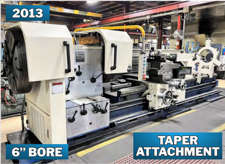
42" X 120" SUMMIT GAP BED MANUAL LATHE

BidSpotter TUESDAY, MARCH 1 ST , 2022 @ 1:00PM ET