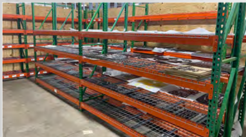
LARGE QUANTITY OF PALLET RACKING