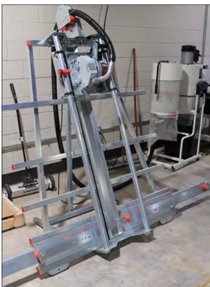
MILWAUKEE PANEL SAW