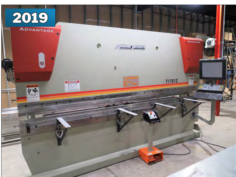
2019 ACCURPRESS 717512 175 TON CNC PRESS BRAKE

Like New Condition 2019 Accurpress 175 Ton x 12' Press Brake, 2019 Accurshear ¼" x 12' Shear, Press Brake Tooling Package, JD Squared Pipe Bender, Miller 275 Tig, (2) Millermatic 252 Welders, Jet Box and Pan Brake, Drill Press, Band Saw, Tool Cabinets, Hand Tools, Fork Truck and More!