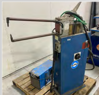
(2) MILLER SPOT WELDERS