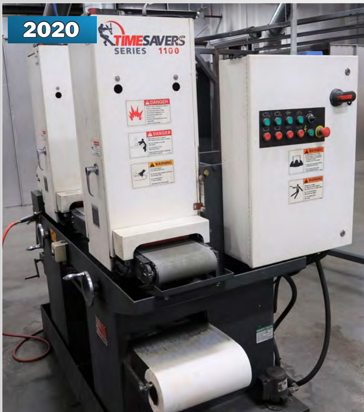
TIMESAVER 1121-11-00 TWO HEAD 10" WET TYPE SANDER