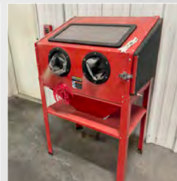
CENTRAL BLAST BOOTH