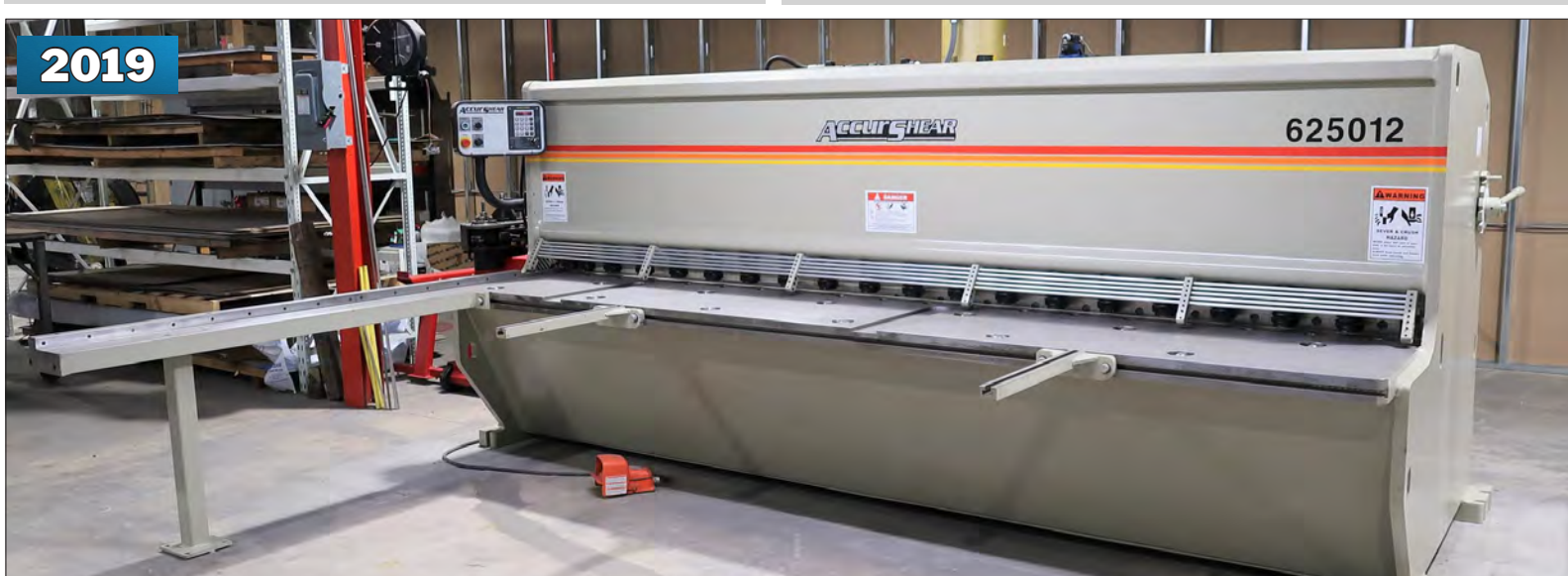
2019 ACCUR-SHEAR 62510 HYDRUALIC SHEAR