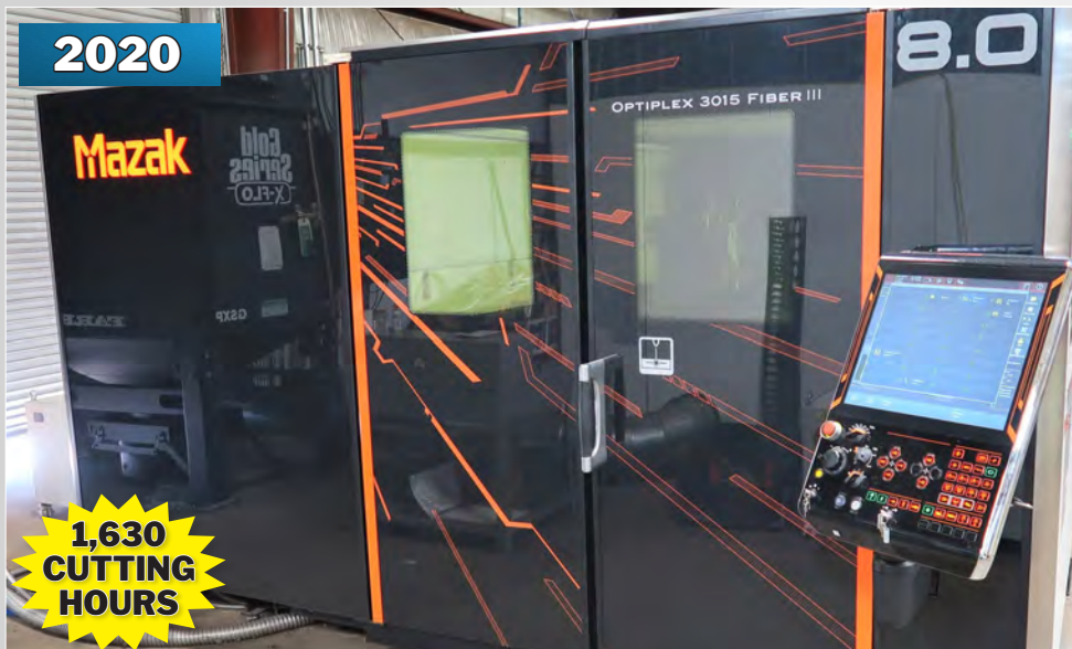
MAZAK OPTIFLEX 3015 III 8 kW CNC FIBER LASER