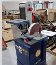
SOUTH BEND SANDER

PLUS: Mig Welders, Spot Welders, Pallet Racking, Assorted Raw Material, (30) Plastic Utility Carts, Lawson Screen Printer, Power Tools, Shop Tables, Tool Cabinets & Air Compressors