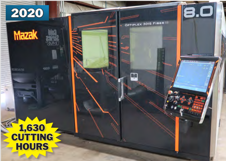
MAZAK OPTIFLEX 3015 III 8 kW CNC FIBER LASER

BidSpotter WEDNESDAY, JANUARY 26 TH , 2022 @ 11:00AM ET