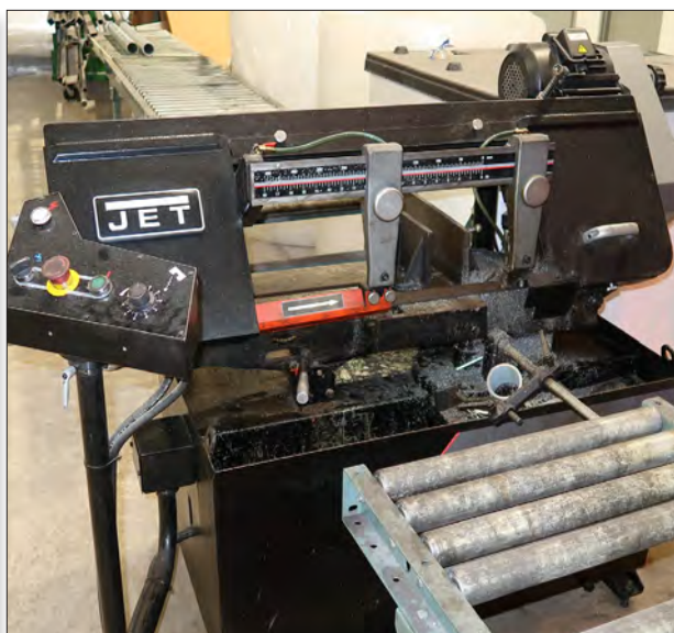
JET HORIZONTAL BAND SAW