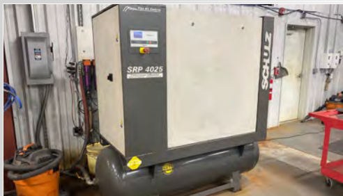
(2) SCHULZ SRP 4025 AIR COMPRESSORS