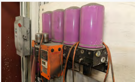
Tsunami REGENERATIVE AIR DRYER