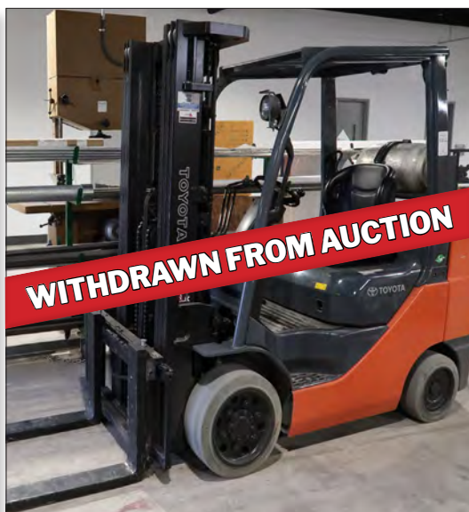
TOYOTA 6,000-LB. FORKLIFT

ADDITIONAL PLANT SUPPORT: SCMI Vertical Band Saw, Jet Drill Press, Jet Router and Dust Collector, Panel Saw, CR Clarke 1500D Plastic Strip Heater Folding Machine, Hand and Powers Tools, Steel Work Table and More!