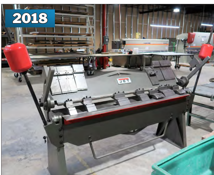
2018 JET BP-1272 BOX & PAN BRAKE