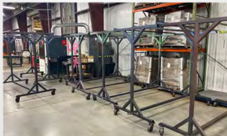
(30)+ ROLLING PART RACKS