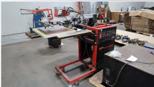
LAWSON SCREEN PRINTER