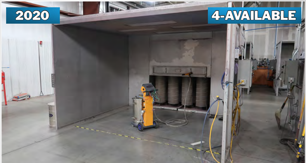
OVEN EMPIRE MANUFACTURING POWDER BOOTHS