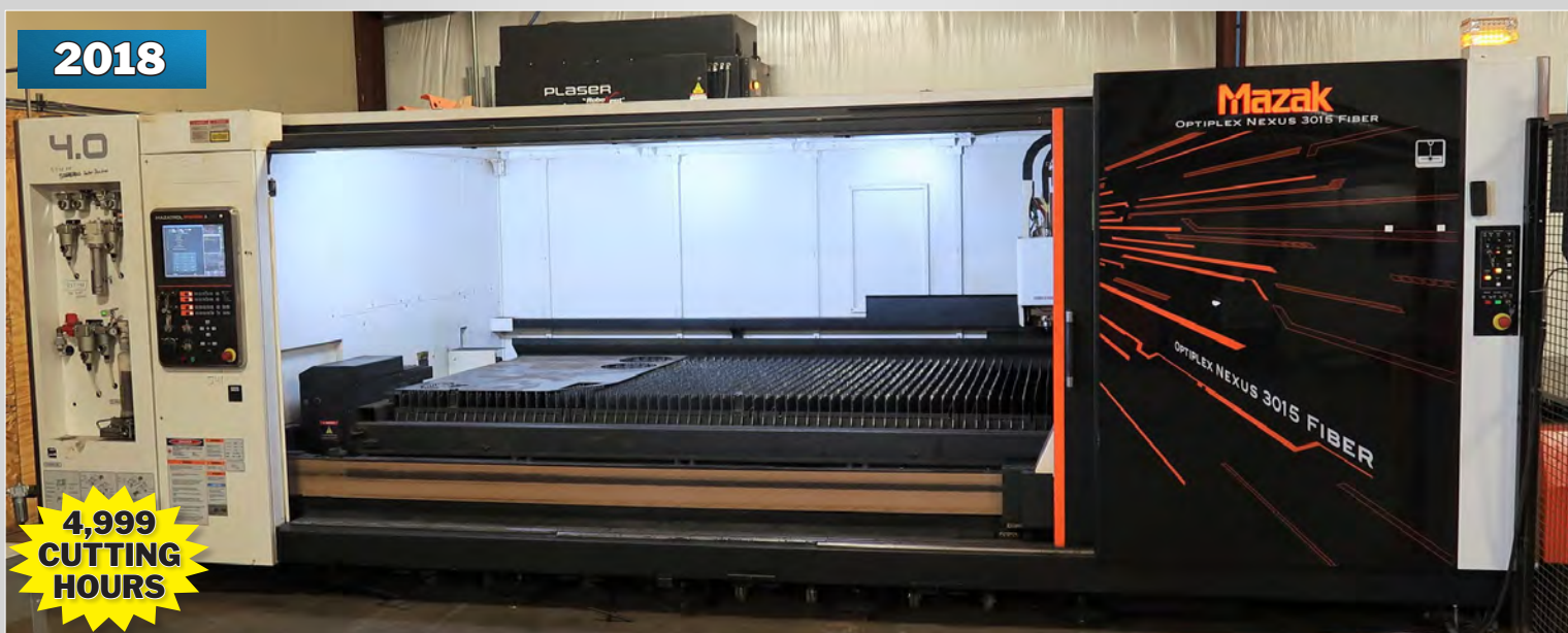
MAZAK OPTIFLEX NEXUS 3015 4 kW CNC FIBER LASER