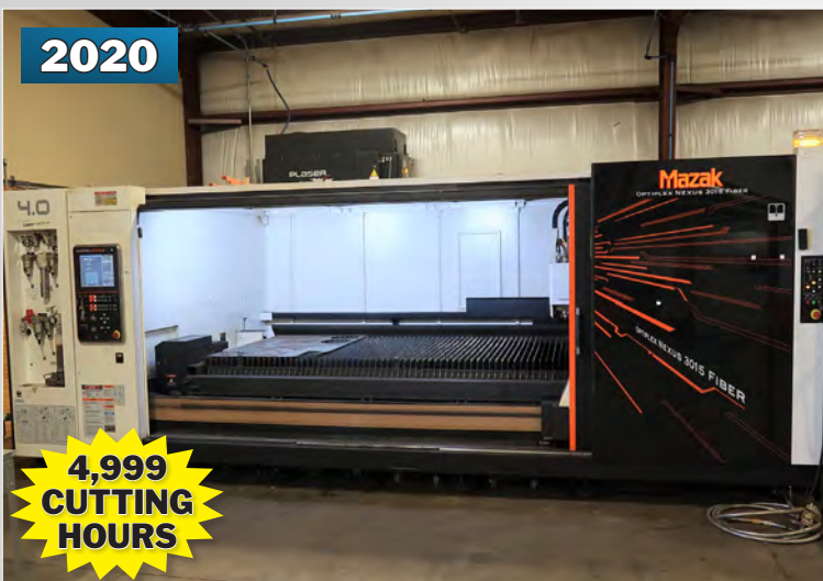
MAZAK OPTIFLEX NEXUS 3015 4 kW CNC FIBER LASER