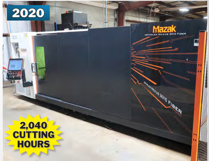
MAZAK OPTIFLEX NEXUS 3015 6 kW CNC FIBER LASER