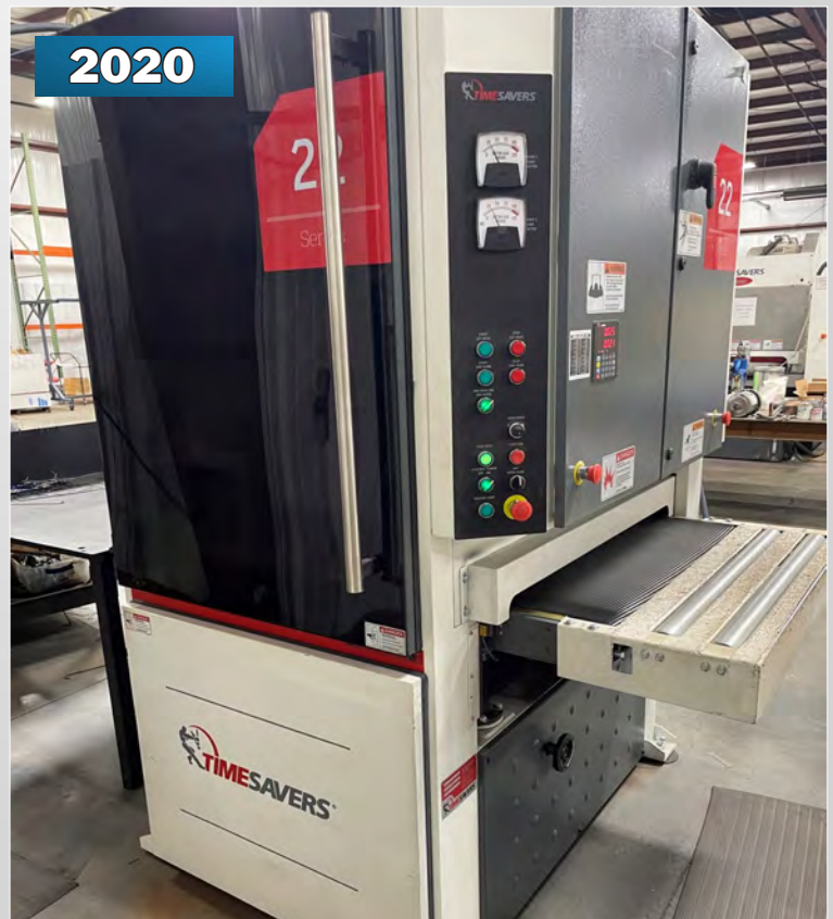
TIMESAVER 2221-23-04 37" DRY TYPE SANDER