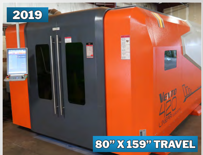
NUKON VENTO L4020 6 kW CNC FIBER LASER

INSPECTION: JANUARY 24 TH & 25 TH , 2022 Assets Located at: 632 Richardson Road SE, Calhoun, Georgia 30701