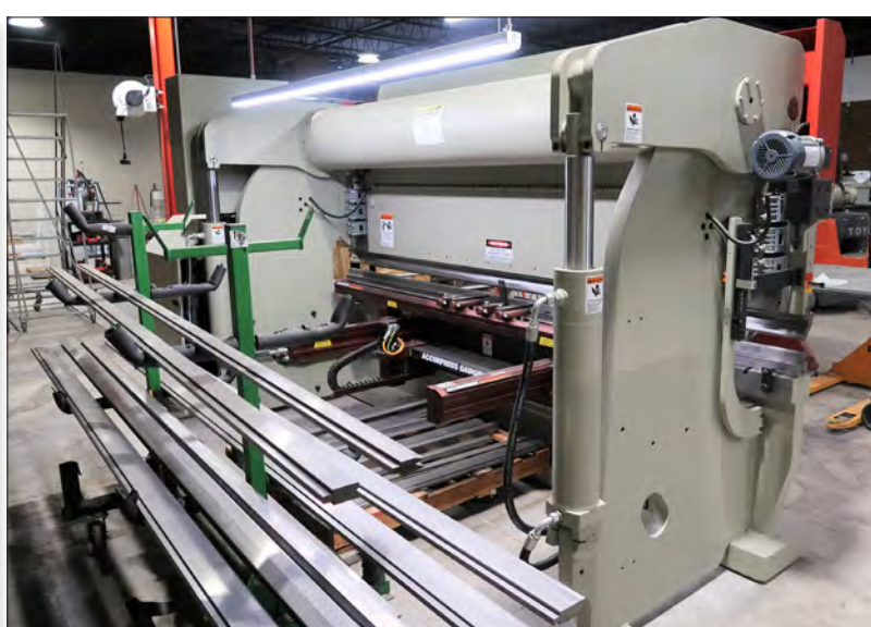
PRESS BRAKE TOOLING PACKAGE & RACK