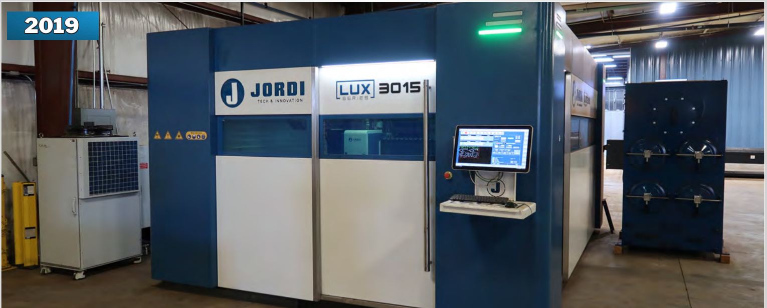
JORDI LUX SERIES 3015 6 kW CNC FIBER LASER