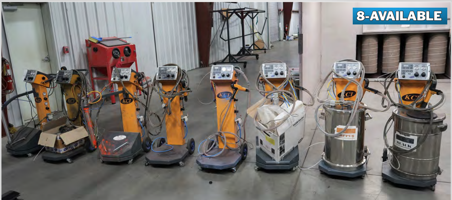
KCI KX1 POWDER DELIVERY SYSTEMS WITH POWDER GUNS