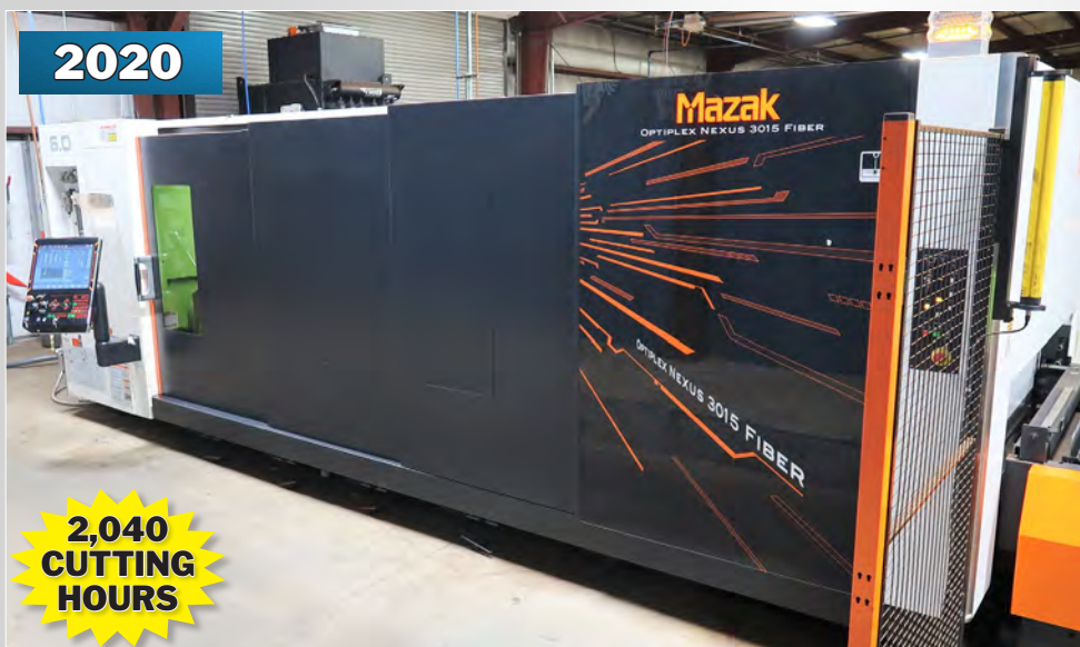
MAZAK OPTIFLEX NEXUS 3015 6 kW CNC FIBER LASER

MAZAK OPTIFLEX NEXUS 3015 4 kW CNC FIBER LASER, 60' x 120" Travel, Mazatrol CNC, IPG YLS-4000 Power Supply, Auto Nozzle Changer, IPG Chiller, Plaser Dust Collector, Machine on Hours: 27,960, Cutting Hours: 4,999, Serial No.: 291855, Mfg. Date: 03/2018, Installed 09/2018