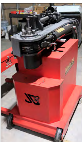
JD SQUARED MODEL 54 PIPE BENDER