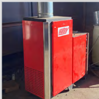
HOTSY PRESSURE WASHER