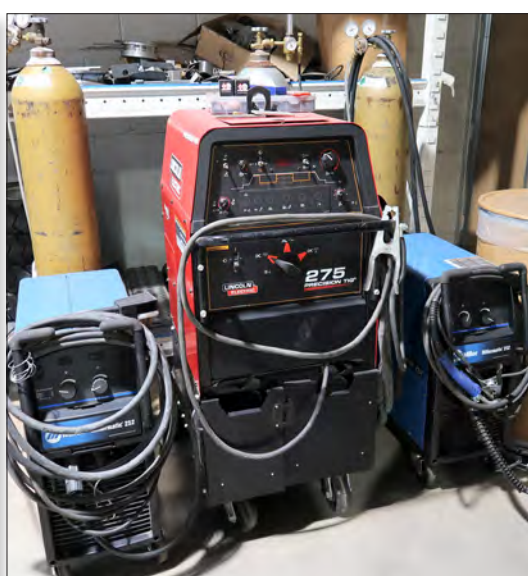
LINCOLN TIG WELDER & (2) MILLERMATIC MIG WELDERS