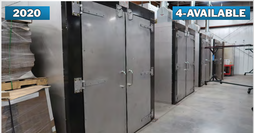
OVEN EMPIRE MANUFACTURING BATCH OVENS