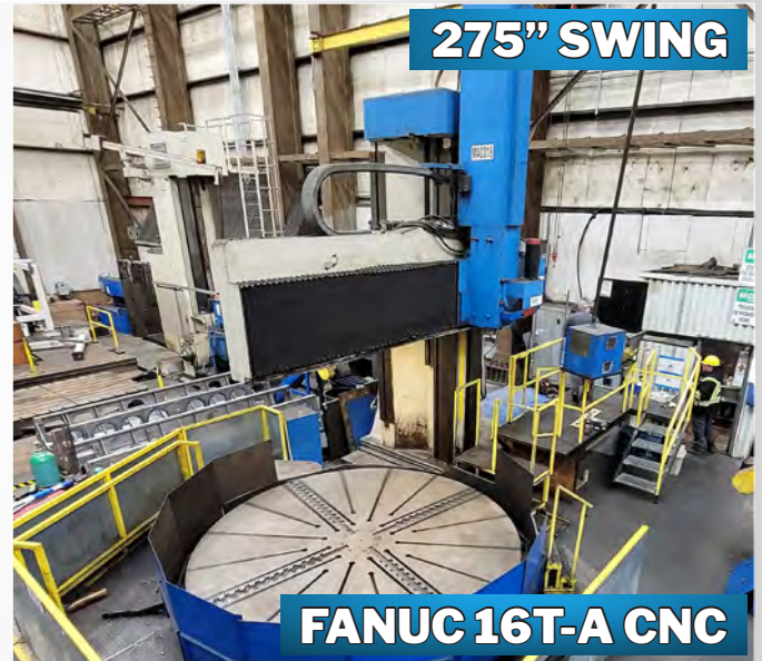
O-M LTD. TMS-36/70 CNC VERTICAL BORING MILL