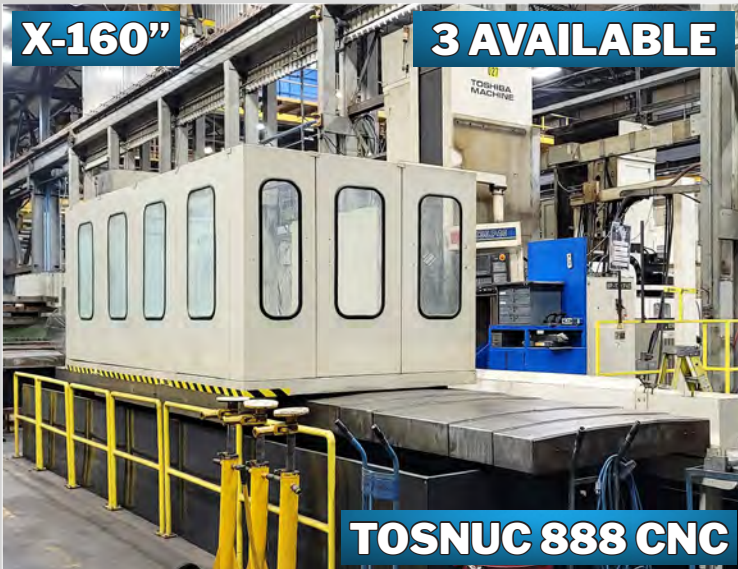
TOSHIBA BP-130.P40 CNC HORIZONTAL BORING MILL