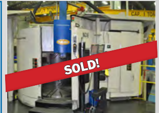
TOSHIBA TUE-200(S) CNC VERTICAL BORING MILLS

MAZAK MEGA-TURN F-12 CNC VERTICAL TURNING CENTER, 5-Position Turret, 49" Table w/ (4) Face Plate Jaws, 57.08" Swing, 30" Under Cross Rail, 8,800 LB Table Weight Capacity, Table Speeds 1-350 RPM, Chip Conveyor, 40/60 HP, Fanuc 18T-B CNC, S/N: 51459