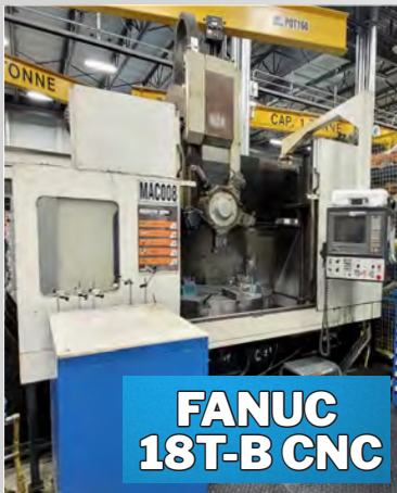
MAZAK MEGA-TURN F-12 CNC VERTICAL TURNING CENTER