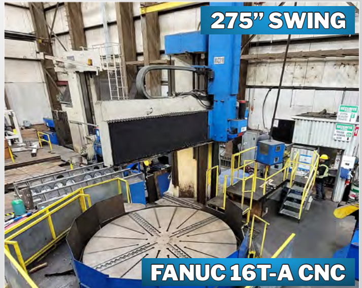
O-M LTD. TMS-36/70 CNC VERTICAL BORING MILL