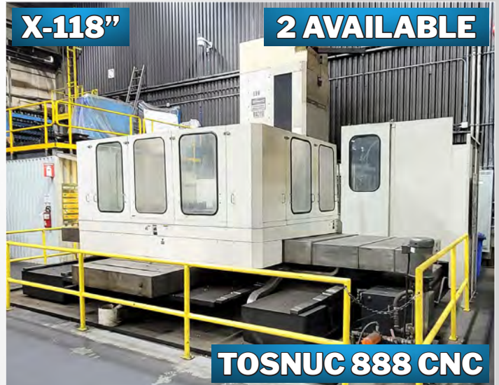
TOSHIBA BTD-13F.R22 CNC HORIZONTAL BORING MILL