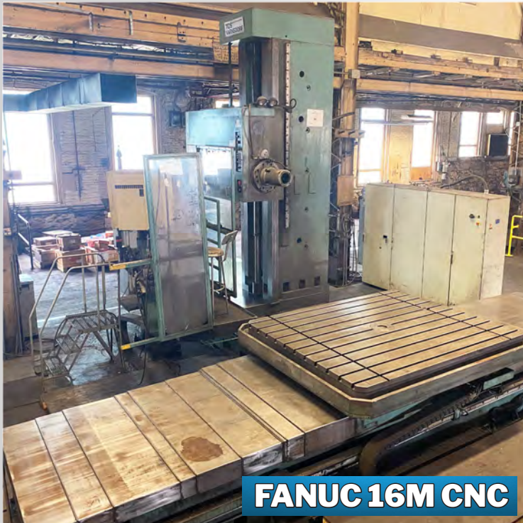
TOS VARNSDORF WHN13 CNC HORIZONTAL BORING MILL