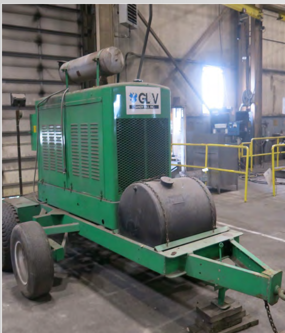
MCGRAW-EDISON/ONAN PORTABLE GENERATOR