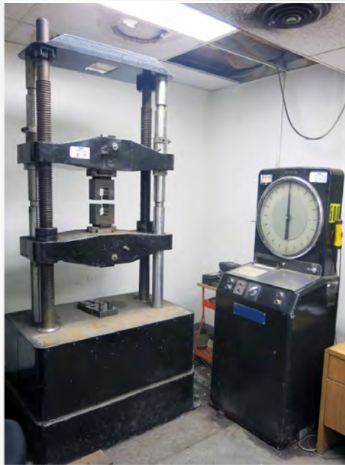
RIEHLE TENSILE TESTER