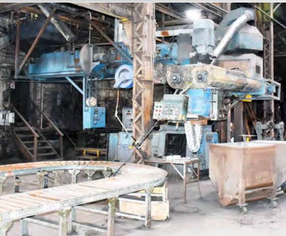
DEPENDABLE FORDATH CONTINUOUS MIXER SYSTEM