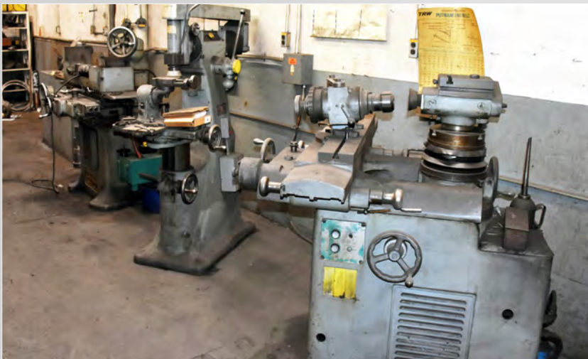
VIEW OF GRINDING AREA