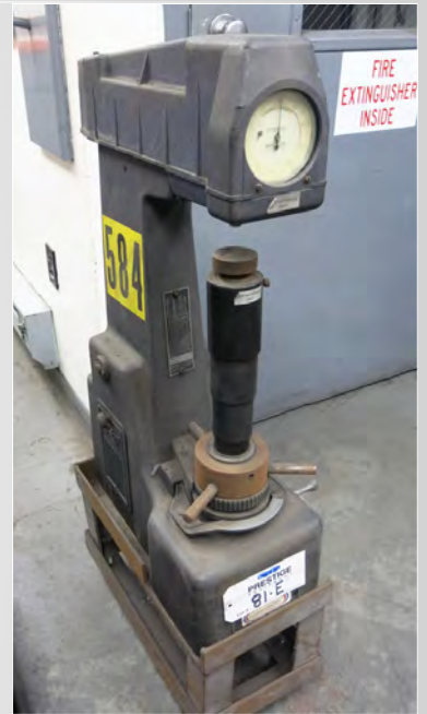
ROCKWELL WILSON HARDNESS TESTER