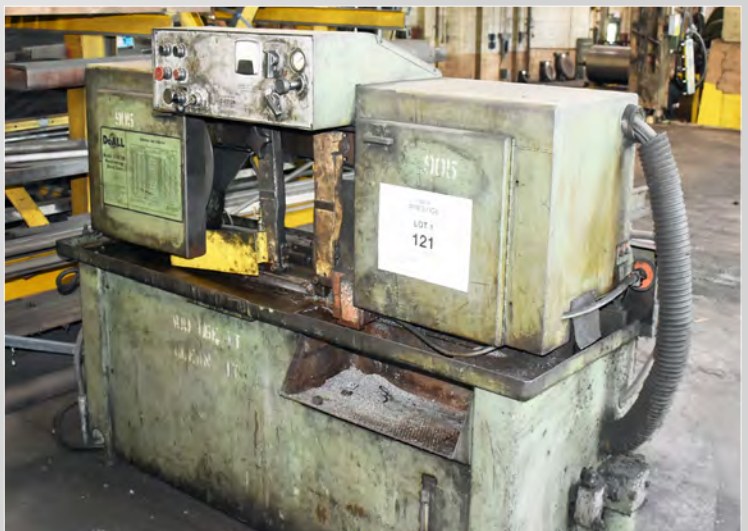
DOALL HORIZONTAL SAW