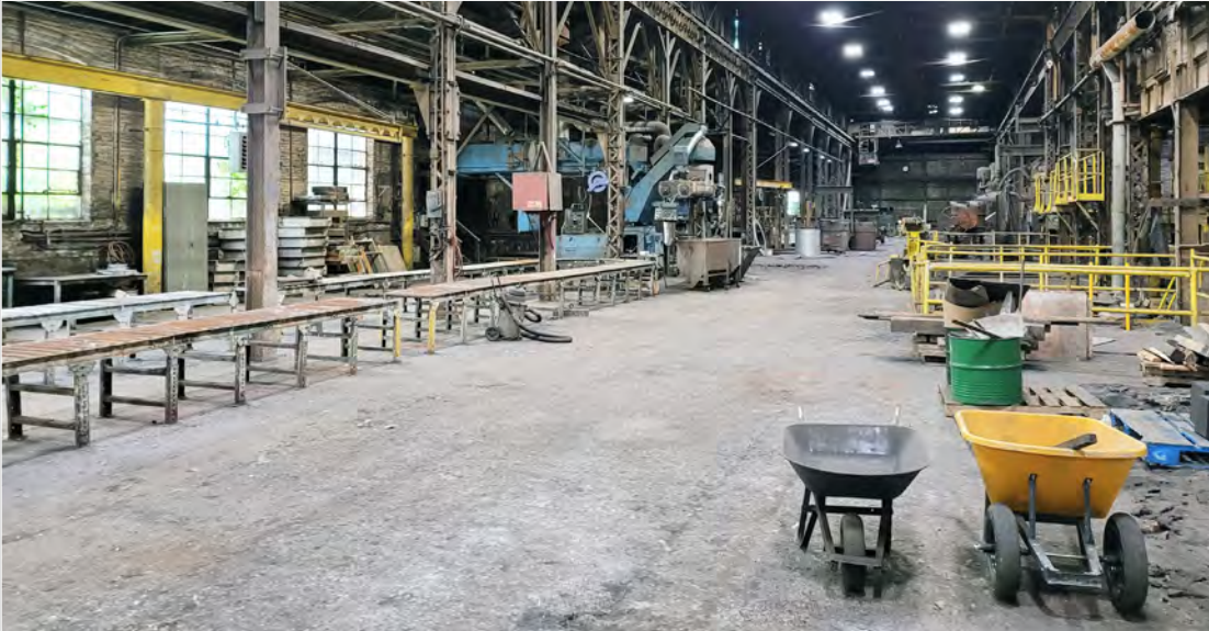
VIEW OF FOUNDRY