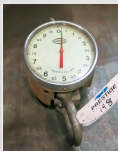
CHATILLON 50,000 LBS. CRANE SCALE