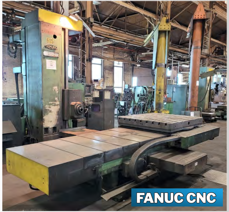
NOMURA BN-110WR CNC HORIZONTAL BORING MILL