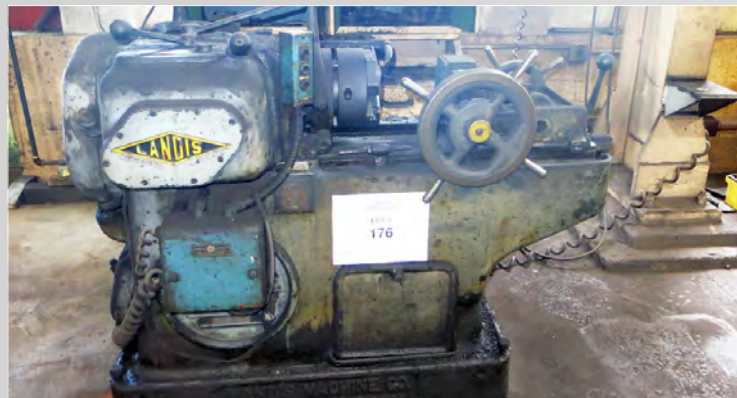
LANDIS 1 1/2 L THREADER