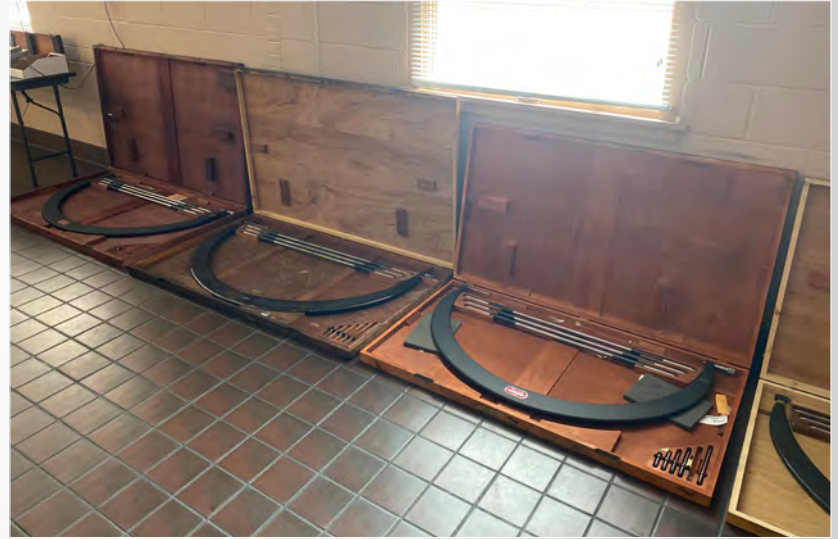
PARTIAL VIEW OF LARGE MICROMETERS