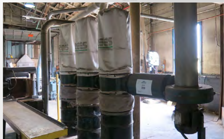
REES DUST COLLECTION SYSTEM