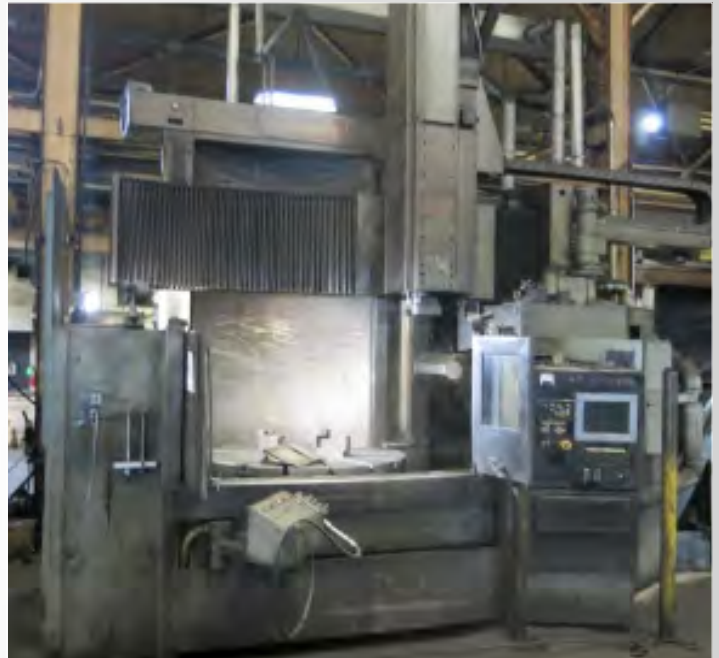
MONARCH VLN-14 VERTICAL BORING MILL