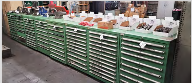
PARTIAL VIEW OF LISTA CABINETS AND CARBIDE INSERTS