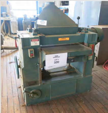
OLIVER ADJUSTABLE DEPTH PLANER