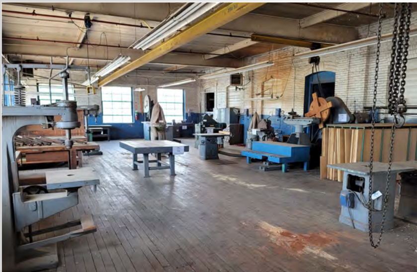
VIEW OF WOODWORK SHOP