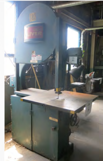
OLIVER VERTICAL BANDSAW