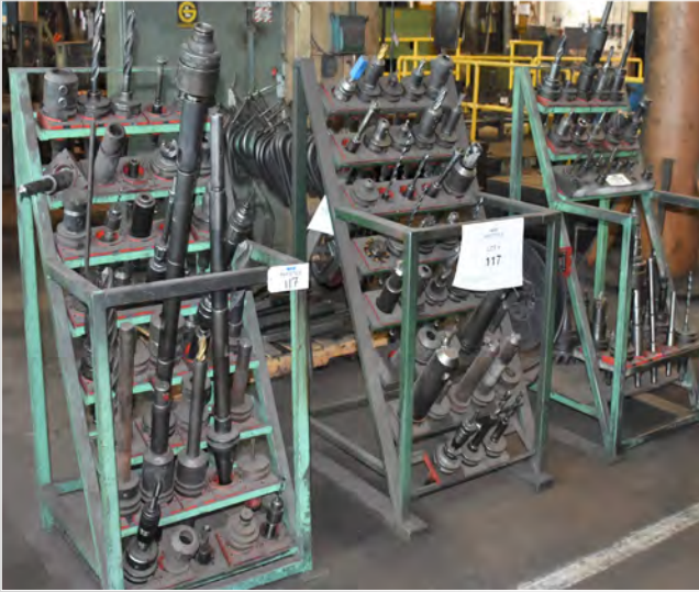
VIEW OF ASSORTED 50 TAPER TOOLING