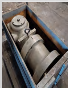
GIDDINGS & LEWIS RIGHT ANGLE HEAD