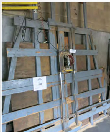
MILWAUKEE PANEL SAW