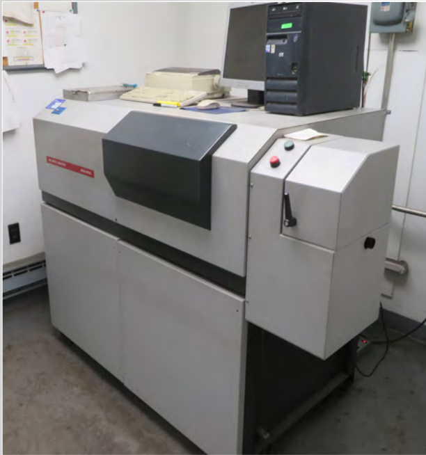
APPLIED RESEARCH TECHNOLOGIES MA 433 METAL ANALYZER