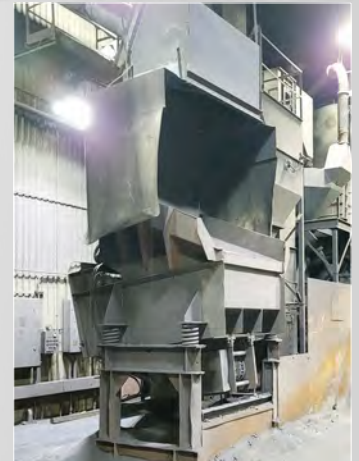
VM120 VIBRATORY LUMP CRUSHER