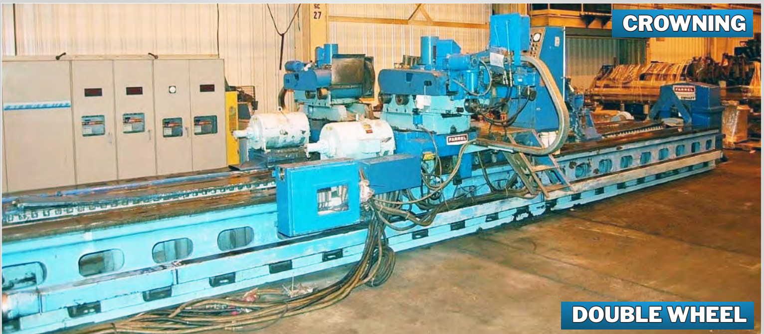
FARREL TWRG 72" X 376" DOUBLE WHEEL SWING REST ROLL GRINDER

FARREL TWRG 72" X 376" DOUBLE WHEEL SWING REST ROLL GRINDER , 55" Max. Roll Diameter on Center Line, 72" Max. Roll Diameter Above Center Line, 352" Roll Nominal Face Length, 376" Grinding Wheel Traverse Length, 20" x 3" Max. Grinding Wheel Size, 15 HP Grinding Wheel Motor, 25 HP Headstock Motor, 25-1600 RPM Grind Speeds, .375-24 RPM Roll Speeds, Electric Crowning w/ Updated Electronics, Stone Grinding on Front and Rear, Variable Crown Roll Drive Unit, Belt Grinding Attachment, (2) Neck Rest and Neck Rest Gibs, Coolant System, S/N 85A1105 [Location: 10 Industrial Highway, Lester, PA]