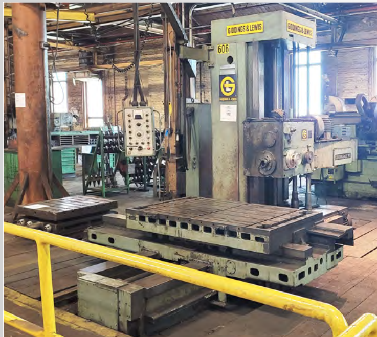
GIDDINGS & LEWIS 70-E4-T HORIZONTAL BORING MILL