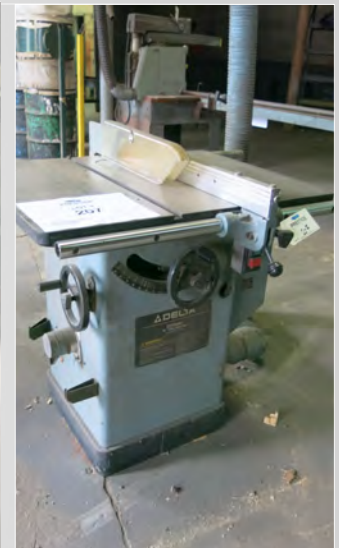
DELTA 34-806 TILTING ARBOR SAW