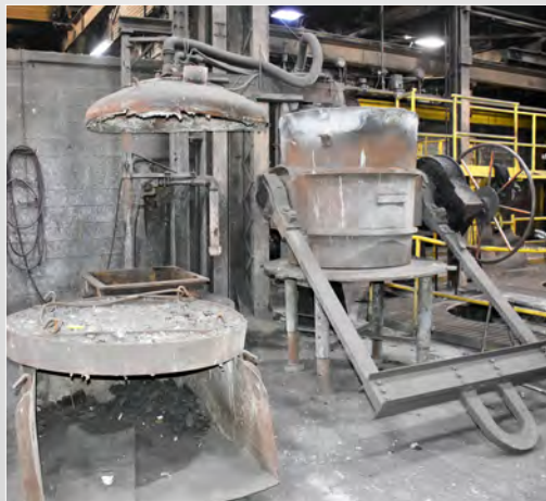
NORTH AMERICAN GAS FIRED LADLE PREHEAT SYSTEM