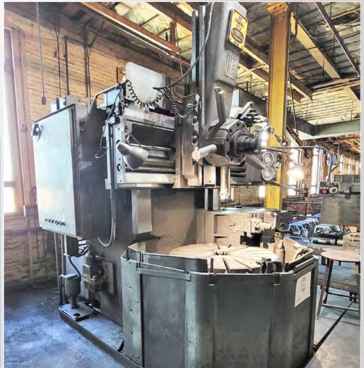
BULLARD 36" DYNATROL VTL