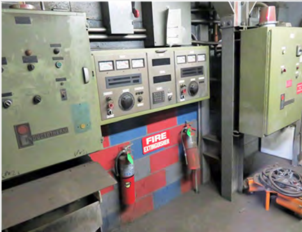
INDUCTOTHERM FURNACE CONTROLS