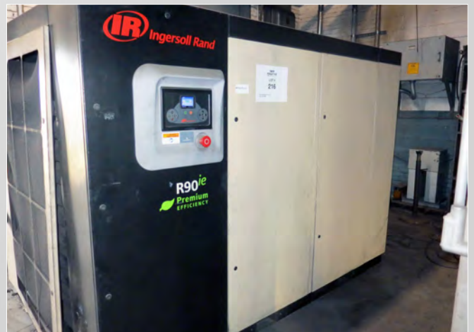
INGERSOLL RAND R90IE AIR COMPRESSOR