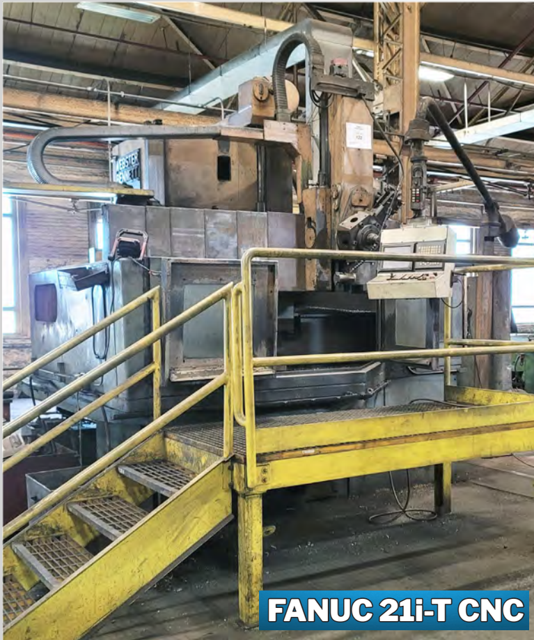
FANUC 21i-T CNC