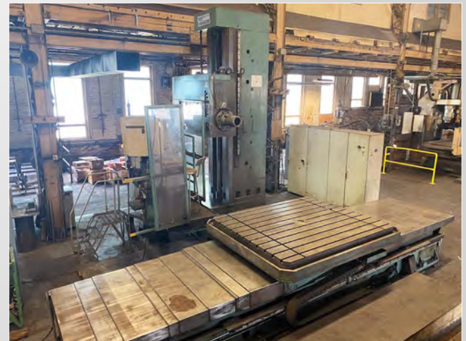
TOS VARNSDORF WHN13 CNC HORIZONTAL BORING MILL

INSPECTION: AUGUST 3, 2021 - 8:00AM - 3:00PM AND BY APPOINTMENT Assets Located at: 15-17 Allen Street, Hudson Falls, New York 12839