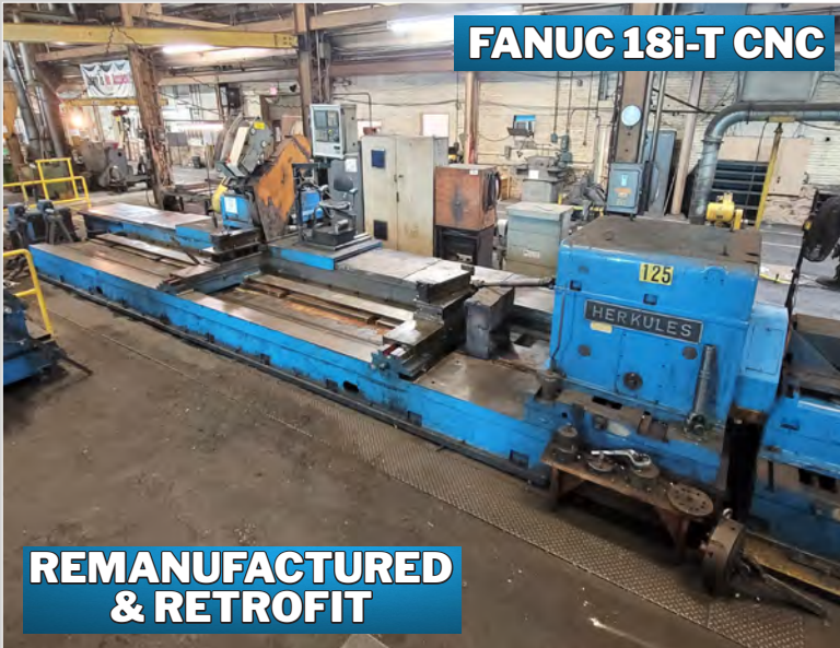
HERKULES WSB450 CNC ROLL GRINDER

BidSpotter WEDNESDAY, AUGUST 4 TH , 2021 @ 10:00AM ET