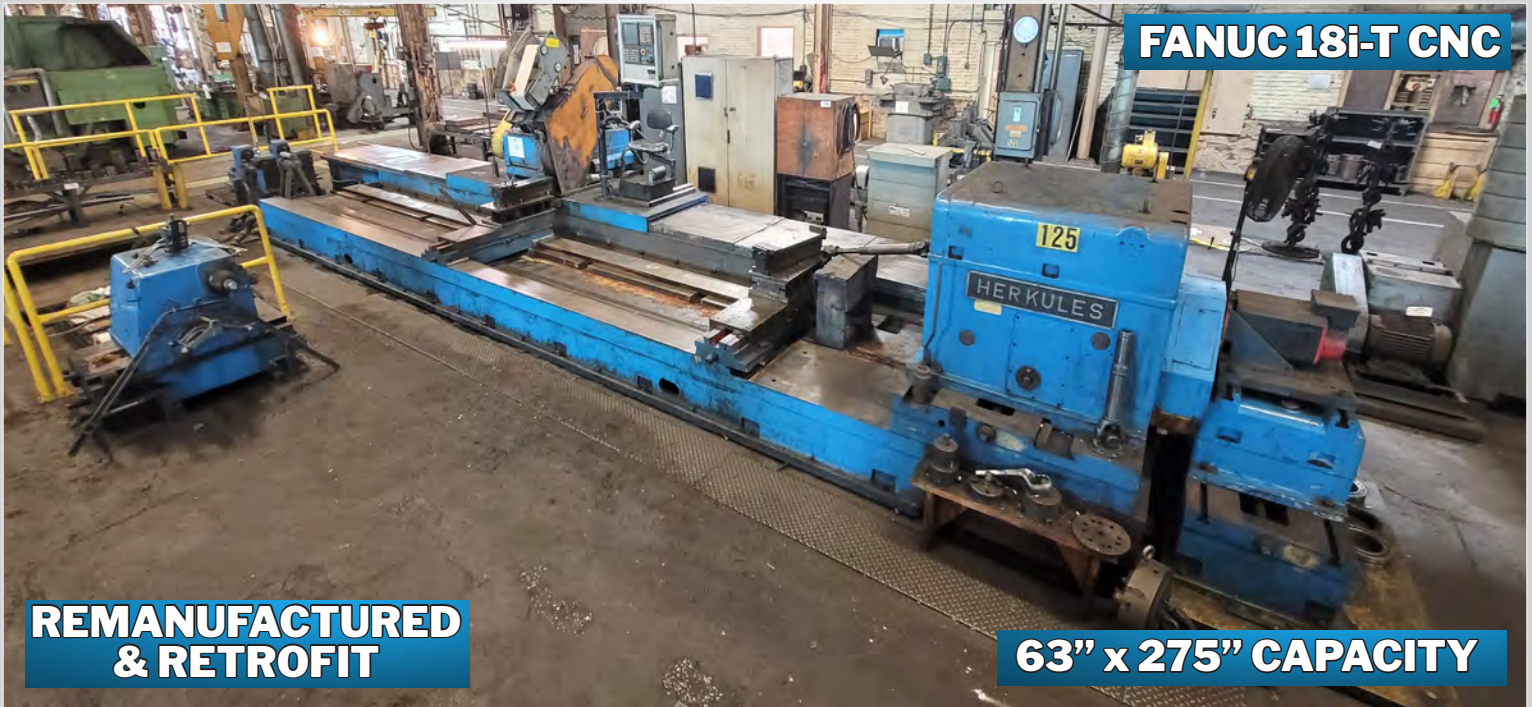
HERKULES WSB450 CNC ROLL GRINDER