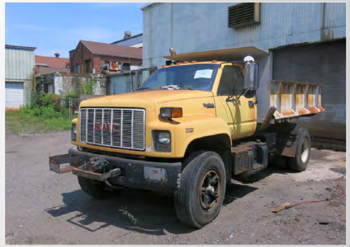
GMC TOPKICK DUMPTRUCK

**PAYMENT: A buyer's premium of 18% will be charged to all purchases. ALL PURCHASES MUST BE PAID IN FULL UPON RECEIPT OF AN INVOICE. An electronic invoice will be sent to the successful bidder at the email address provided during registration, typically within 24 hours after the auction ends. Upon notification of being the successful bidder, Purchasers will have 48 hours to pay in full via wire transfer, certified check or company check. PLEASE NOTE, all company checks MUST be accompanied by a bank letter of guarantee made out to Prestige Equipment Corp. The full purchase price must be paid prior to the removal of any goods.