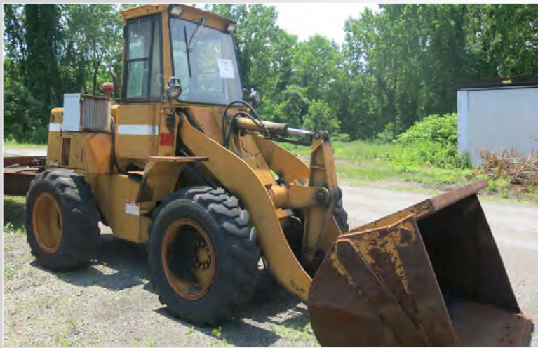
DRESSER 510B DIESEL PAYLOADER