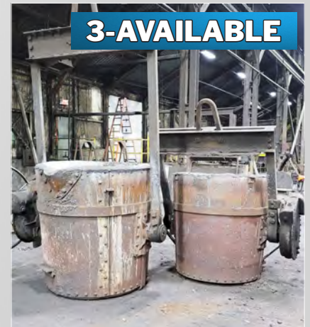
PARTIAL VIEW OF LADLES

FOUNDRY EQUIPMENT: 1998 INDUCTOTHERM 1500 KW 70 HZ FURNACE SYSTEM with (2) 7.5 Ton Furnaces, Complete System with Preheat; 1998 GUDGEON MODEL TF3000 3000# PER HOUR THERMAL RECLAMATION SYSTEM; PANGBORN MECHANICAL RECLAIM SYSTEM WITH G/K VM120 VIBRAMILL, Related Bucket Elevators, Rotoconditioner, Sand Cooler, Transporter; 6' X 10' SHAKEOUT; (2) DEPENDABLE FORDATH CONTINUOUS MIXERS WITH PUMPS AND CONTROLS; PALMER M50 CONTINUOUS MIXER WITH FEED BUCKET ELEVATOR AND HOPPER; QUIPTECH 2000# MOLD HANDLER; (3) 48"-58" GEARED LIP POUR LADLES; NORTH AMERICAN GAS FIRED LADLE PREHEAT SYSTEM WITH BLOWER; PANGBORN SAND RECLAMATION SYSTEM [1980]; SHAKE OUT TABLE