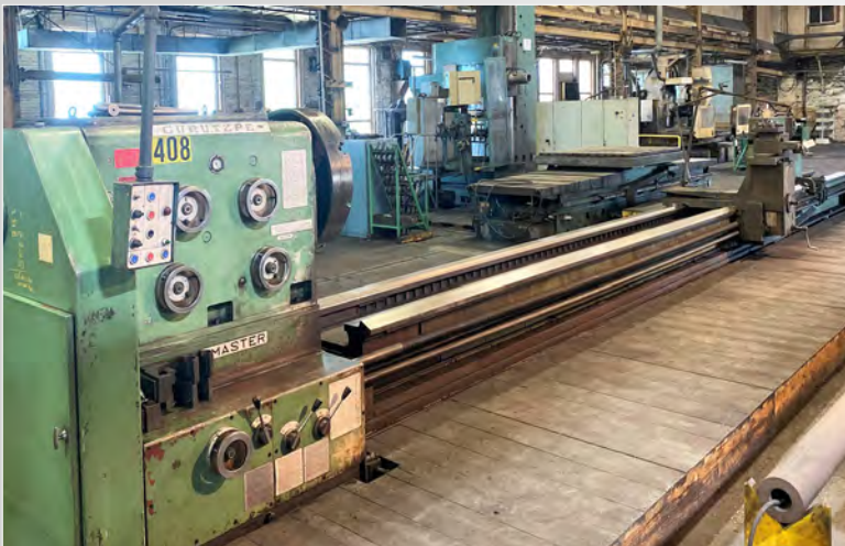
GURUTZPE TIMEMASTER SUPER BT HEAVY DUTY LATHE