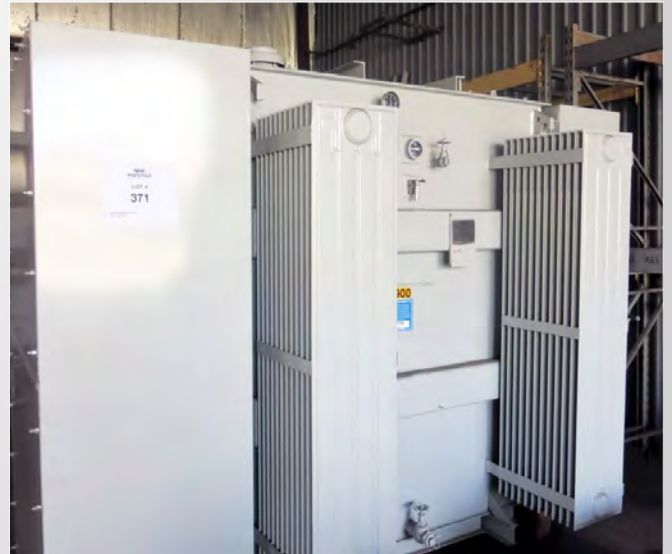
MYERS 1900 KVA TRANSFORMER