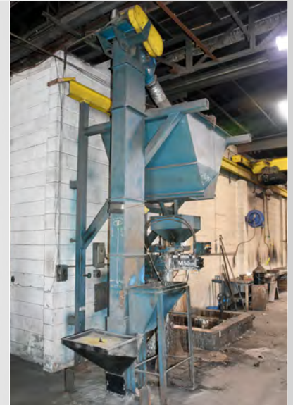
PALMER M50 CONTINUOUS MIXER