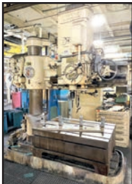
4' CINCINNATI BICKFORD RADIAL ARM DRILL