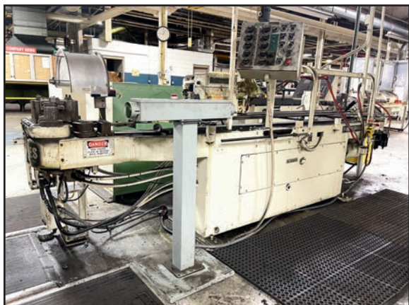
(1 OF 2) TELEDYNE PINES #1 TUBE BENDERS