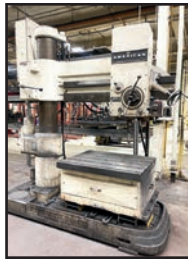
4' AMERICAN RADIAL ARM DRILL