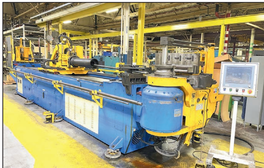
HMT CNC130TBRE-RBE TUBE BENDER

MARVEL 81A11PC VERTICAL BANDSAW, s/n E-476111PC; MARVEL 8-MARK-II VERTICAL BANDSAW, s/n 830276; SCOTCHMAN VC-20 VERTICAL BANDSAW, s/n 555-05050025; METALMIZER MS2018 VERTICAL BANDSAW, s/n MS0192226; COLONIAL HAS 15-72 HORIZONTAL BROACH, s/n M-11439; CINCINNATI BICKFORD SUPER SERVICE 4' X 11" RADIAL ARM DRILL, s/n 1800; (2) AMERICAN HOLE WIZARD 4' X 11" RADIAL ARM DRILLS, s/n 77780, NA; AMERICAN HOLE WIZARD 3' X 11" RADIAL ARM DRILL, s/n NA; (2) AMERICAN HOLE WIZARD 3' X 9" RADIAL ARM DRILLS, s/n NA; (2) NEWEN CONTOUR C6 VALVE SEAT AND GUIDE MACHINES W/AXIOMTEK CONTROLS; (3) FOOTE-BURT/HAMMOND CLEVELAND DRILL PRESSES, s/n 2547-64, 2096-49, 2380-55; ALLEN 6-SPINDLE GANG DRILL; CLAUSING 1687 3-HEAD GANG DRILL; CLAUSING 2285 2-HEAD GANG DRILL, s/n 525874/5; CLAUSING 1687 DRILL PRESS, s/n 128231; KIRA KRTG-540 DRILL PRESS, s/n 53403, w/Tapping Head; US ELECTRIC 500 PEDESTAL GRINDER, s/n 283763; US ELECTRIC 10" UTILITY GRINDER, s/n 534122; EISELE VMS 350 PV COLD SAW, s/n 02008; DAYTON 2PA29A COMBINATION 6" BELT/9" DISC SANDER, s/n 20076; OLIVER 600 HEAVY DUTY DRILL GRINDER, s/n G8076; CINCINNATI MILACRON 2MT CUTTER AND TOOL GRINDER, s/n 7703A01-90-0120; LSMW ACCU-TAPPER; CUSTOM HEATED WASH TANK, w/24" x 96" Tank, Square D Control; ROYSON VIBRATORY TUMBLER, s/n NA; SUNNEN MBB-1670EJIC HONE, s/n 70097