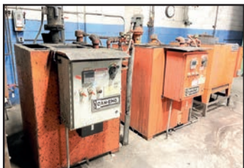
CAN-ENG QUENCH LINE