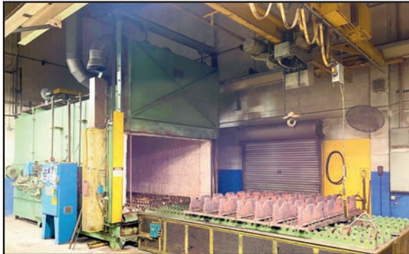
J.L. BECKER BOX FURNACE