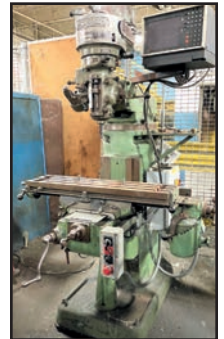
BRIDGEPORT MILLING MACHINE