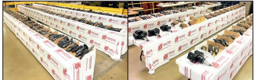
VIEW OF TOOL HOLDERS

Pre-Auction Offers Invited on Major Assets