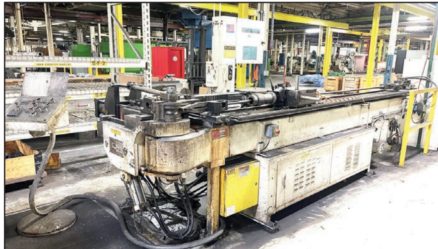
EATON LEONARD EL400HD TUBE BENDER