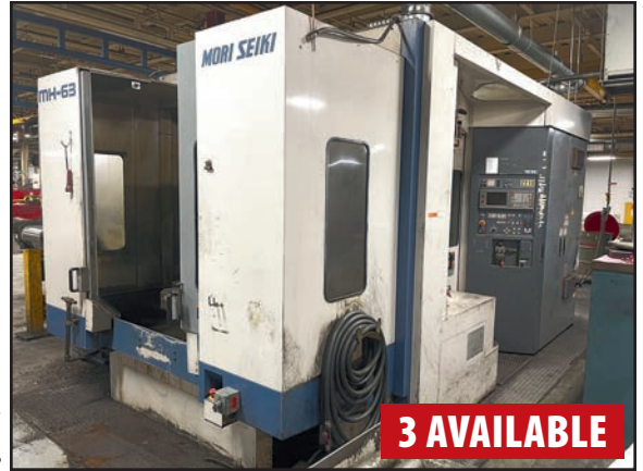
MORI SEIKI MH-63 HORIZONTAL MACHINING CENTER