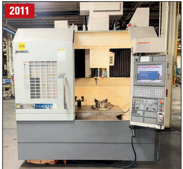
OKUMA GENOS M460-VE VERTICAL MACHINING CENTER