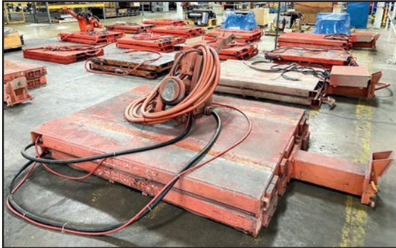
AIR FLOAT SYSTEMS