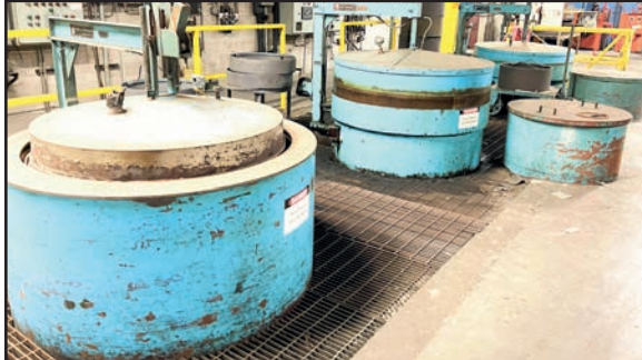
LEEDS & NORTHRUP HOMO NITRIDING FURNACE LINE