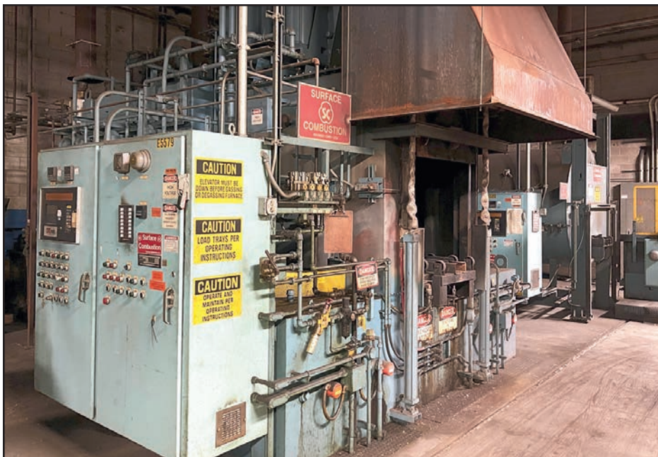
SURFACE COMBUSTION ALL-CASE FURNACE