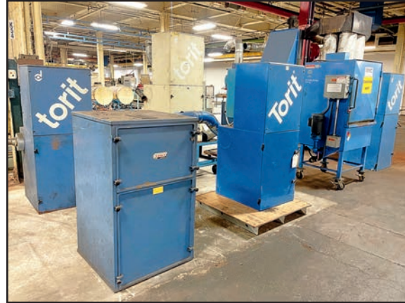
TORIT DUST COLLECTORS

PEDESTAL GRINDERS, SANDERS, ARBOR PRESSES, DRILL PRESSES, PNEUMATIC TOOLS, BENCH VISES, MACHINES VISES, GRINDING VISES, CAT 40 TOOLING, CAT 50 TOOLING, PERISHABLE TOOLING, HAIRER SHRINK-FIT MACHINE, PIPE BENDER TOOLING, STANLEY VIDMAR AND LISTA TOOL CABINETS, TORIT DUST COLLECTORS, SELF-DUMPING HOPPERS, WORK BENCHES, LOCKERS, OVER (50) BRIDGE CRANE SYSTEMS, NEW SHAW-BOX HOISTS, AIR FLOAT SYSTEMS UP TO 13,000 LB CAPACITY, HUGE SELECTION OF PALLET JACK, ELECTRIC PALLET JACKS AND WALKIE-STACKERS FROM HYSTER, CROWN, CLARK