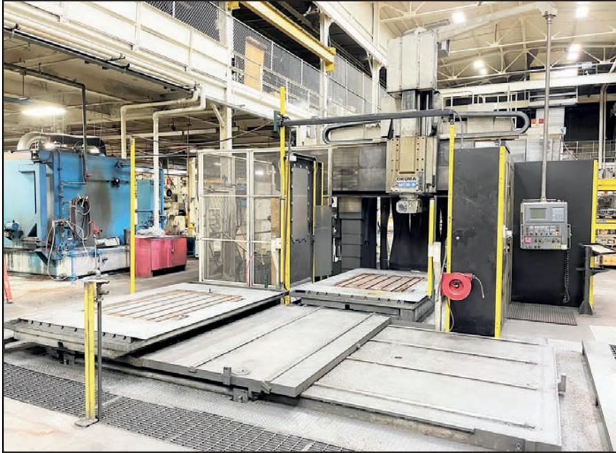
OKUMA MCM-20B BRIDGE MILL

6" GIDDINGS & LEWIS HORIZONTAL BORING MILL , s/n 455-53-80, w/NUMERIPATH 800N Control, 20' x 5' Main Table w/Rotary Positioner, 6' x 5' Table w/4' x 6' Rotary Table