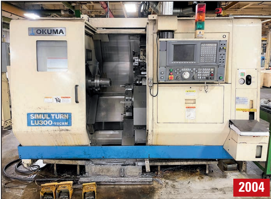
OKUMA LU300-V8CAM TURNING CENTER