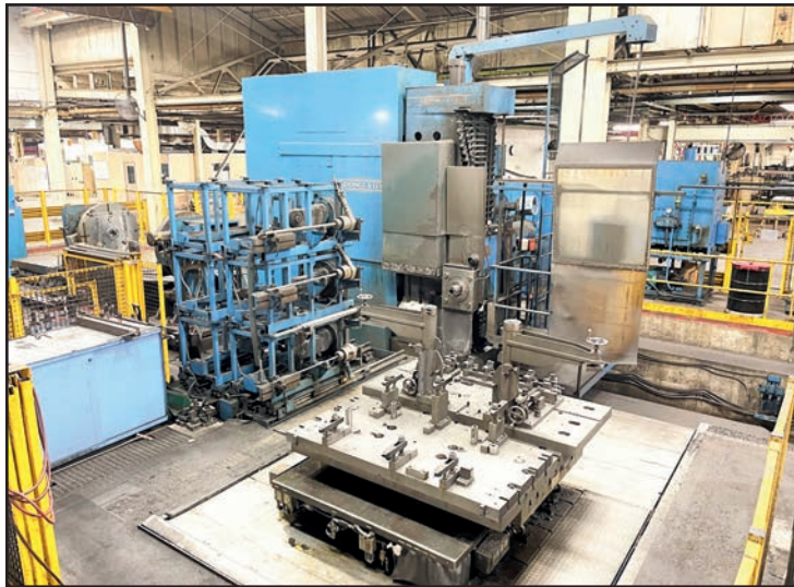
6" GIDDINGS & LEWIS HORIZONTAL BORING MILL