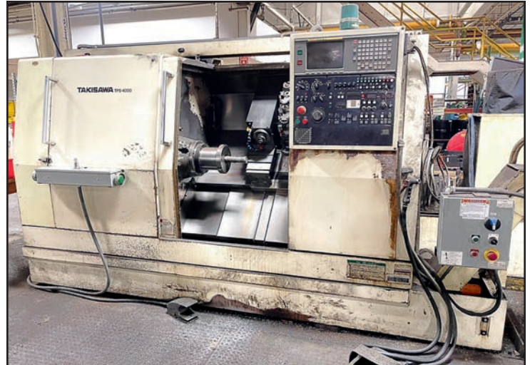
TAKISAWA TPS-4000 TURNING CENTER