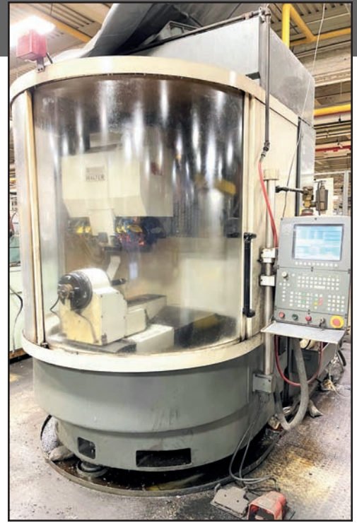
WALTER HELITRONIC POWER CNC TOOL AND CUTTER GRINDER

ALSO: CINCINNATI MONOSET CUTTER AND TOOL GRINDER , s/n 3152A0178-0005; (2) CINCINNATI MILACRON CUTTER GRINDERS ; G&L WINSLOMATIC HR DRILL GRINDER , s/n 947-00071-85; HYBCO 100 TAP GRINDER , s/n 7741; EX-CELL-O CARBOLOY DIAMOND WHEEL GRINDER ; HEALD NO. 47A BOREMATIC TOOL SHARPENER , s/n 5994