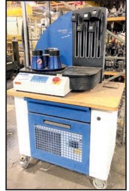
HAIMER SHRINK-FIT MACHINE