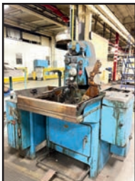
SUNNEN MBB-1670EJC HONE