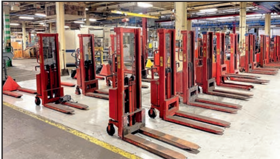
HIGHLIFT PALLET JACKS