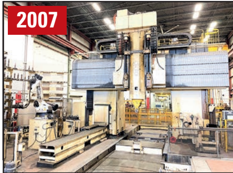
2007 INGERSOLL DOUBLE COLUMN 5-AXIS BRIDGE MILL