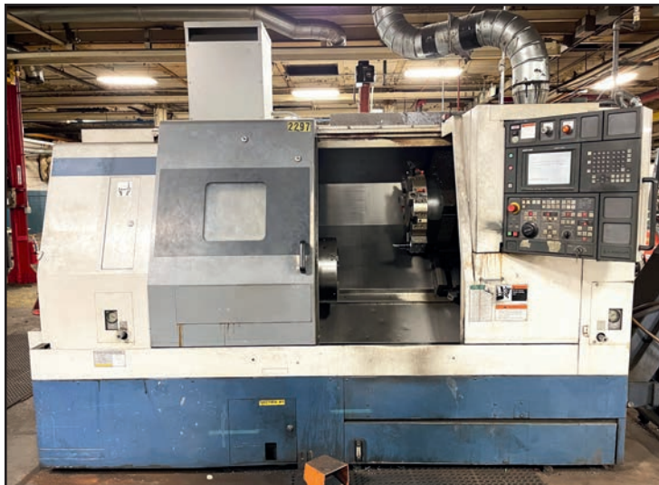
MORI SEIKI SL-300B/700 TURNING CENTER