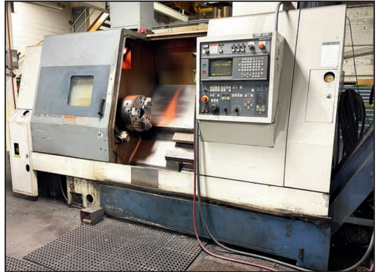
MORI SEIKI SL-35B TURNING CENTER

2007 HAAS TM-1 CNC TOOL ROOM MILL , s/n 1061042, HAAS Control, 10.5" x 47.75" Table, Travels: X-30", Y-12", Z-16", CAT 40