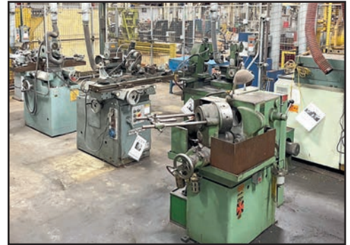
VIEW OF TOOL AND CUTTER GRINDERS