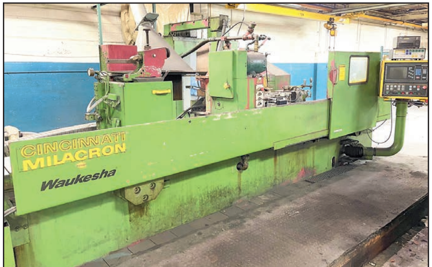
CINCINNATI MILACRON 480 AH CNC STEP GRINDER

Complete Catalog & Information Available at https://perfection.global/inniowaukesha