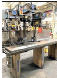
CLAUSING 1687 3-HEAD GANG DRILL