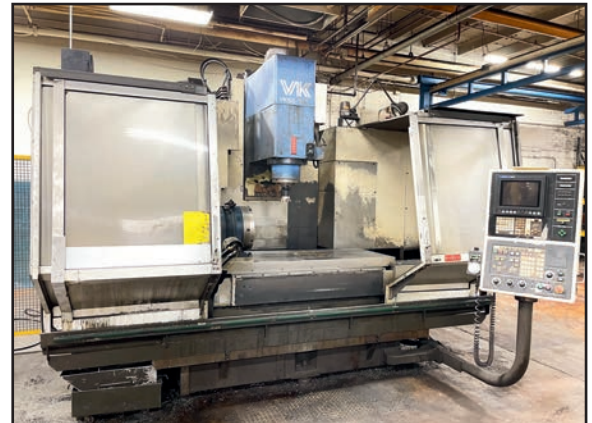
HITACHI SEIKI VK65 VERTICAL MACHINING CENTER