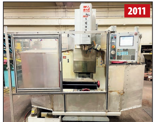
HAAS TM-1 CNC TOOL ROOM MILL

View our current auction schedule at www.perfectionindustrial.com