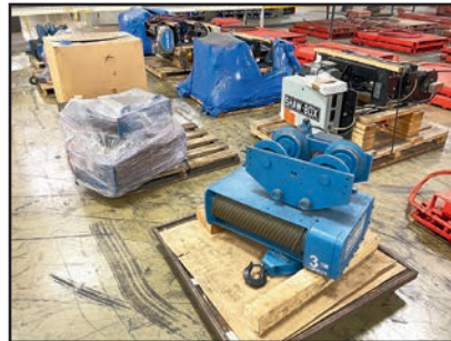
VIEW OF SHAW-BOX HOISTS