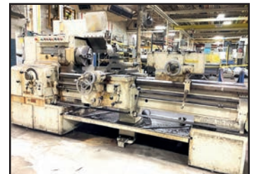
AMERICAN STYLE C 16" X 54" ENGINE LATHE