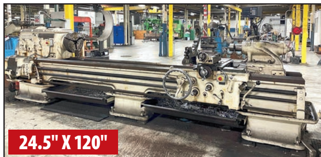
MONARCH 22CM ENGINE LATHE