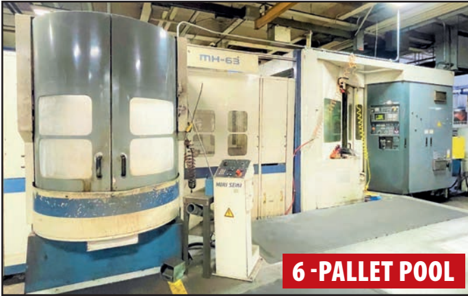
MORI SEIKI MH-63 HORIZONTAL MACHINING CENTER