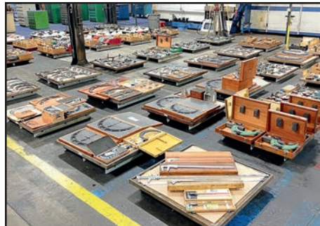
VIEW OF INSPECTION EQUIPMENT