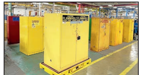
FLAMMABLE LIQUID STORAGE CABINETS