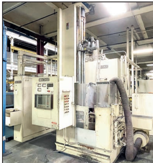
INDUCTOHEAT BSP5-300-3/10 300 KW INDUCTION HEATER

CAN-ENG QUENCH LINE , s/n 100212, w/1218-A Toolmaster Furnace and 200 Gallon Quench Tank