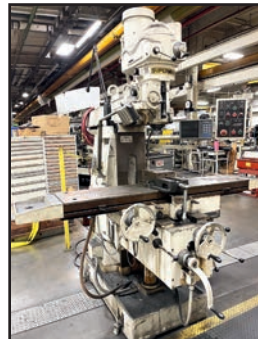
SUPERMAX YCM-2VASK 5 HP MILLING MACHINE