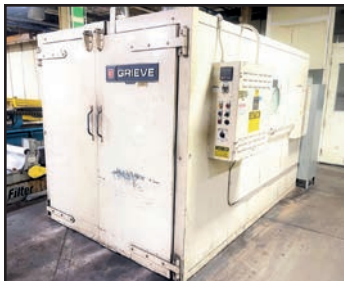
GRIEVE B3-650 60 KW ELECTRIC OVEN