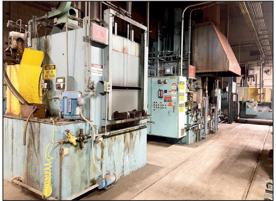
SURFACE COMBUSTION GAS FIRED HEATED DUNK WASHER