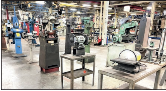
VIEW OF PEDESTAL GRINDERS