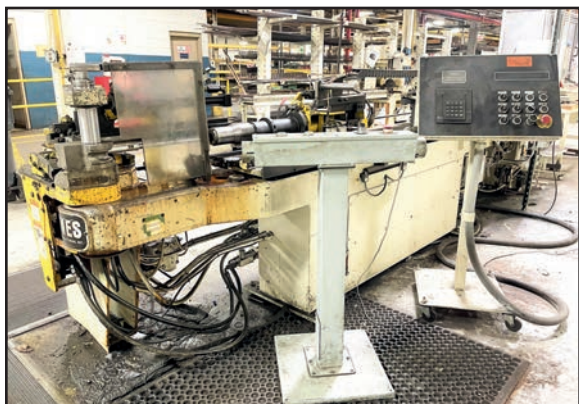
(1 OF 2) TELEDYNE PINES #1 TUBE BENDERS