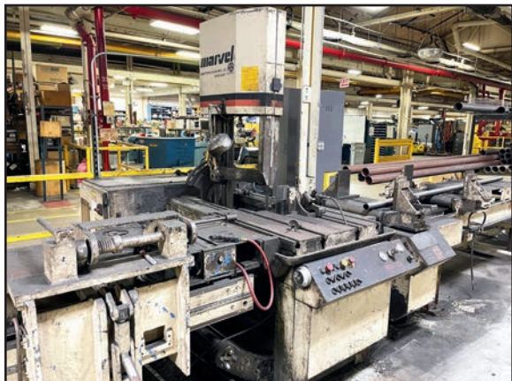
MARVEL 81A11PC VERTICAL BANDSAW