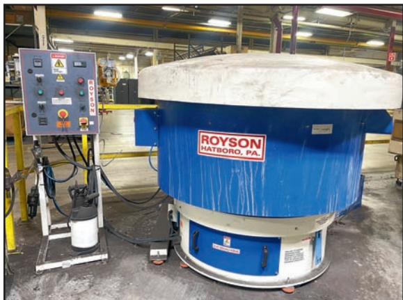
ROYSON VIBRATORY TUMBLER