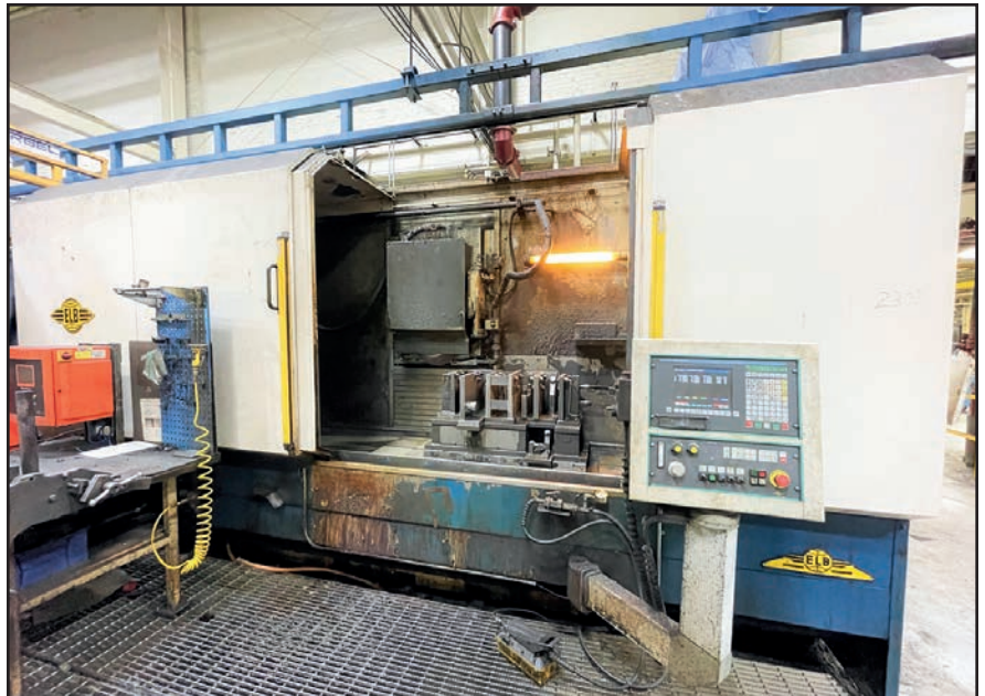
ELB MICRO CUT B12 CNC SURFACE GRINDER