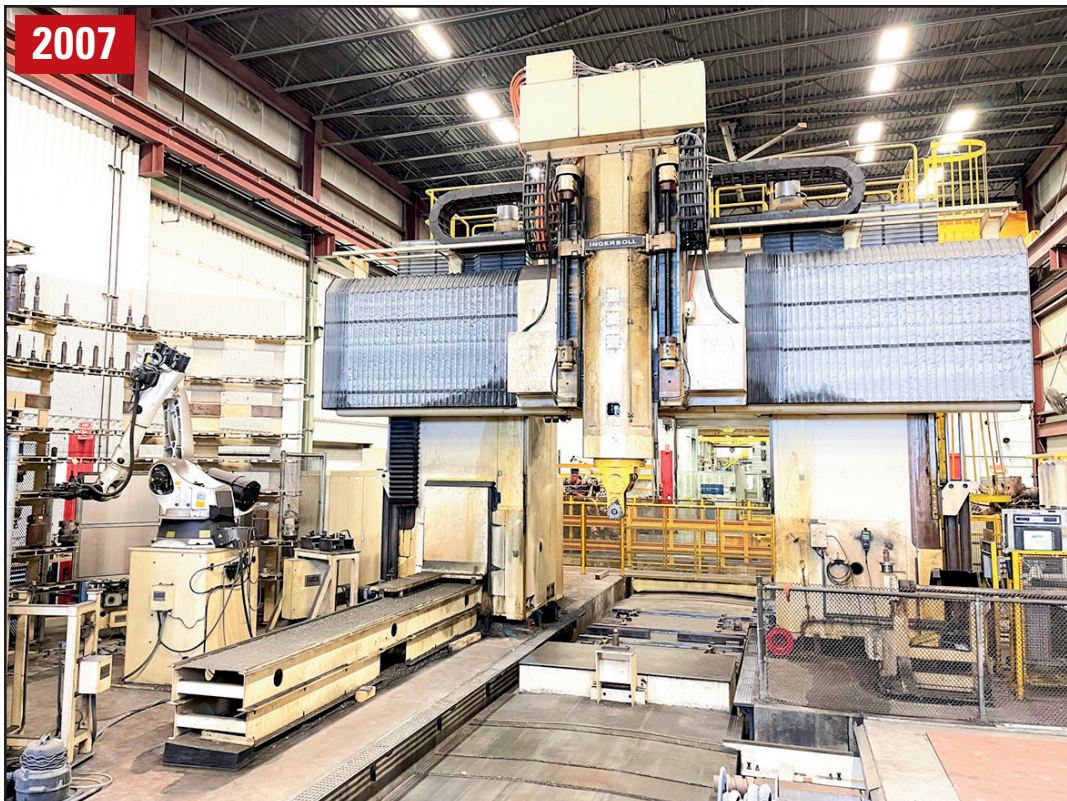
INGERSOLL DOUBLE COLUMN 5-AXIS BRIDGE MILL