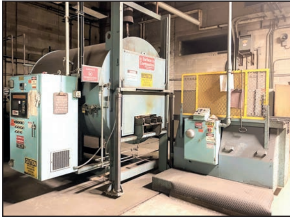
SURFACE COMBUSTION UNI-DRAW FURNACE