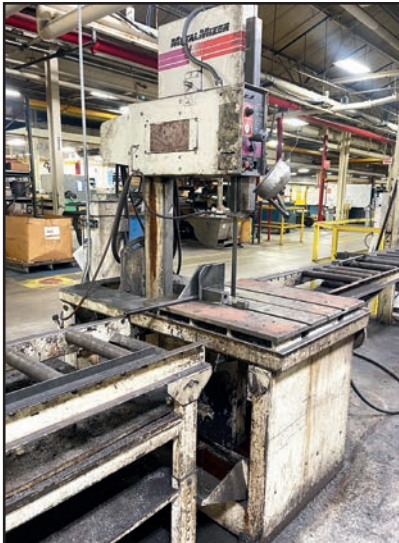
METALMIZER MS2018 VERTICAL BANDSAW

ALSO: LARGE ASSORTMENT OF GRANITE SURFACE PLATES, CALIPERS, HEIGHT GAGES, HARDNESS TESTER, MICROMETERS, SNAP GAGES, RING GAGES, THREAD GAGES, AND MORE