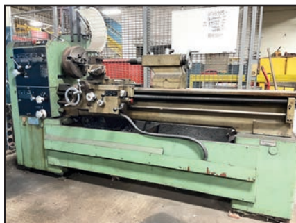
VOEST DA 250 20" X 60" ENGINE LATHE