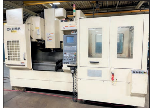
OKUMA MX-45VAE TWIN PALLET VERTICAL MACHINING CENTER