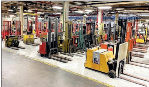
WALKIE TYPE FORKLIFTS