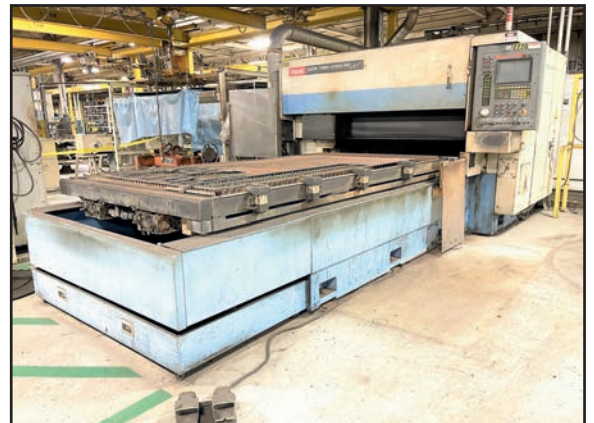
MAZAK SUPER TURBO X510 LASER

MAZAK SUPER TURBO X510 HI-PRO SUPERCHARGED , 2,000 Watt Laser, s/n 125467, w/MAZAK L PLUS Control, 120" x 60" x .75" Max. Workpiece, YB-L200B 7M Co2 Laser