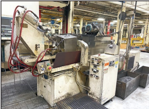
ELDORADO MEGA M75-1013 GUN DRILL