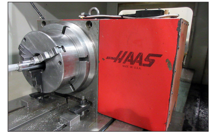
HAAS HRT-310 4th Axis Rotary Table