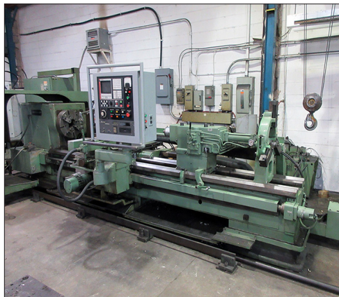
American 32" x 120" Heavy Duty CNC Lathe

DARBERT VERTICAL MILLING MACHINE , 12" x 54" Table, 70-3600 RPM, Power Drawbar, Heidenhain 2-Axis Digital Readout, 5 HP, S/N 9933