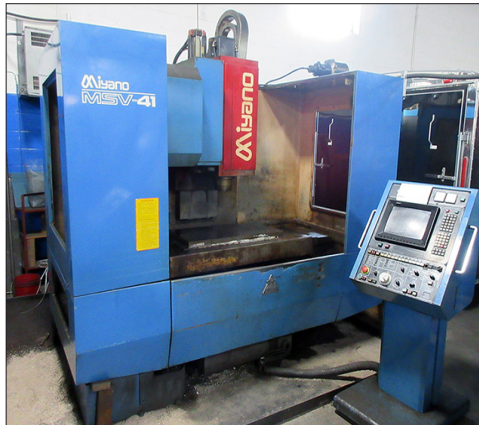
Miyano MSV-41 CNC Vertical Machining Center