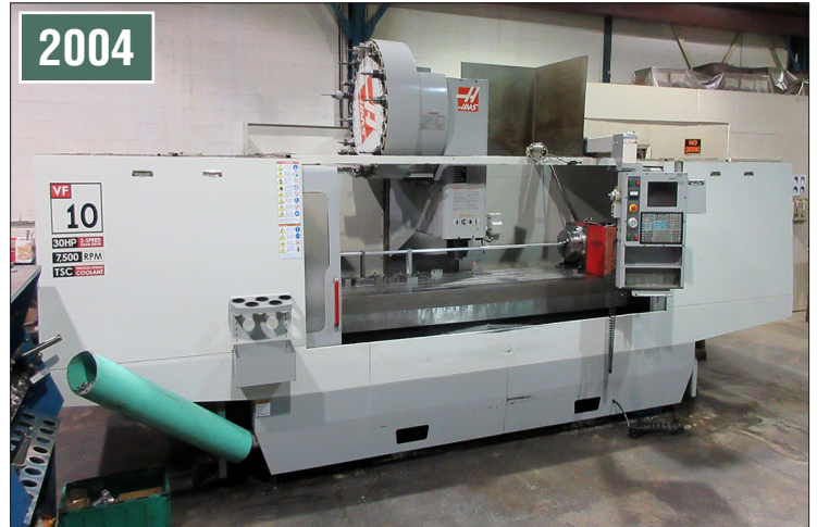
Haas VF-10/50 CNC Vertical Machining Center

HAAS HRT-310 4TH AXIS ROTARY TABLE , w/10" 3-Jaw Chuck and Tailstock