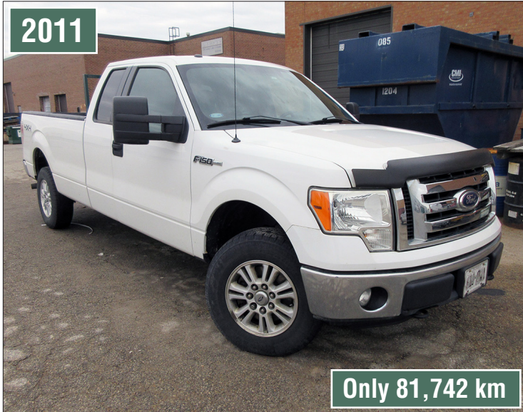
Ford F150 XLT Pickup

2011 FORD F150 XLT PICKUP TRUCK , Duper Cab, 4x4, 5L, V8, 163" wb, HD Package, Hitch Receiver, Bed Liner, 81,742 km Indicated on 04/18, VIN #1FTVX1EF2BKD50158