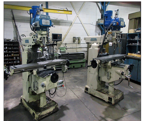
Darbert Vertical Mills