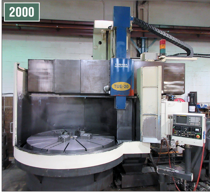
Toshiba TUE-20 CNC Vertical Boring Mill

TOSHIBA TUE-15 CNC VERTICAL BORING MILL , Fanuc 0i-TC CNC Control, 59.05" Table w/4-Chuck Jaws, 70.86" Turning Diameter, 59.05" Turning Height, 35.43" Vertical Ram Travel, Table Speeds 2-250 RPM, Table Capacity 17,600 Lbs., 12ATC, Coolant, Chip Conveyor, S/N 440373, (2008)