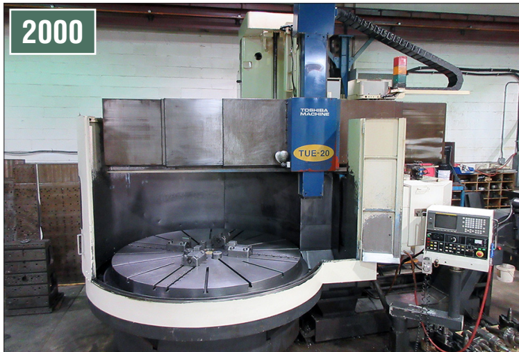
Toshiba TUE-20 CNC Vertical Boring Mill

FEATURING: Toshiba CNC Vertical Boring Mills, Toshiba BP.110.R16 CNC Horizontal Boring Mill, Haas CNC Vertical Machining Centers, CNC & Manual Lathes, Shop Support, Tooling, Saws, Angle Plates, Inspection and More!