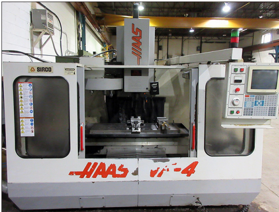
Haas VF-4 CNC Vertical Machining Center