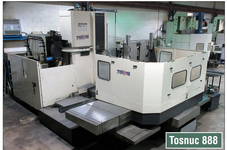
Toshiba BTD-110.R16 CNC Table Type Horizontal Boring Mill