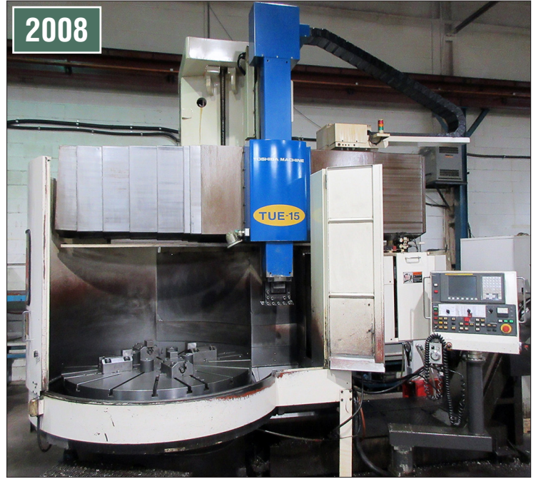
Toshiba TUE-15 CNC Vertical Boring Mill