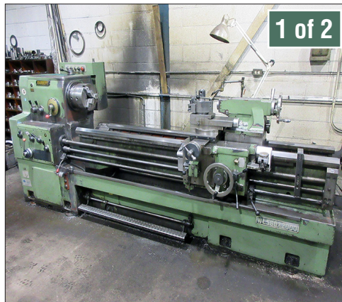
Darbert WL580x2000 Gap Bed Engine Lathe