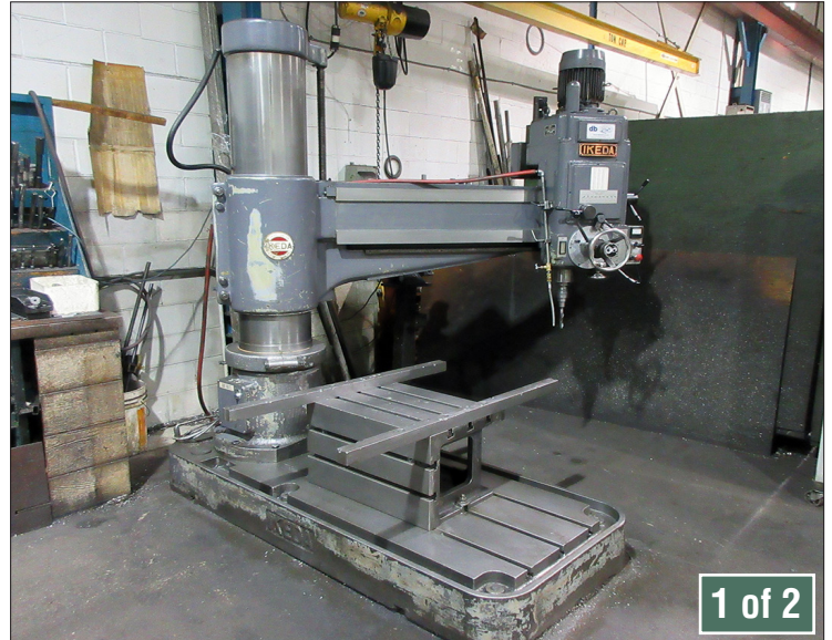
Ikeda RMA-1300 Radial Drill