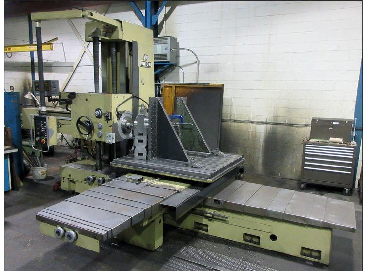
Union BFT 90/3-1 Table Type Horizontal Boring Mill

UNION BFT 90/3-1 TABLE TYPE HORIZONTAL BORING MILL , 3.54" Spindle Diameter, X-62.99", Y-49.21", Z-Axis (Table In/Out)- 62.99", 49" x 55" Built in Rotary Table, Heidenhain 4-Axis Digital Readout, Universal Angle Head Attachment, S/N 19311-04, SEE VIDEO: https://youtu.be/zyWYN9hXgU8