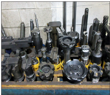
Partial View of Tooling

D'ANDREA TA 200 EXTRA SENSITIVE PRECISION TOOL ACCESSORY , HUGE SELECTION OF HEAVY DUTY CAT 50 TOOLING , (12+) ASSORTED HEAVY DUTY ANGLE PLATES , PRECISION INSPECTION TOOLS , TOOLING CABINETS , CONTENTS , MACHINE ATTACHMENTS , RACKING , SAWS , GRINDERS , SURFACE GRINDER , MATERIALS , ANGLE PLATES , CABINETS , PALLET JACKS , MAG LIFTS , OFFICE FURNITURE & MORE