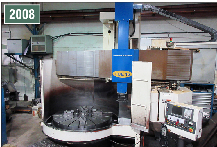
Toshiba TUE-15 CNC Vertical Boring Mill