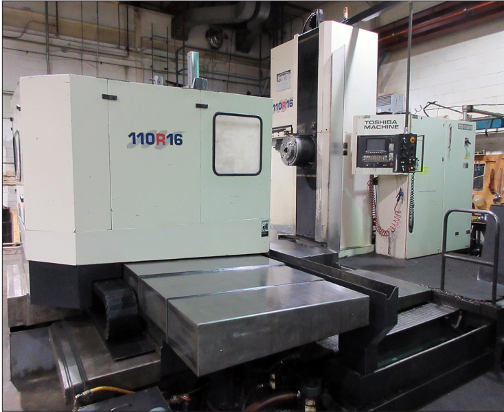
Toshiba BTD-110.R16 CNC Table Type Horizontal Boring Mill

TOSHIBA BTD-110.R16 CNC TABLE TYPE HORIZONTAL BORING MILL , 4.33" Spindle Dia., Tosnuc 888 CNC Control, X-98.42", Y-59.05", Z-19.68", W-57.08", 55" x 63" B-Axis Rotary Table, Spindle Speeds 5-3000 RPM, Table Cap. 22,000 Lbs., 60 ATC, Ext. Travel (X-Axis), Thru Spindle Coolant, Chip Conveyor, 40 HP, S/N 143964, (1997), SEE VIDEO: https://youtu.be/zyWYN9hXgU8