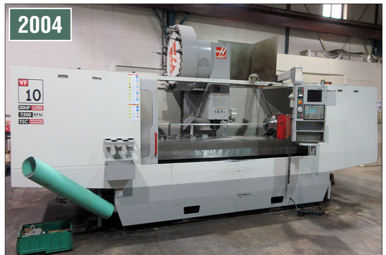
Haas VF-10/50 CNC Vertical Machining Center