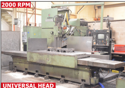
TOS KURIM FSS80 CNC bed type milling machine