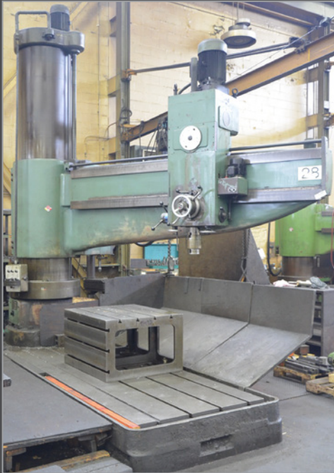
UCIMU 10' radial arm drill