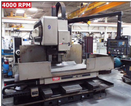
ENSHU VMC 650 CNC vertical machining center