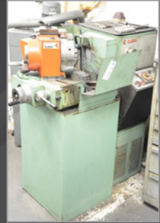
CUOGHI APE 60 tool and cutter grinder