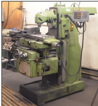
LAGUN FU.1 universal milling machine