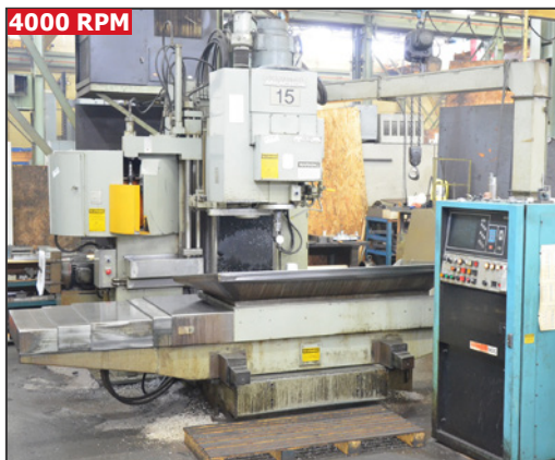
CINCINNATI MILACRON 10VC-1250 CNC vertical machining center