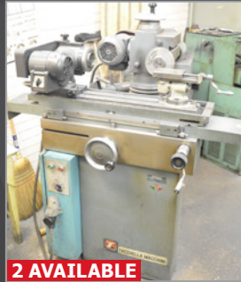
2 AVAILABLE TACCHELLA MACCHINE 401.R universal tool and cutter grinder