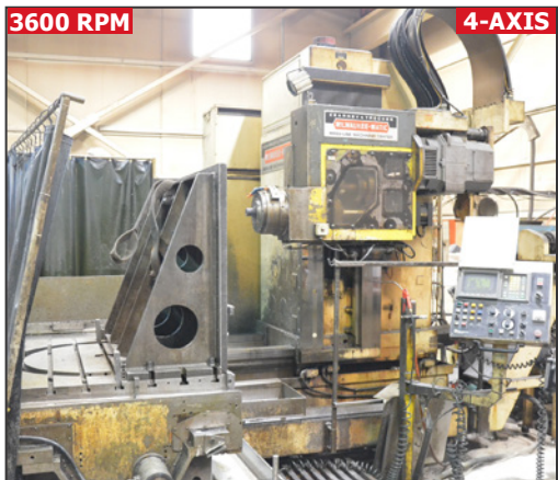
KEARNEY & TRECKER MILWAUKEE-MATIC MODU-LINE 4-axis horizontal machining center

THIS BROCHURE IS ONLY A PARTIAL LISTING. PLEASE VISIT OUR WEBSITE