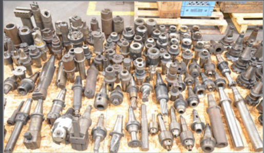
Partial view of tool holders & tooling available

FEATURING: TOS ISO 16 power rotary table with 80"x80" table, 16 ton capacity, s/n: 02-12; machine tool accessories comprising rotary tables; indexing and dividing heads, angle plates, chucks and lathe accessories; LARGE SELECTION of CAT 50 & 50 taper tool holders; selection of brand name perishable tooling mostly brand new never used including end mills, drills, reamers, taps, carbide cutters, carbide insert cutters, carbide inserts AND MORE!