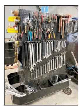
VIEW OF HAND TOOLS