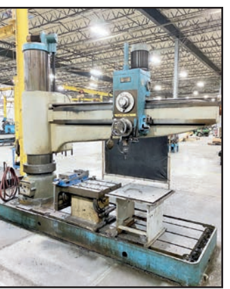
VIEW OF TOOLING