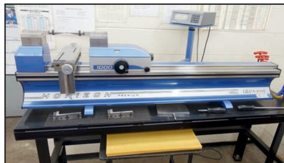
TRIMOS HORIZON PREMIUM 1000 HORIZONTAL DIGITAL MEASURING GAGE

ALSO: Large Selection of Inspection Gauges and Instruments, Pallet