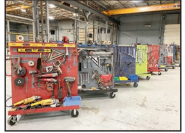
VIEW OF ASSORTED TOOLING CARTS