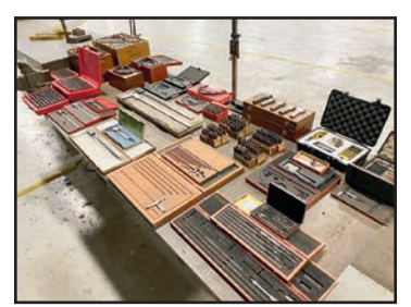
VIEW OF INSPECTION EQUIPMENT