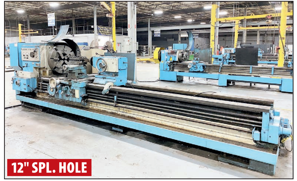
LODGE & SHIPLEY 2XE3220 40" X 144" HOLLOW SPINDLE LATHE