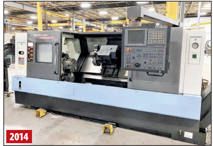
(1 OF 2) DOOSAN PUMA 300LC CNC TURNING CENTERS