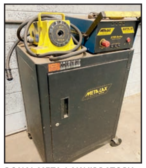
BONAL META-LAX VIBRATORY STRESS RELIEF AND WELD CONDITIONING SYSTEM

JET J-4210K 6" Belt/10" Disc Combination Sander, s/n 1710193; BARRETT B-85 Giant Pneumatic Air Riveter, s/n 1080L; HAMMOND 14-S Dual End Grinder, s/n 1970; ELECTRO ARC 2SA Metal Disintegrator, s/n 2063; RIDGID 8-500 Transportable Pipe Beveler; RIDGID 535 Pipe Threader