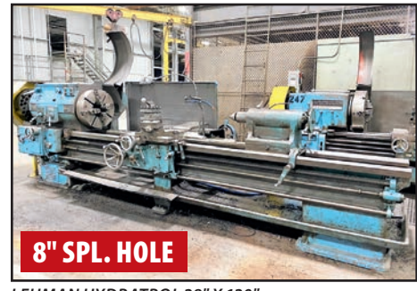
LEHMAN HYDRATROL 28" X 120" HOLLOW SPINDLE LATHE

LEBLOND REGAL 28" X 60" HOLLOW SPINDLE LATHE, s/n 2H599, w/9" Spindle Hole, 24" 4-Jaw Chuck, 9-400 RPM, (2) Steady Rests, Tailstock