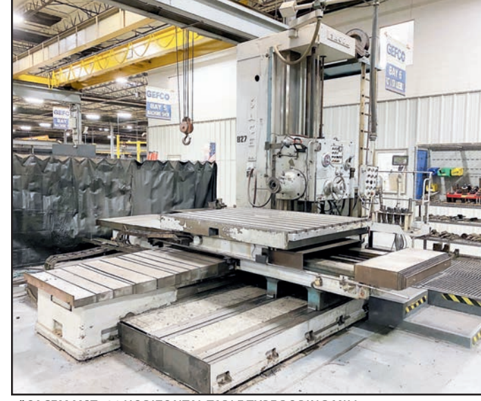
5" SACEM MST 130 HORIZONTAL TABLE TYPE BORING MILL