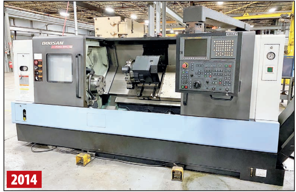
DOOSAN PUMA 300LC CNC TURNING CENTER