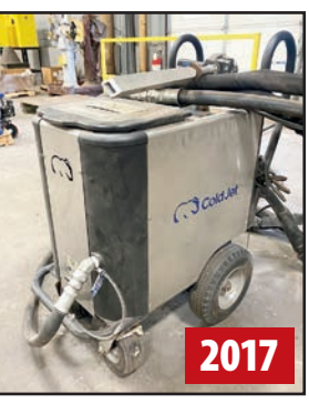
COLD JET AERO 40FP DRY ICE BLASTER