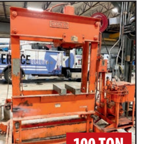
NUGIER H-100 MD HYDRAULIC H-FRAME PRESS

KR WILSON 37FMD1 75 TON HYDRAULIC H-FRAME SHOP PRESS, s/n 1066, w/ ENERPAC PER3042A 10,000 PSI Hyd. Pump System