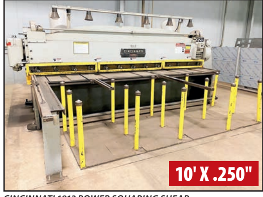
CINCINNATI 1812 POWER SQUARING SHEAR