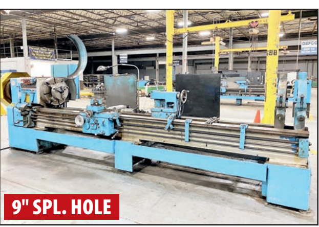
LEBLOND REGAL 24"X 120" HOLLOW SPINDLE LATHE