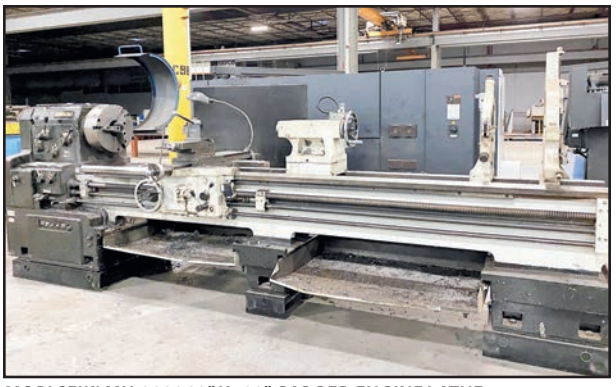
MORI SEIKI MH-3000 33" X 120" GAP BED ENGINE LATHE