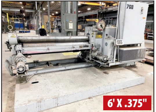
RERTSCH 6'X 375" 3-ROLL PLATE RENDING ROLL