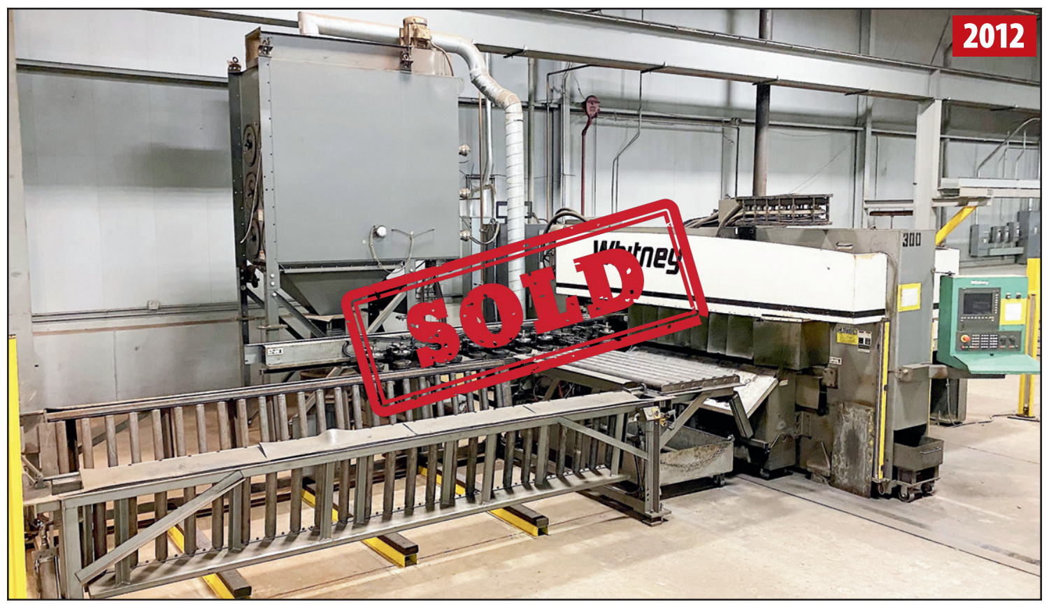
WHITNEY XP 3400 CNC PUNCH/PLASMA SYSTEM *SOLD*

FEATURING: 2012 WHITNEY 3400 XP Combination Punch/Plasma Machine, (2) 2014 DOOSAN PUMA 300 LC Turning Centers, SCOTCHMAN DO 120/200 Ironworker, (38) Late Model Miller & Lincoln TIG, MIG & Rip Pulse Welders, Plate Rolls, Fab Equipment, Machine Tools, Inspection, Factory Support Equipment, Large Quantity of Rolling Stock & More!