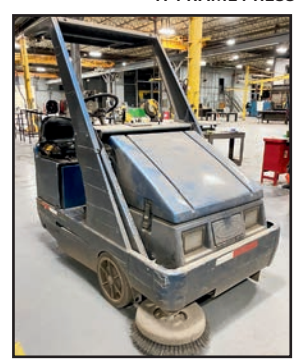
TENNANT 6400 ELECTRIC POWER SWEEPER