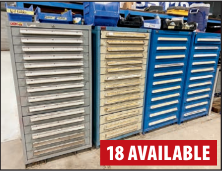
LYON AND VIDMAR MULTI-DRAWER CABINETS