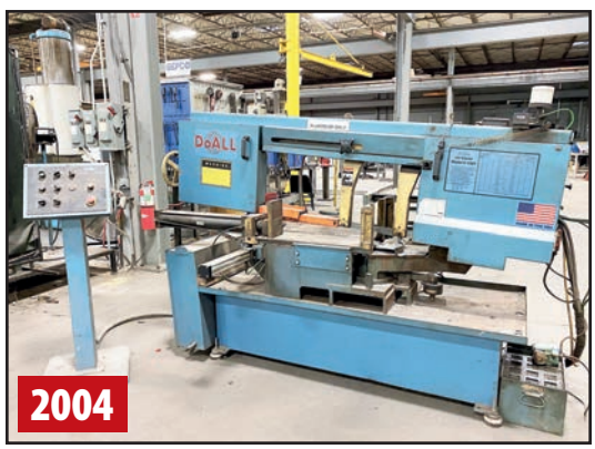
DOALL C-1321 DS HORIZONTAL BANDSAW