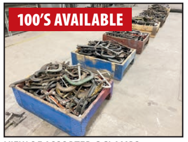
VIEW OF ASSORTED C CLAMPS