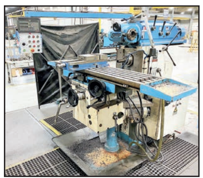
SUMMIT 3UH-P04-0 3-SERIES 5.5 HP