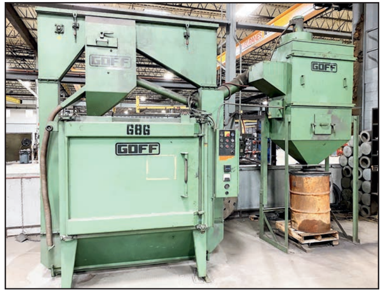
GOFF 48TB TABLE TYPE ABRASIVE BLAST SYSTEM