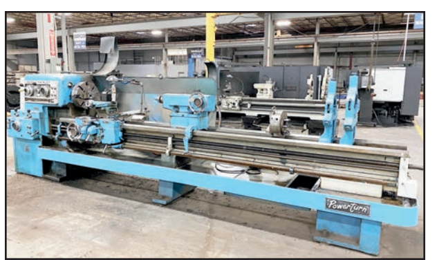
LODGE & SHIPLEY 2013/17 POWERTURN 26" X 120" ENGINE LATHE

KEARNEY AND TRECKER 20 HP HORIZONTAL MILL, s/n 1812-S-1-6050