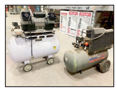
(2) PORTABLE COMPRESSORS