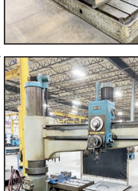
SUMMIT 8'X 18" RADIAL ARM DRILL

CINCINNATI 24" HEAVY DUTY SHAPER, s/n na, w/24.75" Stroke, 20" x 16" Table, 9-119