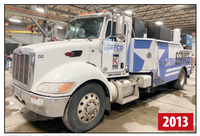
PETERBILT 337 SERVICE TRUCK