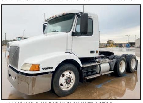
1999 VOLVO DAY CAB HIGHWAY TRACTOR

1992 PARK T/A DUALLY GOOSENECK EQUIPMENT TRAILER, VIN #22808 1994 VIKING T/A DUALLY DROP FRAME TRAILER, VIN #1V9CS3520RN062078 JOHN DEERE GATOR CX UTILITY VEHICLE