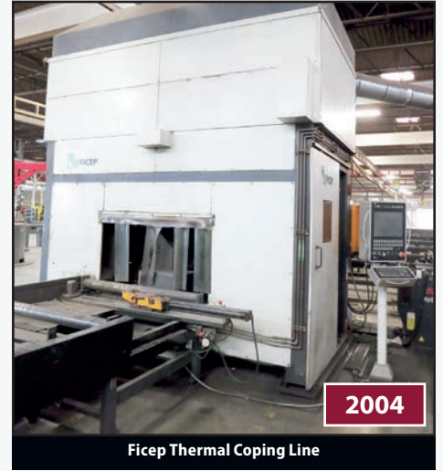
Ficep Thermal Coping Line

FEATURING: 2015 Ficep K100 Band Saw, Drill & Thermal Coping Line, 2015 FICEP 1202 DDRC CNC Drill & FRC Thermal Coping Line, 2004 Ficep 1003 DZB Drill & Ficep SGB 1045 Saw Line & Thermal Coping Line, Forklift Trucks, Bridge Cranes, 2016 Zeiss CMM, Plant Support Equipment as New as 2018