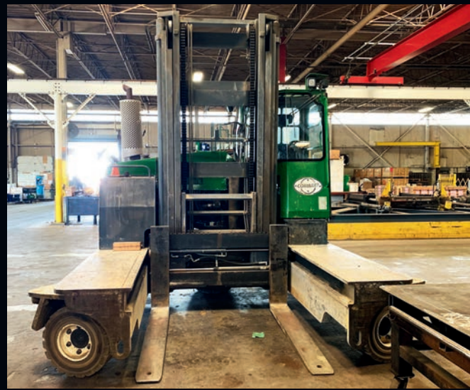
Combi-Lift 10,000-Lb Capacity

Fork Trucks, 10,000-Lb. Combi-Lift, 17,300-Lb. Combi-Lift, 7,000-Lb. Hyster, 6,000-Lb. Nissan, Ottawa Yard Jockey