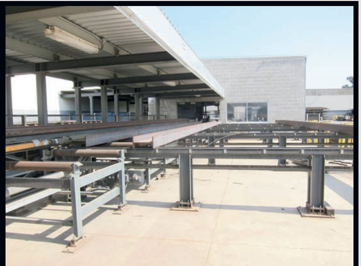
65' Conveyor Carriage In-Feed Conveyor