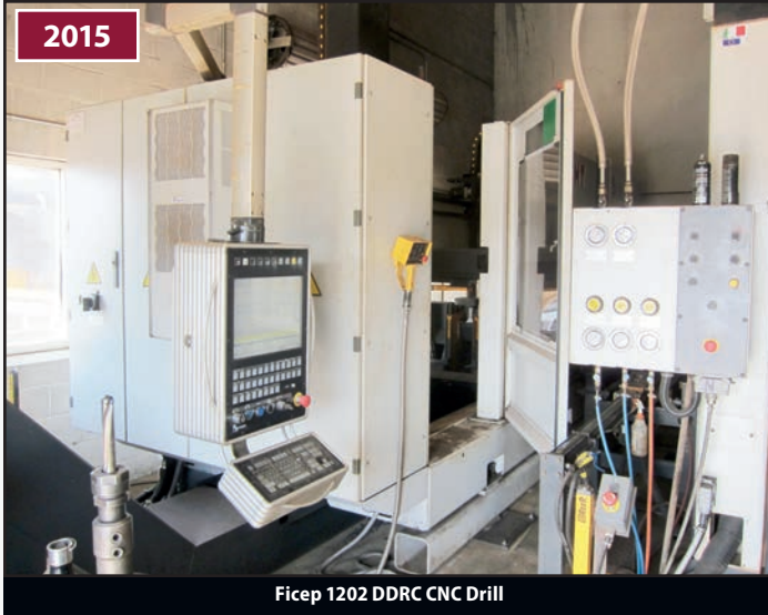
Ficep 1202 DDRC CNC Drill