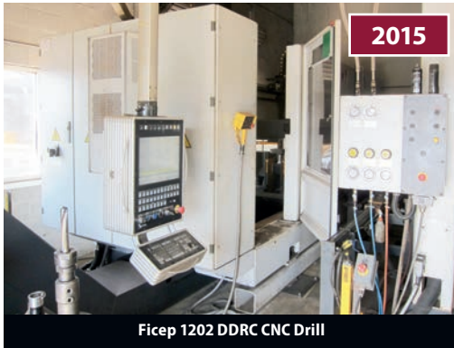
Ficep 1202 DDRC CNC Drill

Presorted First Class Mail U.S. Postage PAID Eugene, Oregon Permit No. 17