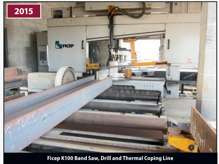
Ficep K100 Band Saw, Drill and Thermal Coping Line

Entertaining Pre-Auction Offers on Major Assets