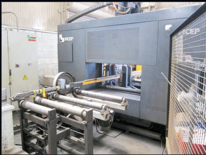
Ficep 1003 DZB Drill Feed, 20 MT Long Bars