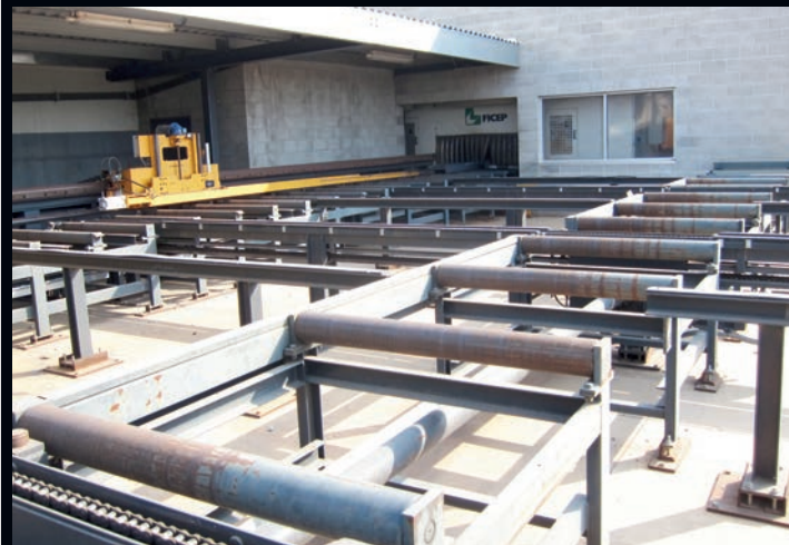
65' Conveyor Carriage In-Feed, 20 MT Long Bars