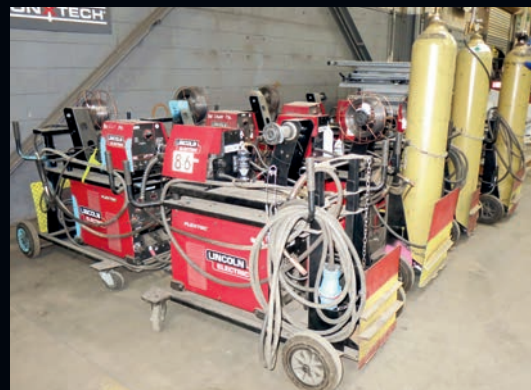
Partial View of Flextec Welders