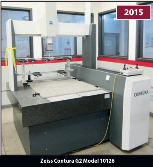
Zeiss Contura G2 Model 10126