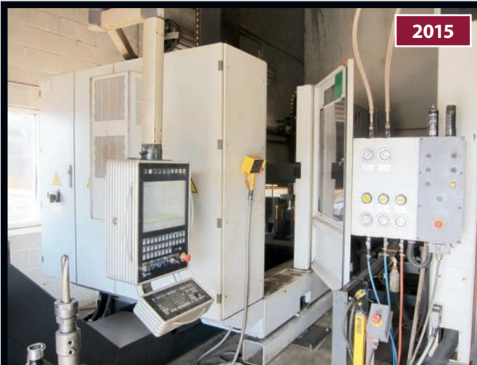
Ficep 1202 DDRC CNC Drill

Inspection/Preview: Available by Appointment Only on Monday, December 7, 2020 from 9:00 a.m. to 4:00 p.m. (PST)