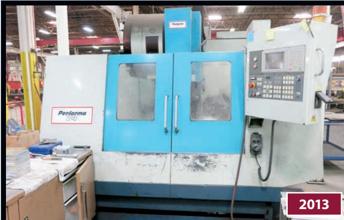
Akira Seiki V-4A VMC

5-Ton 48' Span Double Leg Gantry Crane and Floor Rail, (2) 4-Ton x 48' Span Radio Control Bridge Cranes and Crane Rail, Several Spanco and Gorbel Crane Systems