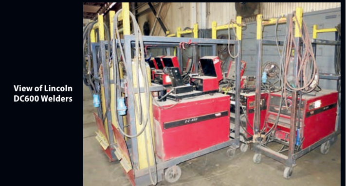
View of Lincoln DC600 Welders