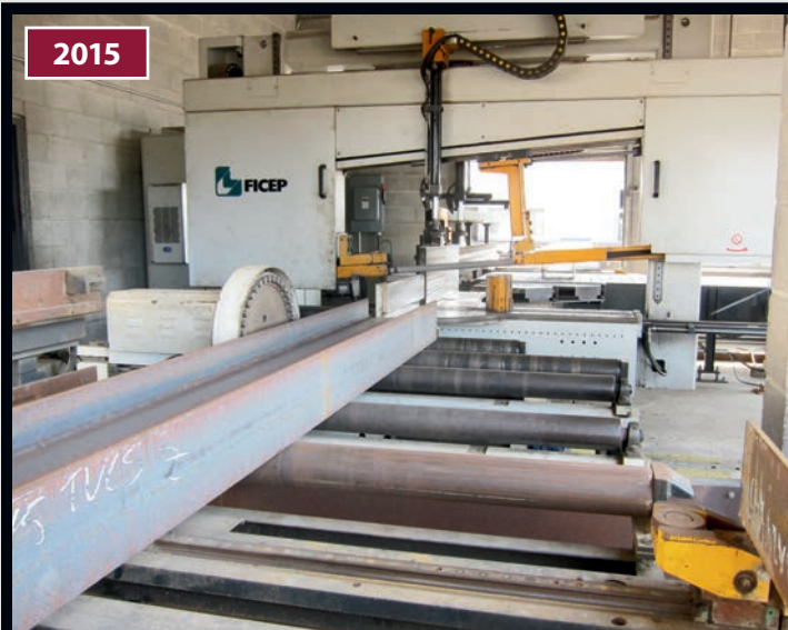
Ficep K100 Band Saw, Drill and Thermal Coping Line