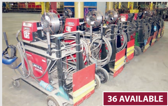
View of Lincoln Flextec Welders, 500 and 450

First Lot Begins to Close: Wednesday, December 9, 2020 at 10:00 a.m. (PST) Inspection/Preview: Available by Appointment Only on Monday, December 7, 2020 from 9:00 a.m. to 4:00 p.m. (PST)