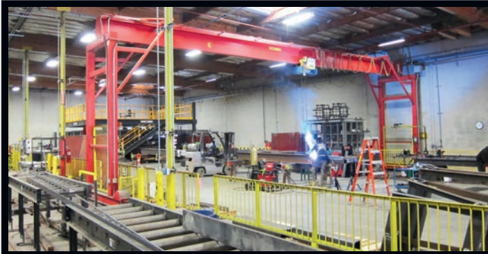
5-Ton 48' Span Double Leg Gantry Crane and Floor Rail