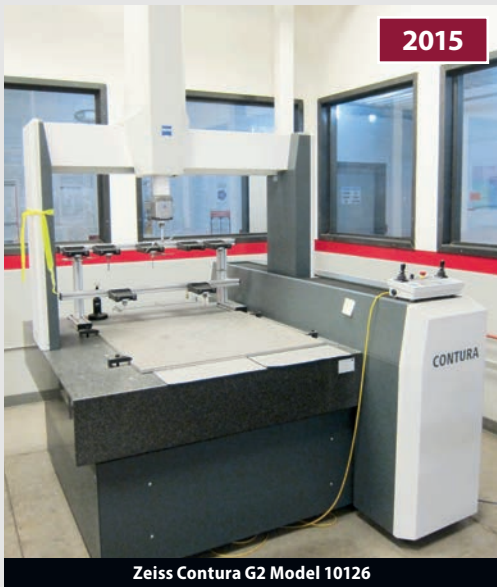
Zeiss Contura G2 Model 10126

Auction Opens: Monday, December 7, 2020 at 8:00 a.m. (PST)