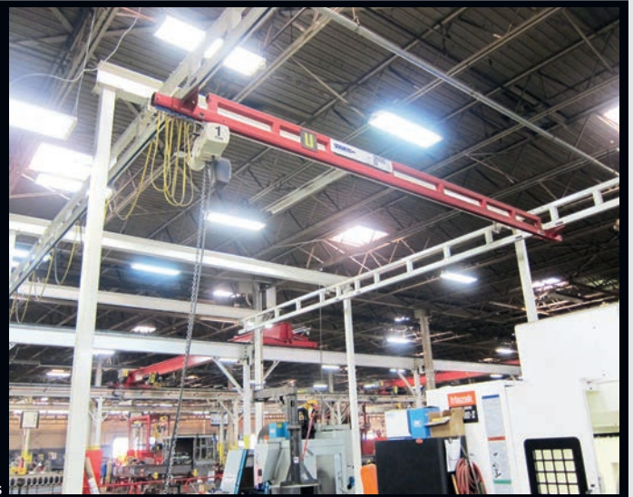
Several Spanco and Gorbel Crane Systems