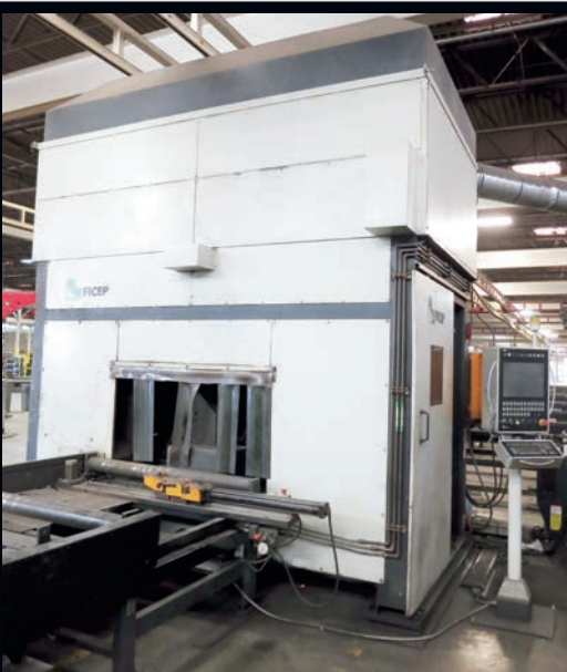
Ficep Thermal Coping Line

2004 Ficep 1003 DZB Drill, 40" x 18" Max. Beam, (3) Spindle with Tool Changer, Marking Unit, 90° Carriage In-Feed/155' Out-Feed, SGB1045 Miter Saw, (18) Transfers, Ficep Thermal Coper, 48" x 24" Max. Beam/Channels, 65, Carriage In-Feed, 100, Out-Feed, HT2000 Plasma, Dust Collector, Mfg. Date: 2004, New Drives, Motors, and CNC Upgrade 2015