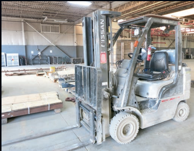
Nissan Forklift Truck