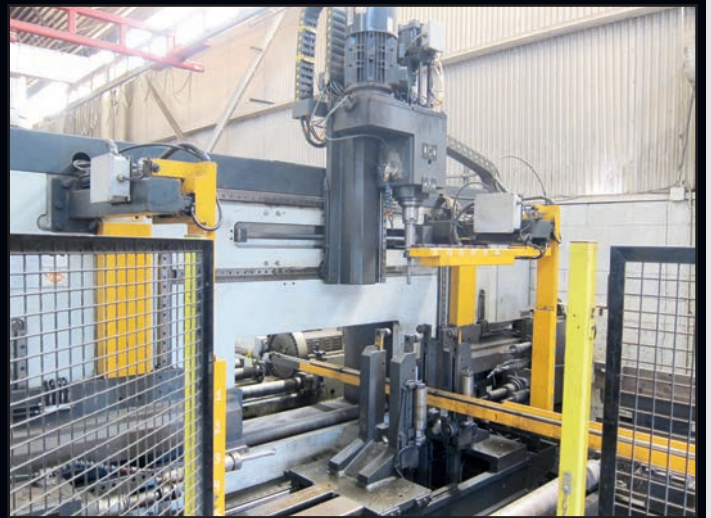
Ficep 1003 DZB Drill