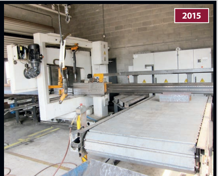
Ficep K100 Band Saw, Drill and Thermal Coping Line, Rear View