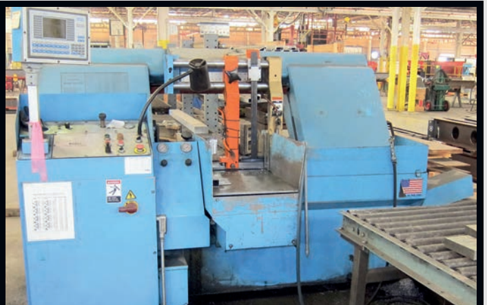
DoAll Band Saw Model C4100 NC