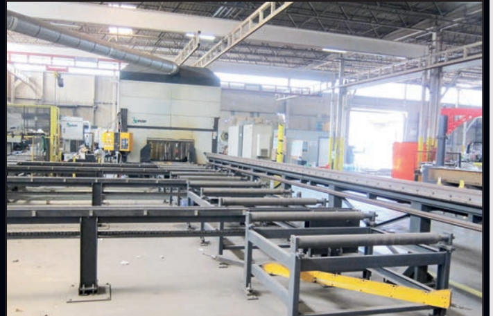
Coper 100' Out-Feed Conveyor