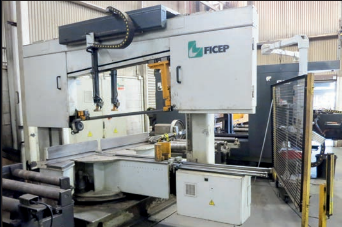
Ficep SGB 1045 Saw Line