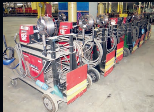
View of Lincoln Flextec Welders, 500 and 450