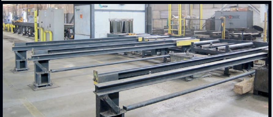
65' Carriage Coper In-Feed Conveyor