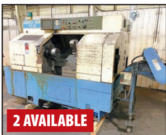
AMERA-SEIKI TC-2SL CNC LATHE