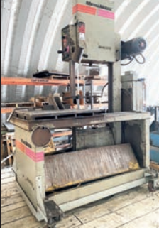
METAL MIZER MS2018 VERTICAL BANDSAW

AMERA-SEIKI VAS-3 CNC VERTICAL MACHINING CENTER , s/n 9800060, Fanuc Series O-MD CNC Control, 48" x 20" Table, X-40", Y-20", Z-25", Thru-Spindle Coolant, Cat 40 Taper