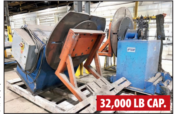
IRCO 16K HEADSTOCK AND TAILSTOCK WELDING POSITIONER