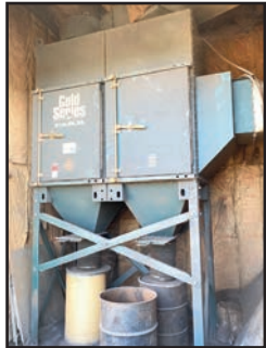
FARR GOLD SERIES GS8 DUST COLLECTION SYSTEM