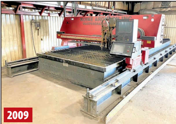
KOIKE ARONSON MGM1500 PLASMA CUTTING SYSTEM

2015 BYSTRONIC BYSMART FIBER 3015 CNC FIBER LASER CUTTING SYSTEM , s/n K30025434, ByVision Control, Dual 60" x 120" Tables, IPG Fiber 3,000W Laser Resonator, 4,484 Cutting Hours, Donaldson Torit PowerCore TG 4 Collection System *See Video of Laser Running on Website*