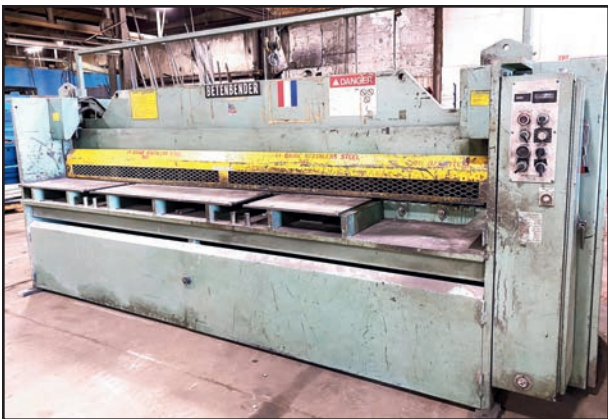
BETENBENDER 1/4" X 10' HYDRAULIC SHEAR