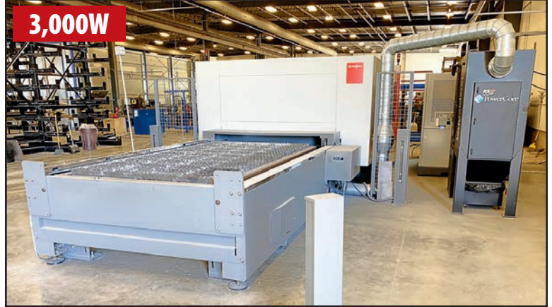
BYSTRONIC BYSMART FIBER 3015 (REAR VIEW)