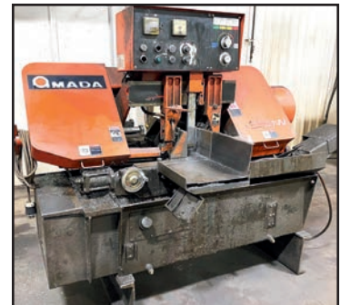
AMADA HA250W HORIZONTAL BANDSAW

UNIVERSAL LION C13B UNIVERSAL LATHE , s/n 2473, 12" 3-Jaw Chuck, 32" Swing, 42" in Gap, 96" Center Distance, 8-1,000 RPM, 4-Way Tool Post, Steady Rest, w/30" Face Plate