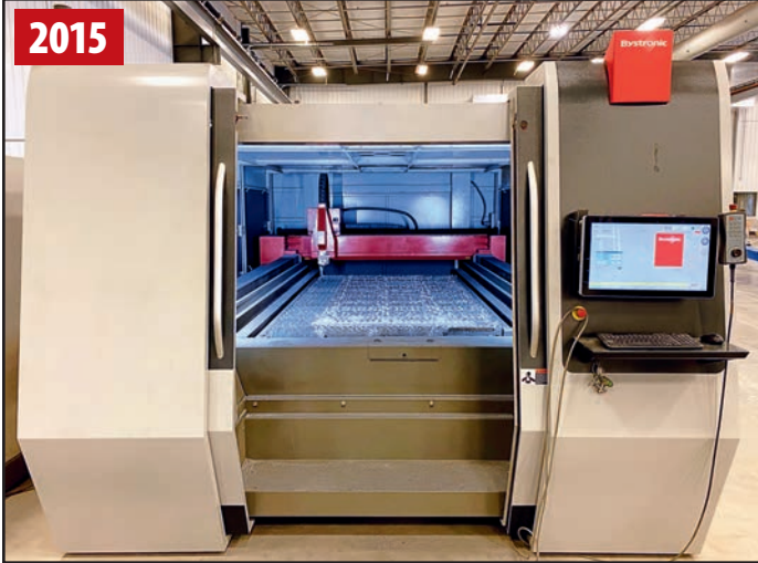
BYSTRONIC BYSMART FIBER 3015 (FRONT VIEW)