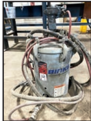
BINKS 5-GALLON PRESSURE POT W/MDL. 7 SPRAY GUN