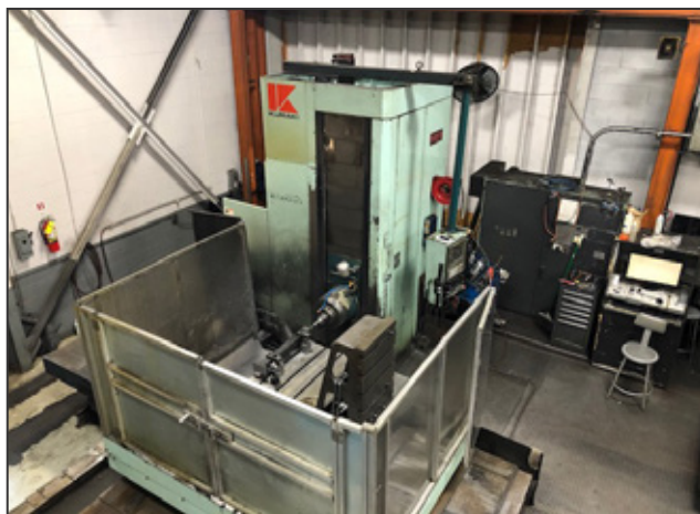
KURAKI KBT-11W, 4.3" CNC table type horizontal boring mill