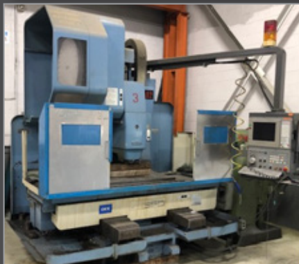
OKK MCV-550 CNC vertical machining center