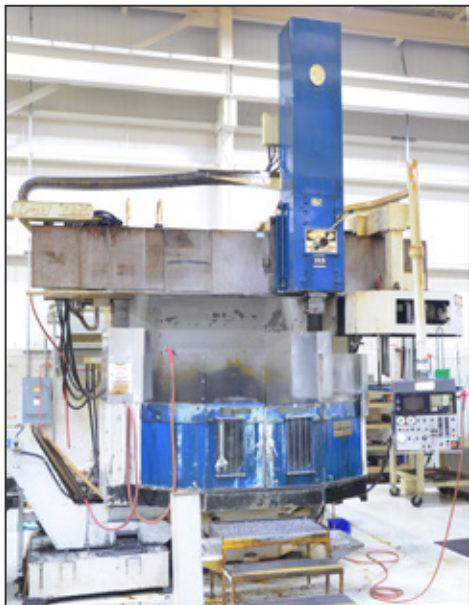
O-M VT5-16N, CNC vertical boring mill