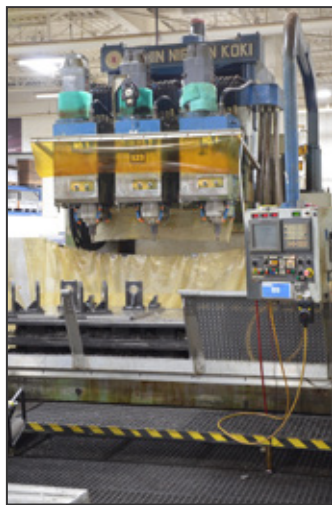
SNK FSP-120, CNC aerospace profiler