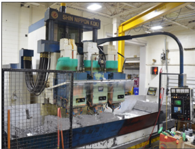
SNK FSP-120, CNC aerospace profiler