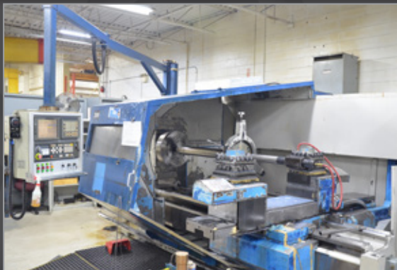
BOEHRINGER VDF V800, CNC flat bed lathe