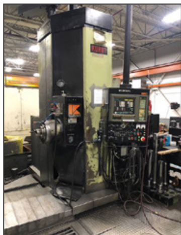
KURAKI KBT-11WDX, 4.3" CNC table type horizontal boring mill