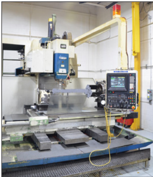
OKK MCV-820, 4-Axis CNC vertical machining center