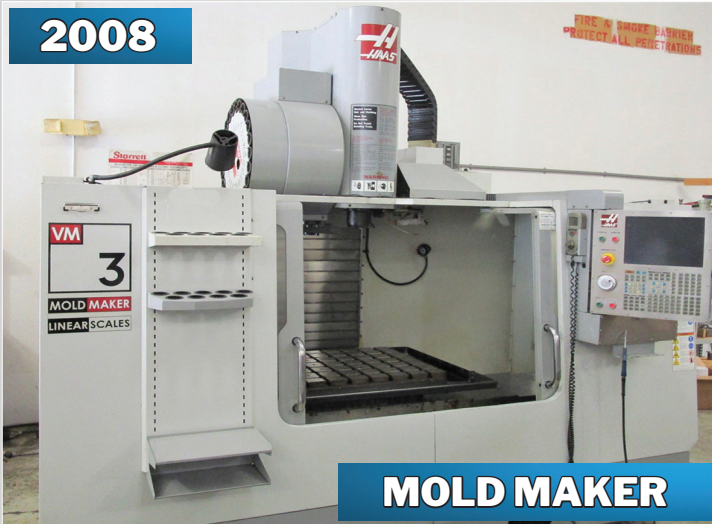
HAAS VM-3 MOLDMAKER CNC VERTICAL MACHINING CENTER

DATE: THURSDAY, MAY 28 TH , 2020 @ 1:00PM ET