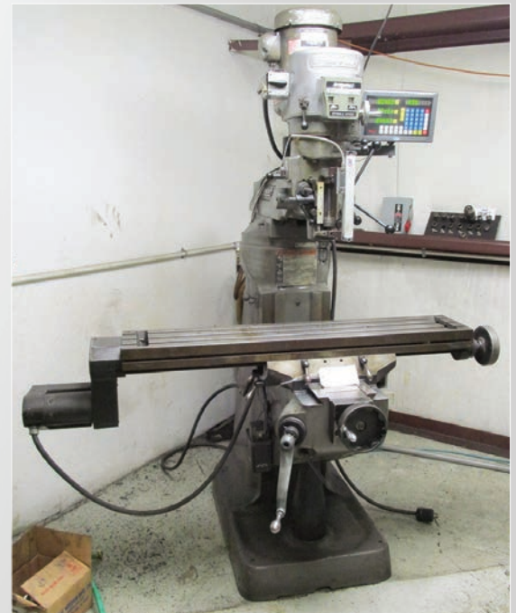
BRIDGEPORT SERIES II VERTICAL MILLING MACHINE