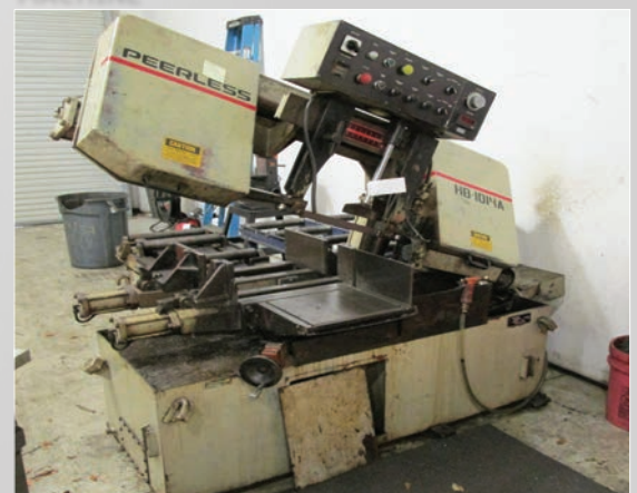
PEERLESS HB-1014A HORIZONTAL BANDSAW

BRIDGEPORT SERIES II Vertical Milling Machine, 9" x 42" Table, 3-Axis DRO, S/N 272556