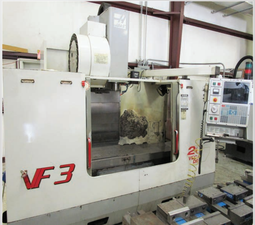
HAAS VF-3 CNC VERTICAL MACHINING CENTER