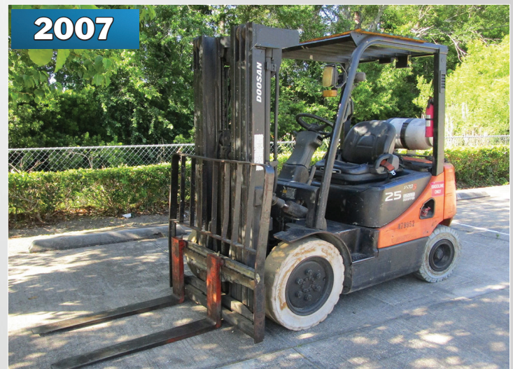
DOOSAN G25E-5 4,600 LBS. CAPACITY FORKLIFT TRUCK