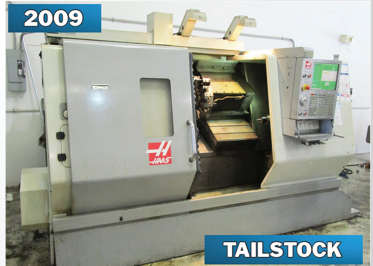
HAAS MODEL SL-30T CNC LATHE