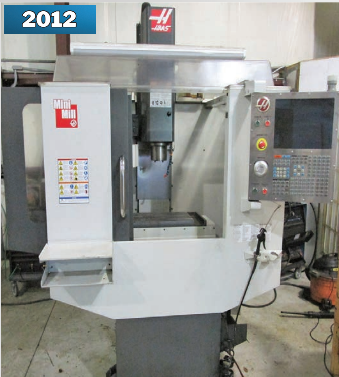
HAAS MINIMILL CNC VERTICAL MACHINING CENTER