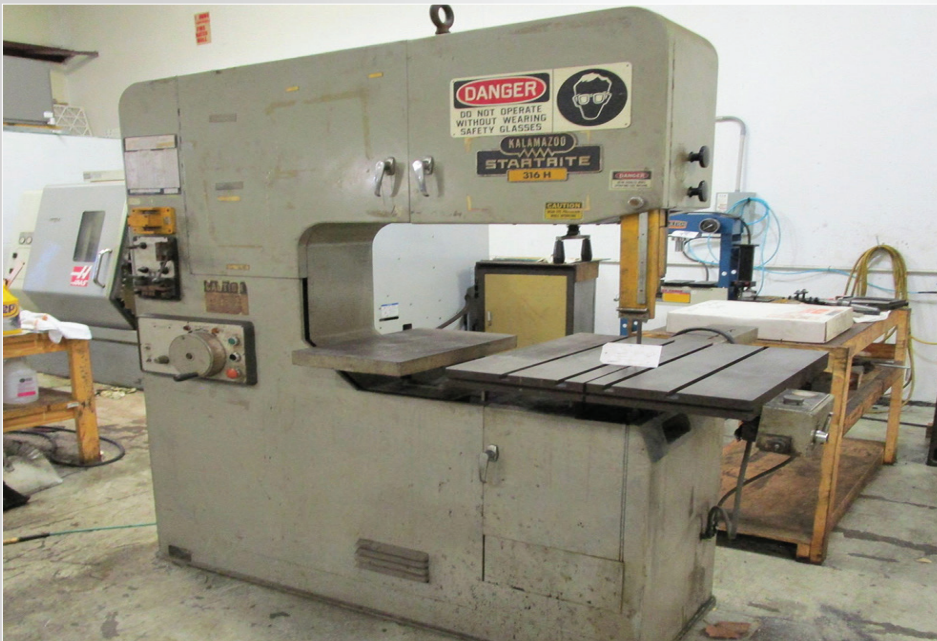
KALAMAZOO STARTRITE 316H VERTICAL BANDSAW