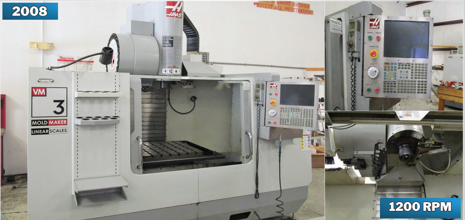
HAAS VM-3 MOLDMAKER CNC VERTICAL MACHINING CENTER