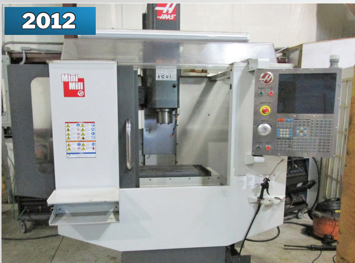
HAAS MINIMILL CNC VERTICAL MACHINING CENTER