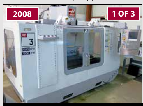
Haas VF 3D 5-Axis CNC Vertical Machining Center