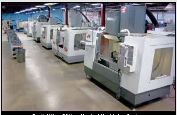
Partial View Of Haas Vertical Machining Centers

INSPECTION/PREVIEW: Monday, March 23 from 9:00 a.m. to 4:00 p.m. (EDT)