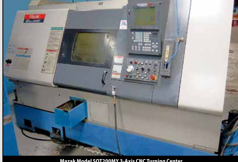
Mazak Model SQT200MY 3-Axis CNC Turning Center