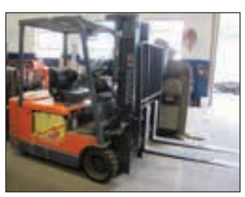
TOYOTA 3-WHEEL ELECTRIC FORKLIFT MODEL 5FBE20' TRIPLE MAST-189" SIDE SHIFT; 4000LBL