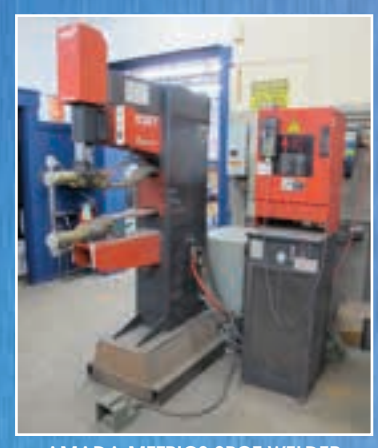
AMADA METRICS SPOT WELDER MODEL ID-40-ST, 95 KVA

INSPECTION: MONDAY, JUNE 17, 9 AM TO 4 PM (ET)