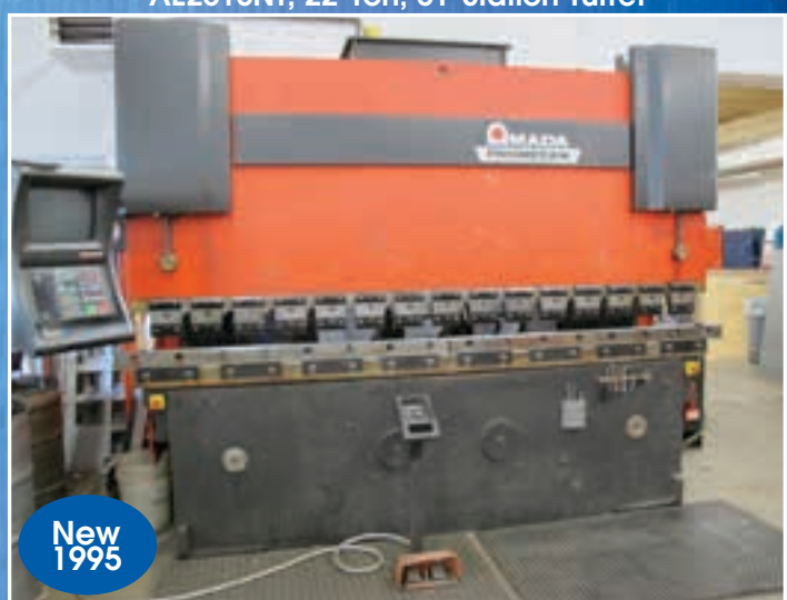
Amada Promecam 10' x 137-Ton Press Brake Model HFB-1253