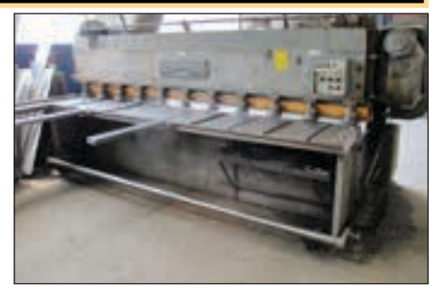
CINCINNATI 10' X 1/4" POWER SQUARING SHEAR MODEL 1810