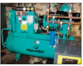
PALATEK 15 HP ROTARY SCREW AIR COMPRESSOR MODEL 15D