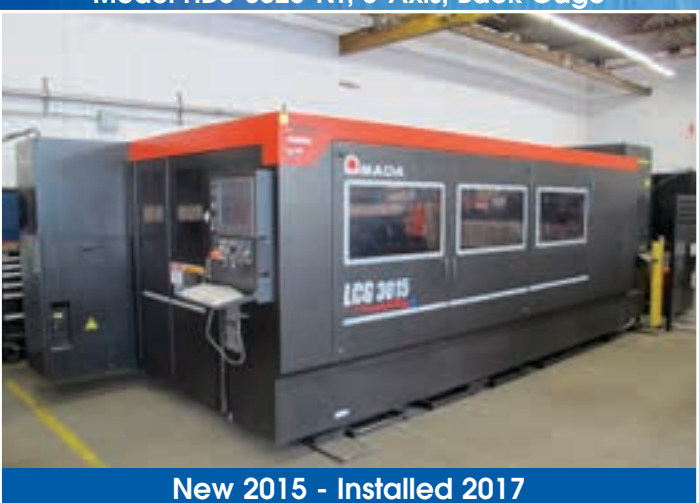
Fanuc C4000 CO2 Resonator only 5900 hrs. Amada CNC Laser Cutting System Model LCG-3015