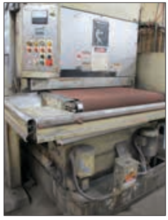
TIMESAVER 36" BELT SANDER PRO