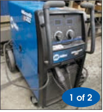
MILLERMATIC MOD 252 WELDERS