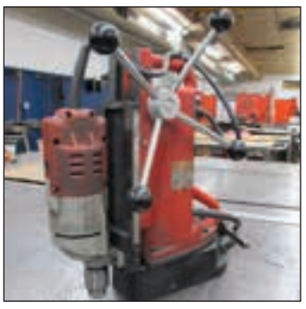
MILWAUKEE MAGNETIC DRILL