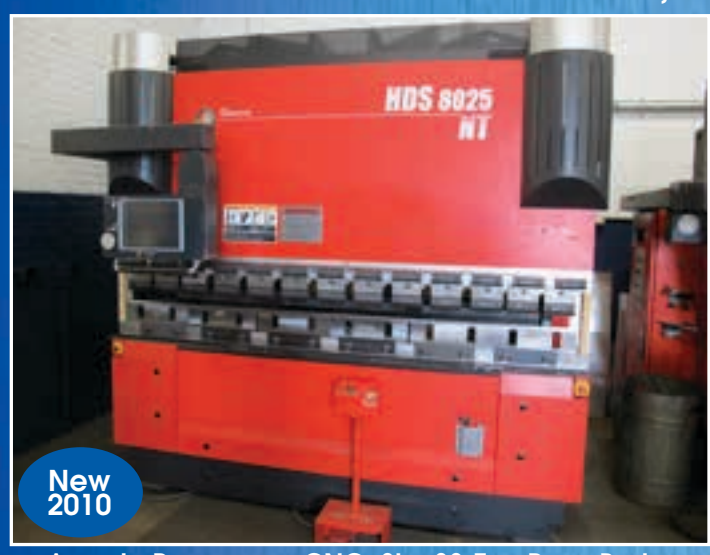
Amada Promecam CNC, 8' x 88-Ton Press Brake Model HDS-8025-NT, 5-Axis, Back Gage

INSPECTION: MONDAY, JUNE 17, 9 AM TO 4 PM (ET)