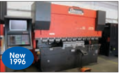
AMADA PROMECAM CNC 8' X 88-TON PRESS BRAKE MODEL HFBO-8025; 5 AXIS CNC BACK GAUGE