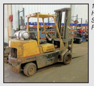
10,000-Lb. Hyster S100XL Forklift