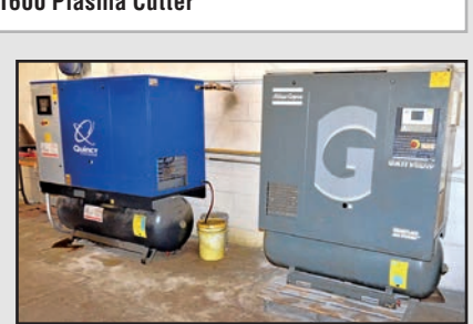
View of Air Compressors

(2) Miller CP-302 Mig Welders, with 22A wire feeders Miller "Maxton 450" Inverter Assorted Miller Filtair MDX-P Fume Extractors ESAB Powercut 1600 Plasma Cutter