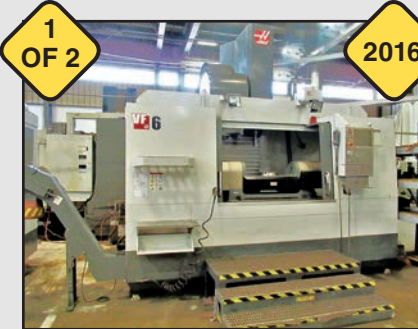
Haas VF6/50 5-Axis CNC Vertical Machining Center

Haas VF8/50 4-Axis Vertical Machining Center with High Pressure Coolant