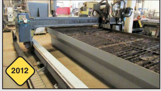
Multicam 6000 Series CNC Plasma Cutting System with 40' Travel