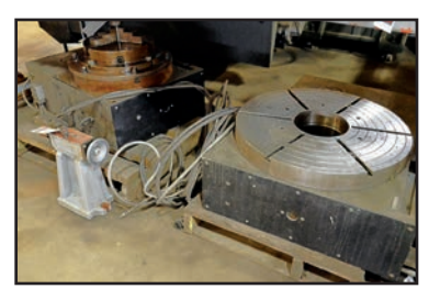
Haas CNC B-Axis Rotary Table

(2) Haas HRT 600 4th Axis Rotary Tables, 23.6" platter dia., 1,475-lb. weight capacity, 14.5" center height, max. speed: 50 degrees/second, max. torque: 450 ft./lb., mounted horizontal or vertical