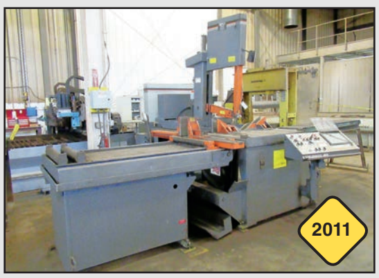
Hem VT140HA60 Vertical Bandsaw with Touch Screen