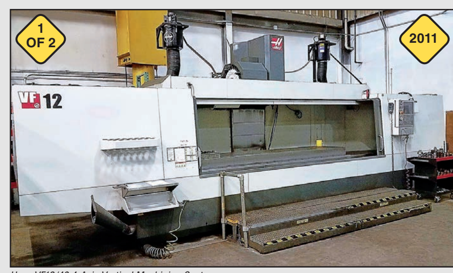
Haas VF12/40 4-Axis Vertical Machining Center

Haas VF8/50 4-Axis Vertical Machining Center with High Pressure Coolant