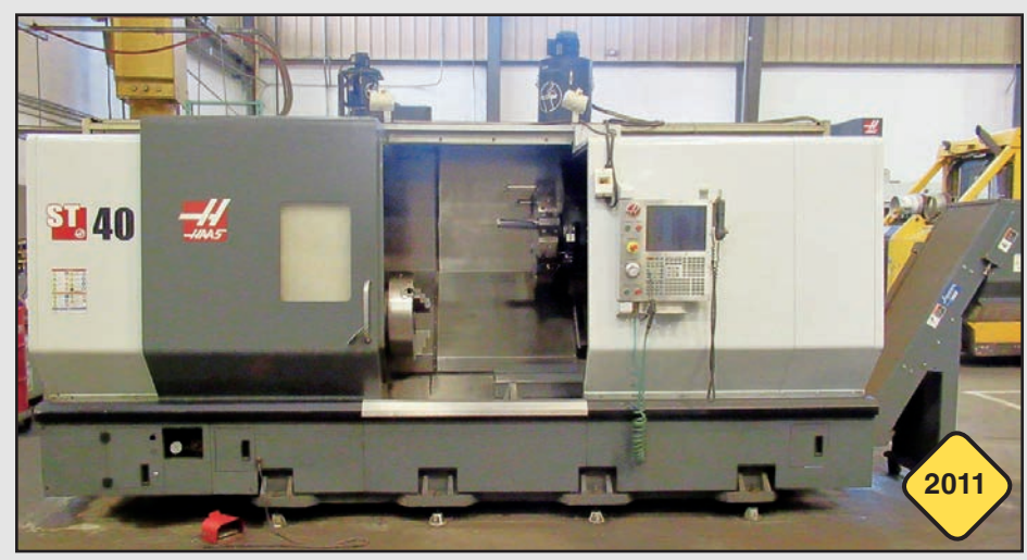
Haas ST-40 "Big Bore" CNC Turning Center with Live Milling