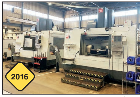
View of Haas VF6/50 5-Axis Vertical Machining Centers

Presorted First Class Mail U.S. Postage PAID Eugene, Oregon Permit No. 17