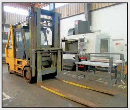
30,000-Lb. Taylor Mdl. TCO-300S Forklift