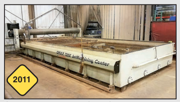
Omax 120X Abrasive WaterJet Cutting System

Milltronics TL14 CNC Lathe, 14" swing over bed, 36" between centers, 100–3,000 RPM, 12HP, tool post, 10" 3-jaw chuck, tailstock, Milltronics CNC control, S/N: 11325, Mfg. Date 2011