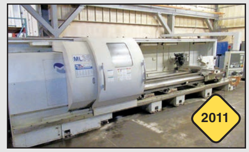
36" x 200" Milltronics ML35 CNC Lathe with Milling

DAY 2 - ONLINE ONLY: Thursday, March 28th Lots Start Closing at 1:00 p.m.