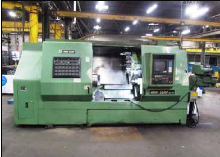
MORI SEIKI SL-45B/1000 CNC TURNING CENTER

Asset Sales, Inc. Does Not Pack, Ship, Crate, Transport or Rig Items. Buyers May Pick Up Their Items at the Auction Location or Can Arrange for a Third Party Logistics Firm to Manage the Removal Process for Them.