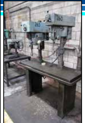
(2) ARBOR PRESSES