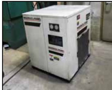
INGERSOLL RAND AIR DRYER