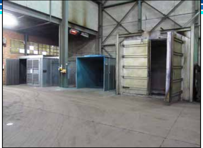
GLOBAL BLAST BOOTH, JB I POWDER PAINT, OSI OVEN