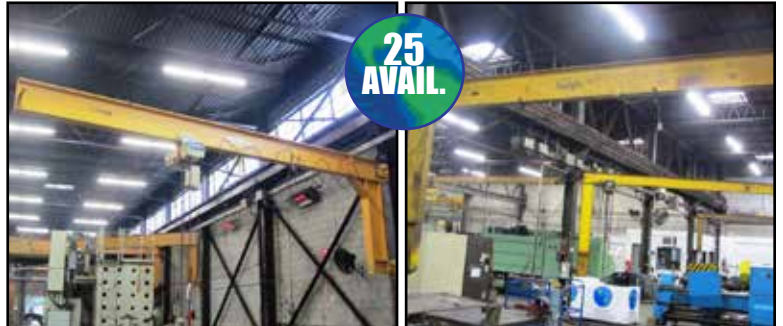
(25) ASSORTED JIB CRANES UP TO 5 TONS