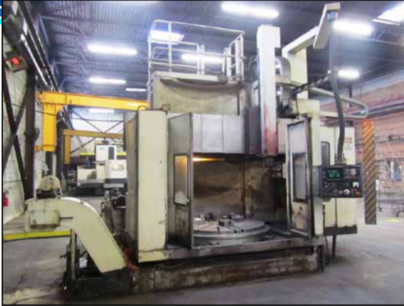
TOSHIBA TXN-16 CNC VERTICAL BORING MILL