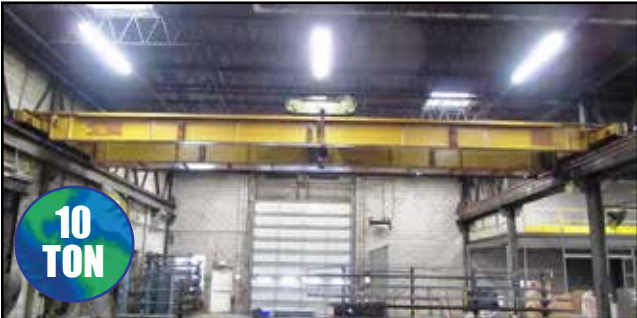
10 TON X 47'3\"/>