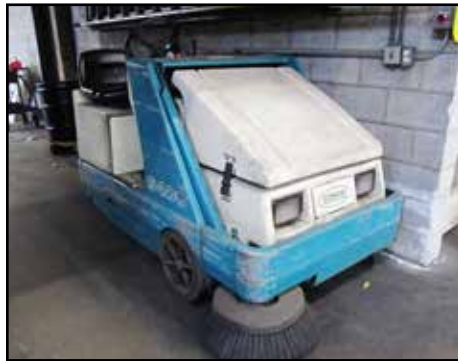
TENNANT FLOOR SWEEPER