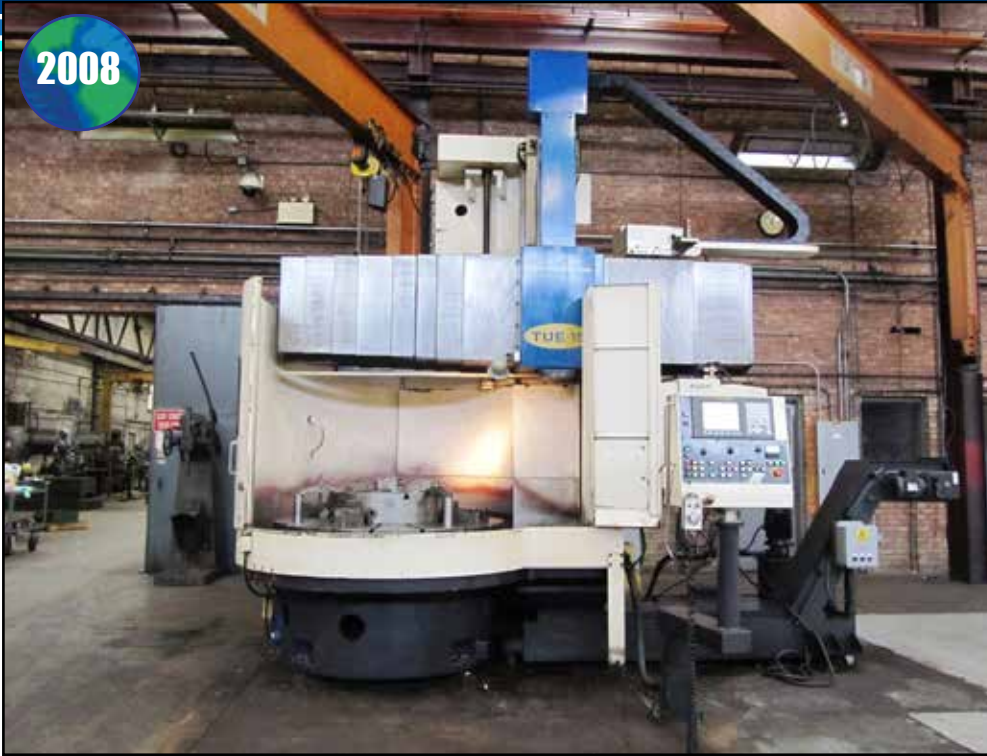
TOSHIBA TUE-15 CNC VERTICAL BORING MILL