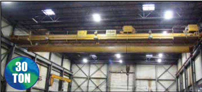
30/30 TON X 78' SPAN P&H PACESETTER DOUBLE GIRDER OVERHEAD BRIDGE CRANE