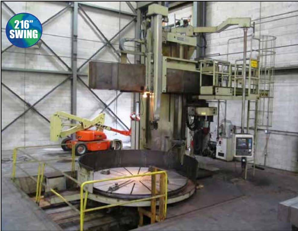
TOSHIBA TSS 30/55B CNC VERTICAL BORING MILL