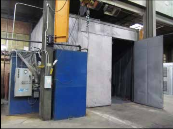
JB I 14' X 17' X 12' BLAST ROOM