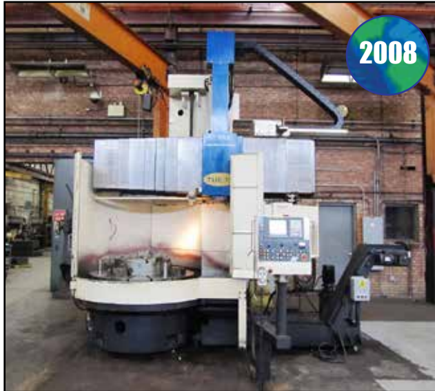
TOSHIBA TUE-15 CNC VERTICAL BORING MILL