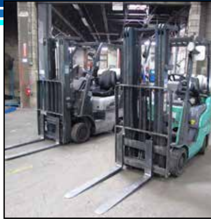
mitsubishi & Nissan 2500LB FORKLIFTS