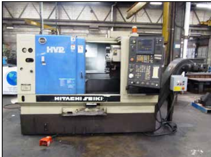
HITACHI SEIKI HVP-20J CNC CHUCKER LATHE