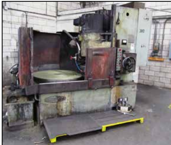
42" SHIBAURA ROTARY SURFACE GRINDER