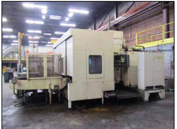
TOSHIBA BMC-80 CNC HORIZONTAL MACHINING CENTER