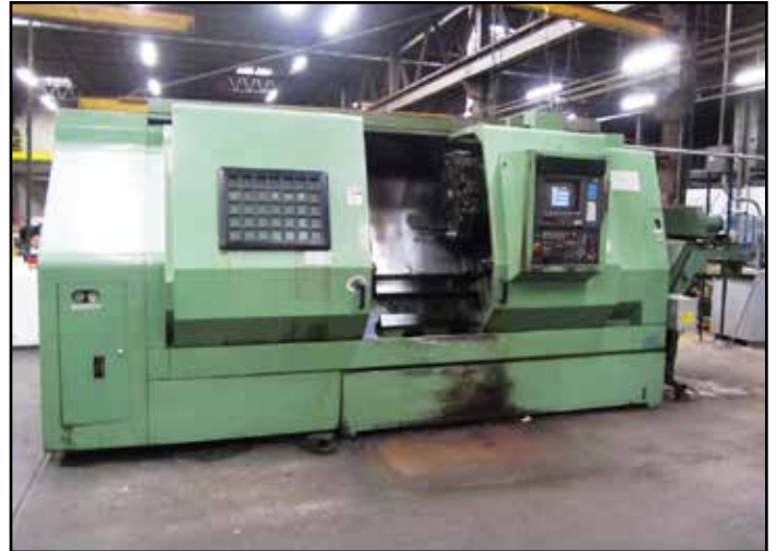
MORI SEIKI SL-45B/1000 CNC TURNING CENTER