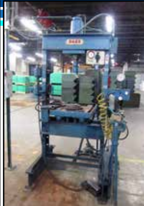
DAKE H-FRAME PRESS