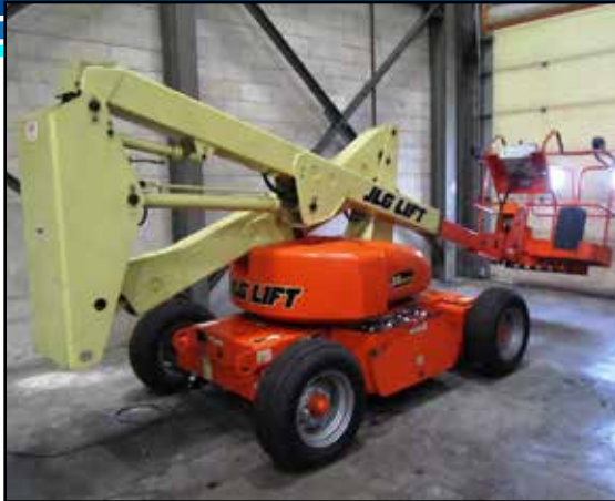
JLG 500LB CAPACITY ELECTRIC MAN LIFT