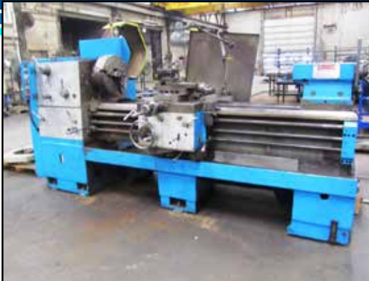
TOOLMEX 22" X 60" MANUAL LATHE