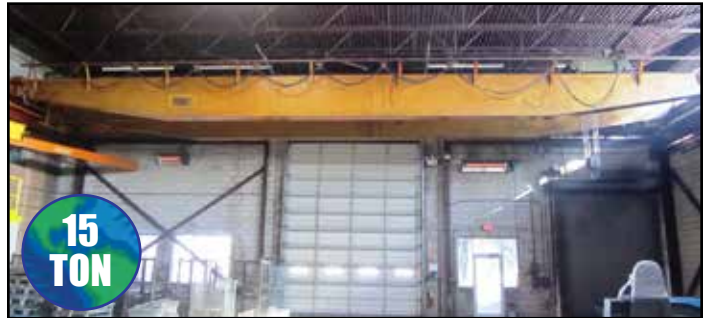
15 TON X 68'4\"/>