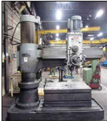
Ooya 5' X 16" COLUMN RADIAL ARM DRILL