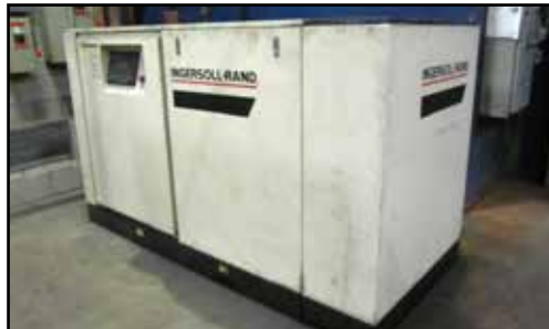
INGERSOLL RAND AIR COMPRESSOR