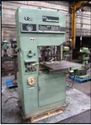
KYSOR-JOHNSON VERTICAL BAND SAW