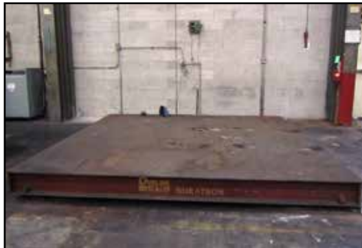
DURALINE 80,000LB PLATFORM SCALE