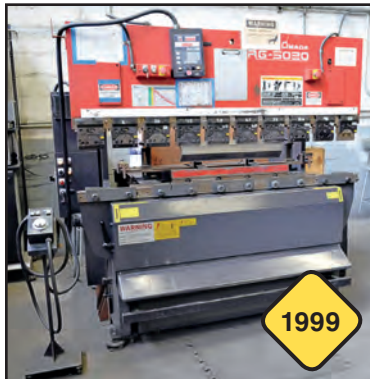
1999 55-Ton x 6' Amada RG-5020LD CNC Press Brake

Presorted First Class Mail U.S. Postage PAID Eugene, Oregon Permit No. 17