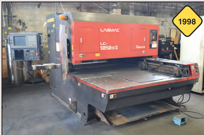
1.5Kw Amada LC1212A2 Pulsar Hybrid Laser

56-01 55th Avenue, Maspeth, New York (Queens) 11378