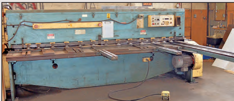
3/16" x 10' Amada M-3045 Mechanical Power Shear with CNC Back Gauge

Amada M-3045 10' x 3/16" Mechanical Shear , 39" programmable back gauge, (60) strokes per minute, rear sheet supports, 120" squaring arm, (2) 36" front sheet supports, electric foot switch control, S/N: 30450671