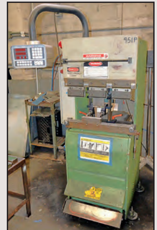
17.5" x 24" Guifil PE6-16 CNC Press Brake