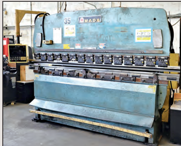
138-Ton x 10' Amada RG-125 CNC Press Brake