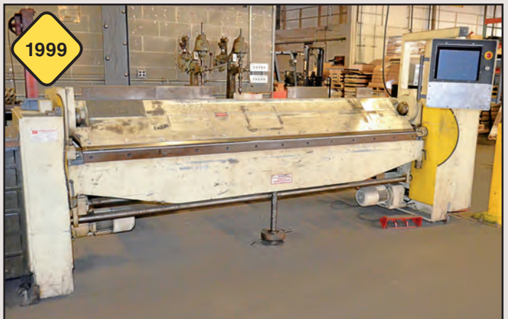
14Ga. x 10' Roper Whitney Mdl. AB1014KC Kombi CNC Folder

To Register For This Auction & Terms of Sale, Please Visit www.kosterindustries.com