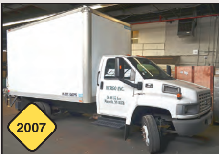
Chevy C4500 Box Truck

Miscellaneous Welding Accessories Incl. Tables, Clamps, Welding Curtains, Tips, Torches, Hoses, Kemper Fume Collector, Etc.