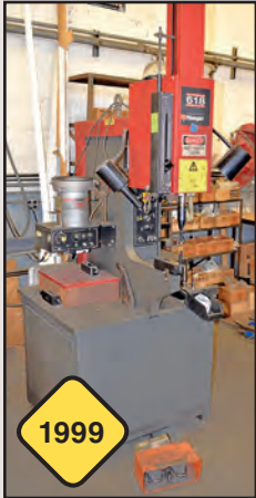
6-Ton Haeger 618-1C Insertion Press