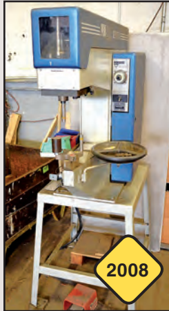
4-Ton Pemserter Series 4 Insertion Press