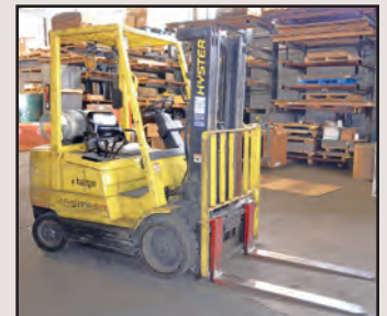
4,500-Lb. Hyster Mdl. S50XM Propane Forklift