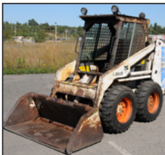
BOBCAT 743 skid steer