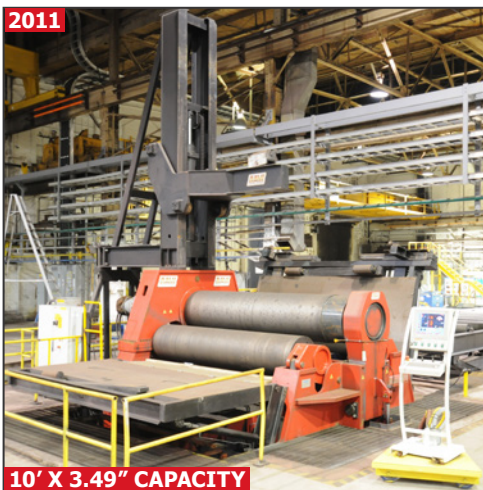
10' X 3.49" CAPACITY