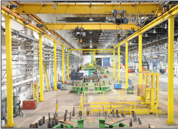
DEMAG 20 TON capacity free standing gantry crane system