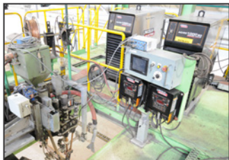
MITSUBISHI & LINCOLN manipulator and welding controls