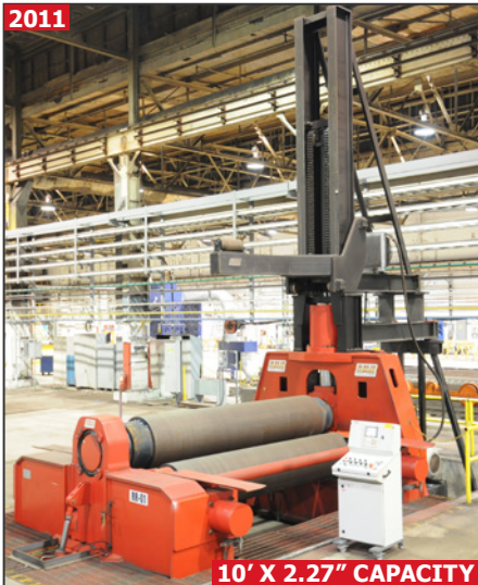
10' X 2.27" CAPACITY