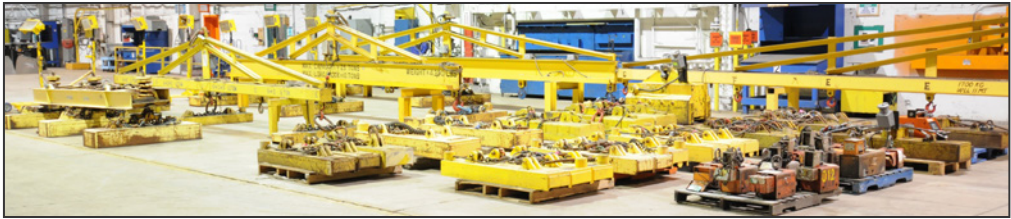
Partial view of spreader beams and lifting magnets available