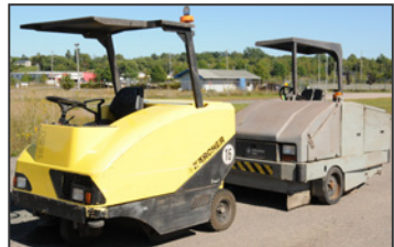
Gas powered floor sweepers