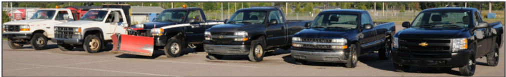
Partial view of pickup trucks available