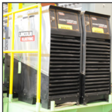
LINCOLN ELECTRIC AC/DC 1000SD welding power sources