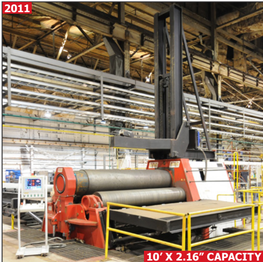
10' X 2.16" CAPACITY