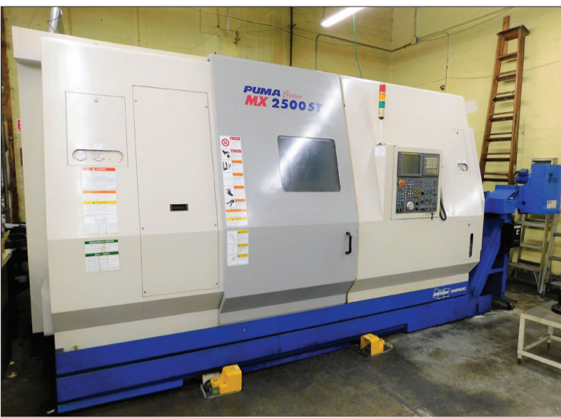
2006 DOOSAN DAEWOO PUMA MX-2500ST CNC 8-AXIS TURNING AND MILLING CENTER

BidSpotter.com JULY 18, 2018 AT 2:00PM EST BidSpotter.com