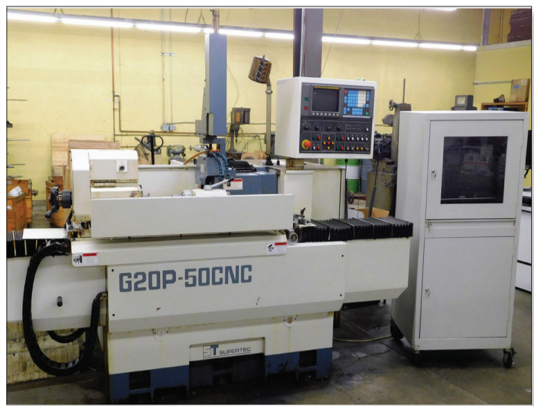
2002 SUPER TEC G20P-50 CNC OD GRINDER