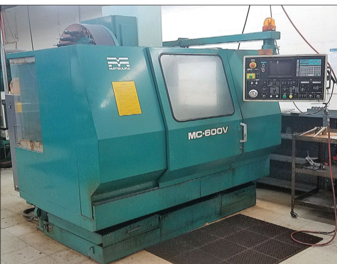
MATSUURA MC600V VERTICAL MACHINING CENTER

FEATURING: TOSHIBA BTD-11 Horizontal Boring Mill, 16" x 40" REGENT Horizontal Surface Grinder, 43" DEFUM Vertical Turret Lathe, TOSHIBA Right Angle Head, DOOSAN MX-2500ST 5-Axis Turning & Milling Center, DAEWOO Puma 350MA CNC Lathe, 8" x 20" SUPER TEC CNC Cylindrical Grinder, MATSUURA MC600V VMC, 2-Ton JIB CRANE, Angle Plate, Tooling, & MORE!