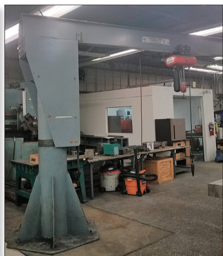
2-TON JIB CRANE