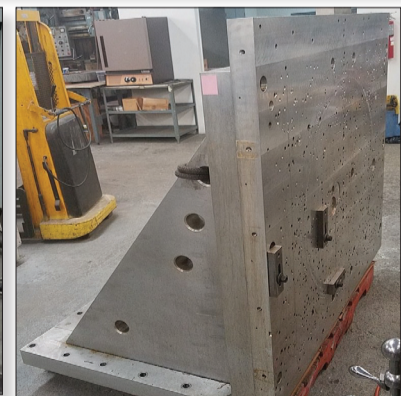
ALUMINUM ANGLE PLATE