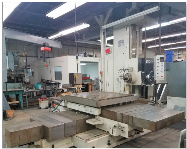
4.3" TOSHIBA BTD-11 HORIZONTAL BORING MILL

FEATURING: TOSHIBA BTD-11 Horizontal Boring Mill, 16" x 40" REGENT Horizontal Surface Grinder, 43" DEFUM Vertical Turret Lathe, TOSHIBA Right Angle Head, DOOSAN MX-2500ST 5-Axis Turning & Milling Center, DAEWOO Puma 350MA CNC Lathe, 8" x 20" SUPER TEC CNC Cylindrical Grinder, MATSUURA MC600V VMC, 2-Ton JIB CRANE, Angle Plate, Tooling, & MORE!