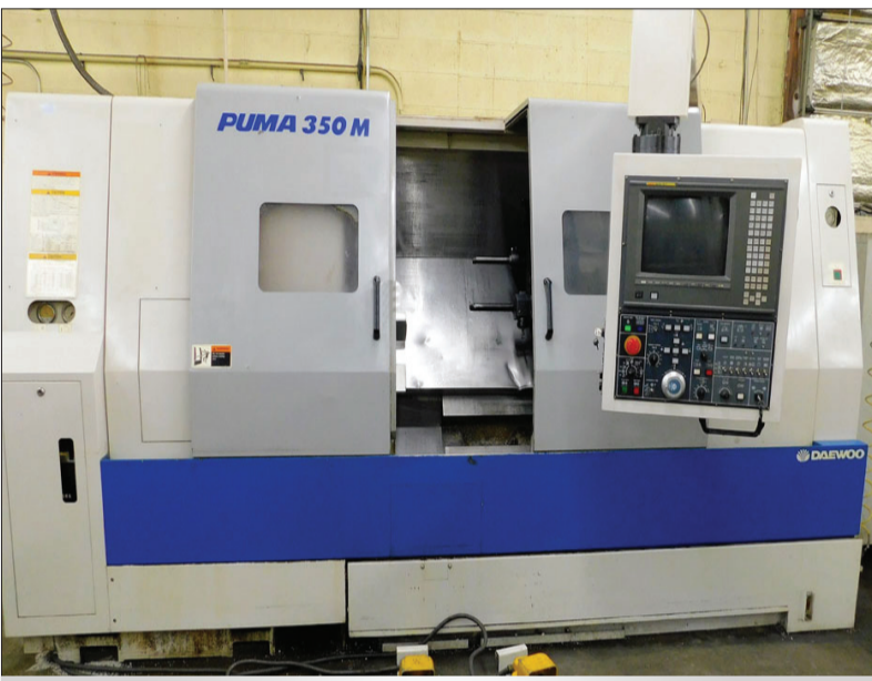
1998 DAEWOOD PUMA 350MA CNC LATHE WITH LIVE MILLING