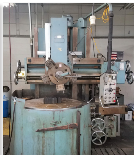
DEFUM VERTICAL BORING MILL