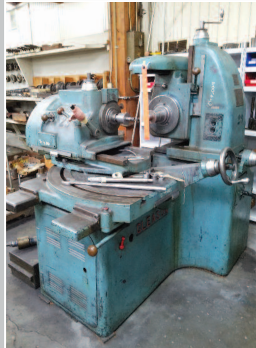
GLEASON 13 Universal Bevel Gear Tester