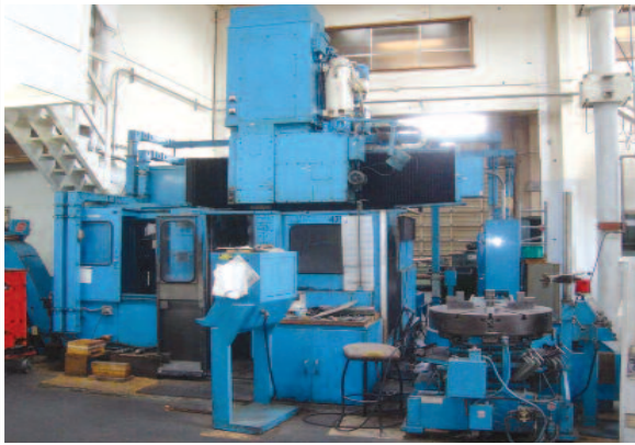
GIDDINGS & LEWIS 36 CNC Vertical Boring Mill