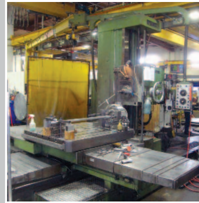
WOTAN 4.1" Table Type Horiz. Boring Mill