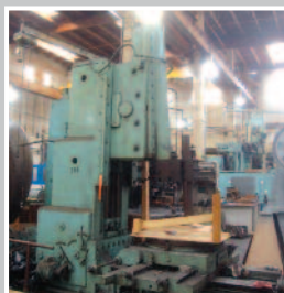
ROCKFORD 36" Slotter