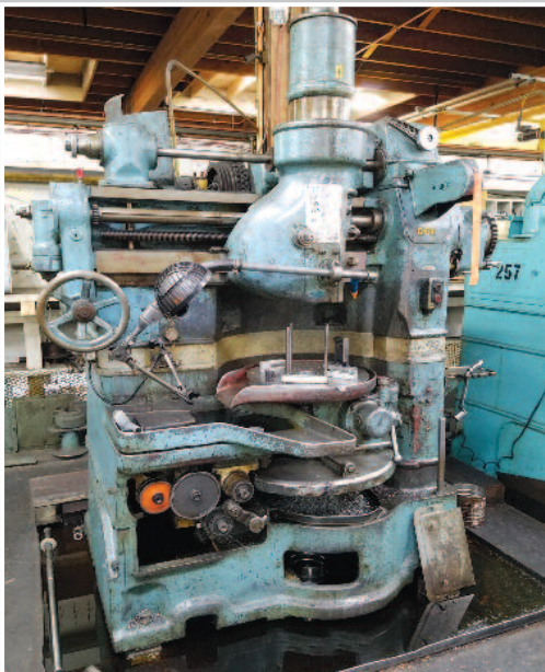
FELLOWS 6A 24" Gear Shaper, w/Cutter Elevation