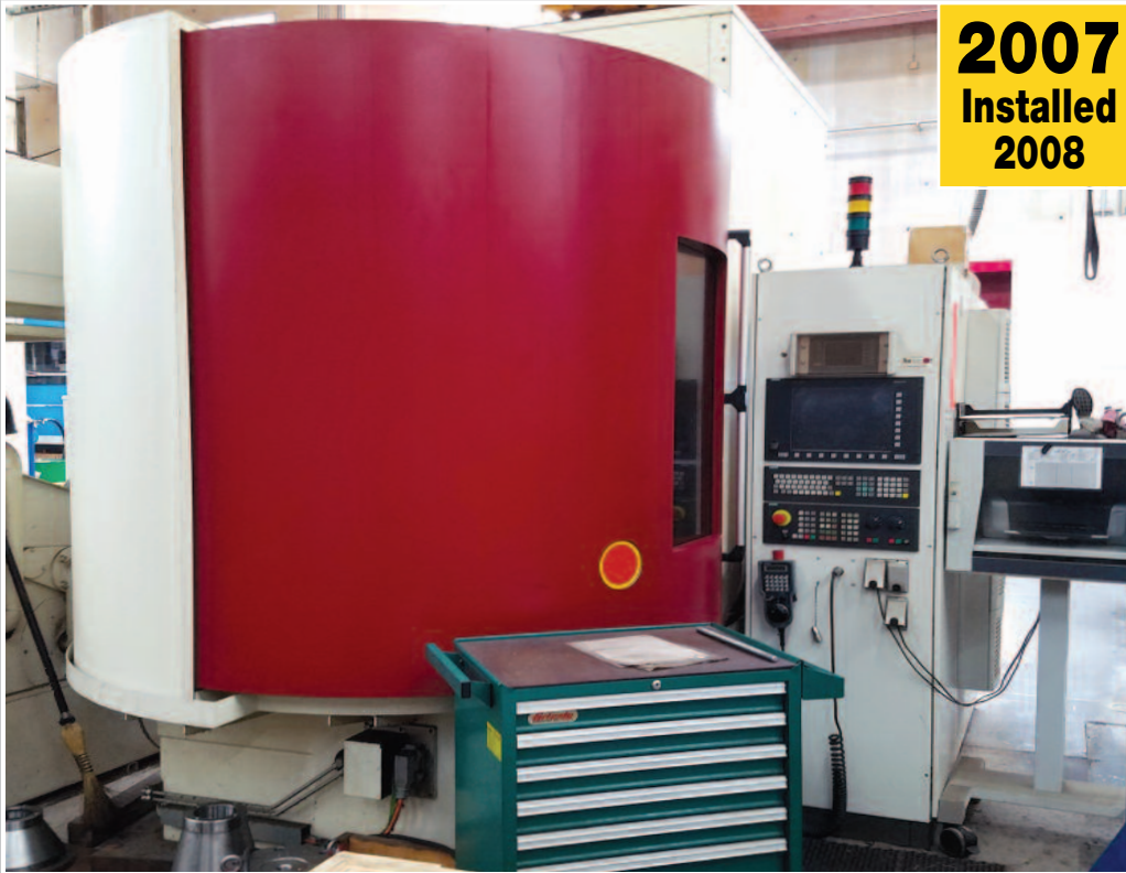
NILES ZE400S CNC Grinding Machine (This machine is subject to prior sale)

FEATURING: Vertical, Horizontal & Manual Gear Hobbers • CNC Gear Grinders Horizontal Boring Mills • Vertical Turret Lathe • Keyseaters & Much More