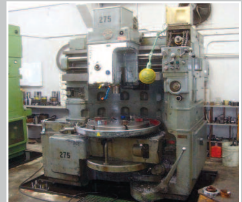
FELLOWS 36" Gear Shaper