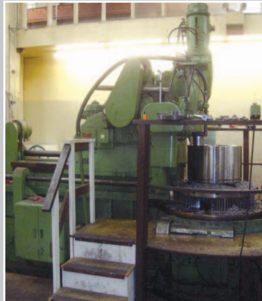
FELLOWS 100" Gear Shaper