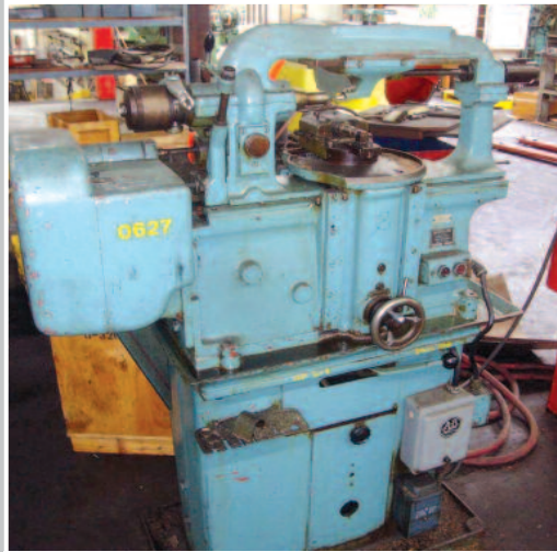
KOEPFER WR8484 Horizontal Gear Hobber