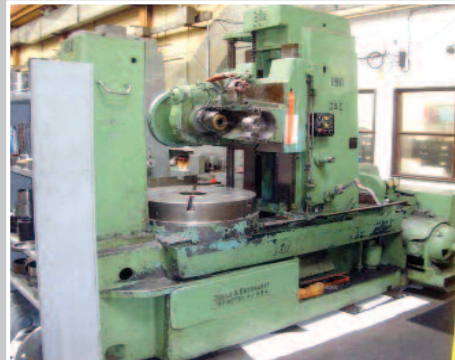
G&E 48HWD 48" Gear Hobber