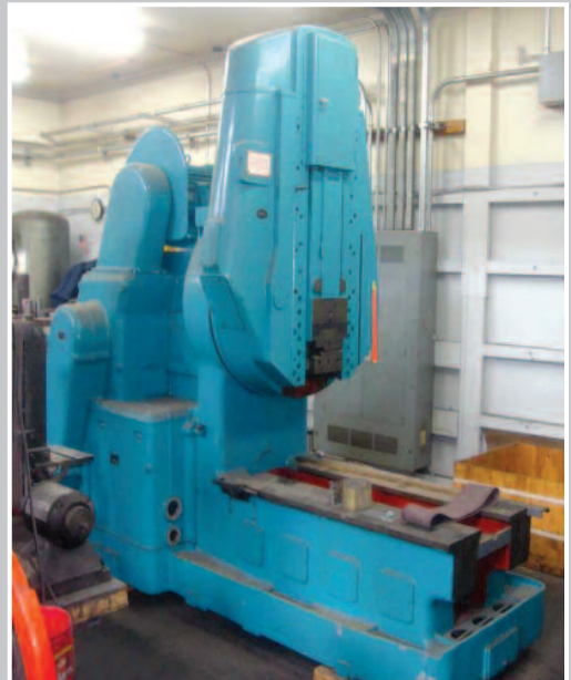
MAAG SH-100Z 100" Rack Shaping Machine