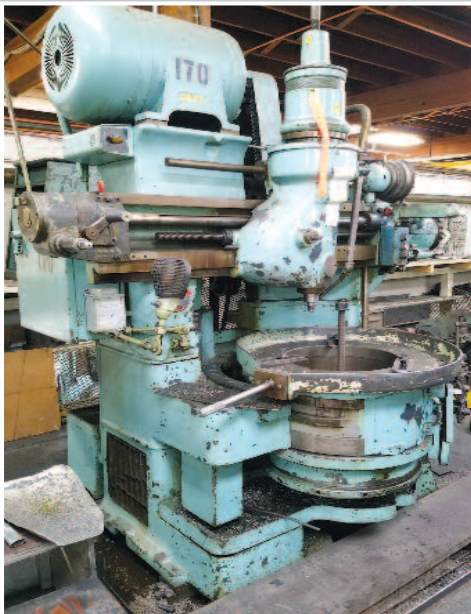
FELLOWS 6, 36" Special Large Bore Gear