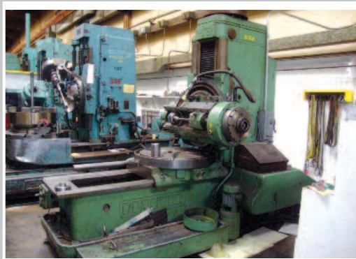
PFAUTER RS-3V Universal Gear Hobber