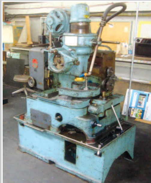
FELLOWS 72 High Speed Gear Shaper