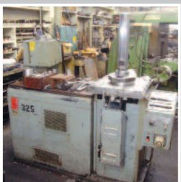
MITTS & MERRILL Keyseater