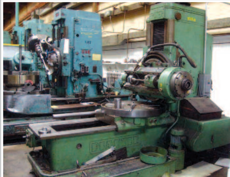
PFAUTER RS-3V Universal Gear Hobber