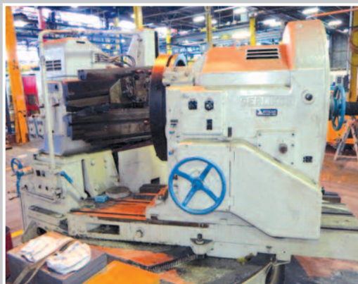
OERLIKON K4A Straight Bevel Gear Generator