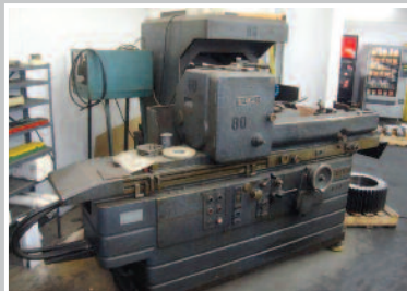
EX-CELL-O #35 Thread Grinder