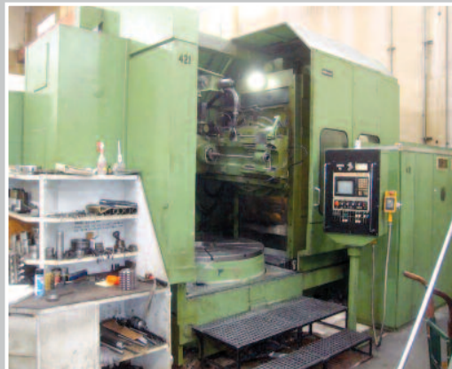
HURTH-MODUL ZFWZ16 CNC Gear Hobber