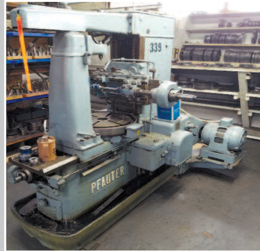
PFAUTER 18 Universal Worm Gear Hobber