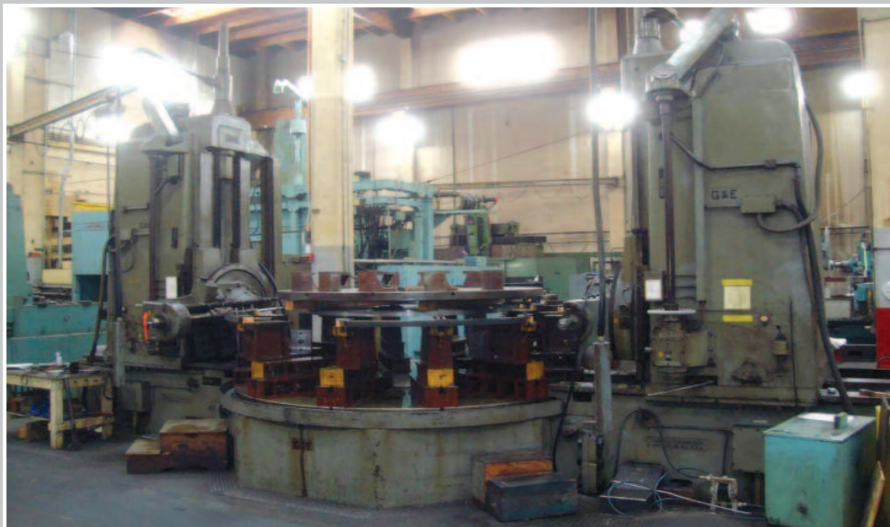
G&E 160H Dual Column Gear Hobber