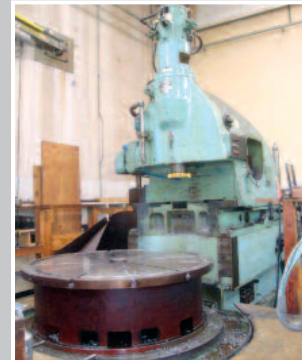
FELLOWS 200" Gear Shaper

TERMS & CONDITIONS | PAYMENT: 25% NON-REFUNDABLE DEPOSIT ON AWARD OF BID, BALANCE WITHIN 24 HOURS. PAYMENT IS CASH, CASHIER'S CHECK, CERTIFIED CHECK, WIRE TRANSFER, COMPANY CHECK ONLY IF ACCOMPANIED BY A LETTER FROM YOUR BANK GUARANTEEING AMOUNT OF CHECK FOR DEPOSIT AND/OR PAYMENT IN FULL. NO PERSONAL CHECKS. FULL PAYMENT MUST BE MADE BEFORE REMOVAL OF PURCHASE. EVERYTHING IS SOLD "AS IS, WHERE IS". ALL SALES FINAL. COST AND RESPONSIBILITY FOR REMOVAL OF PURCHASE REMAINS WITH THE PURCHASER. EVERY EFFORT WILL BE MADE TO FACILITATE REMOVAL. WHILE QUANTITIES AND DESCRIPTIONS ARE BELIEVED TO BE ACCURATE, THE AUCTIONEER, OWNERS OR COUNSEL MAKE NO WARRANTIES OR GUARANTEES EITHER EXPRESSED OR IMPLIED AS TO AUTHENTICITY, GENUINENESS OF, OR DEFECTS IN ANY LOT AND WILL NOT BE HELD RESPONSIBLE FOR ANY ADVERTISING DISCREPANCIES OR INACCURACIES. NO WARRANTIES WHATSOEVER ARE MADE AS TO CONDITION MERCHANTABILITY OR FITNESS FOR USE OF ANY ITEM. MAY WE SUGGEST YOU TAKE FULL ADVANTAGE OF THE PREVIEW AND INSPECTION PERIOD. SALE SUBJECT TO ADDITIONS, DELETIONS & PRIOR SALES. PLEASE CHECK AVAILABILITY OF EQUIPMENT.