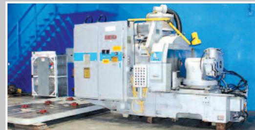
GLEASON 120 Gear Curvic Coupling Grinder