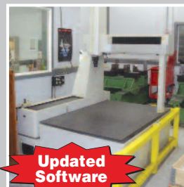
MITUTOYO BRT910 CMM