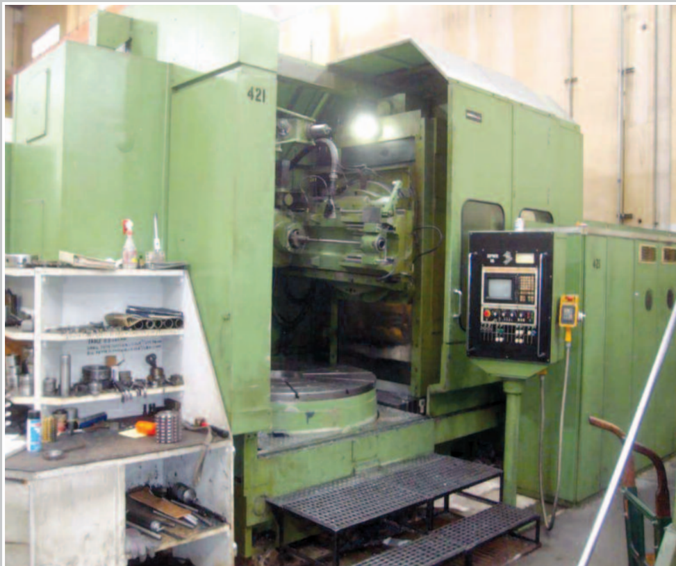
HURTH-MODUL ZFWZ16 CNC Gear Hobber