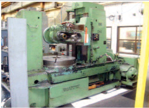
G&E 48HS Heavy Duty Gear Hobber