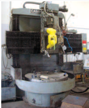
CAMPBELL Vertical Grinder

21700 Northwestern Hwy. Suite 1180 Southfield, MI 48075