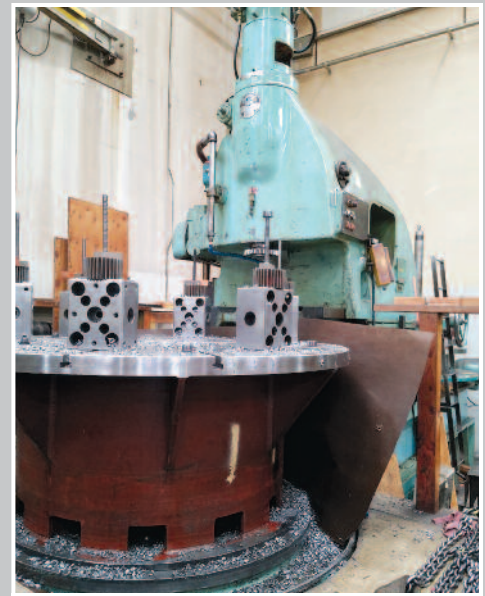
FELLOWS 100/200 Special 200" Gear Shaper