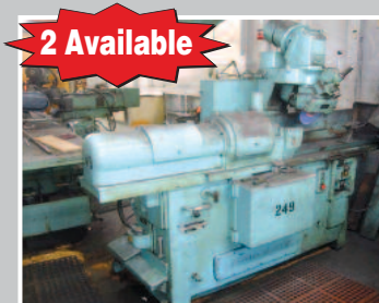
BARBER COLMAN Hob Grinder