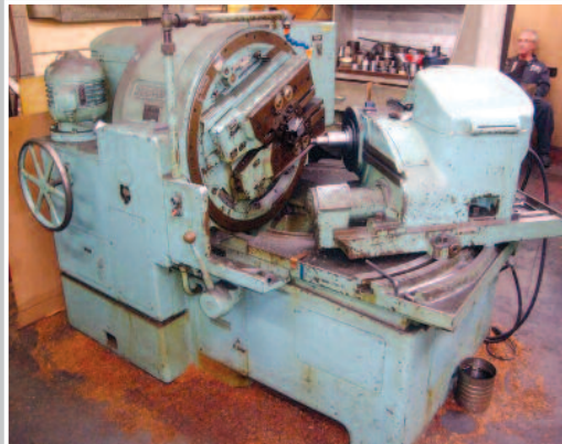
GLEASON 14 Coniflex Straight Bevel Gear Generator