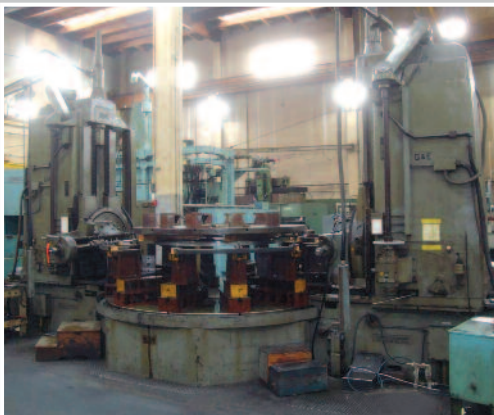
G&E 160H Dual Column Gear Hobber

LOCATION: 500 So. Portland St., Seattle, WA