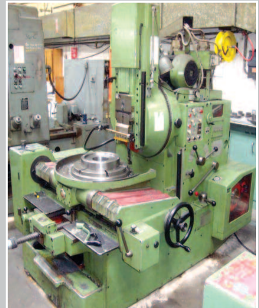
MAAG SH75K Gear Shaper