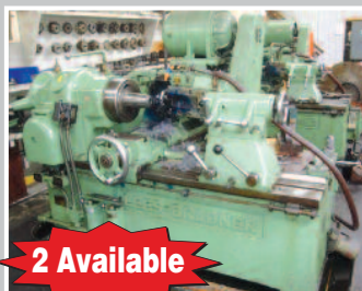
LEES BRADNER HT Thread Mill