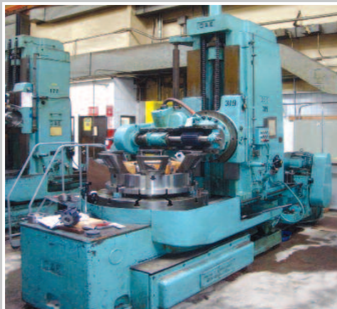
G&E 72H High Column Gear Hobber