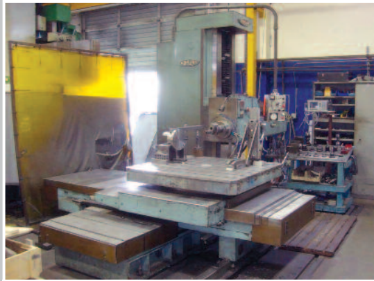
NOMURA B100BT2 4" Table Type Horizontal Boring Mill