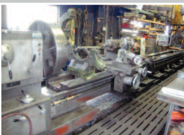
POREBA TPK-80 Engine Lathe