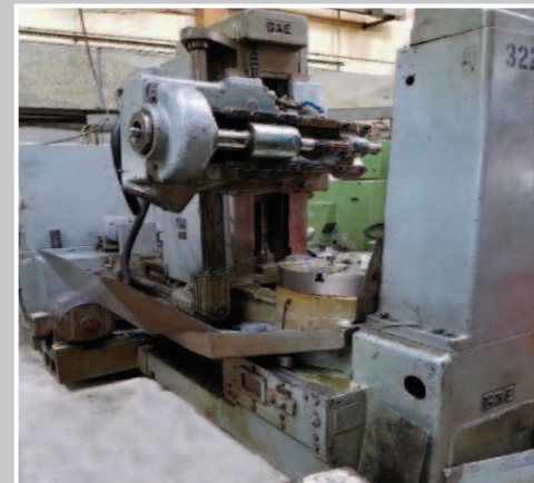
G&E 48HWD Heavy Duty Gear Hobber