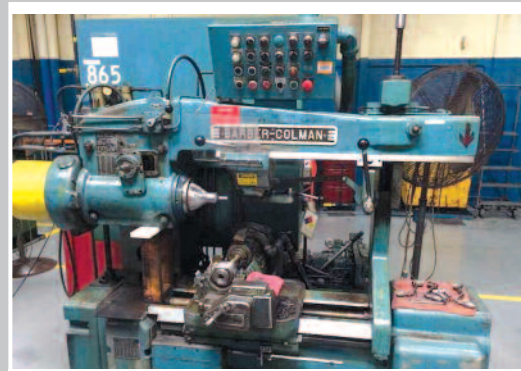
BARBER COLMAN 16-16 Universal Gear Hobber