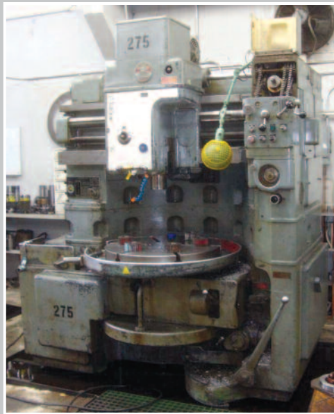
FELLOWS 36-6 36" Gear Shaper