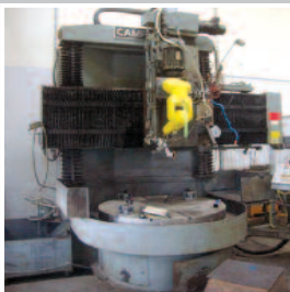
CAMPBELL Vert. Grinder