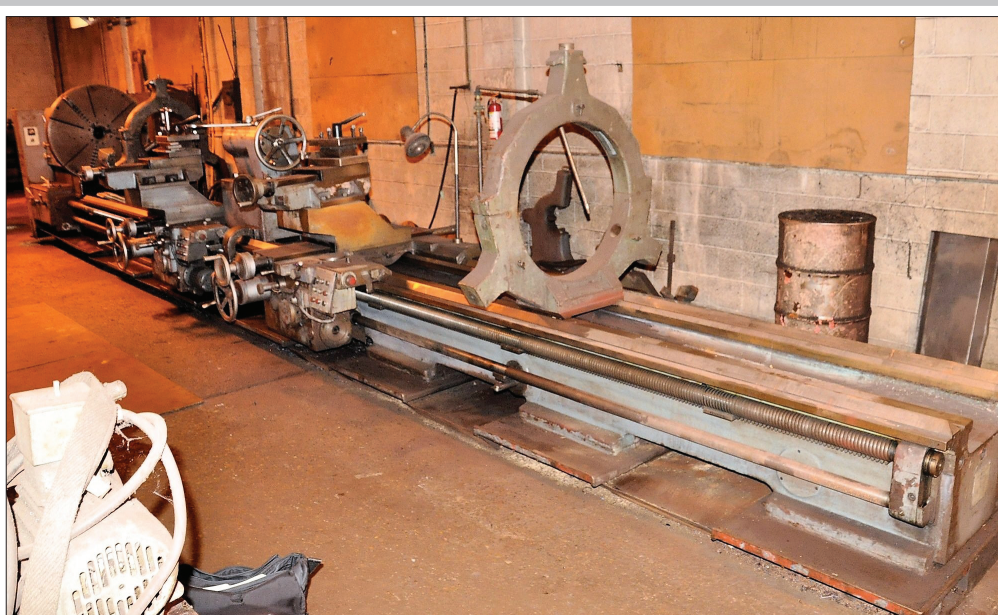
53" X 314" POREBA TR-135B/8M MANUAL LATHE

BidSpotter.com CLOSING OCTOBER 4 AT 1PM EST BidSpotter.com