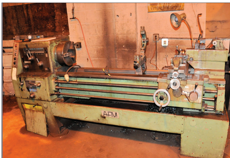
17.75" X 60" TOOLMEX/ANDRYCHOW TUG-40 MANUAL LATHE