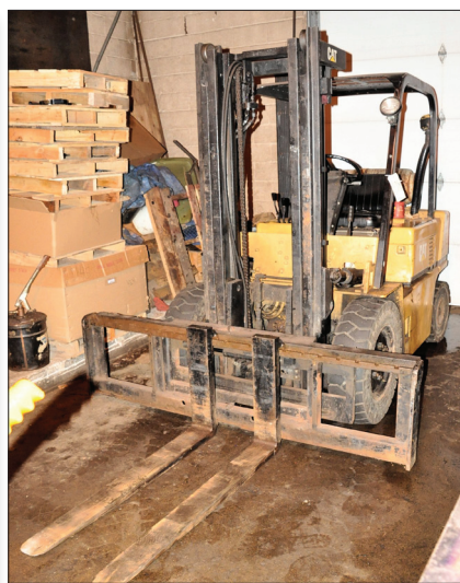
CLARK MODEL V50DSA 5,000 LBS. FORKLIFT