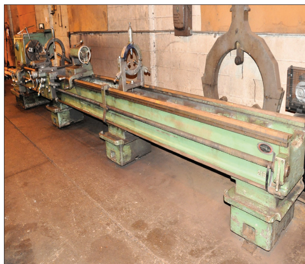
26" X 216" CINCINNATI 21 1/2 HYDRASHIFT MANUAL LATHE