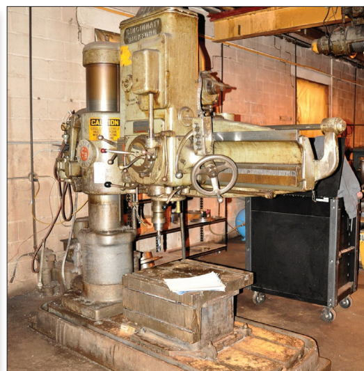
48" X 11" CINCINNATI BICKFORD RADIAL ARM DRILL