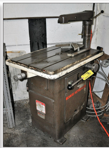
HANSFORD DAVIS MDL. 15 KEYSEATER