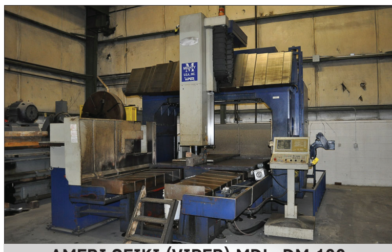
AMERI SEIKI (VIPER) MDL. DM-100 DOUBLE COLUMN CNC VMC