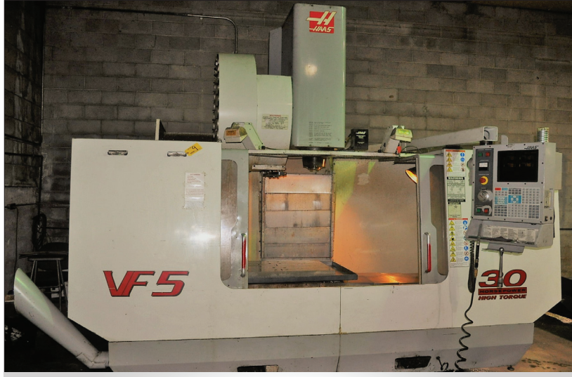
HAAS MDL. VF5-50 CNC VERTICAL MACHINING CENTER