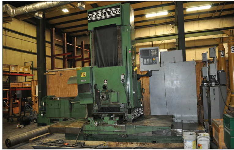
GIDDINGS & LEWIS MDL. 987-15HS TRAVELING COLUMN CNC HMC