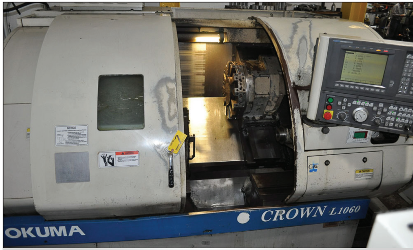
OKUMA MDL. 762S-BB CROWN BIG BORE CNC TURNING CENTER