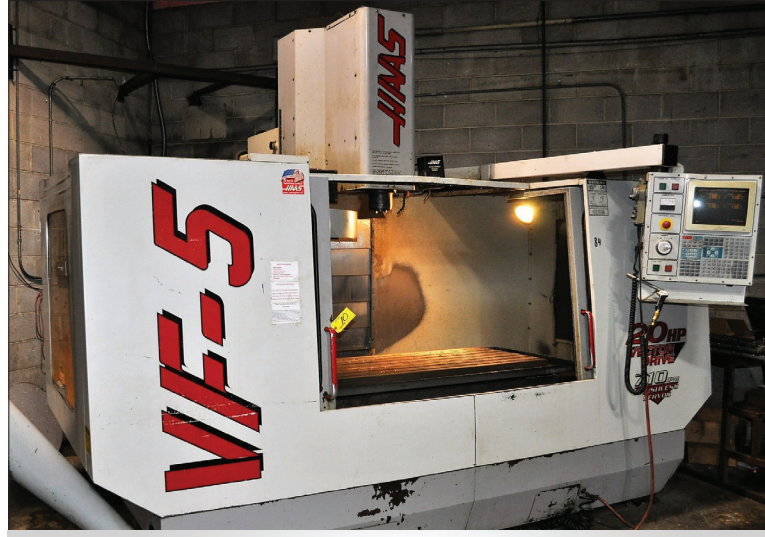
HAAS MDL. VF5 CNC VERTICAL MACHINING CENTER