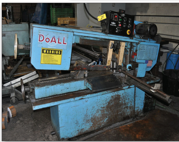
DOALL MDL. C-916A 9" X 16" HORIZONTAL BANDSAW