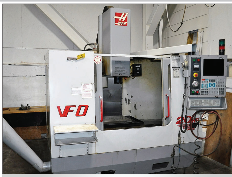
HAAS MDL. VFOB CNC VERTICAL MACHINING CENTER