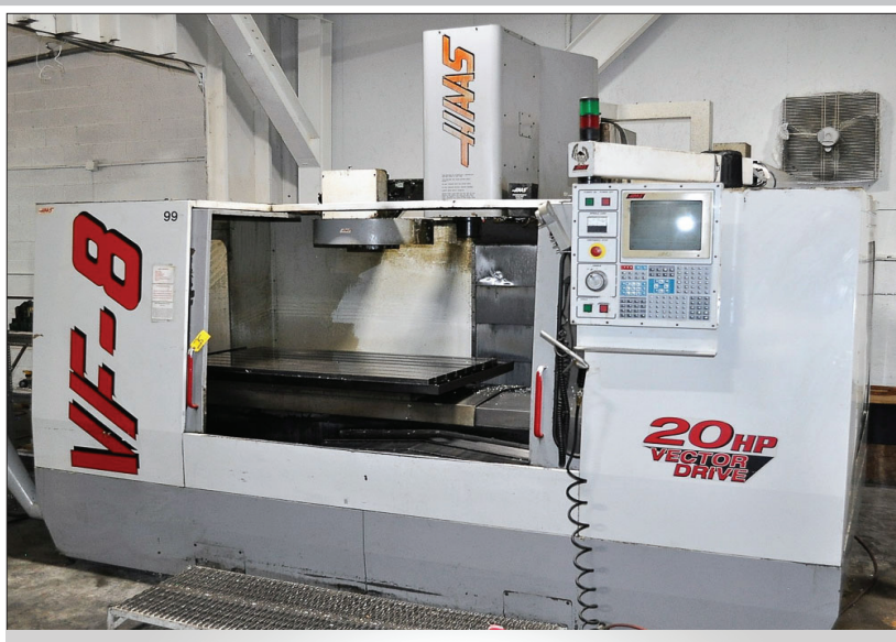
HAAS MDL. VF8 CNC VERTICAL MACHINING CENTER