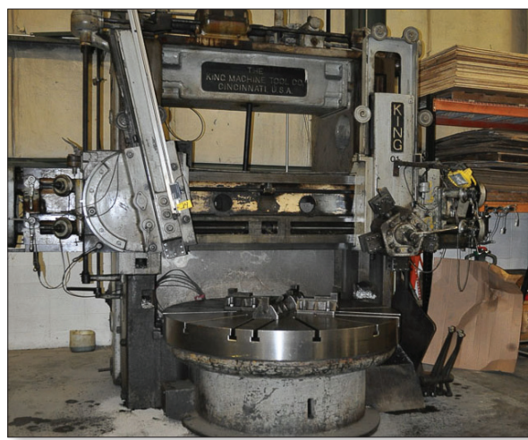
KING 72" VERTICAL BORING MILL