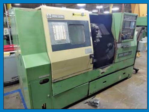
(4) Mori Model SL25B5 CNC Turning Centers