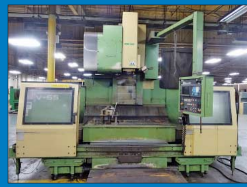
Mori Model MV-65/50 CNC VMC