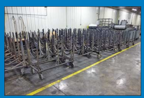
(80) 22" x 52" Tubular Frame Pipe and Bar Carts