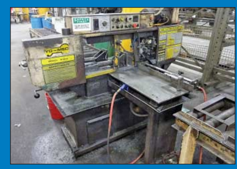
13" x 18" Hyd-Mech S20A Horizontal Band Saw

Shop Equipment Including Plastic Spill Skids, Barrel Holders, (80) Sections Clip Type Steel Shelving, Carts, Racks, Ladders, Hoppers, Cabinets, (3) 4-Shelf 3' x 3' Slide Out HD Racks, Pallet Rack, Ladders, Chains, Slings, Carts, Fork Jib and Drum Dumper, Mop Buckets and