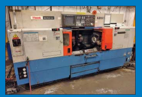
Mazak Model Multiplex 425 Twin-Spindle CNC Turning Center