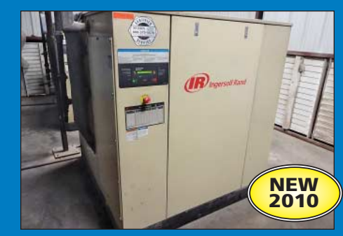
(2) 100 HP Ingersoll Rand Model SSR-EP100 Rotary Screw CE Air Compressors