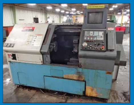
Mazak Model Quickturn 20 HP CNC Turning