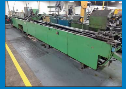
144" Stroke (Approx.) Horizontal Hone