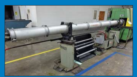
(5) LNS Hydrobar Bar Feeds to 4.5'