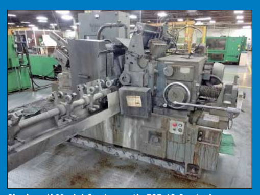
Cincinnati Model Centurmatic 325-12 Centerless Grinder