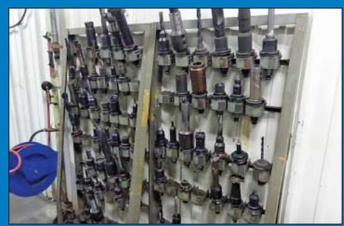
Large Quantity Tooling and Machine Accessories