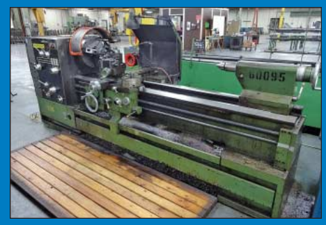
26"/36" x 78" South Bend Model Nordic Gap Bed Engine Lathe