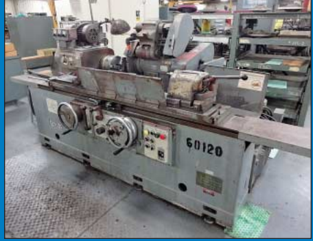
12" x 36" Toyota Model GUP-32x100 OD Grinder

16" x 150" Monarch Engine Lathe; s/n 39742, Taper, 12" Chuck, Steady Rest