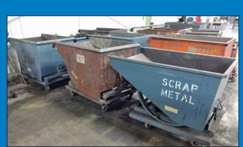
(20) Dumping Hoppers From 1/4 Yard to 1-1/2 Yard Capacity