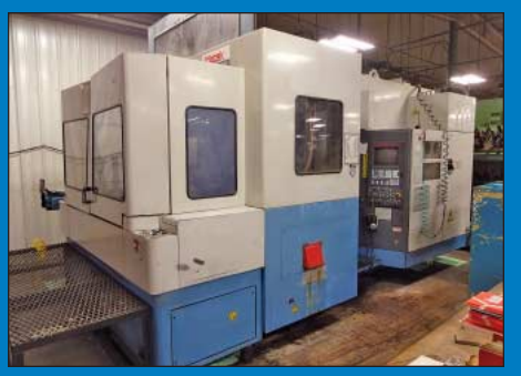
Mazak Ultra 650 Two-Pallet CNC Horizontal Machining Center