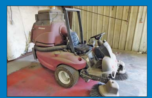
Minuteman Litterboss Diesel Power Rider Sweeper