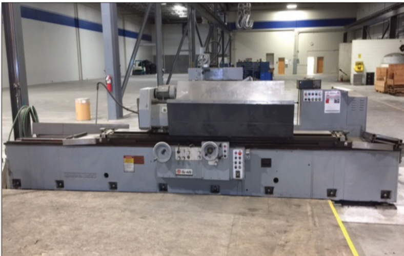
SHIGIYA G-45 CYLINDRICAL GRINDER