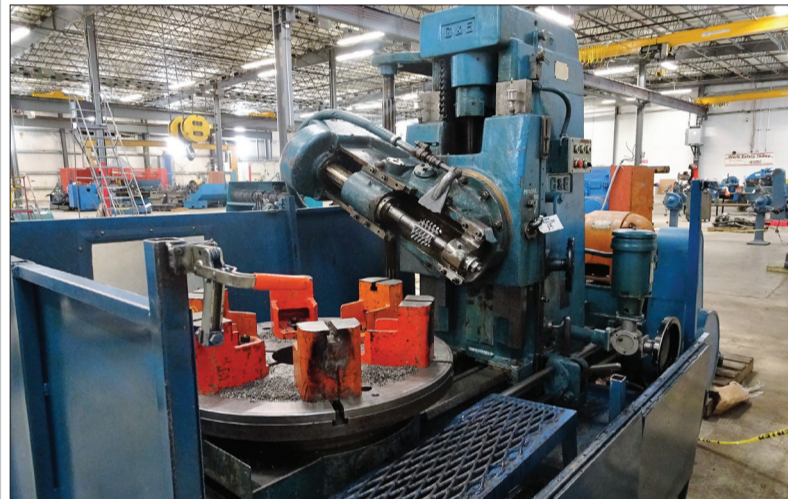
GOULD & EBERHARDT 48H GEAR HOBBER