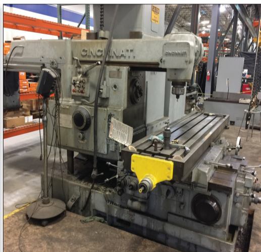
425-20 CINCINNATI VERSIPOWER BED MILL