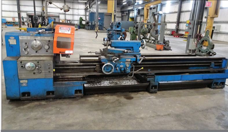
24" X 120" MAZAK HEAVY DUTY MAZAK-24 GAP BED ENGINE LATHE