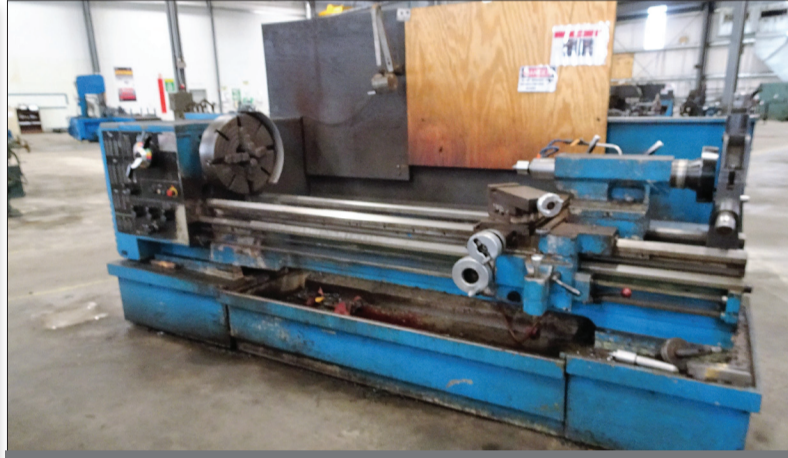
24" X 80" COLCHESTER 600 SERIES MODEL GH LATHE