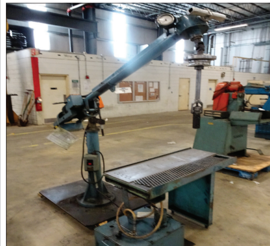
DELAPENA BEAM STROKER VERTICAL HONING MACHINE