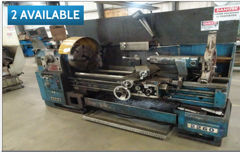
22" X 60" ACRA 2260 ENGINE LATHE