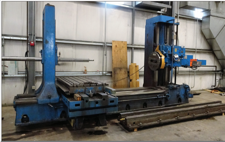
4" GIDDINGS & LEWIS 70-D4-T TABLE TYPE HORIZONTAL BORING MILL