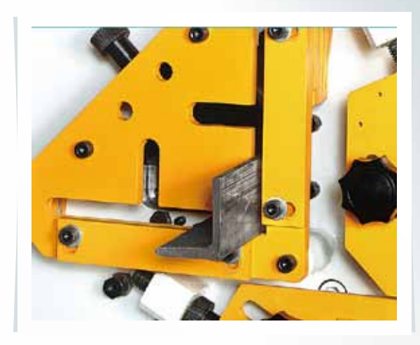
Angle Shearing Station