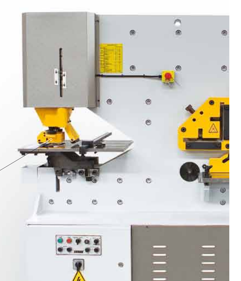
Top and bottom tools.

Waste time is avoided with simple interchangeable tool system.