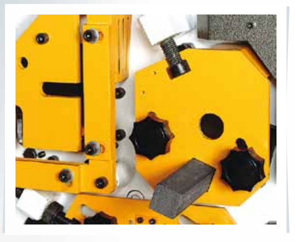
Bar Shearing Station