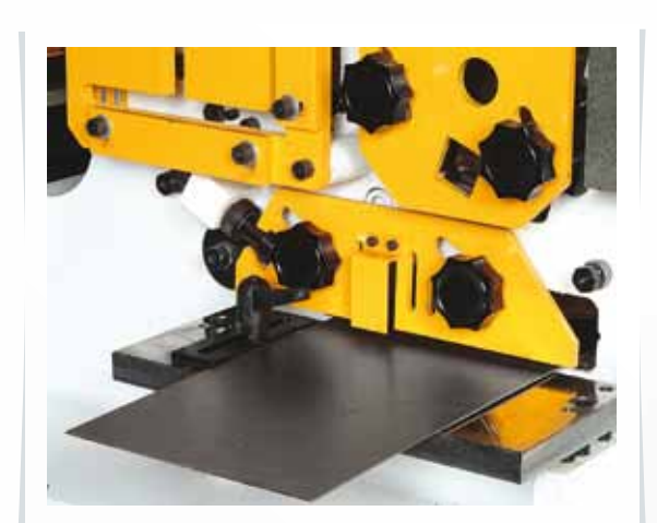
Flat Bar Shearing Station