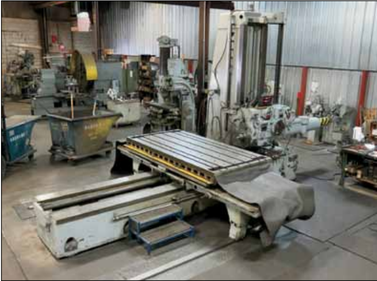
G&L Type 350-T Horizontal Boring, Drilling & Milling Machine