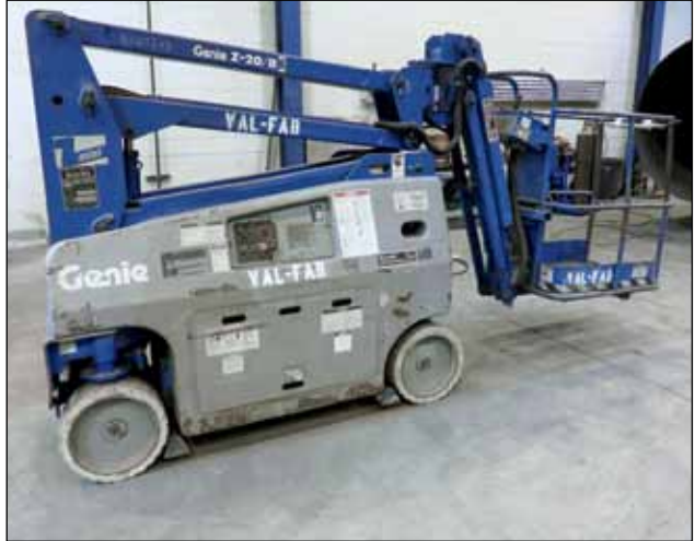
Genie Mdl. Z-20/8 Man/Boom Lift