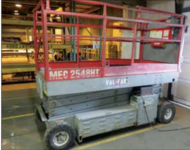
MEC Mdl. 2548HT Scissor Lift