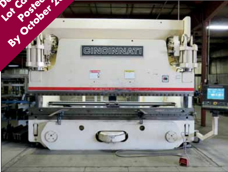
2006 Cincinnati Mdl. 350AF, 12' x 350 ton, 5-axis CNC Press Brake