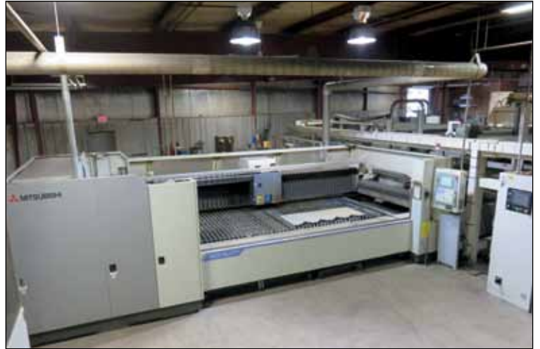
2005 Mitsubishi CNC Laser Mdl. ML3718 MV Plus