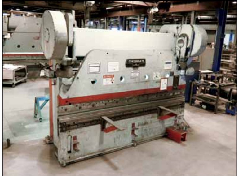
Cincinnati Series 9 10' x 225 ton Press Brake