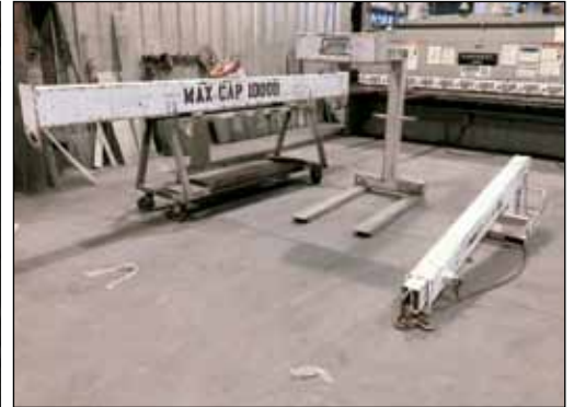
Jib Boom, Spreader Bar, & Lifting Attachment