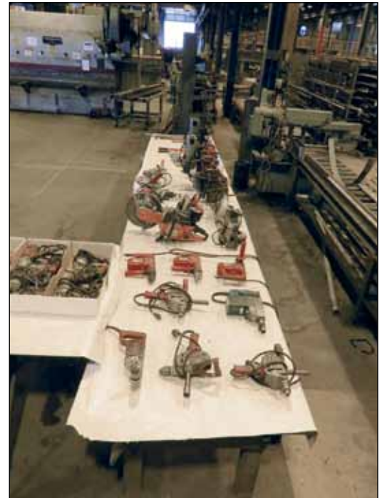
Hand & Power Tools