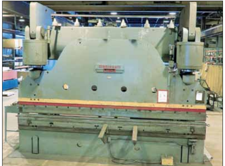
Cincinnati Mdl. 500H, 14' x 500 ton Press Brake