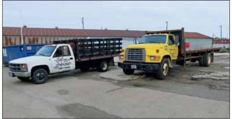
Ford F150 Pickup & Ford F Series Flatbed Trucks