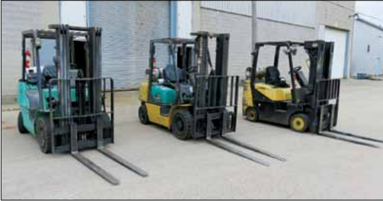
Qty 5 Mitsubishi, Nissan, Komatsu, Daewoo LP Forklifts