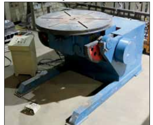
Irizar Mdl. WP-5 Welding Positioner