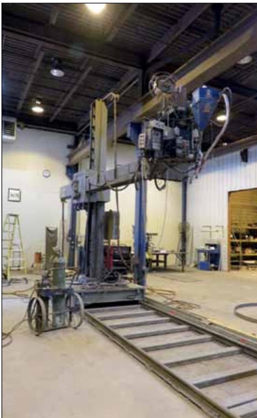
Aronson Mdl. S14VRB-14VLS-PK Welding Manipulator