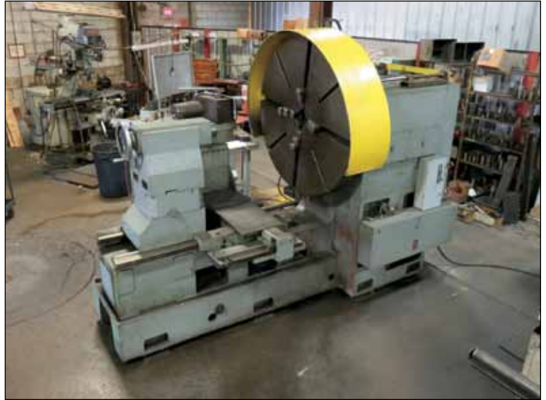
Gurutzpe Mdl. Super AT-11-20-1000/650 Gap Bed Lathe