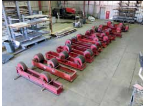
Large Quantity of Turning Rolls