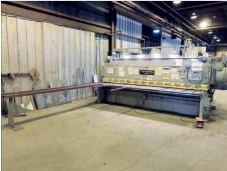
Cincinnati Mdl. 2512 12' x 3/8" Shear