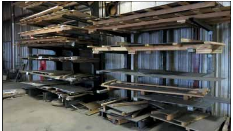
Detailed Listing Available on Website