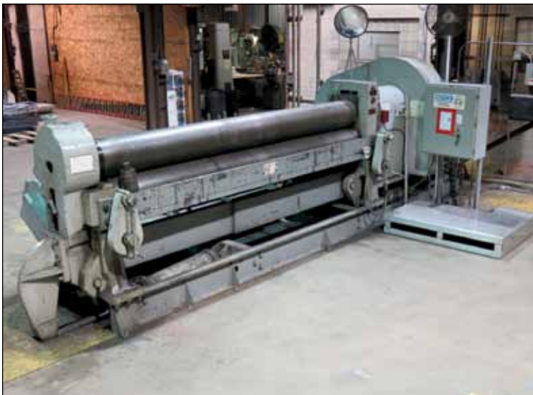
Bertsch 12' x 5/8" Single Pass, 3-roll, Power Plate Bending Roll