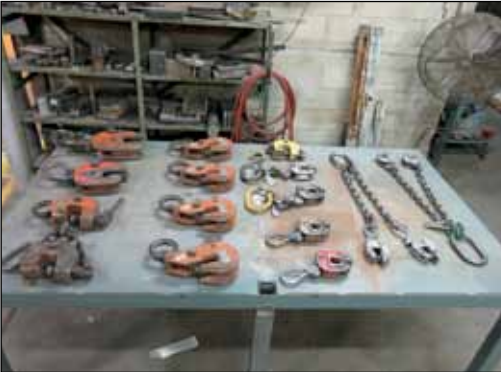
Large Quantity of Sheet Clamps