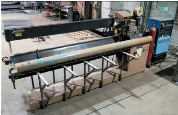
Jetline Mdl. LVP-170 Seam Welder