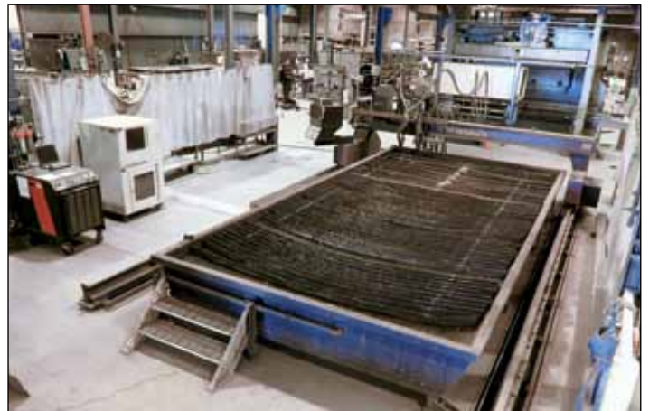
S.I International Mdl. DE-12000 CNC Flame Cutting Table