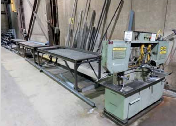
Hyd-Mech Mdl. S-20 Horizontal Band Saw