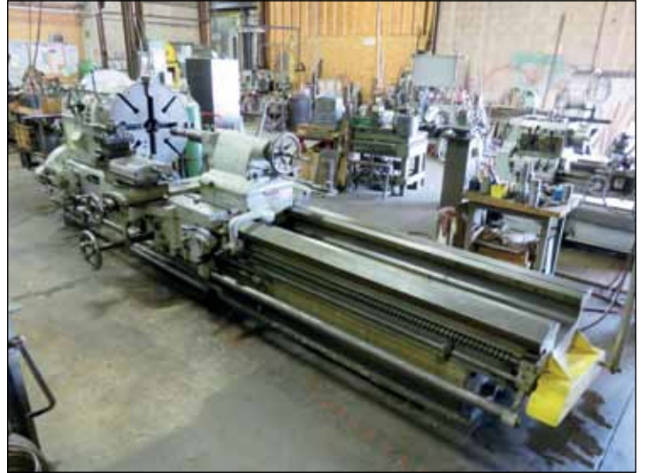
Leblond 36" Heavy Duty Engine Lathe