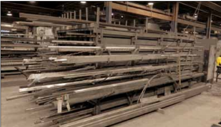
Detailed Listing Available on Website